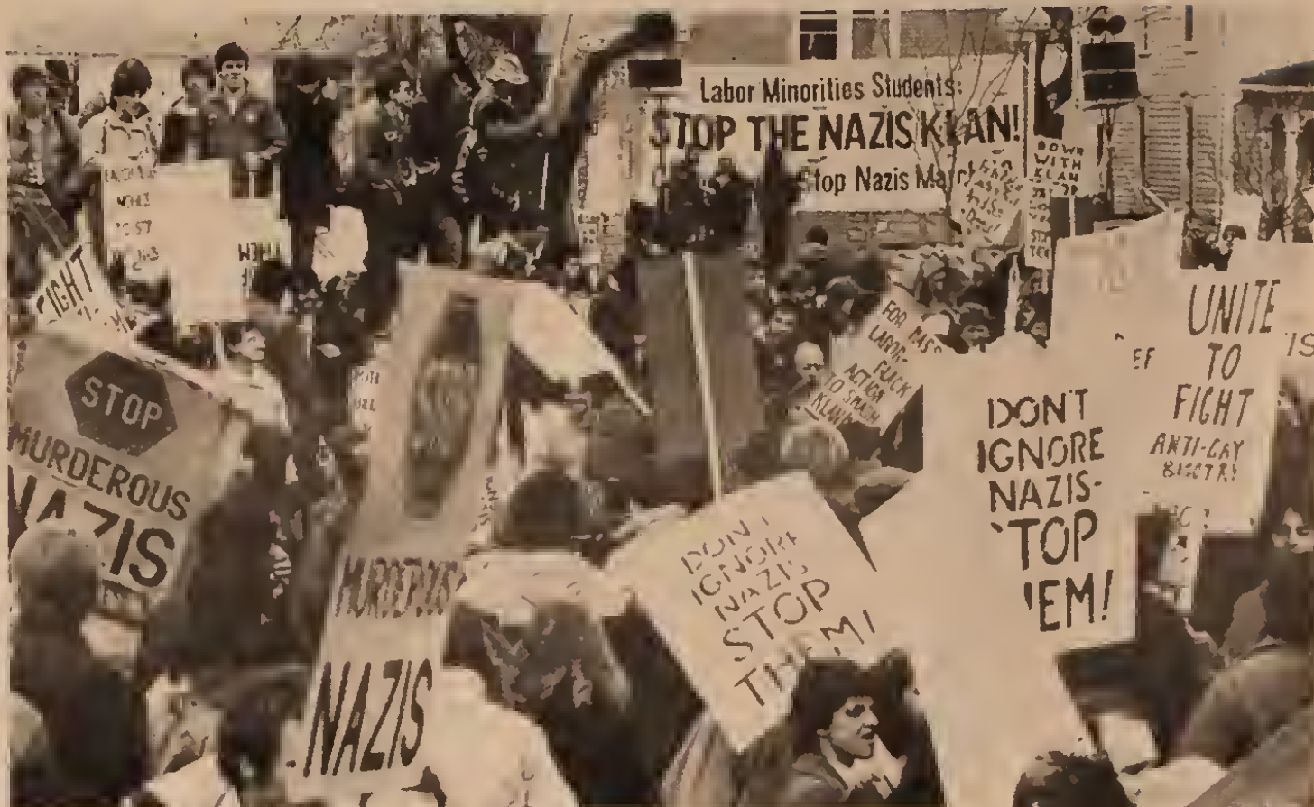
Ann Arbor, March 20: 2,000 respond to Committee call to stop the Nazis.