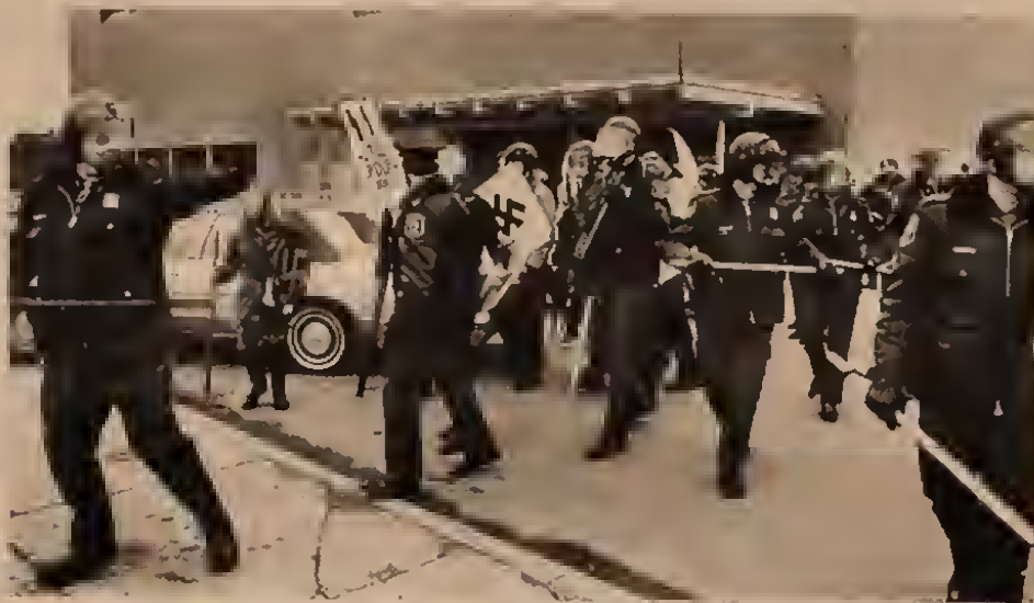
Ann Arbor, March 20: Cops rush in to protect Nazis from mass outrage.

"In my day I have seen Rap Brown run out of Maryland for attempting to express his viewpoint; Huey Newton left California for pretty much the same reason. The Black Panthers are gunned down in Chicago, in the West Coast for attempting to express a viewpoint. Malcolm X and Martin Luther King