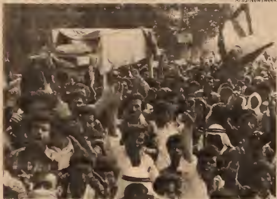
Hebrew-speaking people and Palestinians protest Begin's terror on West Bank. "Peace Now" demonstration in Tel Aviv, March 27 draws 50,000 (top).

the slogans raised went beyond what passes for liberalism in today's Israel. Among them were "No to Occupation," "Begin Go Home" and even "Golan is Syrian," the latter actually being illegal in Zionist Israel. Furthermore, at both demonstrations the PLO flag was unfurled, an act of unprecedented daring for Israeli Arabs.