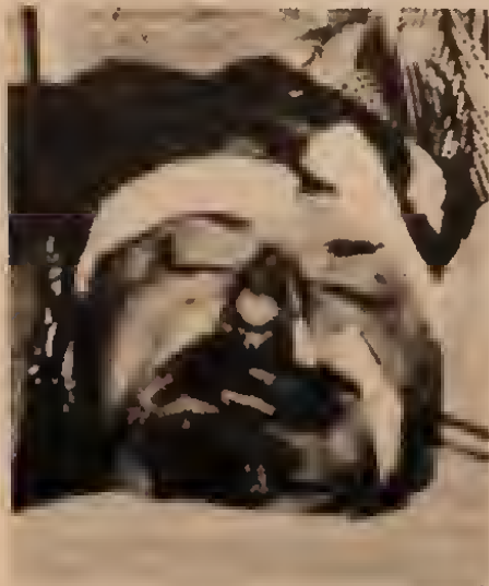
Those who murdered Trotsky first slandered him as an agent of the Nazis and the Mikado.