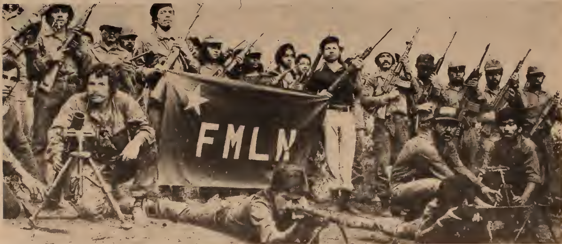
Salvadoran guerrillas are not fighting to give up military victory for a "political solution" with the junta.