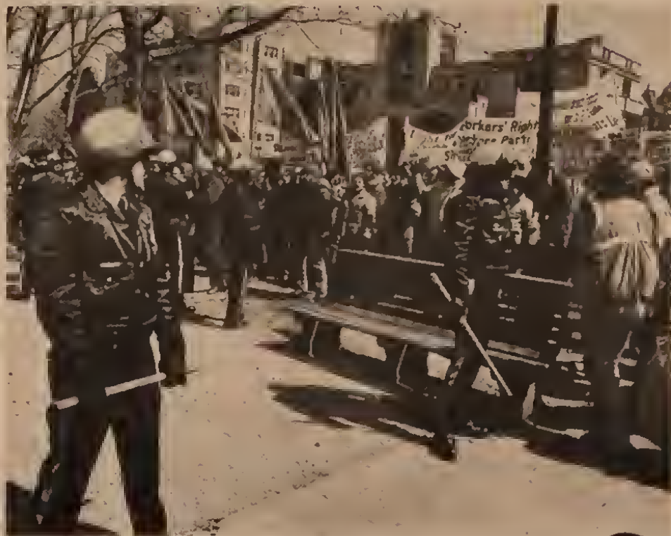
Washington, D.C., March 27: Awesome display of police power used to seal off the left.

In the 1960s the great bulk of the American left was fundamentally impaired as a force for revolutionary change, but at least toward the end of the decade there were a lot more of them and they sounded pretty radical. The New Left at best never got beyond their model of the old left, the worn-out old Stalinist Communist Party of the U.S., although an awful lot of the New Left substituted Peking for Moscow. The end of the American presence in Vietnam and the passing of ten years took far more than a decade's toll of these radicals. The Chinese government piled not just atrocity upon atrocity but pro-imperialist policy upon pro-imperialist policy. Anyone of that