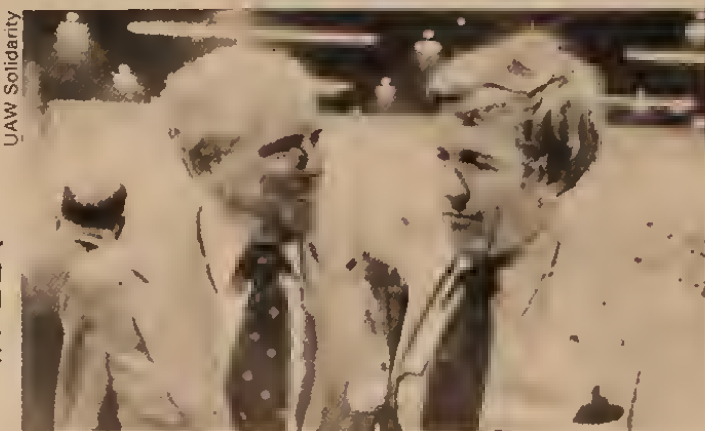
Doug Fraser (left) and Michael Harrington: The sellout artist and his lawyer.