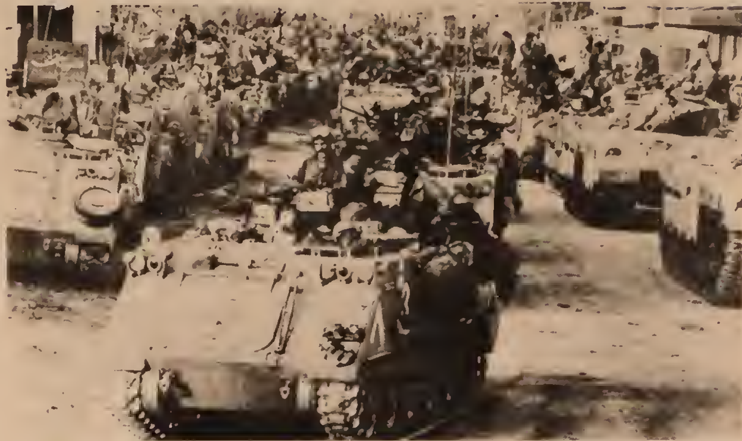
Israeli Blitzkrieg levels Sidon. Now west Beirut is targeted for destruction.

Why do the Palestinian militants in west Beirut appear willing to fight against fearsome odds rather than surrender? For one thing, they understand (despite all the rhetoric about "Arab unity") the fate that would await them in Assad's Syria, Hussein's Jordan or Muharak's Egypt. The Palestinians well remember Black September 1970