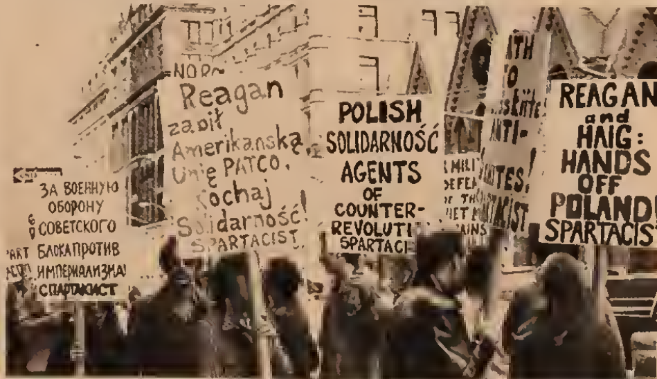
September 1981: When Social Democrats sponsored Solidarność office in New York, Spartacist League exposed Polish company union for CIA and bankers.

The labor bureaucracy, thanks to craven capitulation before capitalism's assault on the living standards and basic rights of workers and black people, is hardly riding a tide of membership confidence. Real socialist militants in the unions have a base of support for their democratic rights among their fellow union members. Certainly we don't welcome what looks like a pattern of victimization and violence directed against friends of the Spartacist League in the labor movement. But we will use these attacks to win to our side new supporters, people who know that working people will never win anything unless they fight. ■