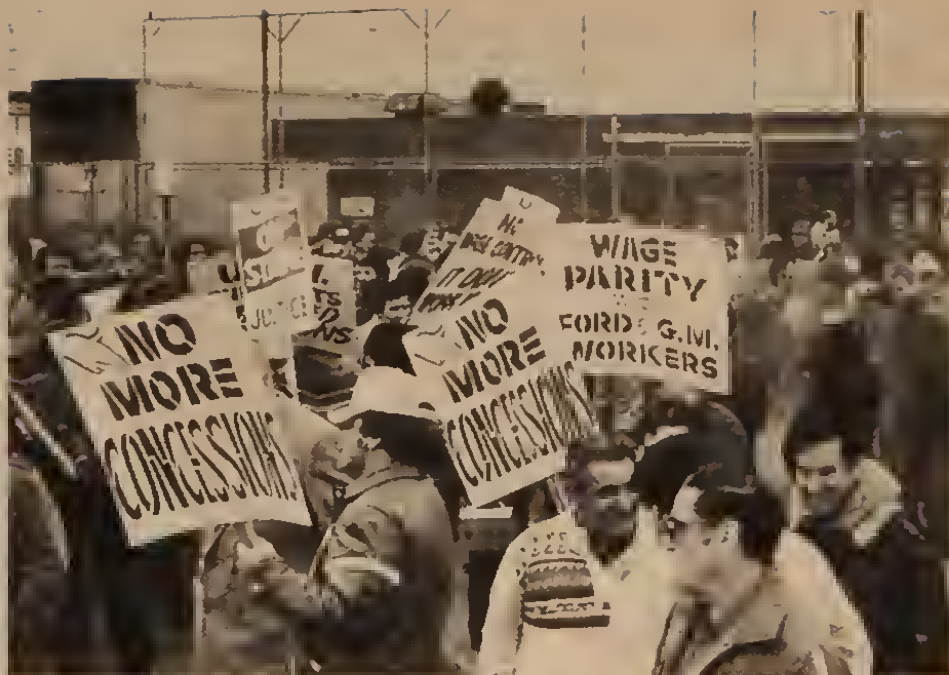
Windsor, Ontario, November 5: Mass picketing at Chrysler van plant.

The Canadian UAW tops made sure that the strikers pouring out of the gates on November 6 got into their cars and