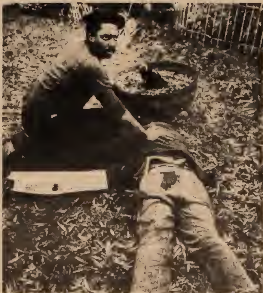
Greensboro Daily News