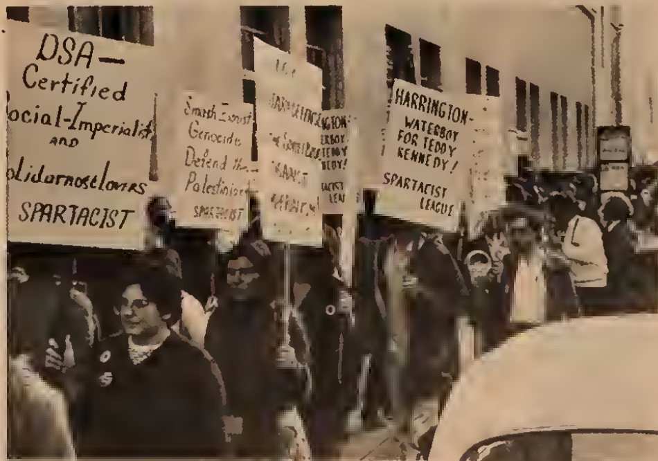
San Francisco, August 27: Spartacists protest DSA social imperialists.

What's going on here? On the most concrete level, we don't know and it's not easy to find out either. That there's a convergence of interests between the various bureaucrats is obvious, particularly on the issue of jobs, a burning question for workers in just about every industry. The bureaucrats in phone, steel and auto have no answers for the besieged union ranks—except, apparently, to try to wipe out their most outspoken critics and thereby intimidate the rest.