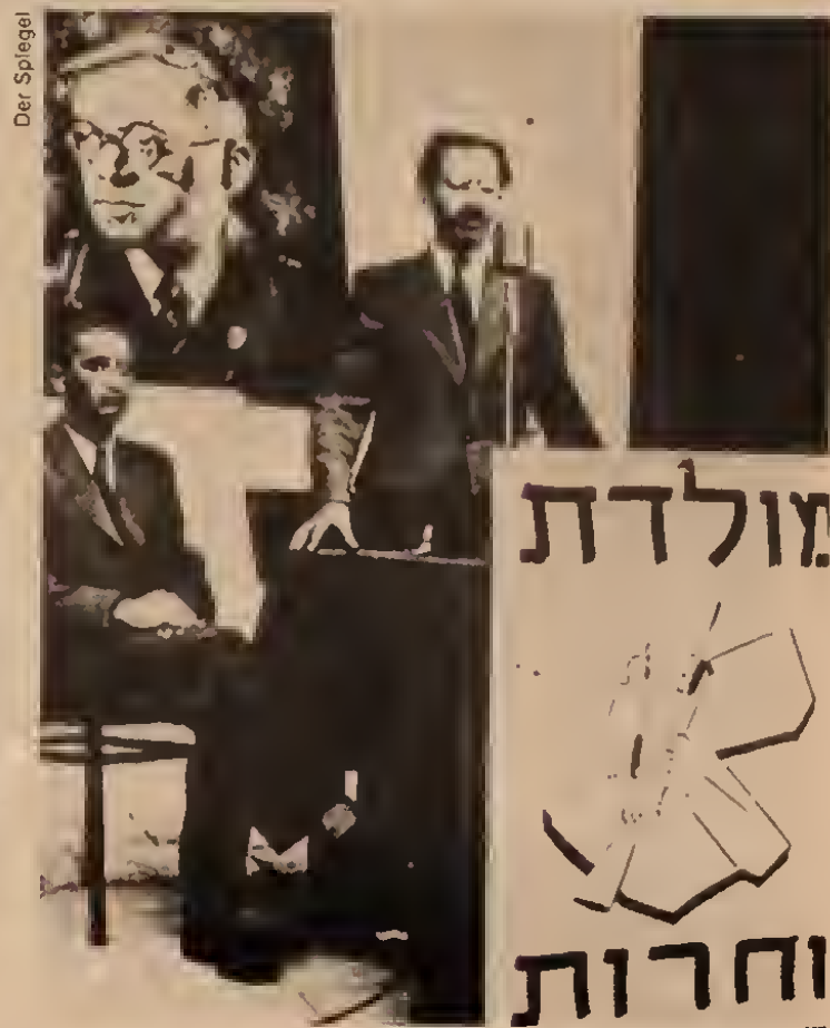
Begin addresses Irgun in 1948 before portrait of Vladimir Jabotinsky. Emblem claims "Eretz Israel" as all of Palestine mandate, including Transjordan.

be no national justice for the Palestinians until the Zionist state and surrounding Arab bourgeois states are smashed through the united revolutionary struggle of the Hebrew proletariat and Arab toilers.