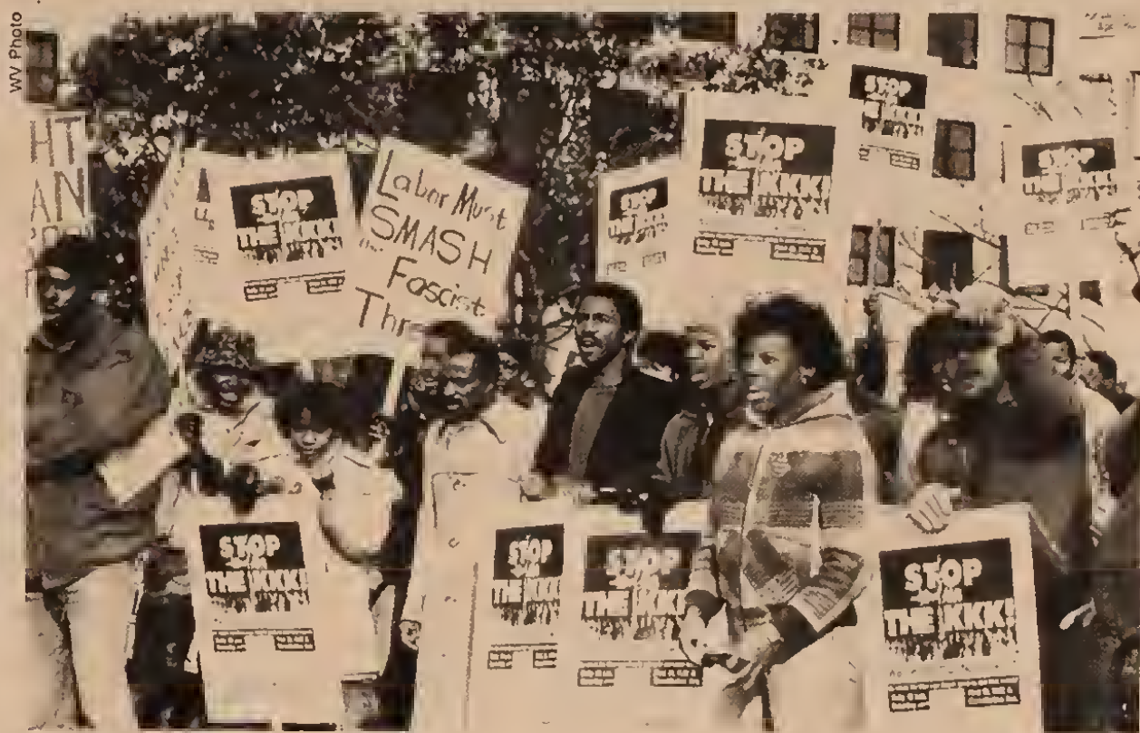
Overwhelmingly black protest of 5,000 initiated by SL stops the KKK in Washington, D.C.

Kartsen: The young black people who came to that rally learned some history there, learned from their own actions what has to be done to stop the Klan. They saw the cops protecting the Klan, they saw the government allowing known race-terrorists to march down