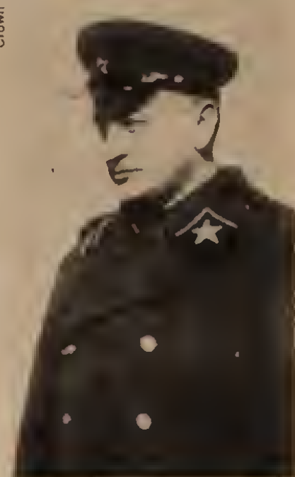
Marshal Mikhail Tukhachevsky, Red Army hero, victim of Stalin's terror and slander.