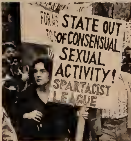
SL opposes reactionary age-of-consent laws.

teenage sexuality goes on at fever pitch: attacks on the availability of birth control, abortion and even the miserable sex education provided in some schools. The right-to-lifers and fundamentalists see themselves as front-line soldiers in the sexual "counterrevolu-