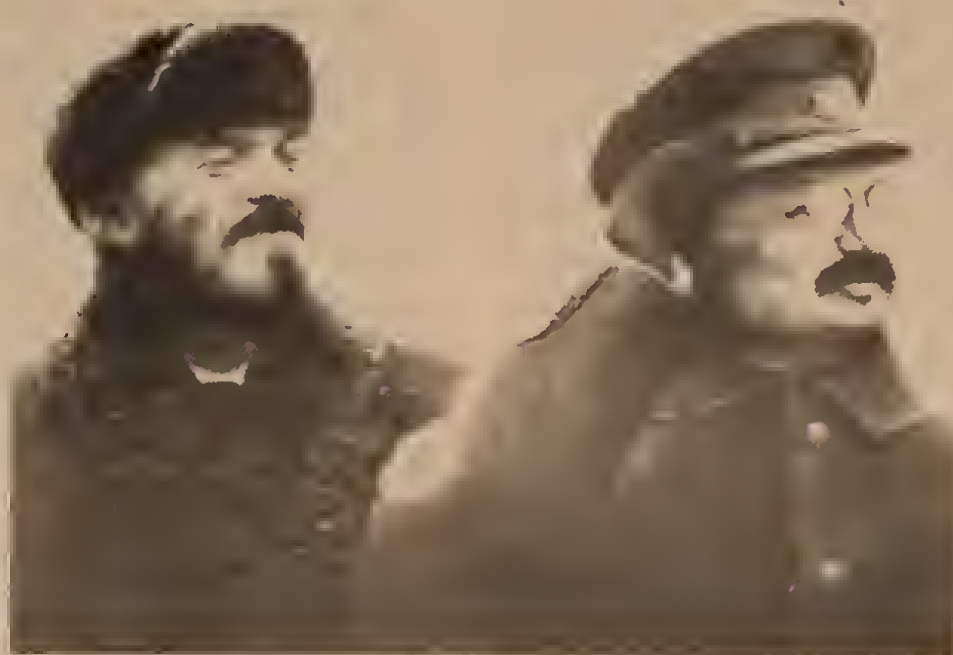
Like the Stalinists, SWP falsifies Leninism to attack Trotskyism.

We must stop here to alert our readers to the fact that our quotations from Barnes' speech cannot be up to our usual standard of accuracy, thanks to the SWP having excluded our known observers from the meeting. For the first time in years, the SL was not permitted an observer in the youth conference; one of the first points on the agenda was a proposal to exclude the SL, lumping us together with the dubious Workers League (which presently subordinates itself to squalid anti-working-class Near Eastern military and religious dictatorships and which is presently engaged in attacking the SWP through the capitalist courts—see material on the Alan Gelfand case in this issue). The exclu-