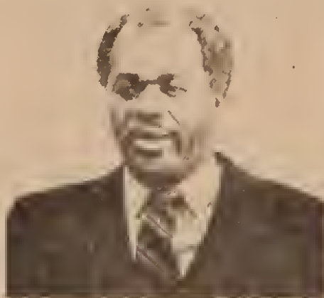
Washington Mayor Marlon Barry (left) ran out of town when Klan arrived. Congressman Walter Fauntroy batted anti-Klan protesters as "Tarzan Trotskyltes."

Law: The point is that when you make a political analysis of where the failures are, the failure's in the system not responding to the question of justice. It's not a black failure. The criticism of elected officials, as though it is black politicians who are responsible for the system not responding correctly, is not simply unfair, it is politically incorrect.