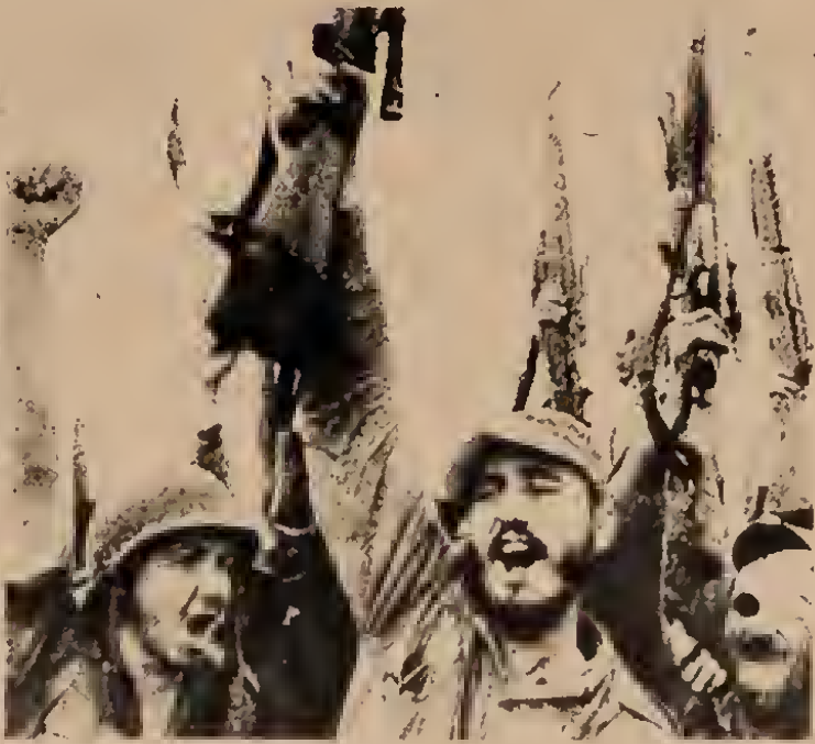
Castro in the Sierra Maastra in 1957. The peasant-guerrilla road to power can at best lead to a bureaucratically deformed workers state.

nears a conclusion, the battle for San Salvador will loom large. Then once again guerrillaism and popular frontism threaten to strangle the potential for proletarian revolution.