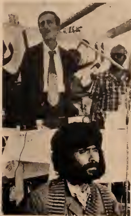
PLO commandos end Lebanese left subordinated themselves to Kamel Jumblatt (top), feudalist chieftain of Moslem Druze sect.

"The conflict occurred because Lebanon's political and economic structure cheated too many people in too many ways. The Maronite businessmen and bankers who dominated the country refused to part with any of their huge profits derived from handling oil