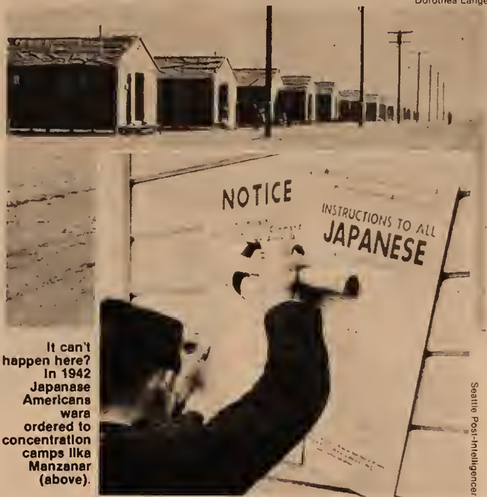
It can't happen here? In 1942 Japanese Americans were ordered to concentration camps like Manzanar (above).

The Congressional "Commission on Wartime Relocation and Internment of Civilians," which also castigated the brutal forced relocation of the native people of the Aleutian Islands (some 10 percent of whom died as a result of the uprooting), concluded on February 24 that the concentration camps were motivated by "racial prejudice, war hysteria and failure of political leadership." In fact, it reported, "not a single