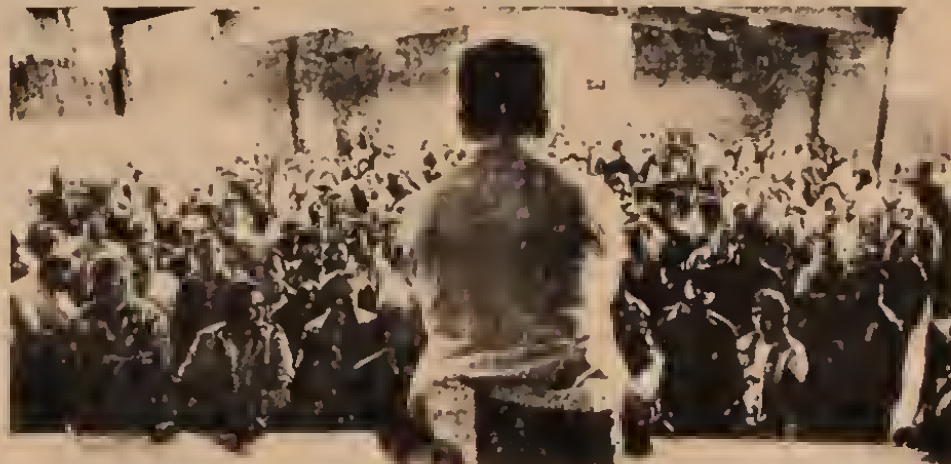
UAW bureaucrats at Fremont have hard time answering questions about GM/Toyota deal.

ing agent. Smith said the plant could be non-union, noting: "We have operated a non-union plant in Anaheim in excess of nearly twenty years." ( Detroit Free Press , February 18, 1983). This is a direct and calculated attack on the UAW and industrial unionism itself. The consequences of the battle that have