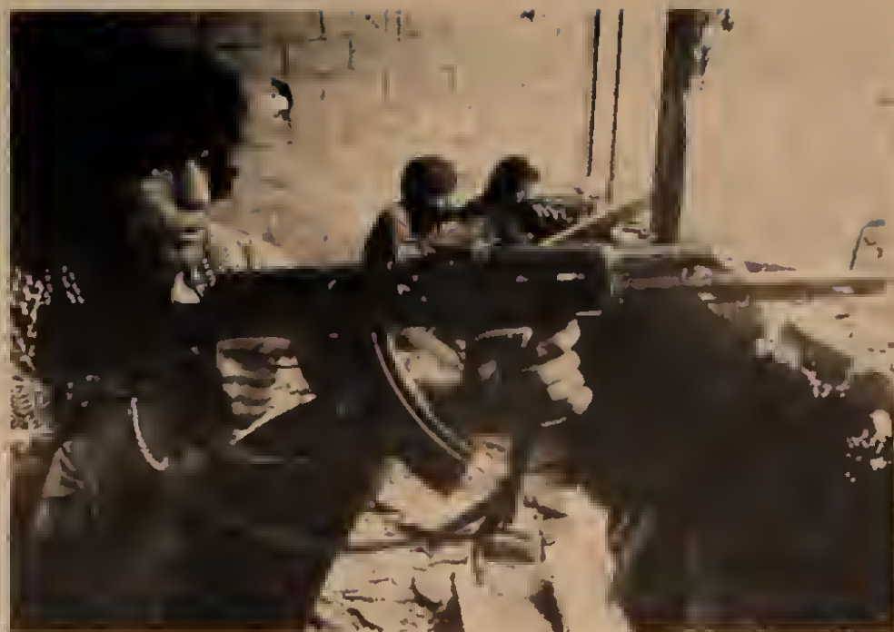
Lebanon erupted into civil war and communalist bloodshed, 1975-76: Rightist Christian Maronites (left) battle Palestinian commandos (right).