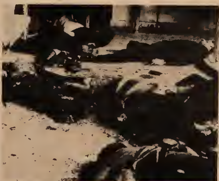
By 1976 Lebanese civil war had become communalist slaughter. Syrian-backed Maronites killed thousands of Palestinians at Tel Zaatar (left). PLO forces and Druza militia massacred Christian villagers at Damur (right).

position the pro-imperialist rulers are now in."