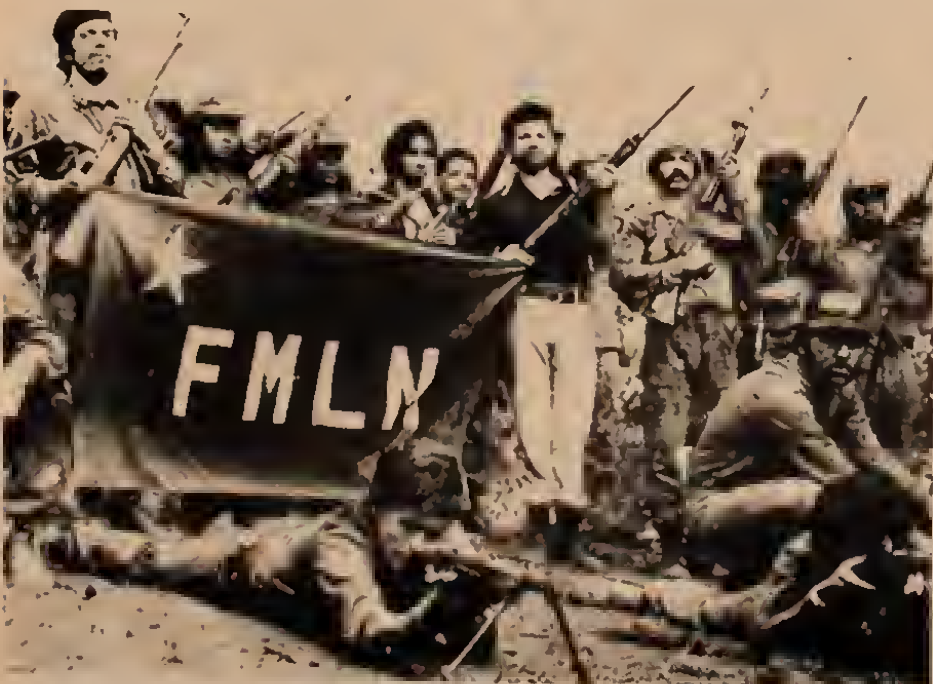
Petty-bourgeois guerrillaists took to the hills, refused to organize for proletarian insurrection.

There are, of course, many different brands of guerrillaism. In Latin America during the '60s the dominant theme was Guevarism, also known as "focoism." In contrast to Maoist "people's war," which seeks to build up a peasant army led by a bonapartist officer corps calling itself a Communist Party, Guevarism relies on a small nucleus (or foco ) of guerrilla fighters who are supposed to act as the detonator to ignite the masses. In his how-to-do-it manual on Guerrilla Warfare , Guevara gave as the first lesson of the Cuban Revolution that "it is not necessary to wait until all the conditions for making the revolution exist," guerrilla struggle would create them. The second was that in Latin America "the countryside is the basic area for armed struggle." His voluntarist/militarist theory was further elaborated by the French café guerrilla Régis Debray ( Revolution in the Revolution? ), who proclaimed that "the people's army will be the nucleus of the party."