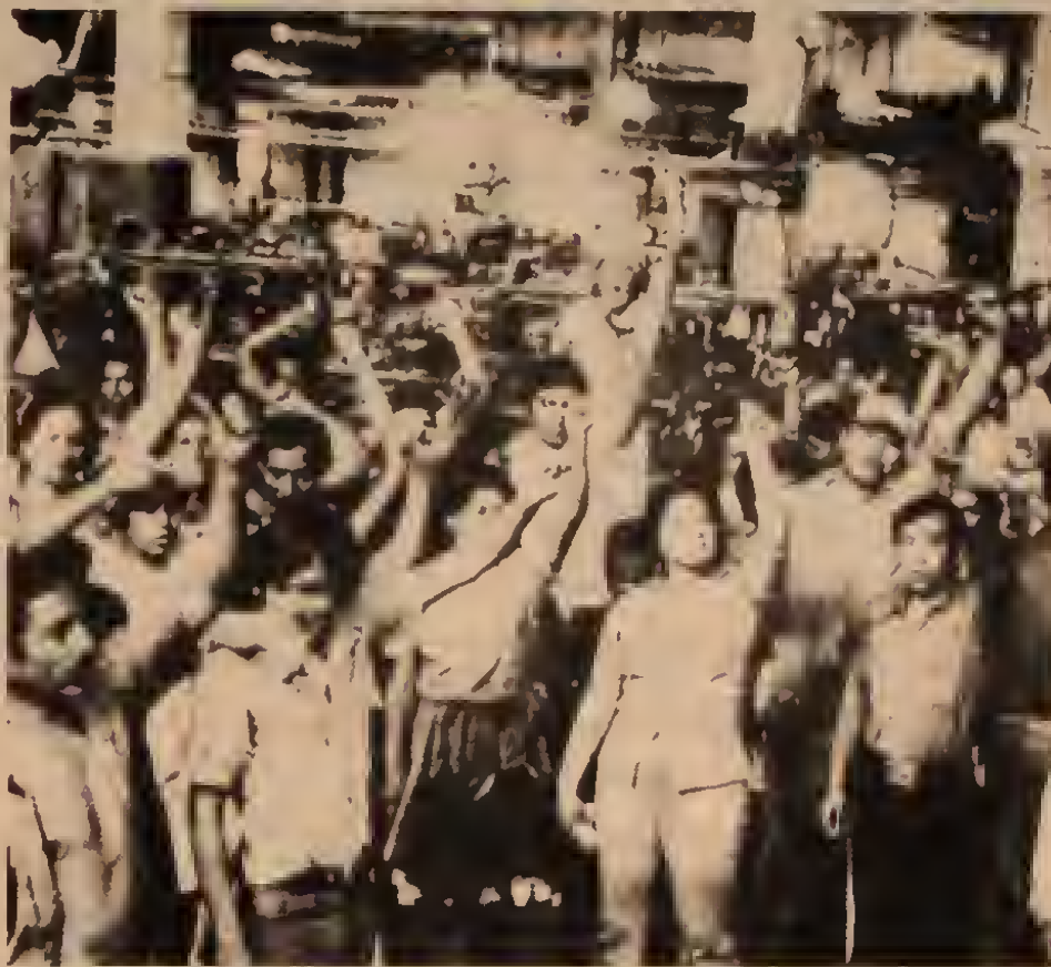
Salvadoran workers stage one-day political general strike on 17 March 1980 against murderous junta.

The Salvadoran struggle can also have a tremendous impact on the United States far exceeding that of the liberal-