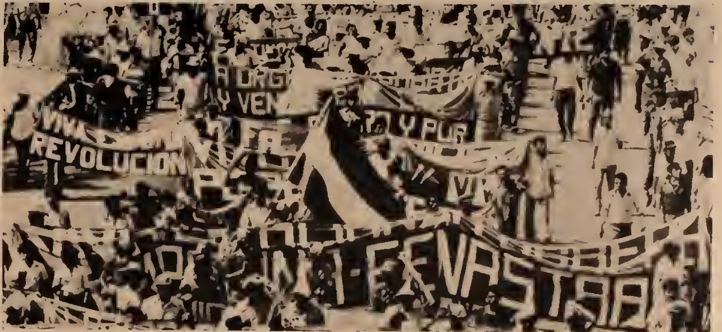
Combative Salvadoran trade unions played key role in repeated mass mobilizations such as the 200,000-strong protest in San Salvador, January 1980.

Another curious fact: in this region of mini-countries smaller than most U.S. states, the leaders of the Central American left do everything possible to keep the struggle within narrow national bounds while the right-wing dictators aid each other constantly and are openly supplied by the United States. Neither the Sandinistas, the Cubans or the Soviets provide substantial amounts of weapons to the Salvadoran rebels, and the FMLN refuses to call for international brigades. Moreover, even though the various "armed struggle" organizations all grew out of the Cuban Revolution, when the Trotskyists of the SL proclaim "Defense of Cuba, USSR begins in El Salvador" their American supporters start screaming "provocation." These groups which were inspired by Che Guevara and the Vietnamese struggle now raise as an official slogan