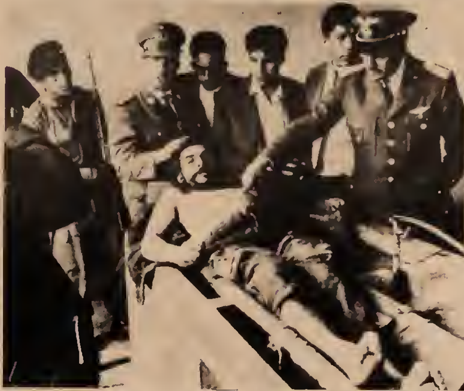
Bolivian rangers and CIA hunted down and killed the heroic Che Guevara in 1967.

"The revolutionary party must, of course, take an active role in organizing the self-defense of the working masses, and the use of guerrilla tactics is often vital as a subordinate civil war tactic. However, the road to power for the proletariat is through mass insurrection against the bourgeois state; the central military organization of the uprising must be an arm of and directed by the