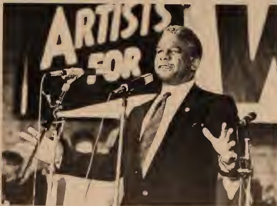
Harold Washington's Chicago will still be "segregation city."