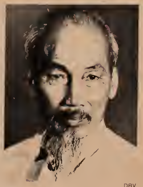
Ho Chi Minh