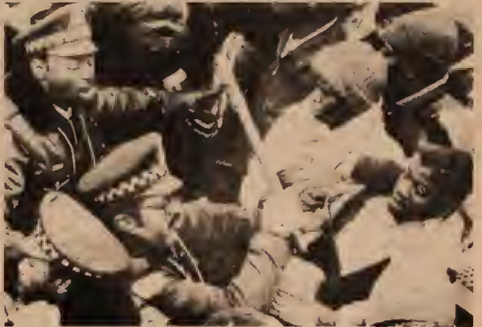
Chicago blacks will still face the same police brutality as these did lining up for temporary city jobs.

CHICAGO—The second-largest, and most segregated, city in the United States now has its first black mayor. Democrat Harold Washington narrowly snatched victory from a racist mobilization instigated by the Democratic Machine he loyally served for three decades. Hundreds of thousands of black people in Chicago and millions across the country see the Washington