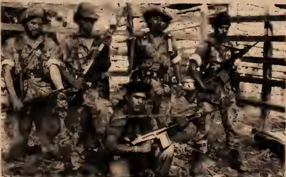
Former members of Somoza's hated National Guard ("Rattlesnake" battalion) brandish U.S.-supplied weapons.