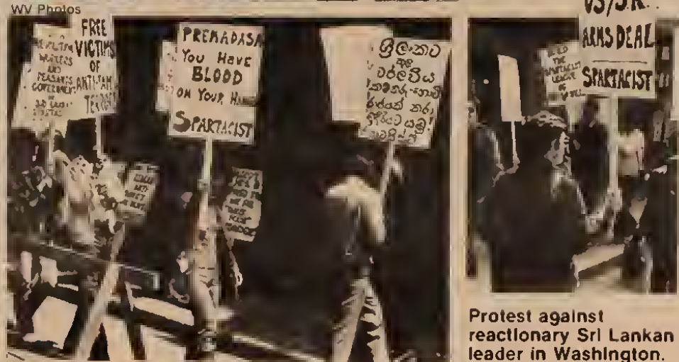
Protest against reactionary Sri Lankan leader in Washington.

outside and the treatment of the oppressed Tamil minority, he cynically replied that the assembled dignitaries no doubt had to deal with "agitators" in their own countries and that "in Sri Lanka, our people are living in peace and harmony."