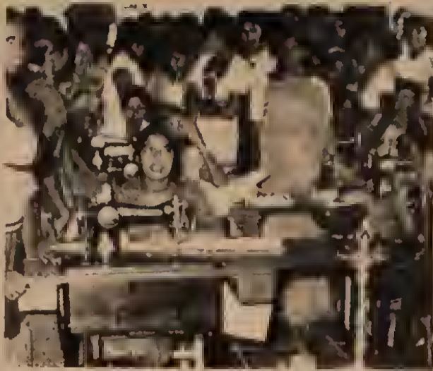
Ninety-five percent of Sri Lanka Free Trade Zone workforce is made up of women without protection of unions or other rights.

It's a safe assumption that protest against the abolition of this form of protective legislation for women in Lanka comes mainly from the social-democrats and other reformists, who of course look toward UN pronouncements and domestic legislation to protect women workers, rather than toward the urgently necessary "illegal" unionization of the free trade zone. Even on the narrow level of legislative