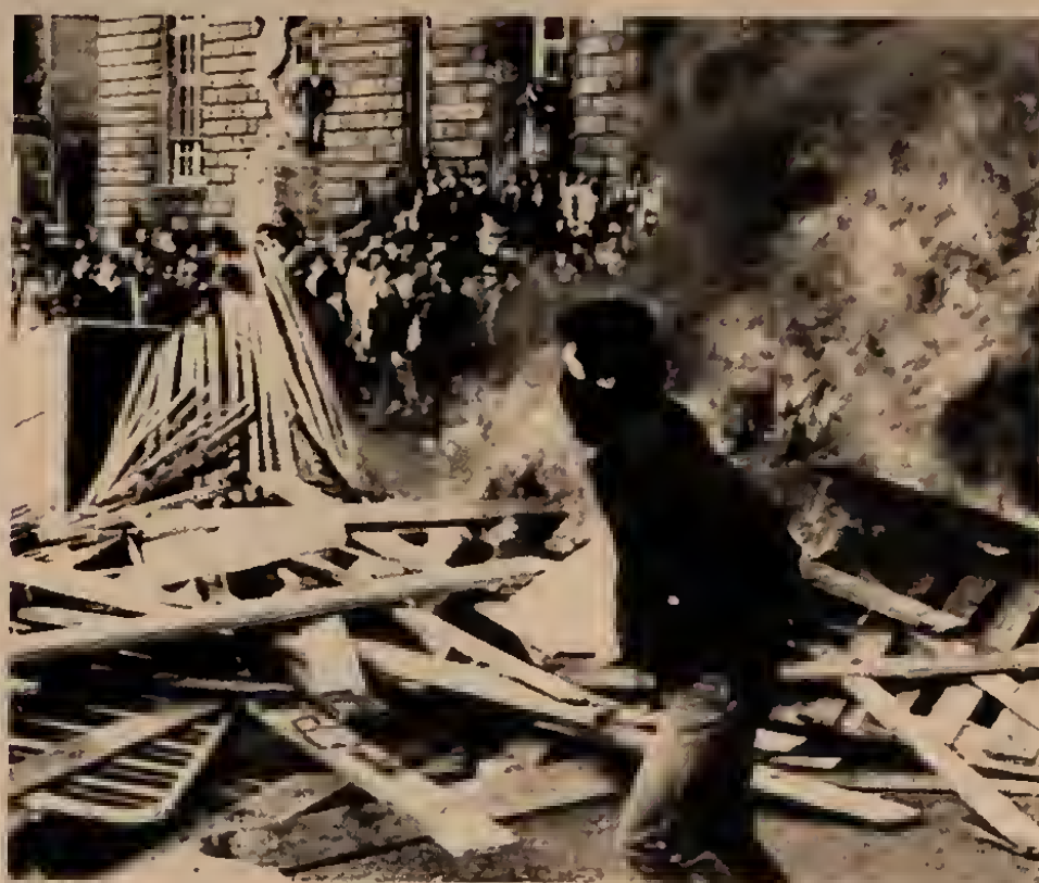
Violent right-wing student actions spearhead growing bonapartist threat as French popular front proves bankrupt.

In the present situation the danger is growing of another Clichy—the 1937 massacre when the police shot down anti-fascist demonstrators. The Clichy massacre sealed the fate of the Blum popular front, leading to the rightist Daladier ministry and paving the way a few years later for the Vichy regime of Marshal Pétain, which loyally collaborated with the Nazi occupation. But the threat of a new Daladier and Pétain cannot be answered by political support to Mitterrand & Co. The popular front breeds bonapartist reaction, which can only be swept away by workers' revolution.