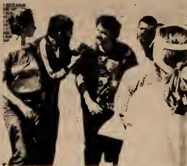
No Morenoite hammers today! A little assertion of workers democracy (left) turns Morenoite bullies (right) into well-behaved boys and girls.