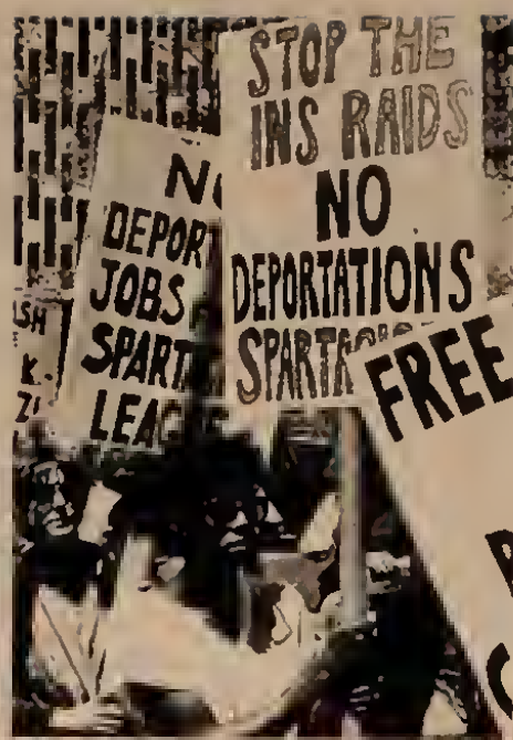
Young Spartacus New York City, 30 April 1982: SL demands "Free Haitians from Reagan's Concentration Camps!"

Across the border are the giant holding pens of Tijuana and Ciudad Juárez, both with populations over a million, spread out in vast working-class barrios that resemble a moonscape, with dirt streets, not a blade of grass and no running water for drinking or sewage. Many of the residents work in the