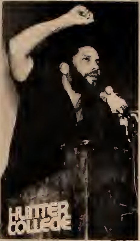
During recent U.S. visit Grenadian prime minister Maurice Bishop sought to turn away Reagan's wrath.

which traveled to Grenada to investigate Reagan's charges that Grenada was building a sophisticated military base. "So we said, 'Okay, let's go down to the airport and take some photographs'.... They discovered that at the beginning of the strip... is where the medical school with 700 American students live and study. And they discovered that these medical school students, American students, were running up and down the strip jogging every day and every night!... Two days later ABC comes back. Same crew. So I say, 'What's the problem now, fellows?' They say, 'All right. We agree that it is not a sophisti-