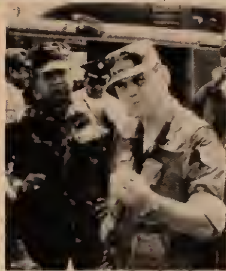
Republic of Nicaragua