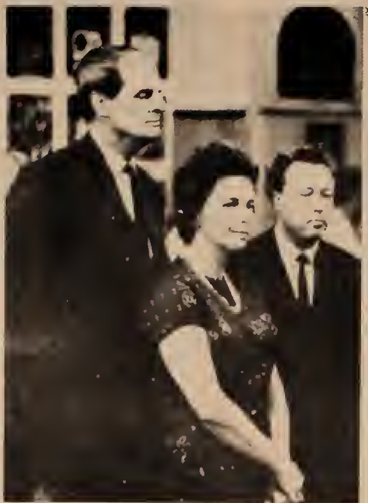
Moscow, 1963: Donald Maclean (left) and his wife at the funeral of Guy Burgess, who organized his last-minute escape from Britain.

Reprinted by permission of Los Angeles Times-Washington Post News Service.