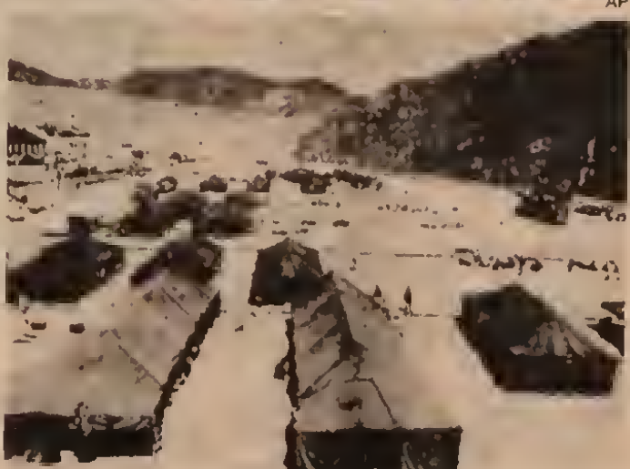
Striking copper miners (upper left) face army of state cops (upper right) and National Guardsmen encamped in mine slag (lower right). Strikers and their families confront scabs in truck (lower left).