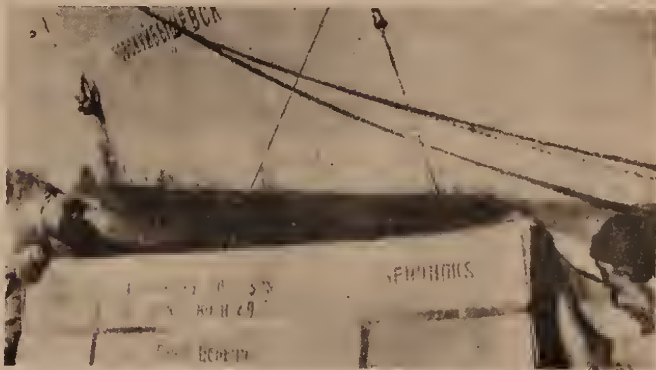
After ILWU tops' shameful Cold War boycott, Mexican longshoremen unload Soviet freighter in Ensenada.

As for the CP, every once in a while they'd come up with a mealy-mouthed criticism of Bridges, but he was with them on every fundamental issue—from strikebreaking during World War II, to M&M, to the Democrats. They sucked up to his anti-communist successors,