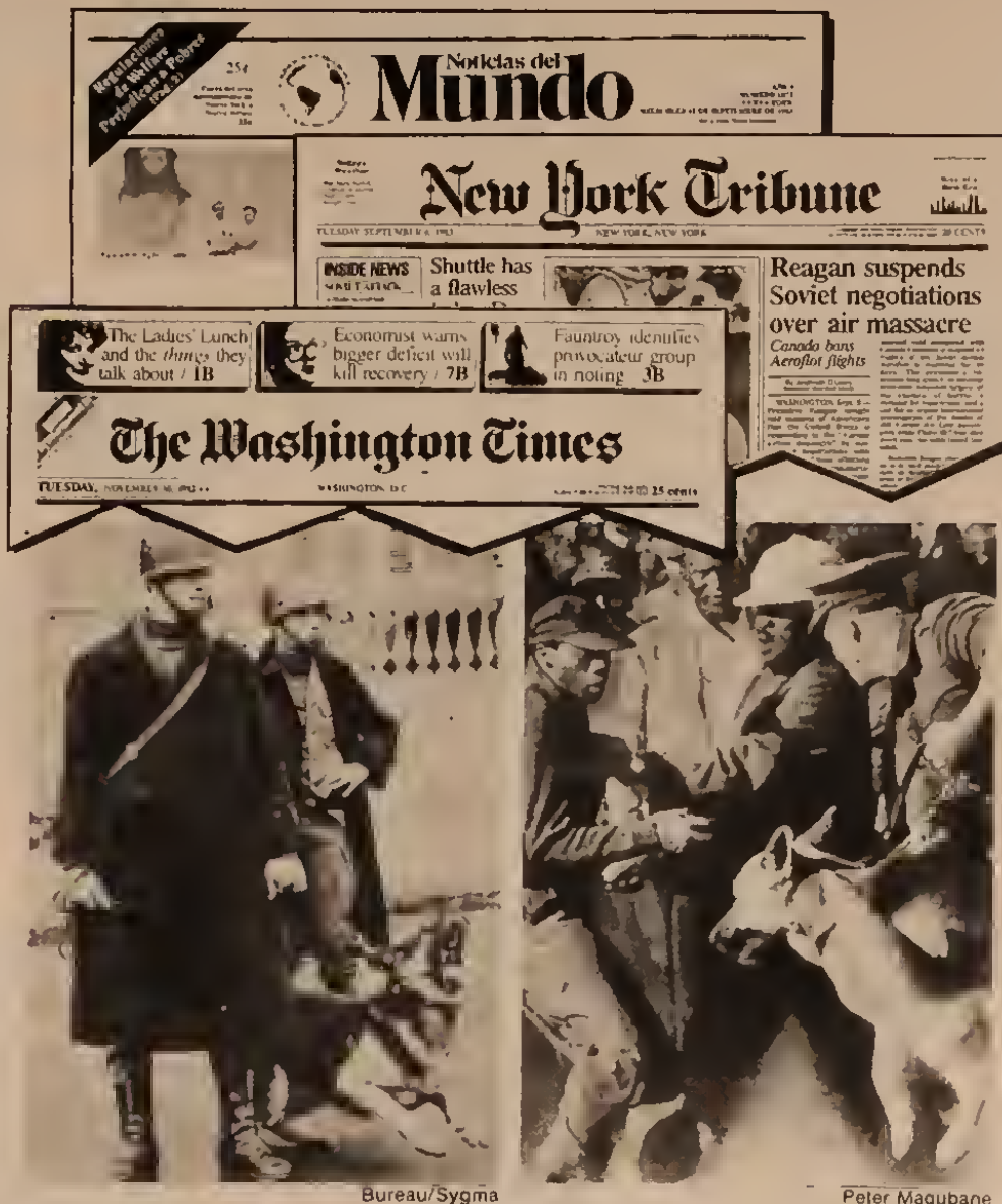
Moonies' terror connections: from Argentine junta (left) to South African apartheid police state.

It is no wonder that the Washington Times kick-off promo was a big "welcome to Washington" from a host of right-wing hot shots. But significantly it also included "welcomes" from D.C. Congressman Walter Fauntroy who generally receives good press at the hands of the Moonies. As their glossy first anniversary brochure brags, "If a