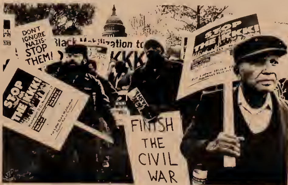
Washington, D.C., 27 November 1982—5,000-strong Labor/Black Mobilization, initiated and principally organized by the Spartacist League, stops KKK from marching in the nation's capital.