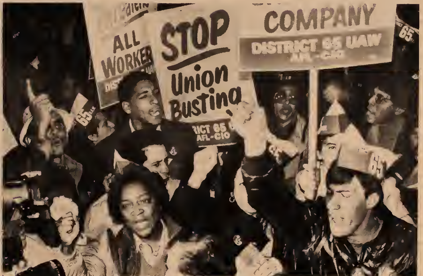
Support rally for Greyhound strikers in New York City, November 23—Labor must stop the buses! For a national transport strike!

The problem is that the rank-and-file ATU [Amalgamated Transit Union] members have been left largely on their own, and those guys tried. In Philadelphia 1,300 of them and other unionists in the city got out there the first day and stopped the buses for 12 hours. But the question is the leadership. Now a man is dead! A striker was hit by a seah driver. And those ATU leaders come back with the same damn offer that Greyhound put on the table in the first place, that take-it-or-leave-it offer. So what are they supposed to do in the face of this? There has to be a fight. They should take the contract and burn it. They should do what the miners did to Arnold Miller in