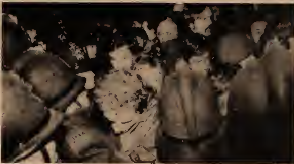
Warrington, England—Militant printers and other unionists defend picket line against Thatcher's scabherding cops.

connected right wing and the "little England" left social democrats like Tony Benn. The Labour rights have openly denounced the printers for "illegality" and "violence" as union pickets are brutally attacked by Thatcher's cops. We say: Drive the NATO-loving right wing out of the Labour Party! Meanwhile, the Labour "lefts" have done nothing except talk about changing the Tories' anti-union legisla-