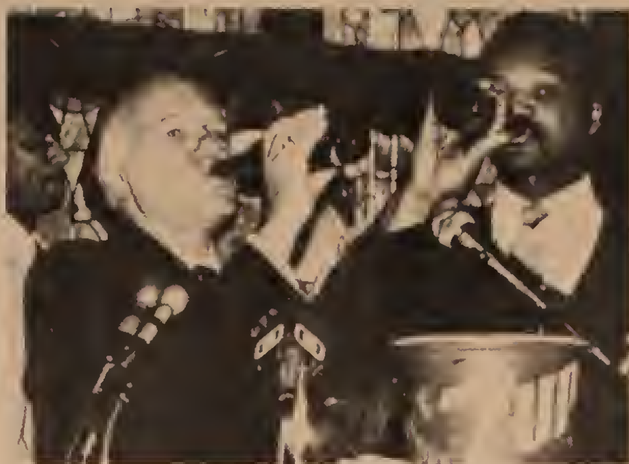
Jesse Jackson celebrates 1982 "covenant" with Uncola (Seven-Up) boss Edward Frantel.

loudly publicized multi-million dollar "covenants" or "trade agreements" with giant corporations, like the $34 million PUSH deal with Coca-Cola in 1981, or the $10 million deal with Heublein/Kentucky Fried Chicken in 1982 are the core of Jackson's economic program.