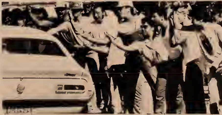
Striking copper workers confront scab in Clifton, Arizona.