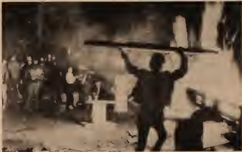
Early a.m., May 22—Workers build bonfires as they lay siege to 250 scabs trapped in Toledo auto parts plant.

There are those who say the strategies and tactics which won industrial unionism are dead today. They are just wishing. Look at Toledo! Unionists have no other weapon than the strike, the mass picket, the secondary boycott. If we fight, we face the weapons of the