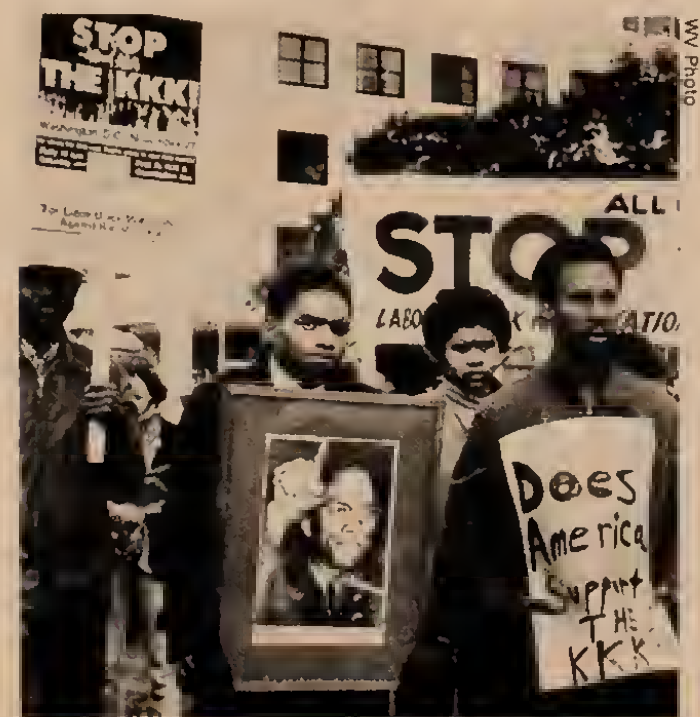
27 November 1982: At SL-initiated Labor/Black Mobilization that stopped the Klan from marching in Washington, D.C., a young black man carried photo of Malcolm X, symbol of anti-racist militancy. Separatists like Farrakhan stayed home.

The white ruling establishment has hammered at Jackson over his refusal to