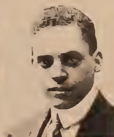
Ernest Everett Just