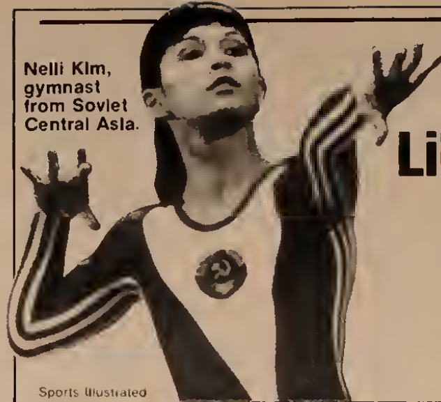
Nelli Kim, gymnast from Soviet Central Asia.

The 1984 Los Angeles Olympics were billed as the "first free enterprise games," in which by harnessing industry and finance to sponsor American athletes, capitalism could avenge itself for Soviet bloc predominance in international sports. More than $500 million was spent in advertising by firms