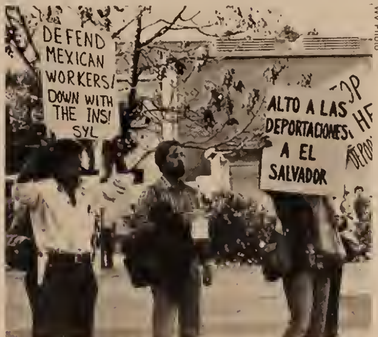
Los Angeles SL/SYL protests migra raids, demands full citizenship rights for foreign-born workers.

Fishing for Hispanic votes in the elections, all three Democratic candidates have come out against the Simpson-Mazzoli Bill, but only because it provides for employer sanctions and threatens to impose a national identity card. Meanwhile, California Democrats managed to get debate on the bill put off until after the state's primary June 5, eventually hoping to postpone the sensitive issue until after the November elections. Jesse Jackson makes the strongest pitch, hoping to add brown to his stillborn Rainbow Coalition. But come November he will be campaigning for the Democratic nominee, and front-runner Mondale favors the Roybal amendment which calls for beefing up the Border Patrol and the INS cops in general. For years these thugs have been a law unto themselves from San Diego to El Paso. Already the Reagan administration has embarked on a program to