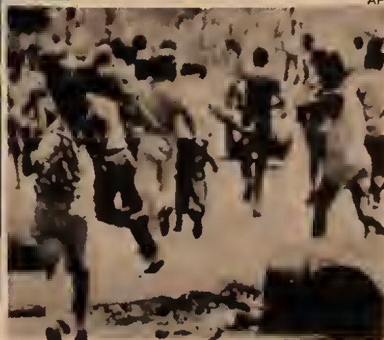
Dominican Republic, April 23: Over 60 killed and 6,000 arrested in hunger riot provoked by IMF-ordered austerity.