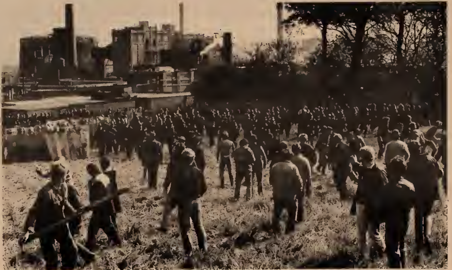
Orgreave, May 30—Thousands of coal miners from all over Britain take on army of scabherding cops.

A general strike has been posed as an objective necessity right from the start, to smash the Tory assault and bring down this hated government, which wages bloody war against Britain's workers and minorities while preparing for nuclear war against the Soviet workers. Now it is not only posed, but