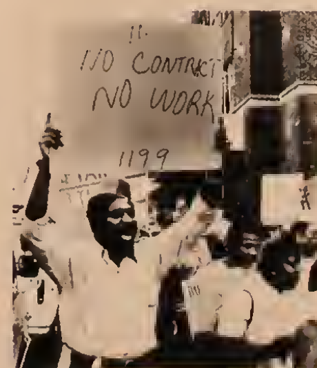
Militant black and Hispanic hospital workers take the lead.