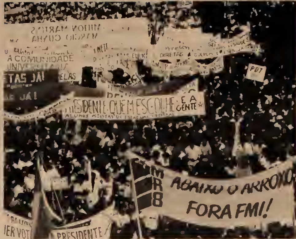
Mass demonstration in Rio de Janeiro demands, "IMF Get Out!" Blood-sucking bankers' cartel is hated from Brazil to Bangladesh.

Ronald Reagan, the commander in chief of U.S. imperialism (he never met a weapons system he didn't like), decided to finance his buildup for war on the Soviet Union by the unusual method of