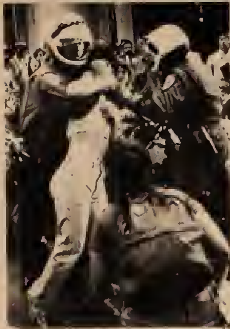
Cops rampage against protesters in SF, July 12.

Reagan is running for re-election on a platform of fear of "terrorism," to justify draconian repression and intimidate the populace. The Democrats chime in, "me too," to their own detriment. We warned in an SL state-