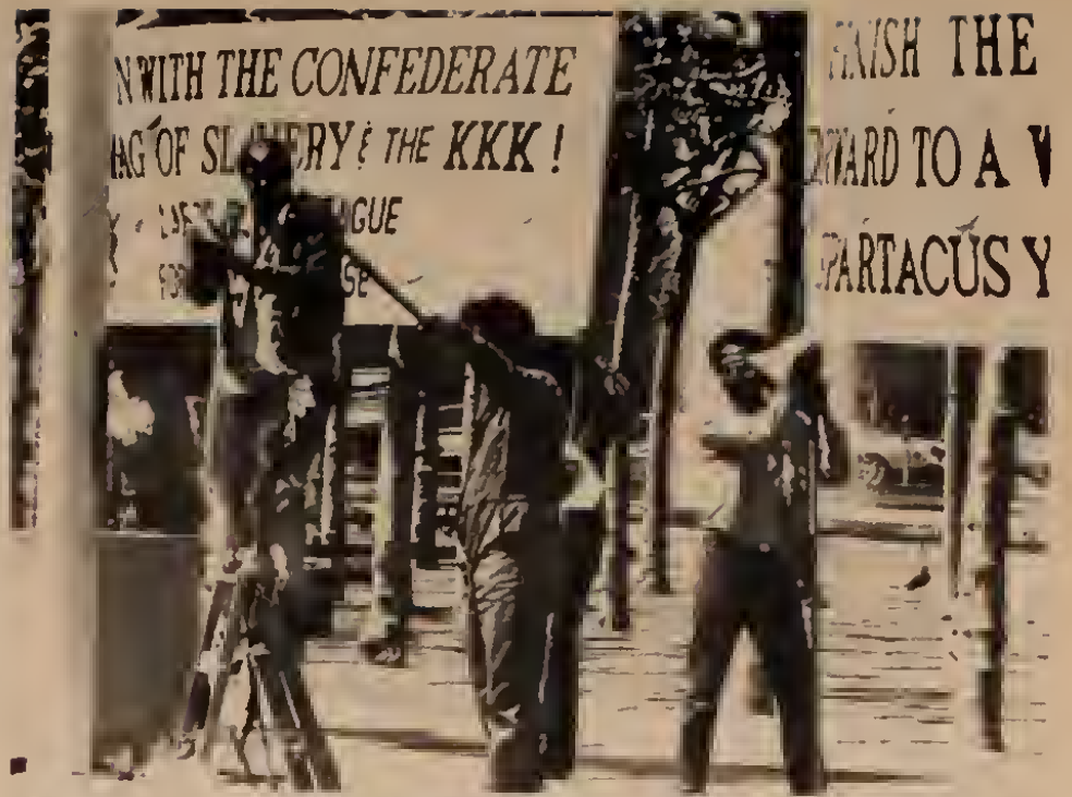
San Francisco, April 15—After tearing down Confederate flag, militants chant, "Finish the Civil War!—Forward to a Workers State!"