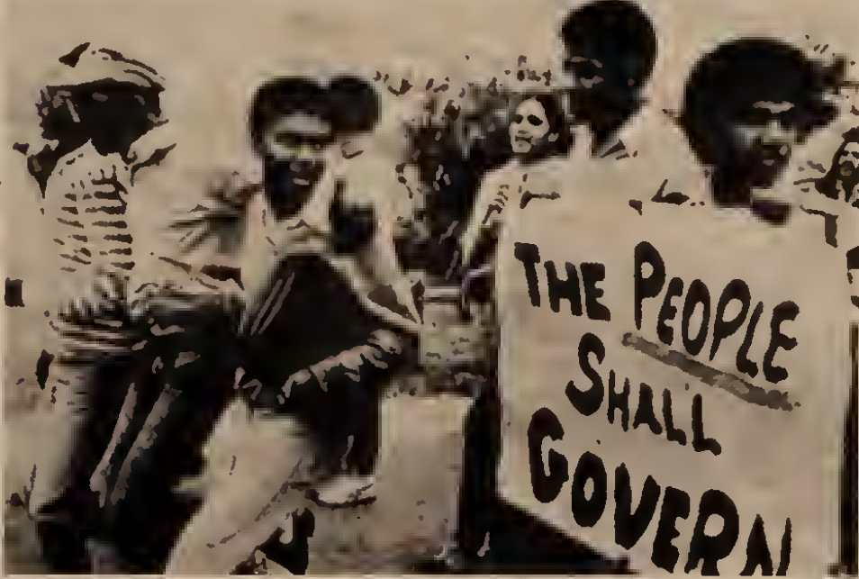
South African coloured students march against anti-democratic apartheid "reform."

South Africa's black nationalists and Stalinists have for years appealed to Western (i.e., imperialist) governments and institutions to isolate the apartheid state. Liberals have happily taken up this campaign (it's cheap), boycotting everything South African from sardines to Krugerrands and demanding that universities divest their stocks and bonds of any corporations with South African operations. These exercises in liberal moralism have no effect at all on South Africa while serving to prettify the "democratic" imperialist countries like Reagan's America. Real, not sham, solidarity with the struggle against apartheid in South Africa means, above all, strengthening the power of the black proletariat. The American and West European labor movements must together with their class brothers in South Africa force multinational outfits like Ford and General Motors to recognize black trade unions and to abolish the color bar and all forms of apartheid in the South African operations. Smash apartheid! Forward to a black-centered workers and peasants government! ■