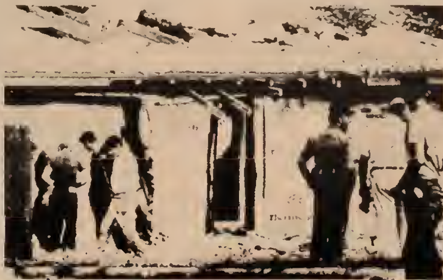
Bomb rips abortion clinic in Pensacola, Florida.

But it isn't just isolated nuts spearheading this terrorist campaign. The Reagan reactionaries have launched a sweeping offensive to force women back into childbearing "good house-