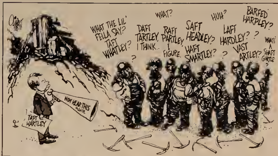
In 1977-78 strike, miners told Carter to shove his Taft-Hartley injunction.

WV replies: The reader's point about the nature of the penalties under Taft-Hartley, and the differences with the Landrum-Griffin Act, is well taken. It must be remembered, however, that