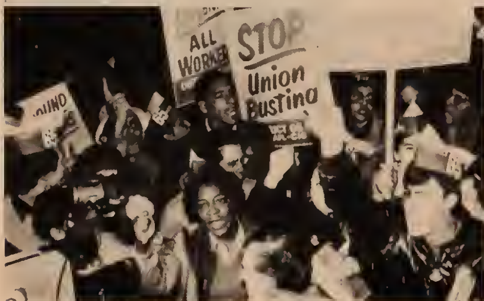
Labor/black struggle is needed to spike Reagan union-busting, anti-Soviet war drive.