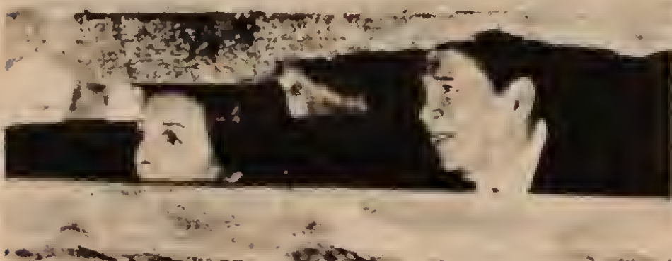
Reagan and Nancy in the bunker. The man with his finger on the button is not "joking" about plunging world into nuclear war.

Reagan's sinister anti-Soviet war drive can and must be spiked by the restless giant of American labor. The Republicans think they can ride the modest upturn in the U.S. economy back into the White House. But from