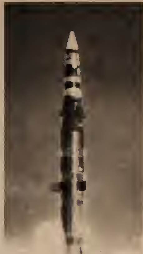
NATO Pershing 2, only five minutes from Russia.

To all those misguided peaceniks who call for "Disarmament—East and West," we say: if it were not for Soviet nuclear weapons the U.S. imperialists would be riding roughshod all over the world: Havana would be in the hands of the Mafia and the drug traffickers, Marshal Ky would be goose-stepping in Saigon and doddering tsarist officers would have been dancing on Lenin's