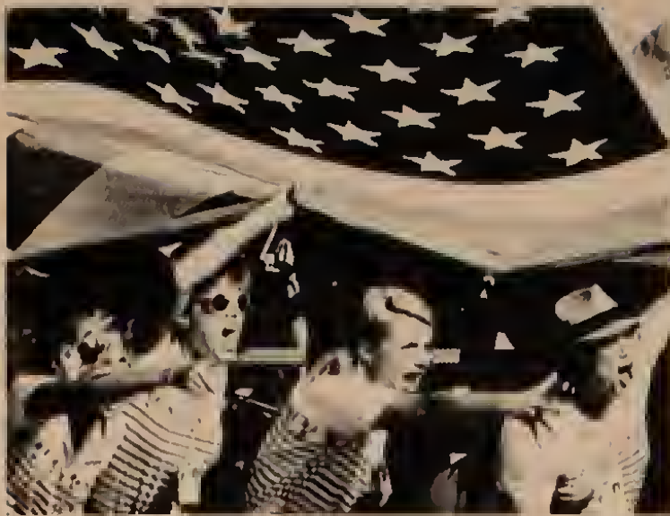
War Games In Los Angeles whipped up "Long Boor Freestyle Jingoism" (Sports Illustrated).

the copper fields of Arizona to the auto plants of Toledo-Detroit, that upturn has begun to generate a renewal of industrial struggle recalling the militant class battles that built the CIO. Workers are determined to take back the "give-backs" their misleaders gave to the bosses during the recent depression. Militant postal, auto and coal strikes, combined with genuine labor solidarity with the heroic Phelps Dodge strikers, can bring down Reagan. But the power of the racially integrated labor movement is shackled by an ossified labor bureaucracy forged in the McCarthyite Cold War and tied to the Democratic Party of racism and imperialist war. The "answer" to Reagan of AFL-CIO chief Lane Kirkland and his cronies—"don't strike and vote Democratic"—is to march for Mondale on Labor Day and vote for his watered-down version of Reaganism on election day.