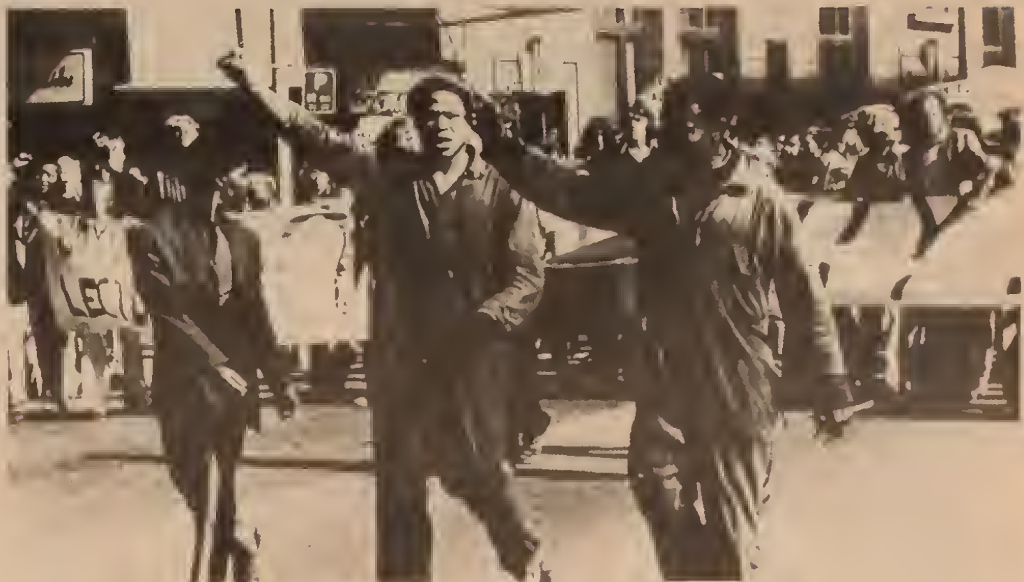
Militant black workers in Johannesburg protest 1976 Soweto massacre of student youth.

The supposed beneficiaries of the new constitutional order are having none of it. The coloured and Indian masses continued on page 11