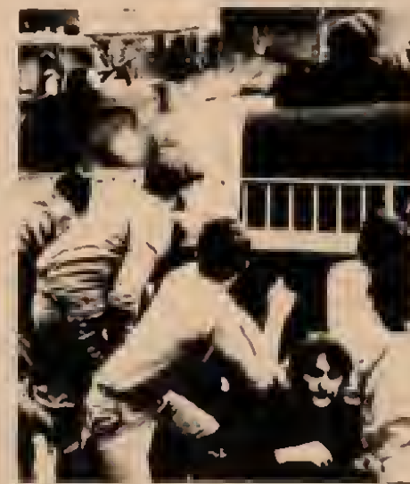
Belfast Bloody Sunday 1984— Protesters take cover as police fire plastic bullets at unarmed crowd, including children.

The Labour Party leadership despicably agrees with the Iron Lady that