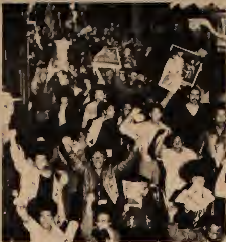
Thousands of outraged demonstrators jam L.A. Hall of Justice in December 1969 demanding freedom for Pratt and other arrested Panthers.