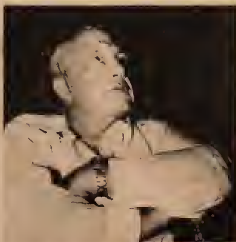
General Sharon. He did it. Everyone knows it. He has blood of more than 2,000 killed in Beirut massacre on his hands.