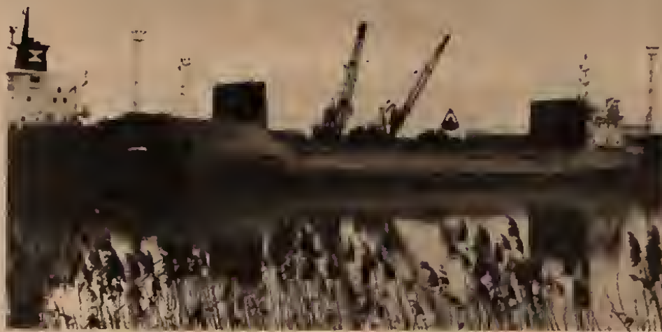
Scab coal being unloaded at secluded private wharf in Gunness, north England. Main source of imported scab cargo is the U.S.

Rank-and-file unionists here have largely been kept in the dark about this