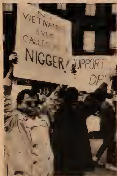
Militant black protesters at 1967 antiwar march in NYC.

"From 1969 Vietnam brought a grim new word in the military lexicon—'fragging': in plain English, murder. The term fragging derived from the use of a fragmentation weapon, usually a hand-grenade, as the surest way of dispatching an unpopular officer. Between 1969 and 1971, according to Congressional data, the total number of 'fragging incidents'—including actual attempts at murder and intimidation—was 730, and eighty-three officers were killed this way. But these figures do not include assaults on officers with other weapons—rifles or knives—and by one official estimate there was sufficient evidence in only ten percent of suspected 'fraggings' to warrant investigation. The ratio of violence against officers in