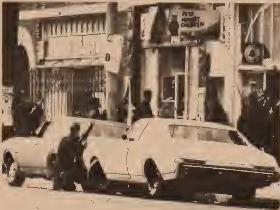
LAPD siege of Panther headquarters, 8 December 1969. Meese oversaw state's campaign to wipe out Black Panthers.

America. His police-state solutions appeal to this regime which is planning World War III against the USSR, yet has been unable to mobilize the population for war, or for its anti-Soviet military adventures. The Reaganite reflex is to call out the cops. And a supercop is exactly what Edwin Meese is. The Reagan regime wants and needs Meese to beat back democratic rights they see associated with the "Vietnam syndrome," and not just "war powers" resolutions or Congressional "oversight" of the CIA's dirty tricks and covert wars. For the Reaganites, protest in the streets is "lending comfort and aid to the enemy," i.e., treason to be met with military measures as they prepare for their Armageddon with the "evil empire."