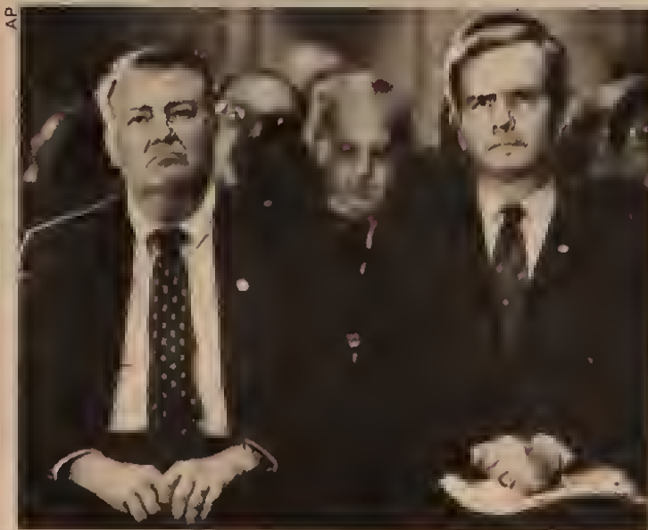
Top Cop Meese (left) with White House war "adviser" McFarlane.

racist and reactionary legal policies. Meese participated in the nine-volume Heritage Foundation report, the "New Right" blueprint for Reagan's war on labor, blacks and democratic rights. This report called for eliminating post-Watergate restrictions on the secret police and emphasized targeting individuals and groups engaged in lawful activities. With slight modification the Heritage program has been adopted in near entirety. Meese most adamantly pushed for the 1983 FBI Guidelines which legitimate and lay the basis for a massive COINTELPRO-type operation against political opponents, branding them as "terrorists."