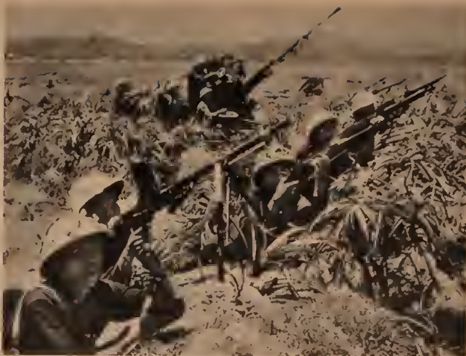
Foreign Languages Press

The endless "peace" crawls were nothing more than a giant postcard to your Congressman, a walking ad in the New York Times , a pressure tactic aimed at shifting administration policy. But the impoverished black masses would never be attracted by such reformist tactics. To mobilize the ghetto requires a struggle for power, a fight