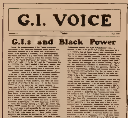
July 1969 Issue of antiwar GI paper initiated by Spartacist supporters in the army.

Judging by the Vietnam experience, the bosses have good reason to worry.