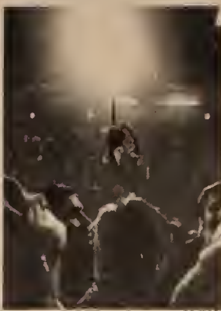
Miners' rally in South Wales on November 13: the hangman's noose is for TUC secretary Norman Willis.

their British class brothers. It reflected an understanding that if the British miners could win a major battle against a government that wants to smash their union and eliminate their jobs—the same problems faced by workers not only in Britain but in France, the United States, and throughout the capitalist world—then the struggles could much more easily be fought at home.