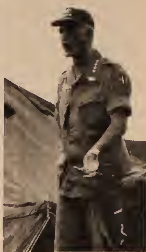
U.S. embassy, Saigon, April 1975 (left), loser Westmoreland (above). Humiliating scramble out of Vietnam as revolution triumphed still haunts U.S. bourgeoisies.