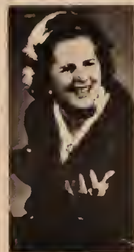
Vindictive butcher Maggie Thatcher gratuitously murdered 368 Argentine sailors aboard cruiser Belgrano .