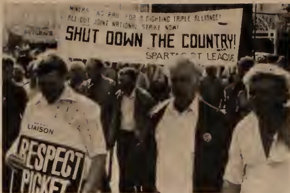
Spartacist League/Britain demanded "Shut Down the Country!" at time of second dock strike last September.

right-wingers driven out of the Labour Party. Not because we trust the "lefts," but because we want to make these pseudo-socialists responsible for their treacherous policies before their working-class base. But what these guys want to do is hide behind the coattails of Kinnoek & Co. This was graphically demonstrated at the Labour Party conference in October, where there was a partial revolt against Kinnoek and his bootlicking. They voted down Kinnoek's motion to condemn the violence of the pickets as well as the violence of