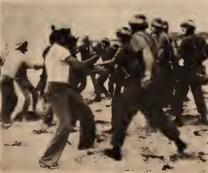
U.S. military's use of island of Vieques for bombing practice sparks protest in 1979, broken up by colonial police.

1984) quoted a Puerto Rican pro-independence leader's verdict: "We are a society permanently living on the dole. This has become a ghetto, like the South Bronx, not a nation."