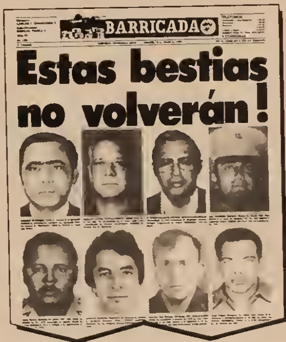
FSLN's Barricada: Contra "Beasts Will Not Return!"

"...a group of 350 contras assassinated 30 people, torturing and mutilating many of them. Among those killed were a 15-year-old boy who taught classes, and a community leader who was found hung from a beam in his house. One 14-year-old girl was first gang-raped and then decapitated and her head placed on a stake at the entry to the village.