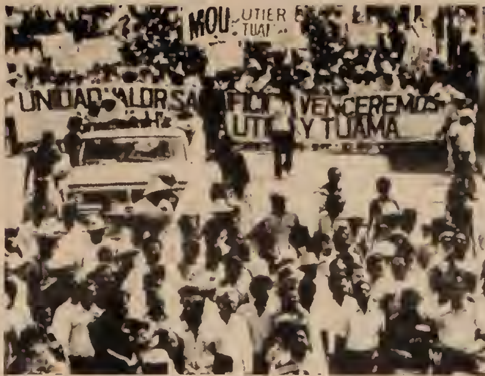
Militant UTIER electrical workers in vanguard of Puerto Rican workers' struggles.

A recent news special by New York's WCBS-TV on "Puerto Rico: Trouble in Paradise" (31 January-1 February) noted that, "While the mainland's American citizens slowly dug out of recession, 3.2 million in this visual island paradise still live day to day with economic hard times." It pointed to the collapse of petroleum-based industry, once the linchpin of Puerto Rico's development plans: "Industrial skeletons of Puerto Rico's troubled economy are as abandoned tinkertoys along the island's Caribbean coast. Petrochemical plants which once employed close to 40,000 people. That was 12 years ago, before the Arab oil embargo. Less than 3,000 jobs remain today." Construction has stopped, tourism is down, the number of hotel rooms half that a decade ago. The average income is less than half that of Mississippi, the poorest state, while 70 percent of all Puerto Ricans receive U.S. government aid. The Wall Street Journal (30 October