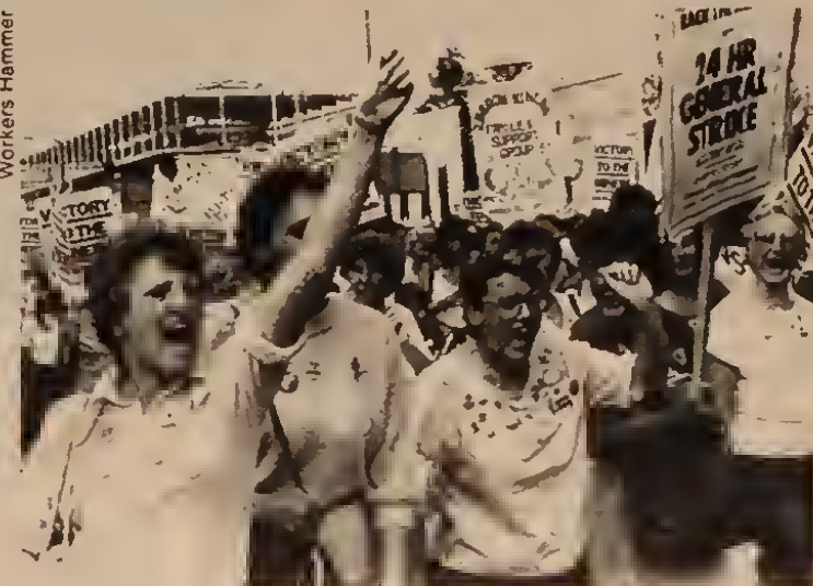
Miners' wives demonstrate in London, 11 August 1984. Militant women were a mainstay of the strike.

the police. In London, the miners organized collections on the streets in order to finance food for their families. And there's quite a bit of competition among the different lodges to get down to Brixton first and to get a good street corner. Now, Brixton is the West Indian ghetto in London, and it's an area of the city which is far poorer than many other working-class areas of the city. But the miners go down there because proportionately the support they get from the blacks and the Asians is much greater. One miner told me a story, that on one occasion on his picket line the police attacked the strikers and arrested 54 miners. Fifty-two miners were charged with disturbing the peace. Two miners were charged with malicious wounding of a police officer. The two miners charged with assaulting a police officer were both black miners. The striking miners learned something from that.