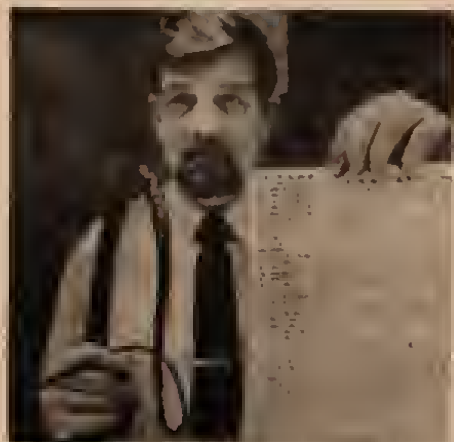
Overseer "Jefferson Bullwhip" Davis of the 207th Street plantation.

We need a new leadership that stands up and fights for our rights! No to hindering arbitration! We must prepare the union to use its power to shut this