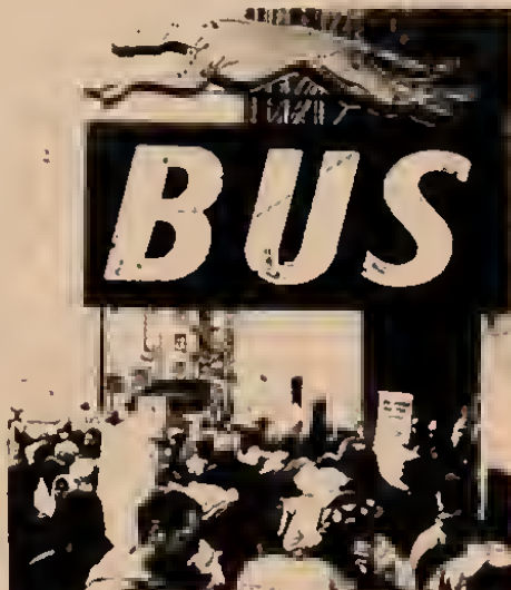
Unionists block street outside SF Greyhound depot, December 1983 (left); at SF airport in support of PATCO strike, August 1981.