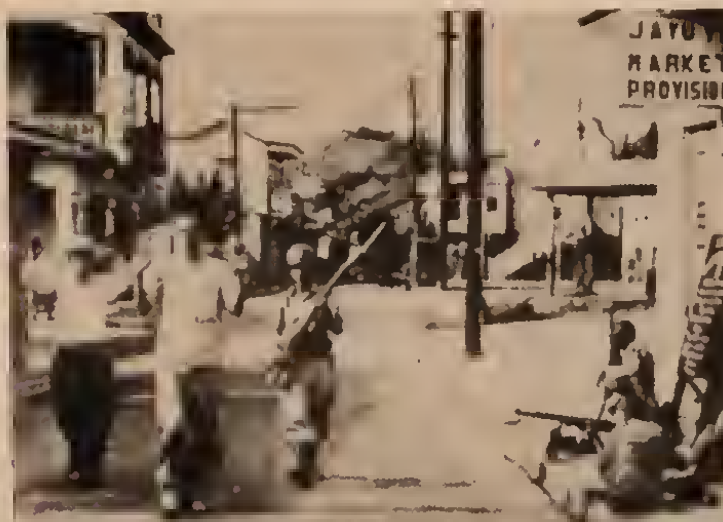
Puerto Rican National Guard suppressed the 1950 Independentista rising in Jayuya, above.

Puerto Rico's strategic location has made it a prize for whatever imperial power seeks to dominate the Caribbean. Hence its liberation will be the product of a struggle for socialist revolution throughout the region and taken into the Yankee heartland. Instead of seeking to divide Puerto Rican workers from their class brothers and sisters on the mainland, Marxists seek fighting unity in class struggle. Instead of echoing the imperialist liberals' call for a treacherous "negotiated solution" in Central America to pull Washington's irons out of the fire, we call for turning the isthmus into a tomb for Yankee invaders—only by defeating the colonial-imperial overlord will the day of Puerto Rican independence draw nearer. In contrast to Fidel Castro, who declares "I do not believe socialism is on the agenda in Latin America" ( Guardian , 26 December 1984), Trotskyists seek