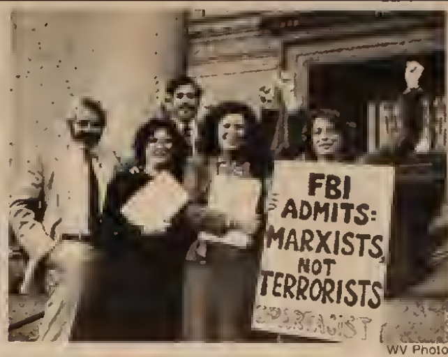
Federal Courthouse, New York City, November 30: SL, SYL, PDC spokesmen announce settlement of lawsuit against the FBI.

The SPL was once the subject of an FBI domestic security investigation. The investigation was closed in 1977, however, and it did not result in any criminal prosecution.