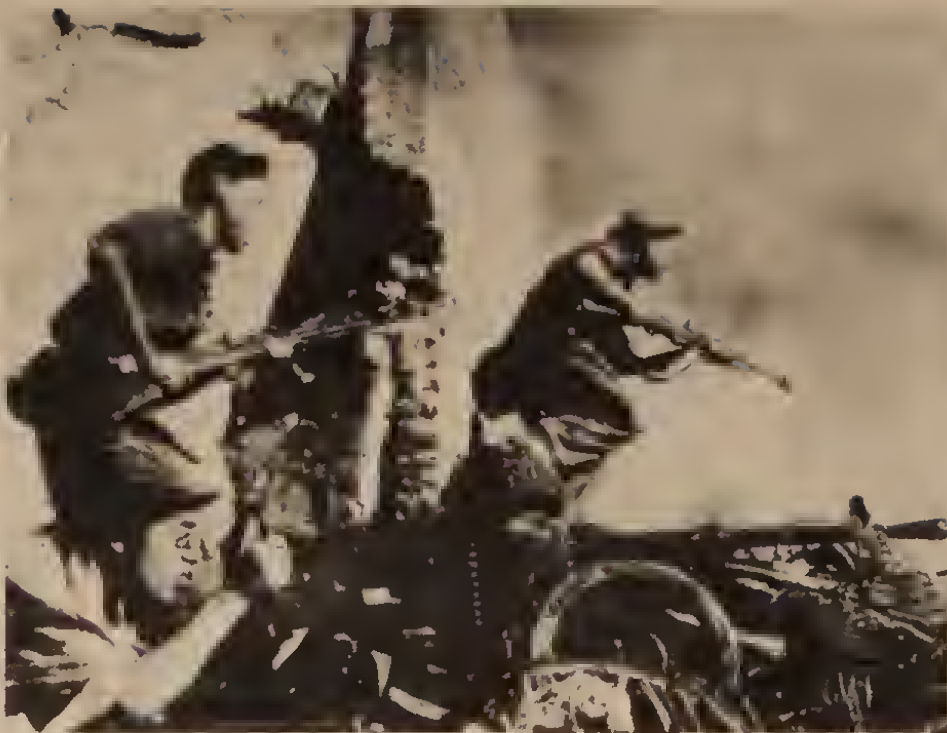
Nihon Denpa News, Ltd.

About the only one missing from the parade of war criminals was Lyndon Baines Johnson himself, dead but not forgotten. That monstrously wily, paranoid politician and the question of what he knew and when he knew it revealed another dilemma the squabbling ruling class factions tried to evade. It was clear by the end of the trial Westmoreland had in fact blocked not only the CIA's but also some of his own subordinates' higher "enemy" estimates—but how could LBJ not have known? Well, he knew what he wanted to; he was one of the big all-time liars about Vietnam himself (something neither side dared admit). The CBS trial was beginning to reveal that the order to lie about the "politically explosive" issue of vastly higher enemy strength came