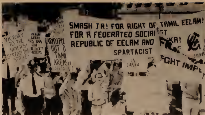
Spartacist League/Britain protests anti-Tamil terror in Sri Lanka, London 1984.

Predictably, the promise to grant citizenship unleashed paroxysms of