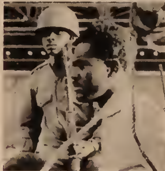
Patrice Lumumba, who led fight for independence in Belgian Congo (now Zaire).

During this sordid, bloody affair the United Nations "peacekeeping force" in the Congo served as direct agents of U.S. intervention under the Eisenhower