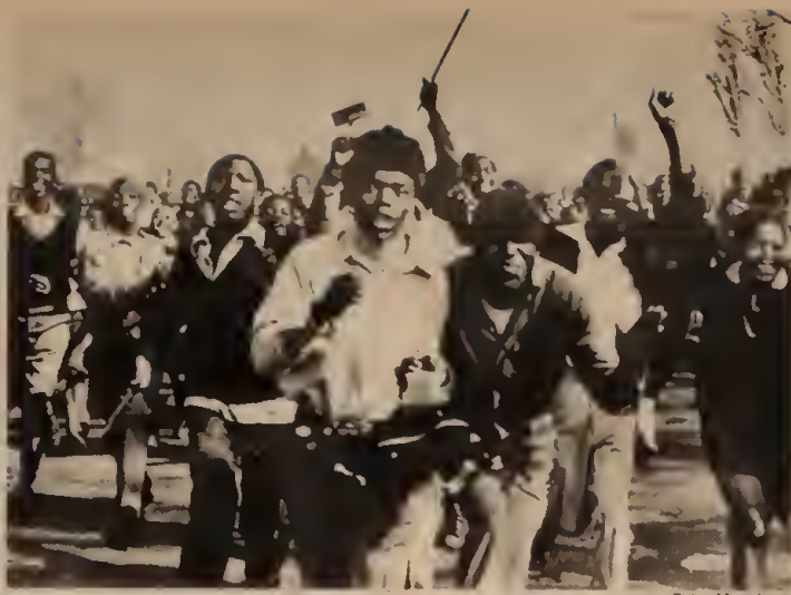
Soweto rebellion, June 1976—Over a thousand black student youth massacred by apartheid butchers.

Recent events in the huge squatter community of Crossroads near Cape Town are a chilling confirmation of this danger. Throughout 1985, as in countless townships across the country,