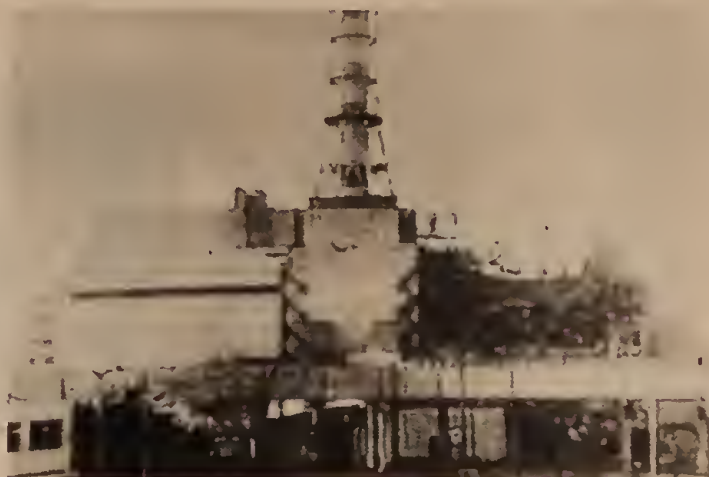
Chernobyl power plant in the Ukraine, site of tragic nuclear accident.

Now the truth is beginning to come out in dribs and drabs. The ludicrous story of "2,000 dead" at Chernobyl, which originally got screaming three-inch New York Post headlines, was finally withdrawn by United Press International—in a retraction buried on the inside pages of the Times . The New York Times (19 May) belatedly reported that "U.S. Experts Say Construction Is Similar in Some Ways to Plants in America," revealing that the Chernobyl plant had a containment structure after all. That same day another Times story, "Soviet Mobilizes a Vast Operation to