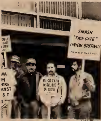
Oakland, June 1—Smash Ma Bell's divide-and-rule!

The U.S. Navy's blatant penetration of Soviet waters, sending American spy ships packed with electronic eavesdropping gear to within six miles of the Crimean coast near the Soviet Navy's Black Sea home port of Sevastopol, had nothing "innocent" about it. This was a deliberate provocation, with no legal basis, of a piece with the KAL 007 spy plane which overflew vital Soviet Far Eastern naval facilities. Reagan & Co. claim an imperial right to ignore every other country's law, but as we pointed out, the Soviets would have been "well within their rights if they blew the intruders out of the water." Admiral Chernavin ended his commentary noting that "this time, we showed patience and restraint."