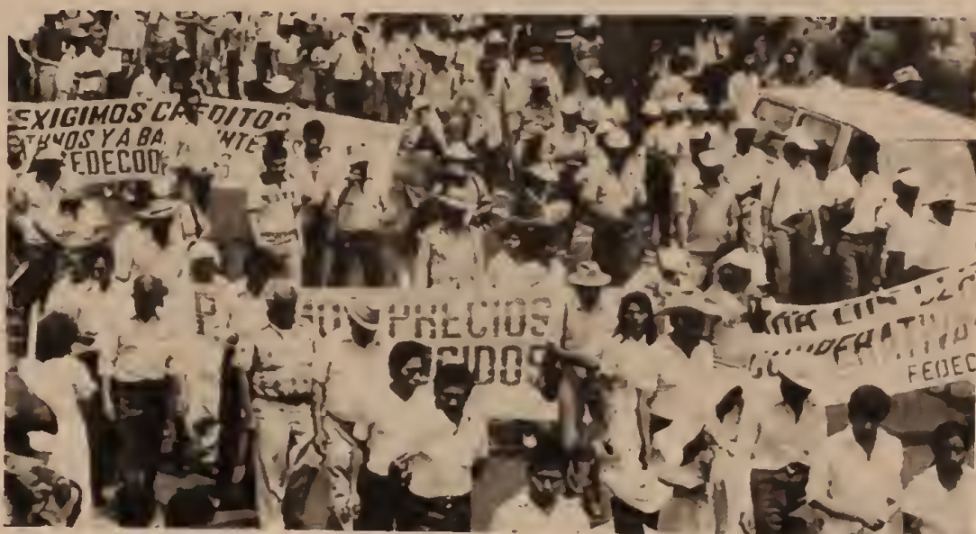
San Salvador, May Day—Mass workers' march against "Reaganomics with machine guns," courageously defying Duarte and Salvadoran army.

In recent months the Duarte government and its American godfathers have claimed they have the leftist insurgents of the Farabundo Martí National Liberation Front (FMLN) on the run. (The guerrillas' social-democratic allies in the Revolutionary Democratic Front [FDR], meanwhile, talk of returning to participate in the electoral games of Duarte's death squad "democracy.") But although U.S.-supplied air power has forced the rebels to change tactics, they have refused to be trapped in frontal battle. So the military are systematically depopulating FMLN-held areas with scorched earth tactics and saturation bombing reminiscent of