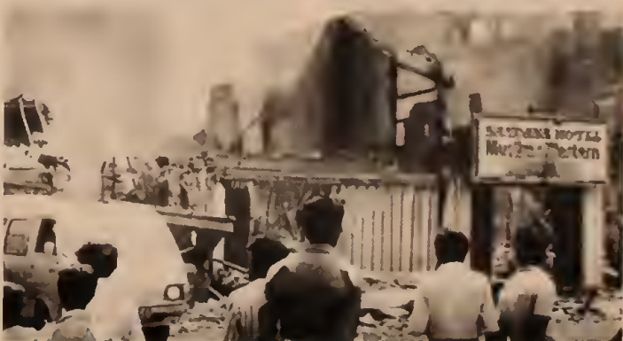
Colombo, July 1983: Government-instigated pogroms slaughtered hundreds, burned Tamil-owned shops to the ground.

Jayewardene, having devoted months under a fictitious "cease-fire" to pacifying the Eastern region and building up the military, moved on the North with the intention of finally crushing the Tamil resistance and wiping out their cadres. The openly pro-U.S. regime appeals to "the English-speaking world" to help "suppress the alarm and rebellion here" ( London Sunday Times , 11 May), and the imperialists have obliged. The Sri Lankan army is now equipped with 150 armored personnel carriers