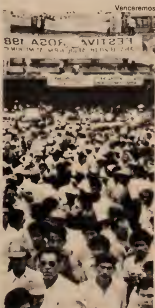
AIFLD against workers' struggles: San Salvador, May Day 1985 (above); South African black unions (above left); Philippines sugar workers (left).