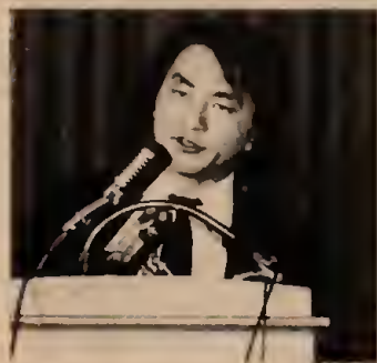
Japanese American physicist Dr. Michio Kaku.