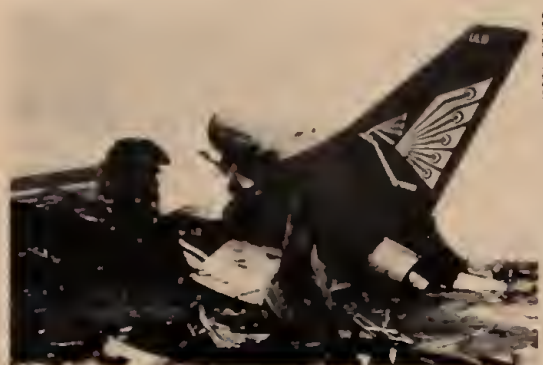
Tamil nationalist group now claims "credit" for blowing up Air Lanka jet filled with tourists.

Americans lost in Vietnam" ( London Guardian , 21 May). And J.R.'s ferocity is no doubt tempered by the fear of provoking a military intervention on the part of India, where Rajiv Gandhi faces substantial pressure from the 50 million Tamils in the southern state of Tamil Nadu.