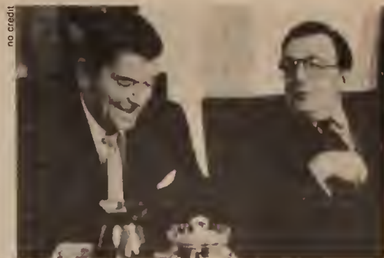
AFL-CIO head Lane Kirkland (right) joins Reagan in fomenting contra terror in Central America.