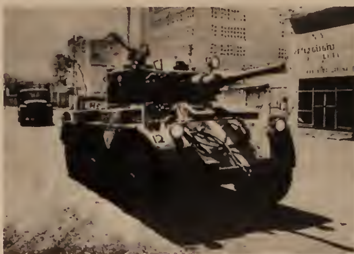
J.R. Jayewardene's army tries to "exterminate" Tamil militants in Jaffna.

But J.R.'s offensive ground to a humiliating halt as the troops encountered fierce resistance from well-equipped Tamil guerrillas. The roads into Jaffna were mined and a key bridge blown up; the government forces, stopped at Elephant Pass, retreated into their fortified enclaves and launched another wave of bombing attacks to terrorize the Tamil population. As one Sinhalese commander put it, admitting they were unwilling to take the massive casualties required to crush the rebels, "You cannot win a guerrilla war when your enemy is fighting on home territory with the backing of the people. The