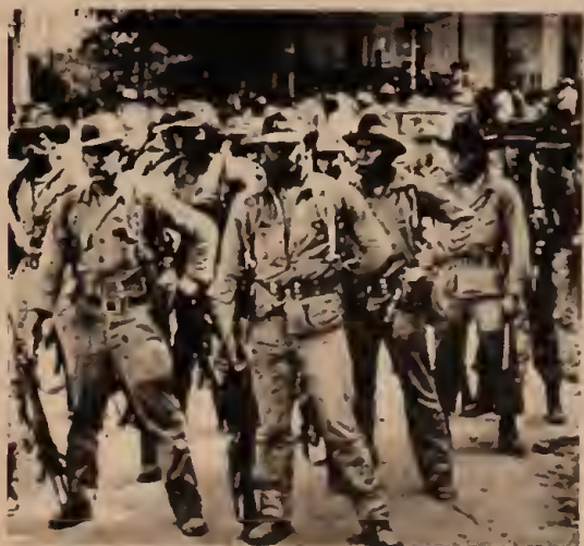
Lettist rebels liberate town of Berlin, 1983.