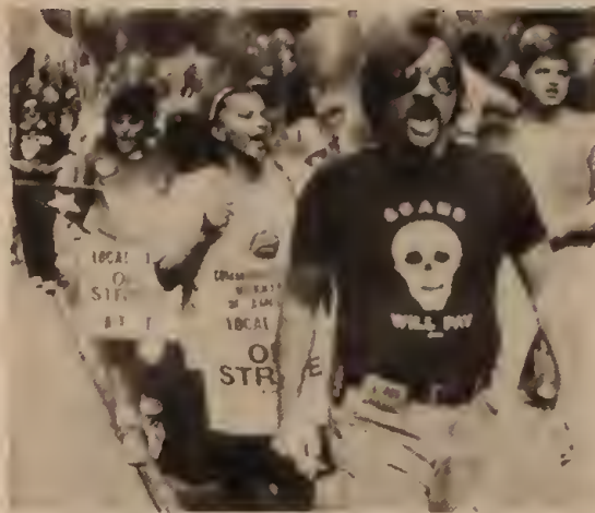
Striking phone workers picket AT&T headquarters in New York.