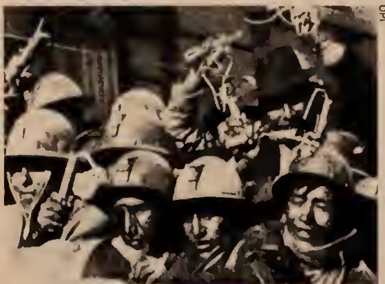
Bolivian tin miners, brandishing dynamite, resist 1971 military coup.

Today the workers, peasants and urban poor of Bolivia are reaping the results of the March betrayal, as the Paz government's surgical repression succeeds (for the time being) in clamping a lid on mass protest. A terrible vengeance is being exacted for the failure to seize the revolutionary opportunity. The situation is deeply ominous for the Bolivian toilers, veterans of decades of heroic struggles. Their salvation will be under the banner of a reborn Trotskyist Fourth International, so that their combativity can ignite a revolutionary explosion by the big battalions of the proletariat throughout the Americas, from the Southern Cone of Argentina, Brazil and Chile to the United States itself. ■