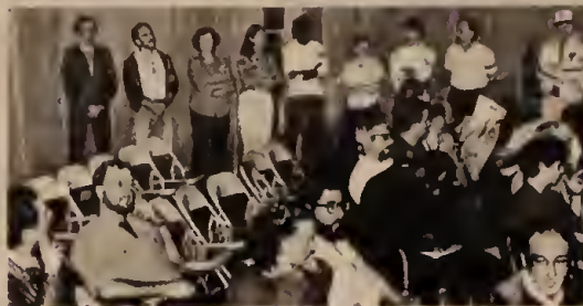
Defense guard ensures workers democracy at SF meeting, following ET/BT provocation the day before.

joined, as is our policy with this group, the BTers were asked to leave the room. At the door they resisted leaving and precipitated a fight, suddenly punching and kicking the comrades ushering them out.