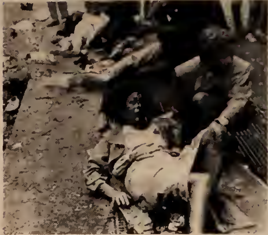
Paris, September 17, 4:45 p.m. Bomb attack on Tati, working-class clothing store patronized by Arabs, kills 5, injures 51.

Now the government of Mitterrand and Chirac is on the hot seat. The authorities have used the "anti-terrorist" measures to escalate cop repression against immigrants. Paramilitary police units in combat gear (CRS anti-riot squads and mobile gendarmes) are combing the major cities. Entry visas are required for all foreigners from outside the Common Market (including immigrants already residing in France). And citizens are called on to turn in "suspects" for a bounty of up to one million francs ($150,000). Le Monde (18 September) obliquely called this "a decision without precedent since the Second World War"—that is, since the time when the Nazis and Vichy regime organized mass denunciations against Jews and resistance fighters.