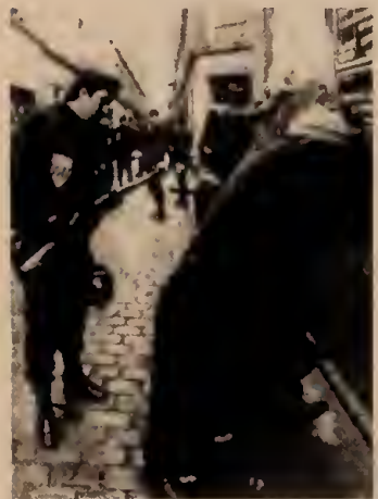
The CRS, elite French SWAT team, in early morning terror roundup of immigrants.

It started when explosives were discovered in the Gare de Lyon RER (regional metro) station September 4. Then bombs exploded on September 8 in the post office facing Paris city hall (one dead, 18 injured), and four days later in a cafeteria in the business district of "La Défense" (41 injured). When on September 15 Chirac vowed "draconian reprisals" against the bombers, they promptly replied with another blast that day inside the Paris police prefecture, killing one and wounding 51. The next day the target was the Renault bar on the elegant Champs-Élysées with a toll