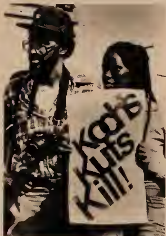
Demonstrating to keep Harlem's Sydenham Hospital open, 1980.