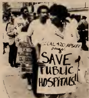
Union workers fight to save hospitals, while AFSCME president Gotbaum plays ball with bosses.

The Labor Black League program calls for mass mobilizations to stop the racist terrorists; for full union and citizenship rights for foreign-born workers; for women's rights—free, quality 24-hour day care, free abortion on demand, and equal pay for equal work; down with anti-gay laws; fight discrimination in jobs, housing and schools; for massive social security—health, pensions, full unemployment compensation at union wages; for a fighting labor movement—jobs for all; and for a break with the Democratic Party of war and racism. Join with the Labor Black League for Social Defense and the Spartacist League in forging a workers party to fight for black liberation through socialist revolution! ■