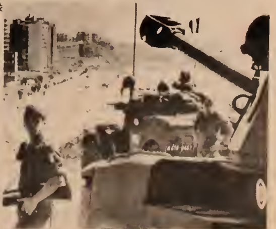
French troops (along with U.S.) disarmed PLO in Beirut, paving way for Sabra/Shatila massacres.

Above all, the imperialists need "terrorism," and the more irrational the better. The bombings only make sense as a giant provocation whose purposes are the opposite of the demands of the shadowy "FARL/CSPPA." They can only strengthen French ties to Israel and the U.S. in the name of "anti-terrorism," the code word for the anti-Soviet war drive in the Mediterranean. Washington was piqued at Paris' refusal to let its F-111s overfly France for its Libya raid in April. The next time around they figure they will get cooperation. The Ligue Trotskyste de France, which demanded "Reagan/Mitterrand Hands Off Libya!" and condemns the indiscriminate Paris terror bombings, insists: Down with the imperialist terror—French troops out of Africa, Lebanon and the Pacific! ■