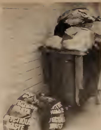
no credit Infected garbage piles up near pantry on medical floor of Harlem Hospital.

But Reagan's budget cuts in New York City are carried out by the Democratic Party city administration: not only the arrogant racist pig Koch, who treats blacks and Hispanics like they're Arabs on the Israeli-occupied West Bank, but also limousine liberals like City Council president Stein and black front men such as Manhattan borough president David Dinkins. Rather than bringing out labor against these enforcers of capitalist austerity, AFSCME DC 37 head Victor Gotbaum