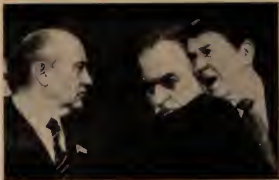
Soviet leader Gorbachev meets with warmonger Reagan in Geneva, November 1985.

The American media have thrown up a smokescreen of righteous indignation over the arrest of an alleged reporter in Moscow—supposedly U.S. reporters don't spy. Never mind all the post-Watergate revelations, such as the 1976 Senate intelligence committee report that the CIA had around 50 agents working under cover as journalists or employees of American publications, not to mention the hundreds of agency "assets" who had a more "unofficial" connection—namely they passed on hot tips for free. Columnist Joseph Alsop, who bragged that he "helped the CIA from time to time," was typical. We are supposed to believe these relationships were ended in 1977 as the result of a new CIA regulation. But only a fool would take the word of an agency that deals in disinformation. Even Newsweek (22 September), which ought to know, reports that "America's 'spooks' and