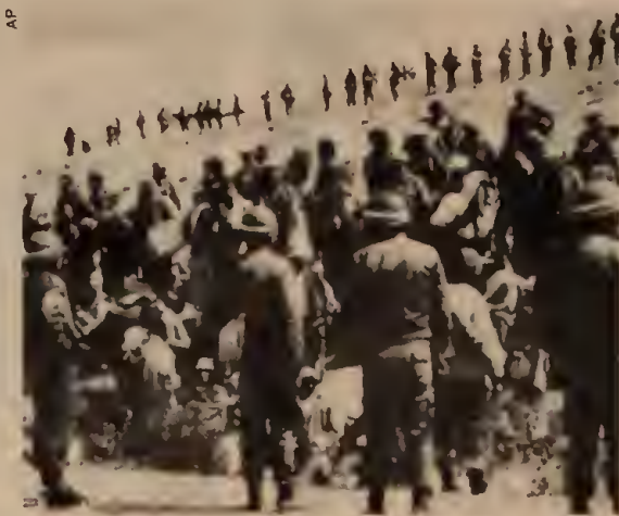
Bolivian army surrounds militant tin miners marching on capital, August 29.

union and civic leaders denounced the plan to turn Bolivia into "Honduras South"—a site for permanent American military "exercises" threatening the entire region.