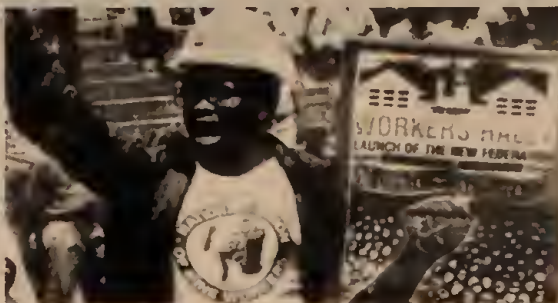
People's Daily World

Black miners union NUM was leading force in forming 500,000-strong COSATU union federation.