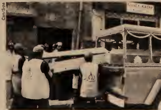
Bodies were mutilated beyond recognition in hideous anti-Semitic massacre.

desperate Palestinian refugees, who have known nothing but devastation and death and have nothing to look forward to but fantasies of blood vengeance, to criminal indiscriminate terrorism, from airplane hijackings to synagogue bombings.