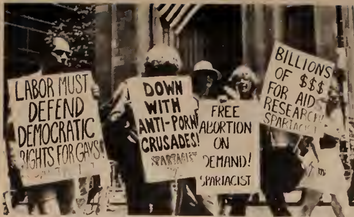
Spartacists at 1986 Gay Pride Day march in New York City.