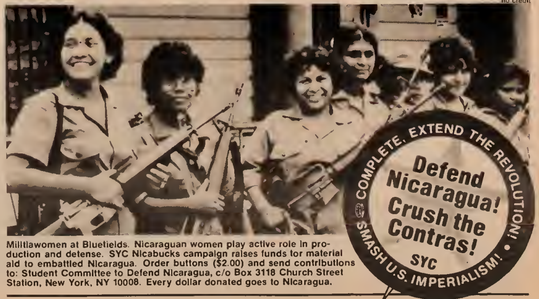
Millitawomen at Bluefields. Nicaraguan women play active role in production and defense. SYC Nicabucks campaign raises funds for material aid to embattled Nicaragua. Order buttons ($2.00) and send contributions to: Student Committee to Defend Nicaragua, c/o Box 3118 Church Street Station, New York, NY 10008. Every dollar donated goes to Nicaragua.