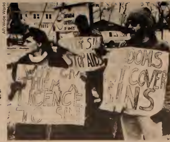
Anti-sex fanatics target AIDS victims.

black: bad living and working conditions and wretched medical care mean poor health—including diseases which, unlike AIDS, can be cured.