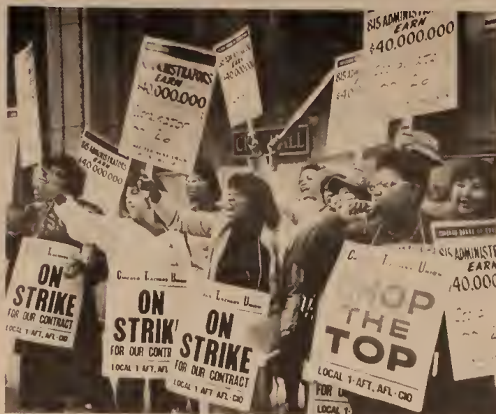
Chicago teachers chant "Where's Harold?" at September 23 strike rally. Black Democratic mayor Washington is on the other side of class line.

At the September 23 rally strikers chanted, "Where's Harold?" A first step to winning this strike is to realize