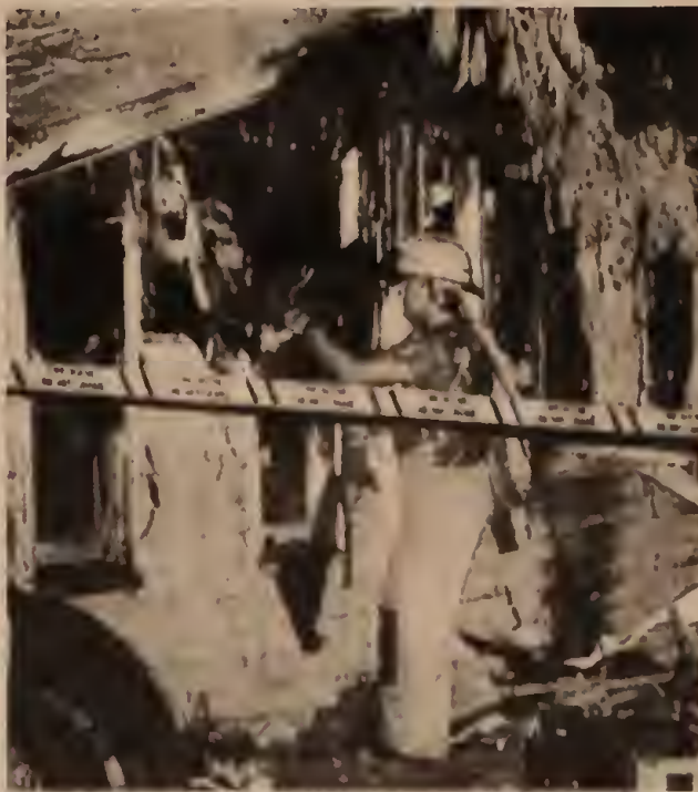
Burbank/Fort Myers News Press

"When gay rights protesters raised the chant, 'Civil rights or civil war!' and