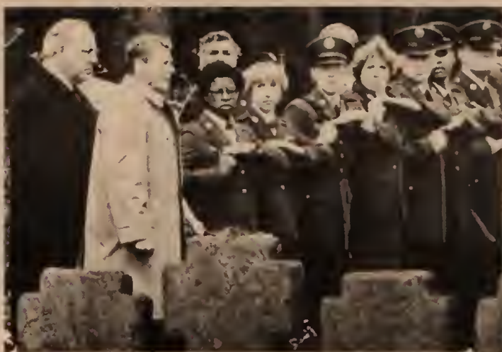
May 1985: Reagan salutes Nazi SS at Bitburg in service of anti-Soviet war drive.