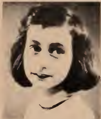
Anne Frank. Her diary showed millions the horror of Nazi occupation.

Thousands of Americans who died in World War II thought they were fighting Nazism. But Ronald Reagan represents that section of the American ruling class who think the U.S. was on the wrong side. When Reagan went to Bitburg, it was chilling proof of the determination to openly embrace the Nazis in the name of anti-Communism. They hope to finish up where the genocidal Third Reich left off when the Red Army smashed Hitler's Operation Barbarossa. They want to crush the Soviet Union and roll back the Bolshevik Revolution. They don't want the Holocaust remembered. They're planning their own nuclear holocaust against the Soviet Union. We had better stop them soon. ■