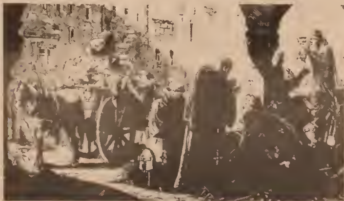
Medieval Europe saw ravages of bubonic plague as god's scourge; today's witchhunters blame AIDS victims for disease.

Racist nativist agitation against immigrants reached a peak in the late 19th and early 20th centuries. Prior to World War I the government began codifying the exclusion of whole categories of people, including polygamists, anarchists and other radicals, convicts, "lunatics," people with tuberculosis,