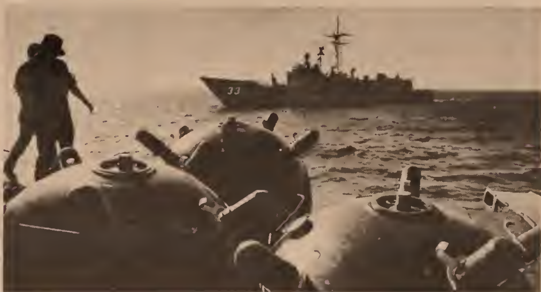
Persian Gulf minelaid: USS Jarrett captures Iranian ship. Reagan's provocations are dangerous trip wire for World War III.

First they sent in a Navy flotilla, daring Khomeini to respond. But Teheran didn't bite. So the U.S. used two helicopter gunships from a secret high-tech Army unit (Task Force 160) to disable the Iranian ship, killing at least three seamen and capturing 26. Pentagon chief Caspar Weinberger showed up in person on the decks of the command ship LaSalle to crow. He called the Iranian craft "a blazing gun," a "mine-laying ship" caught "red-handed" in