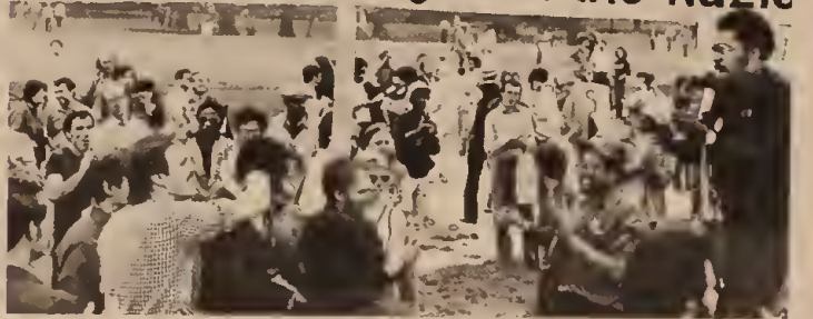
Spartacist-initiated united front spiked Nazi provocation against Gay Pride Day, Chicago, 1982. For labor/black action to smash fascist terror!

against the MOVE commune, whose only "crime" was to be "uppity" in Reagan's America. On Mother's Day, 1985, Goode's cops and Reagan's FBI worked together to fly a bombing mission over the MOVE house, massacring five children and six adults and burning down a neighborhood of black homes. The proliferation of "Black Elected Officials" (touted as proof of black advancement) was no gain for the black masses, for the black mayors like Marion Barry in Washington are, no less than white racists like New York's mayor Koch, merely overseers on Reagan's plantation.