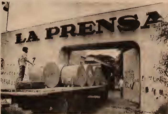
"Peace" plan reopens contra mouthpiece. We say: Shut down La Prensa for good!

I had a chance to talk to one of the leaders of the Juventud (the Sandinista youth organization) and we had a big argument over amnesty. This guy had just come back from spending five weeks in the hills handing letters over to contra families, appealing to them to call on members of their families to lay down their arms. He lost a lot of friends who were killed by the contras and he admitted that "sometimes when they hand over their arms, the first thing I want to do is blow them away." This amnesty is a betrayal by the Sandinistas.