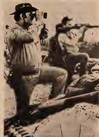
Wounded Knee, 1973: Rifle-toting U.S. marshals besiege American Indian protesters.

People here remember that Reagan was trying to crush black militancy in the '60s while he was governor of California and Meese was his assistant. They oversaw the war of extermination against the Panthers. In the late '60s,