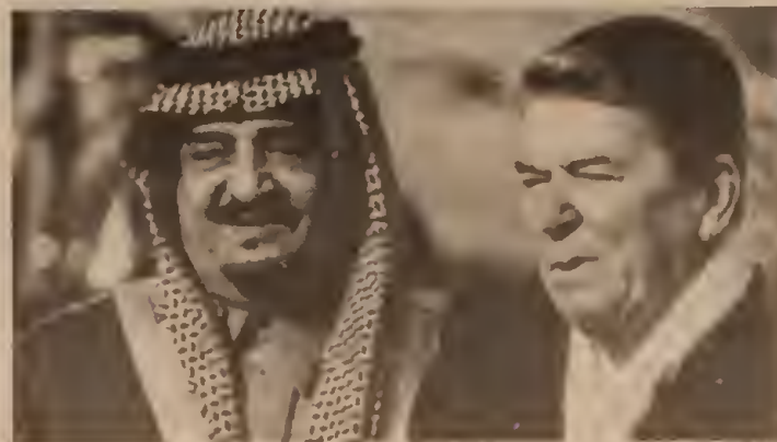
Who is Reagan defending in Persian Gulf? Feudalist King Fahd of Saudi Arabia ("Country 2" of Contragate fame).

The Soviet Union can chortle over Reagan's foundering in the Gulf. Responding to American calls for an arms embargo against Iran, Soviet foreign ministry spokesman Gennadi Gerasimov jibed, "We are not selling arms to Iran. Some other countries were selling arms to Iran and telling others not to do so" (New York Times, 25 September). Moreover Moscow recently agreed with Iran to build a railroad and pipeline linking the USSR