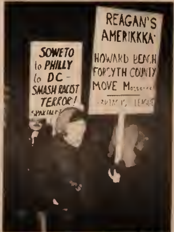
Reagan's Amerika: anti-Soviet war drive fuels racist terror.