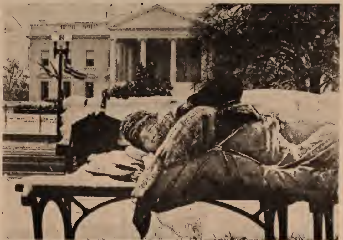
On the coldest day of the year, a man sleeps in Lafayette Park in front of the White House.

• On the mean streets of New York City—against the backdrop of yuppies in their BMWs, corporate raiders, inside traders and condo kings like Donald Trump flaunting their riches—are the thousands of people who live on the continued on page 10