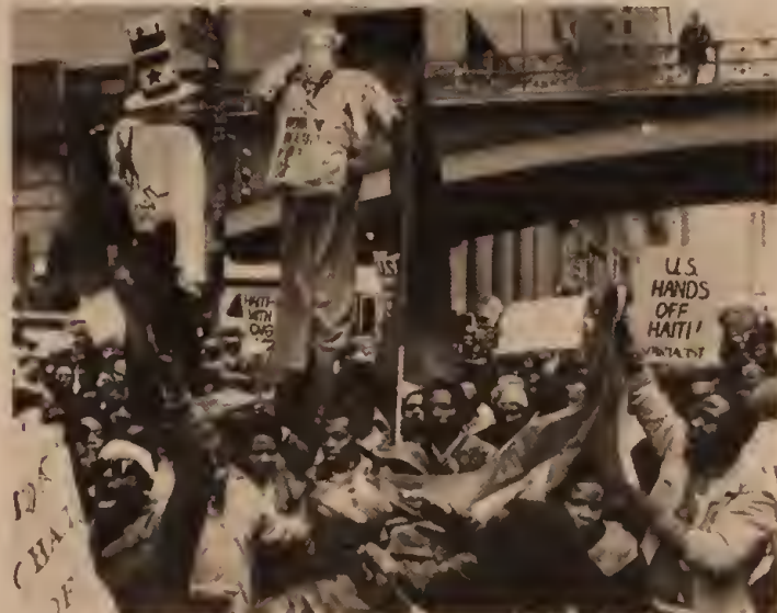
Spartacists join outraged Haitian community protesting bloodbath, New York City, November 30.

"...the Haitian Revolution of 1793-1804...sent shock waves through the Caribbean, inspiring slave revolts in Jamaica, Guadeloupe, St. Lucia, Grenada, Dominica and Curaçao as well as the American South. Today, the Haitian masses, beset by decades of U.S.-imposed dictatorship and IMF-dictated starvation, can spark a revolt against capitalist wage slavery, for workers revolution throughout the region. This is the Trotskyist program of permanent revolution, the program of the international Spartacist tendency." ■