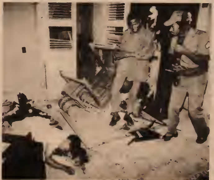
Election Day—Voters slaughtered at Port-au-Prince polling station.