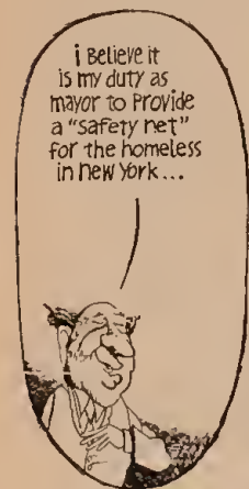
Rabid bigot Ed Koch at work.

Last hired, first fired, victimized and terrorized—blacks always get the worst