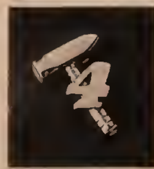
(Pin shown 1/2 times actual size)

Order from/pay to: Spartacist, Box 1377 GPO, New York, NY 10116, USA