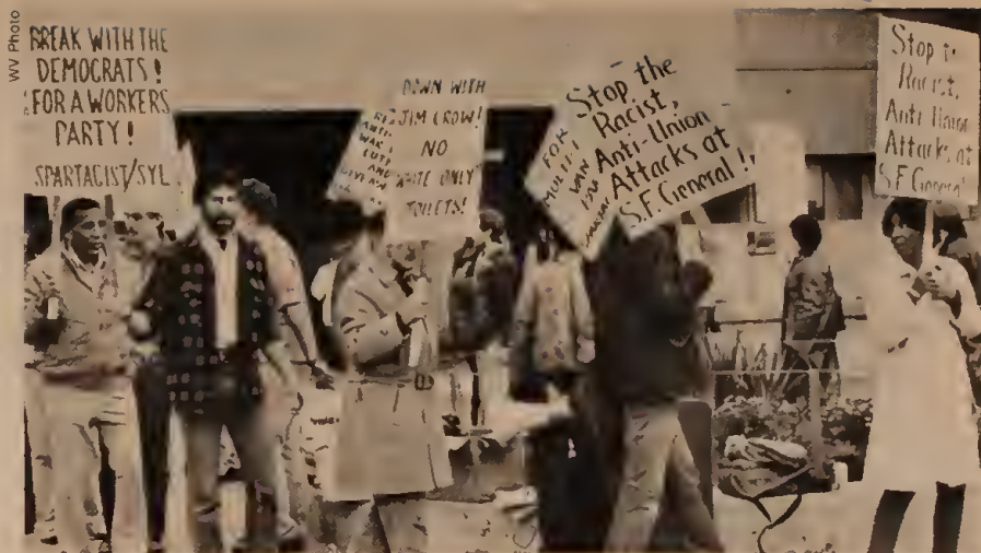
Bay Area Labor Black League for Social Defense built demonstration against racist segregation of workforce at San Francisco General Hospital, December 1985.

laboration must combat the idea that class struggle is the alternative—that with the American bourgeoisie embarrassed and divided, now is the time for a union offensive to "take back the givebacks," now is the time when powerful mobilizations of integrated labor organizations and minority communities can reverse the rising line of racist violence. What are the obstacles to such a fightback? Primarily, a labor "leadership" which has shackled labor's power to the bosses (and the Democrats), and would rather go under than rock the boat, particularly at an unstable conjuncture like the present. In the absence of major social struggles, certainly many black workers and others targeted by Reagan reaction are going to do what Jesse Jackson tells them to do next election day, and not what we tell them. Yet we suspect most of these people are a lot less "fired up" about the