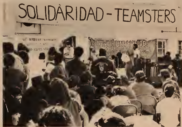
Watsonville cannery workers join Salinas strikers at October 4 rally.

A recent farm workers strike against the Jack T. Baillie company—a grower/shipper that slashed wages and benefits at its Salinas and Bakersfield farms—