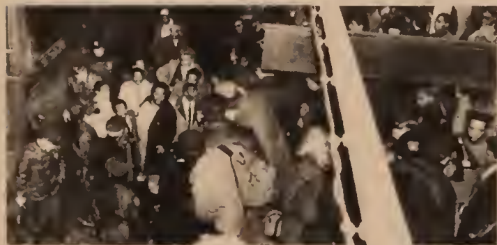
Borough Hall, Brooklyn, subway station shut down at rush hour by black protesters' "Day of Outrage" on December 21.

While the jury was out in the Howard Beach case, the Amsterdam News (19 December 1987) ran a front-page story, "Klans Planning Queens Big Cross-Burning Rally." It reported plans by the Ku Klux Klan to light a 70-foot-high electric cross in front of a predominantly black housing project in Astoria, Queens on a weekend or holiday in the next month. According to the article, "exalted cyclops" Hank Erich Schmidt of the White Knights of the Ku Klux Klan is planning to parade in full Klan regalia: "It's gonna be another Greensboro. I mean just imagine how those Blacks are gonna react when they see us on their front lawn." In November 1979, a KKK/Nazi death squad, abetted by the feds and local police, carried out a broad daylight attack on an anti-Klan rally at a black housing project in Greensboro, North Carolina, leaving five blacks, leftists and labor organizers dead. The Klan thinks that in Koch's New York, the time is ripe to strike again.