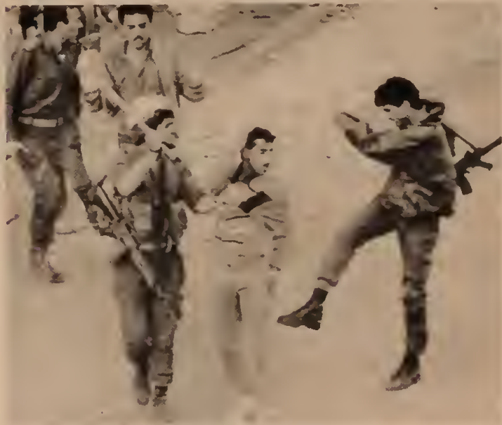
Israeli soldiers club and kick unarmed Palestinian youth near Shifa Hospital in Gaza Strip. Soldiers fired into crowd, killing at least four.

It is not only rabid right-wing militarists or outright fascists like Meir Kahane who are pushing forced population transfers and expulsions of Palestinian Arabs from the Occupied Territories. The 1947-48 War of Independence was in large measure aimed at driving out the indigenous Arab populations through the sort of mass terror exemplified by Begin/Shamir's massacre of the Arab community of Deir Yassin. For years successive Israeli regimes have allowed or encouraged scores of fortified settlements to spring up in the West Bank (and to a lesser extent in the barren Gaza Strip). Even "liberal" Zionists today call the West Bank by its Biblical name, Judea and Samaria, accepting the "created fact"