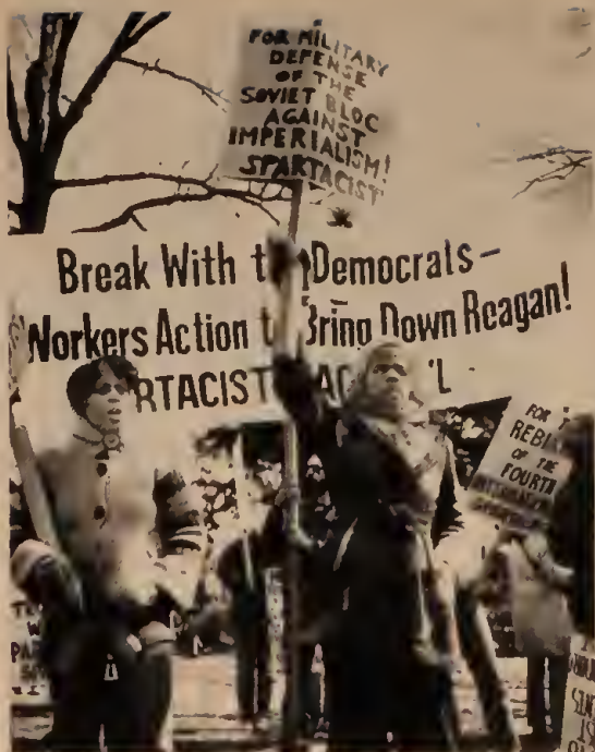
Spartacists at 27 March 1982 rally in Washington call for leftist military victory in El Salvador, defense of Soviet Union.

The only reason the post-1972 period was an exception was the "Vietnam syndrome," popular revulsion against U.S. militarism produced by the long, losing colonial war against the Vietnamese people, whose victory won with enormous sacrifice provided a breathing space for the Soviets to achieve rough nuclear parity with the Americans. And the "rivalry" between the United States and the Soviet Union is a struggle between irreconcilable class interests and social systems. It is axiomatic for