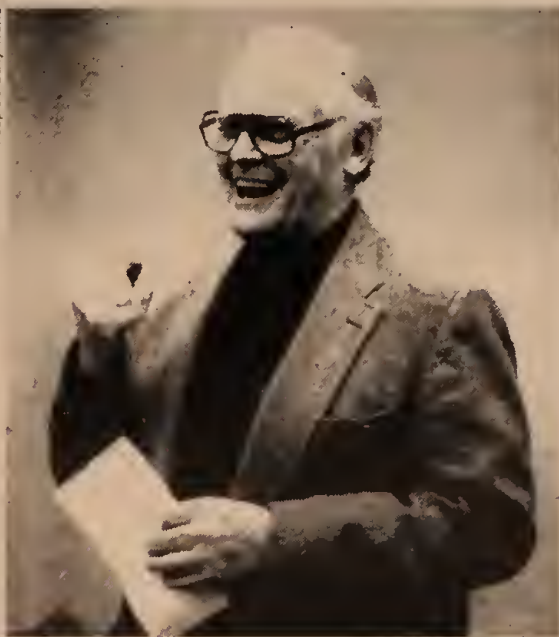
American Communist Party leader Gus Hall.