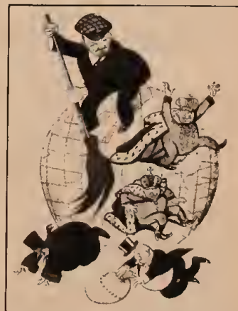
In 1920 Soviet poster Lenin sweeps away capitalists, royalty and clerical reaction. Barnes dumps Marxist classics into trash bin.

It is Barnes' SWP which is destined for the dustbin of history, not the revolutionary works of Marx, Lenin and Trotsky. To those archival-minded comrades still in and around the SWP, we repeat with added urgency our earlier appeal, "Preserve the Trotskyist Heritage!" ( WV No. 321, 14 January