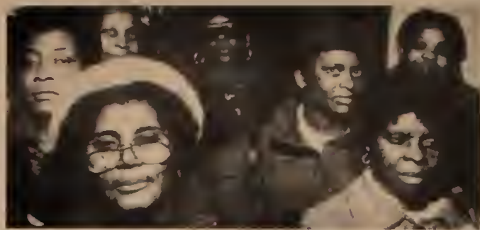
Copley Plaza room attendants stand up to racist hotel bosses.

In order to take care of the 393 rooms, the maids are forced to clean at least 16 bathrooms per shift. To have to do this on hands and knees was backbreaking, unsanitary, dangerous and gratuitously insulting. A 42-year-old Jamaican maid called it cruel and demeaning, especially when guests are in the room. As Dominick Bozzotto, president of Local 26 of the Hotel and Restaurant Workers Union, which