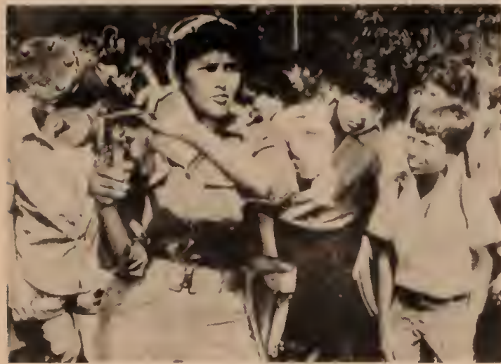
Nicaraguan Sandinista woman soldier demonstrates Soviet-made SAM-7 missile launcher to students in Managua.

Homeless in capitalist America: protester in Washington, D.C. during summit.