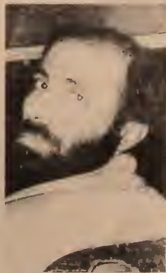
Mordechai Vanunu faces death penalty for courageously exposing Israel's nuclear arsenal.

The international Spartaist tendency and the Partisan Defense Committee have joined in the international outcry over the victimization of Vanunu and have sought to publicize his case internationally. In the U.S. and Canada, the PDC has collected 600 signatures on a petition sponsored by the Mordechai Vanunu Defense Committee. Raise this issue in your unions, civil rights and civil liberties organizations, now! Send your protests demanding Vanunu's freedom to: Embassy of Israel, 3514 International Drive NW, Washington, D.C. 20008. Send contributions and messages of support to: Mordechai Vanunu Legal Defense Fund, P.O. Box 45005, Somerville, MA 02145.