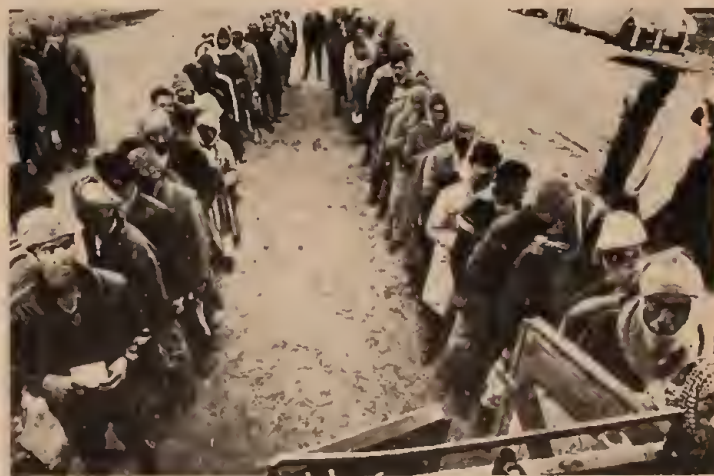
Israel's Gaza Strip bantustan: Superexploited Palestinian workers line up at "slave market" to be transported into Israel.

Wedded to tailing nationalism and the futile search for a bourgeois-democratic solution, the Rakah si-