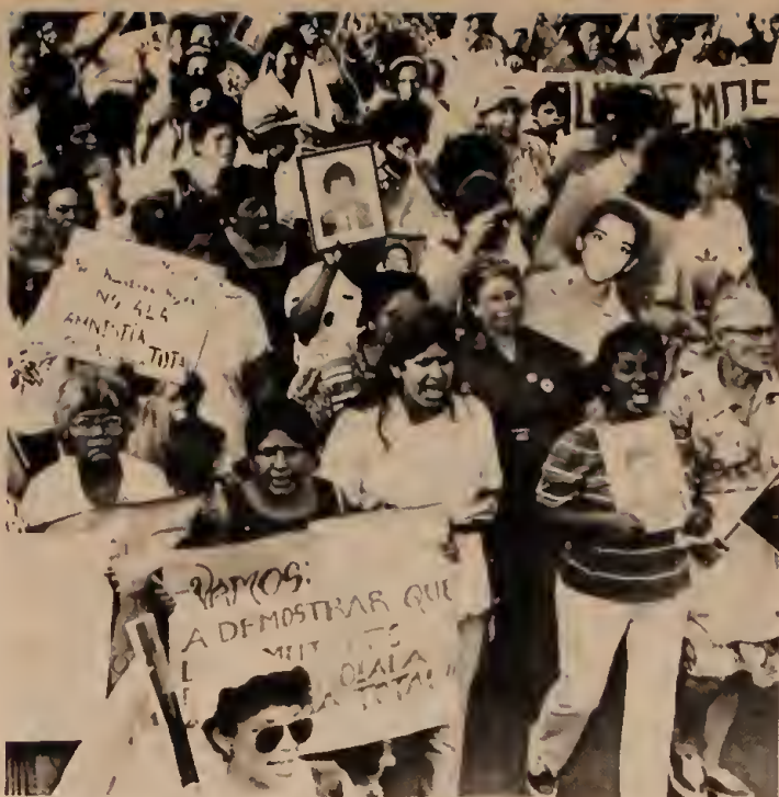
Nicaraguan women march in Managua last fall against amnesty for imprisoned National Guardsmen and contras. Many carry pictures of their children killed by Somoza's butchers and Reagan's terrorists.

So the war goes on and on, and now that "the drums of peace" are beating, the warmasters in Washington have sharply escalated the killing. But now