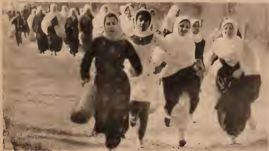
Palestinian women, under Israeli starvation siege of Gaza camps, dash to buy food.