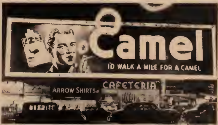
"Health fascism" with a vicious twist: they turn commercial planes into flying collars, but won't let you have a last smoke.

governor Deukmejian, who approved the anti-smoking bill, meanwhile succeeded in his yearlong attempt to gut already minimal job safety inspection of workplaces by slashing the state