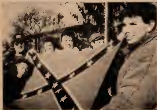
"Up South": Racist punks in Bensonhurst, NY threaten civil rights marchers with Confederate flag and chants of "Bring back slavery!"

14 April 1865—After victory in the Civil War the original Union flag is raised again over Fort Sumter.