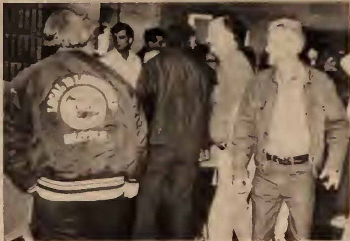
Militant longshoremen stream into strike meeting at Tacoma Dome, January 14.

But the 3,800 longshoremen who gathered at the Tacoma Dome were in no mood for more concessions. Arriving in a blinding rainstorm, longshoremen snapped up copies of the Workers Vanguard supplement "Labor's Gotta Play Hardball to Win"; over 450 WV 's and supplements were sold and distributed as workers streamed into the Dome. They knew they had the power to