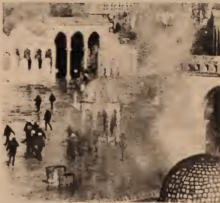
Clouds of tear gas pour over Al Aksa mosque in Old City of Jerusalem as Israeli police beat Arabs, desecrate Muslim shrine.

On January 19, Rabin announced a "new" policy of "force, might, beatings." For years the border police have routinely broken into homes to beat Palestinians; the Shin Bet secret police routinely hang people by their hands