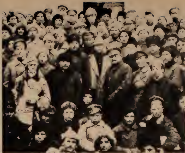
Bolshevik leaders Lenin and Trotsky stand among soldiers sent to suppress Kronstadt mutiny in March 1921. War-weariness and economic exhaustion fueled forces of counterrevolution.

"Communist rule has reduced all of Russia to unprecedented poverty, hunger, cold, and other privations. The factories and mills are closed, the railways on the verge of breakdown. The countryside has been fleeced to the bone.... The peasants and townfolk have lost all hope for an improvement of their