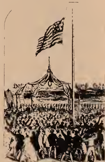
National Park Service

There can be no economic equality nor justice for black people in this capitalist society. As Frederick Douglass said, "Experience demonstrates that there may be a slavery of wages only a little less galling and crushing in its