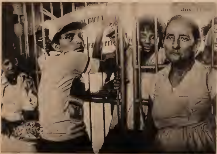
Waiting at train station in Managua. Nicaragua is economically devastated after a decade of war organized and bankrolled by Yankee Imperialism.

"If the United States invaded...he would pick up a gun and stand shoulder to shoulder with the other Nicaraguans against the invaders. But to join the Sandinista Army and fight contras who are Nicaraguans themselves in