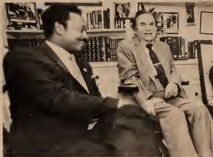
Jesse Jackson woos racist Dixiecrat George Wallace in bid for Democratic Party nomination.

"Pan-Africanism is a despairing strategy, it is a defeatist strategy with regard to resurgent racist reaction in this country, and it is directly counterposed to the program of militant, integrated working-class struggle.... When the Spartacist League initiated several large labor/black mobilizations and stopped the Klan and Nazis from marching in the streets in Detroit in 1979; San Francisco in 1980; 1982 in Washington, D.C., in which 5,000 black workers and youth came out—those important victories showed the way forward, because in this country it's only the program of revolutionary integrationism to fight for the assimilation of blacks in an egalitarian society that actually offers the way forward. And so we say the emancipation of black Africa, no less than the emancipation of blacks in this country, requires a program of proletarian revolution. That program can only be carried out by a multiracial vanguard party that's really a tribune of the people." ■