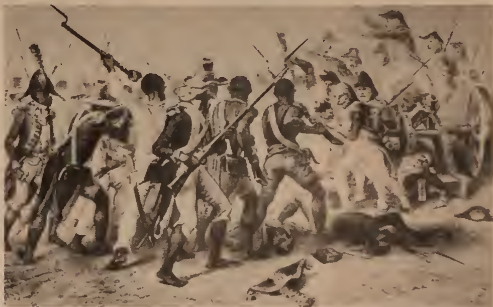
Toussaint L'Ouverture (left), leader of the Haitian Revolution. Black slaves battle white colonial masters in 1791.