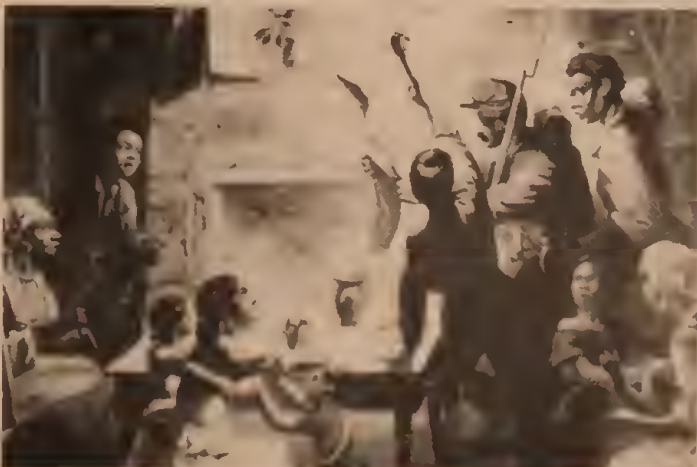
During American Civil War, Union soldier reads Emancipation Proclamation to blacks in South.

Haiti has "taught the world the danger of slavery and the value of liberty," he went on, and "striking for their freedom, they struck for the freedom of every black man in the world." ■