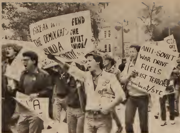
Madison Spartacus Youth Club contingent marches in anti-CIA protest, 29 September 1987.

The American government, under both Democrats and Republicans, aims to maintain the capitalist exploitation and superexploitation of workers and peasants from South Korea to South Africa by Wall Street financiers and multinational corporations. Today the CIA spies on the African National Congress for the white-supremacist regime