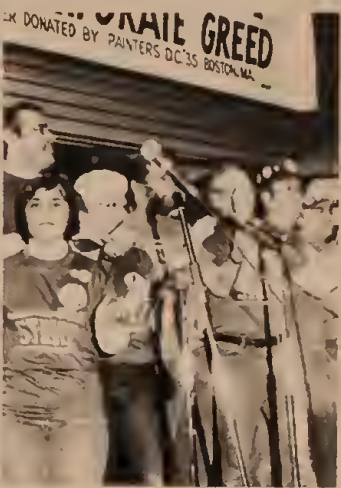
Boston: Striking paper workers at February 19 rally.

The Boston rally was part of a caravan the Jay strikers are taking through the Northeast. But instead of a fight for class-struggle solidarity action like hot-cargoing (refusing to handle) scab paper, the strike has been diverted into writing letters to IP's board of directors and a boycott of Hershey bars and Coca-Cola! These diversions are sponsored by Corporate Campaign