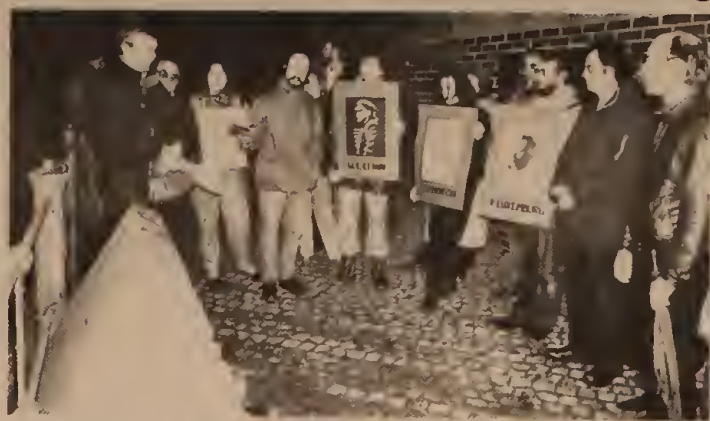
TLD commemoration January 31 at Berlin bridge where Rosa Luxemburg was murdered in 1919.

demonstrated in January for the "Two L's"—leaving out Lenin. As Stalin made Lenin into an icon, usurping his authority to cover the Kremlin's betrayal of the world revolution and the internationalism for which the "Three L's" fought, so the East German and West German Stalinists try to portray Luxemburg and Liebknecht as nationalists, parliamentarians and petty-bourgeois pacifists. Thus in West Berlin the march was obscenely dominated by the Social Democracy, who bear responsibility for