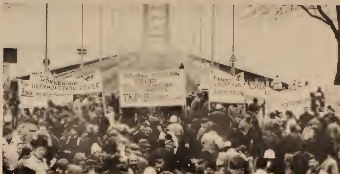
German and Turkish steel workers block Rheinhausen bridge. Ruhr region was paralyzed by near-general strike last December.

Unrest flared in the Ruhr when news was "leaked" on November 27 that the Krupp steel trust was going to close its Rheinhausen plant, one of the most modern in Europe. For two weeks demonstrations and strikes spread throughout the Ruhr, culminating in a near-general strike that was called for December 10. Rheinhausen was shut