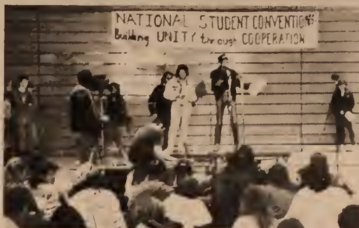
Students pack gym at Rutgers, looking for radical solution to social injustice, but conference organizers could provide only liberal confusion and anti-communist exclusionism.

In the end, no new national student organization was formed because the convention organizers, paralyzed by white liberalism and black nationalist guilt-tripping, blocked discussion of the substantive political issues that