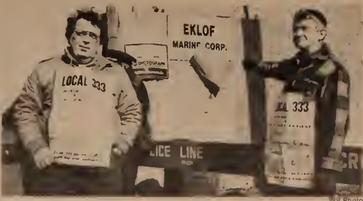
ILA picketers in Staten Island.

The employers have recruited scabs in ports from New Orleans to Boston to man the 250 tugs, barges and small tankers. A union spokesman told the New Jersey Record (17 February), "Our men are up in arms. They catch a scab and he's gone." But Local 333 is fighting alone. As scab tugmen and docking pilots bring in the ships, ILA longshoremen are working the cargo. NYC mayor Koch, who got Jimmy Carter to call in the Coast Guard to run scab sanitation barges in 1979, has over 100 cops, including mounted cops, at Staten Island picket sites. Already a half-