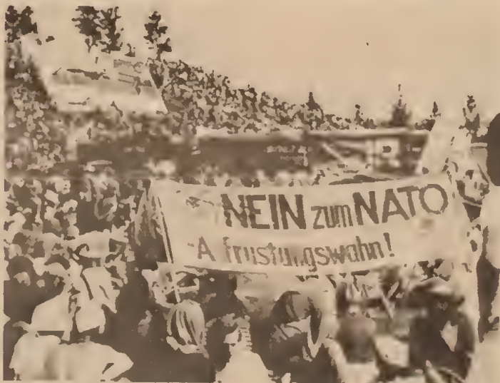
West German "peace" movement serves as left cover for resurgent German nationalism. Der Spiegel