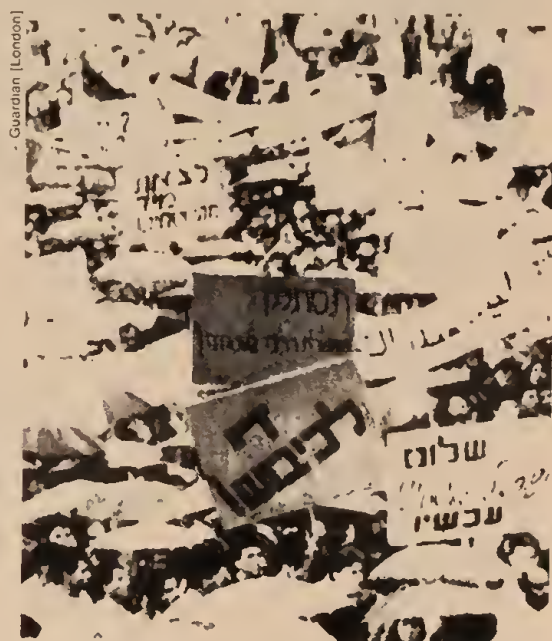
Thousands of Arabs and Jews demonstrate in Haifa against Israeli army terror.

Under the leadership of an internationalist Bolshevik party, the Palestinian workers can be the catalyst for socialist revolution throughout the region. The reactionary Zionist consensus among the Hebrew people must be shattered if they are to escape the death-