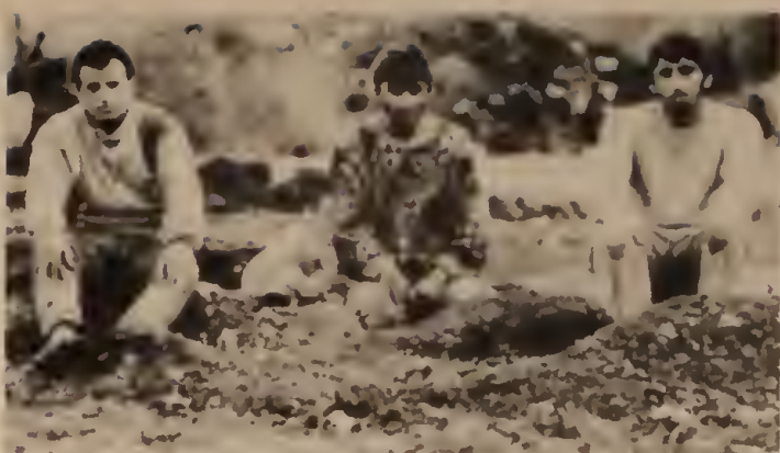
Palestinian youths who were buried alive by Israeli soldiers—townspeople dug them out.

A journalist who visited Gaza in December, and was himself wounded by Israeli gunfire, captured both the defiance of the Palestinians and the bloodlust of the Israeli troops in one of the incidents he witnessed: "The soldiers began shooting at a young man standing on the roof of the [hospital's] eastern building.... The young man tried to escape, then saw a soldier in front of him. He stopped running, stood facing the soldier, opened his shirt, exposed his