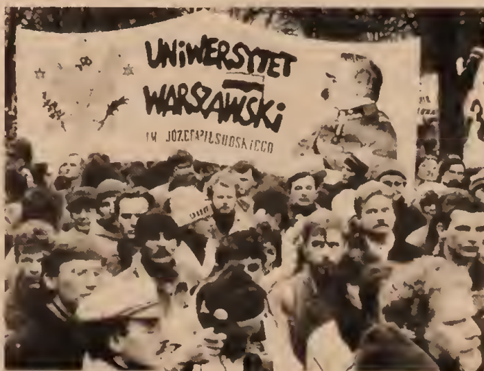
Solidarność student protest hails fascistic dictator Pilsudski, marches under eagle-and-cross of anti-Semitic Polish nationalism.