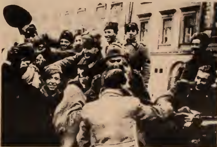
Polish people greet Red Army in 1945. Six hundred thousand Soviet soldiers died to liberate Poland from Nazi tyranny.

But, Zionist accounts to the contrary, the Polish population was not one anti-Semitic mass. Emmanuel Ringelblum, the noted chronicler of the Warsaw Ghetto, observed in his Polish-Jewish Relations During the Second World War (written shortly before his murder by the Nazis in 1944) that while