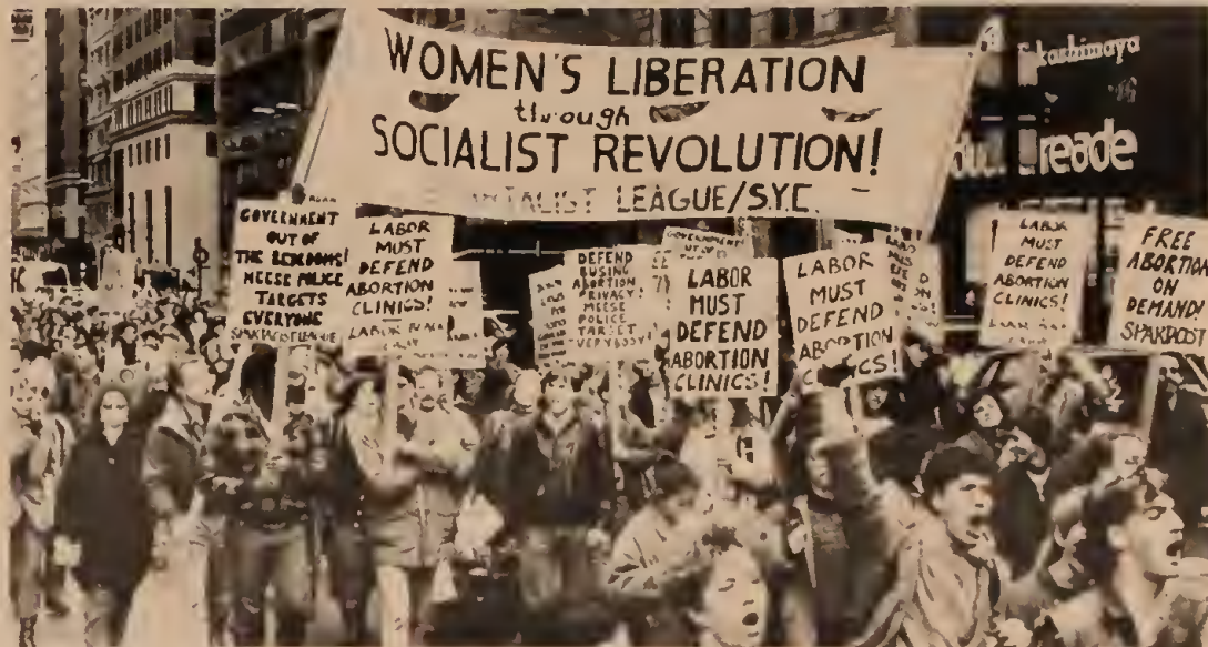
Spartacist League contingent in April 29 protest against attacks on abortion clinics.