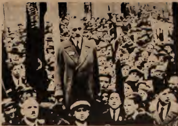
Jewish Socialist Bund leader Henryk Erlich addresses May Day march in Warsaw, 1933.

Nor, despite the Zionists' subsequent attempts to claim the Warsaw Ghetto uprising as their own, were appeals to Western Zionist leaders much more successful. It is a well-documented fact that British and American Zionist leaders refused to campaign openly for allowing free entry to Jewish refugees from the Nazi terror, or for Allied military action against the extermination camps. In a January 1943 appeal to American Jewish leaders for assistance, the Polish Jews bitterly observed: "Brothers! The