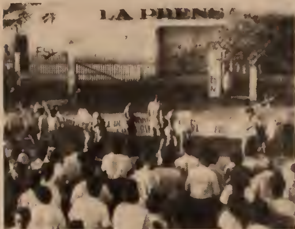
New York Times

The current Nicaraguan strikes are not Kronstadt but closer to the El Teniente strike in Allende's Chile. In May-June of 1973, workers at the country's largest mine fought against the "Popular Unity" government to retain their sliding scale of wages, a protection against inflation. Allende, like Ortega, accused the strikers of being "economistic." Yet while the popular-front left denounced the El Teniente strikers, we Trotskyists called to defend their strike. Eventually, however, as Allende's "pop-