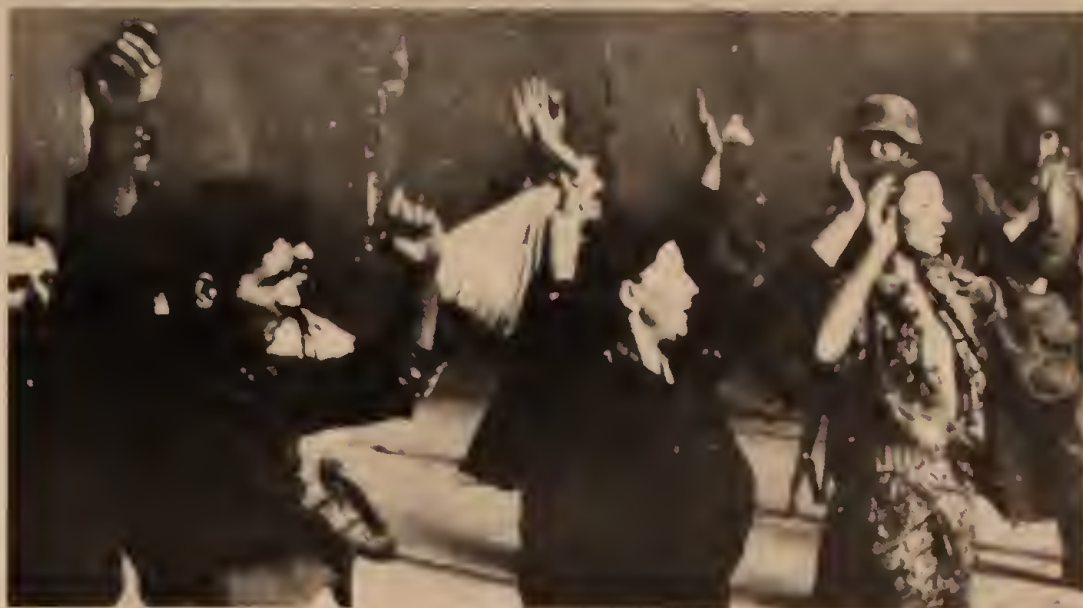
Defiant fighters of the Warsaw Ghetto, rounded up by Hitler's savage SS.

For years, the Zionists, whose butchery of Palestinian Arabs emulates the Nazi terror, have tried to claim a monopoly on this anti-Nazi uprising. Now Solidarność tries to paint it in the colors of Polish nationalism. Amid all this filthy hypocrisy, the most moving tribute came when several hundred Arab students laid a wreath at the Warsaw Ghetto monument on April 19 and denounced "the fascist methods used by the Zionists against the Palestinian nation." Many of the Warsaw Ghetto fighters were Communists and pro-socialist Zionists who saw their final act as part of the international struggle against Nazi tyranny and looked in particular to the Red Army as their ally and inspiration. In fact, this "most Polish" uprising was contemptuously repudiated at the time by the anti-Communist and anti-Semitic Polish Home Army, which Solidarność right-