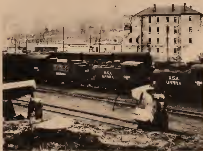
Belgrade, December 1946: Locomotives obtained by Yugoslavia from UN Relief and Rehabilitation Administration were vital to rehabilitate transport.

My father used to recite with glee the story of how he informed the partisan delegation in the U.S. that the U.S. Army was selling all these surplus jeeps dirt cheap in Italy. Yugoslavia had nothing at the time. I don't remember now if my father just informed the Yugoslavs or also told them to request UNRRA