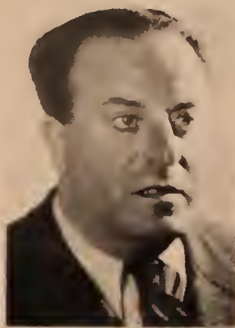
Stalin murdered Ignace Reiss, heroic Soviet spy who embraced Trotsky's Fourth International.