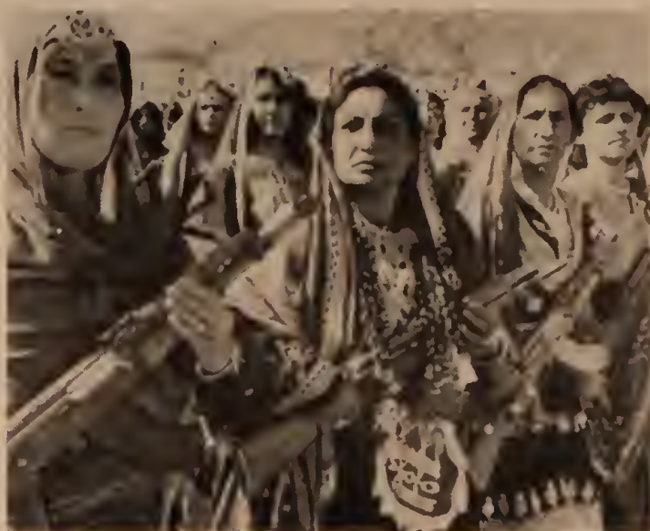
Afghan women armed with Soviet AK-47s march on tenth anniversary of "April Revolution" in Kabul.