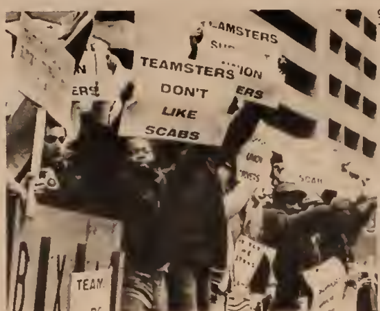
Teamster power: supporters of Greyhound strike on flatbed trucks, Philadelphia, 1983.

These are the lessons of the victorious, hard-fought Minneapolis Teamsters general strike of 1934, which was led by the revolutionary Trotskyists and laid the basis for the over-the-road organizing drives which transformed the IBT into a powerful industrial union. To win, this is the kind of a class-struggle leadership that must be forged, to lead labor and all the oppressed in a fight for a workers government that will end the boom-bust cycle of the capitalist profit system for good. ■