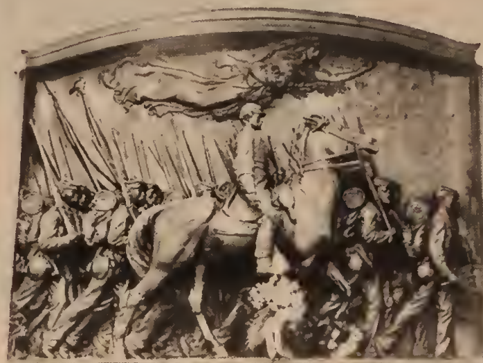
Women and Revolution

In World War II, the class interest of workers of all nationalities was to defend the Soviet Union, homeland of the 1917 October Revolution, and it was the Soviet Red Army which crushed Nazi Germany. The American ruling class tried to sucker working people into supporting the bosses' aims with talk of