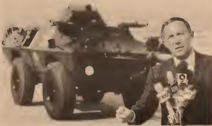
LAPD chief "Choke Hold" Gates and his drug tank.

The real aim of this campaign is to terrorize minorities in the city and further reinforce the bonapartist cops' control over the black and Latino populations. Gates became infamous when his cops killed 16 people, 12 of them black, using