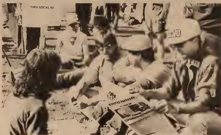
Wide readership of Trotskyist press among Bay Area longshoremen makes CP Stalinists see red.

WV tells the truth: Jesse Jackson and the Democratic Party are enemies of workers and blacks. And WV is the only leftist paper around that openly fights for defense of the USSR against imper-