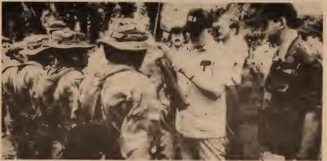
U.S. top cop Edwin Meese unleashes narcs on Bolivian peasants.