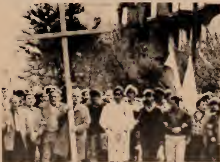
Flanked by cross, Solidarność leader Walesa (second from left) leads small band out of Gdansk shipyard in defeat, May 10.