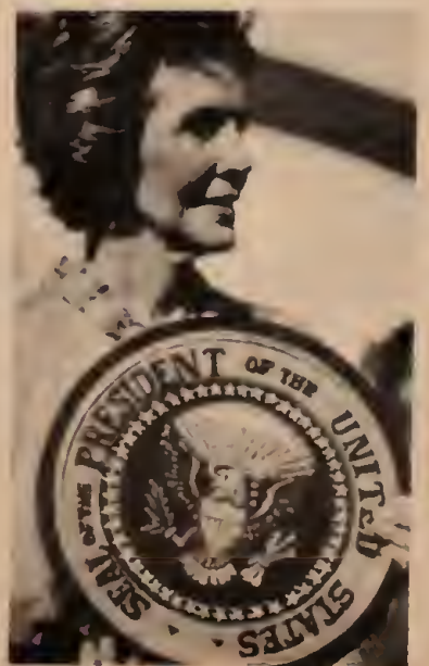
First Lady of Horrorscope.