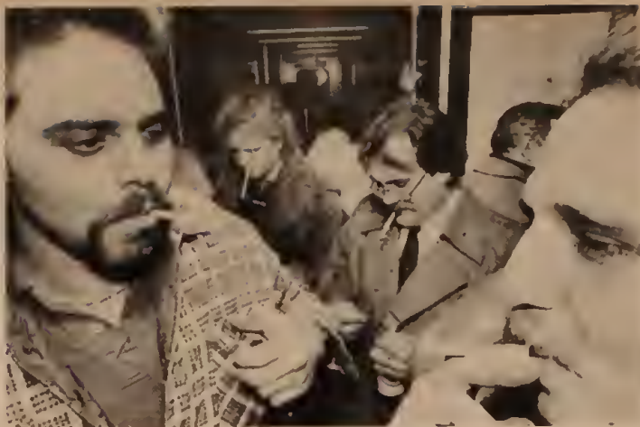
Last smoke on the LIRR; NYC waitress posts smoking ban.

As Peter Berger, a Boston University sociologist, recently noted ( New York Times , 24 April), the furor over "passive