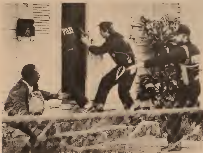
Drug raid in Florida—will smokers be next?

Sociologist Barry Glassner ruefully notes that if the current trend of regulating and regimenting our behavior continues, "we'll have a homogenized population in which everybody will be within the recommended weight ranges, and nobody will smoke anymore, and nobody will drink and everybody will work out" ( New York Times , 7 May). In the end, all that clean living may do zilch for your health. But it will help regiment the population for greater productivity and profits, and make people into excellent cannon fodder for war. And when you're in the trenches, they'll probably start passing out cigarettes again like they did in WW II to keep soldiers alert. ■