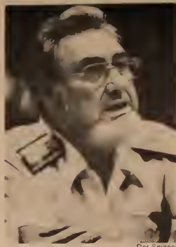
Surgeon General C. Everett Koop fuels anti-smoking hysteria.

On the heels of the Surgeon General's report, municipalities, states and companies began pushing anti-smoking laws and policies. Most were passed and went into effect with barely a whimper. Across the country, cowed smokers have retreated to stairwells, fire escapes or back alleys to enjoy a cigarette. Soon job applications will read: "Are you now or have you ever been a smoker?" The attempt to make smoking into an anti-social activity ominously recalls the