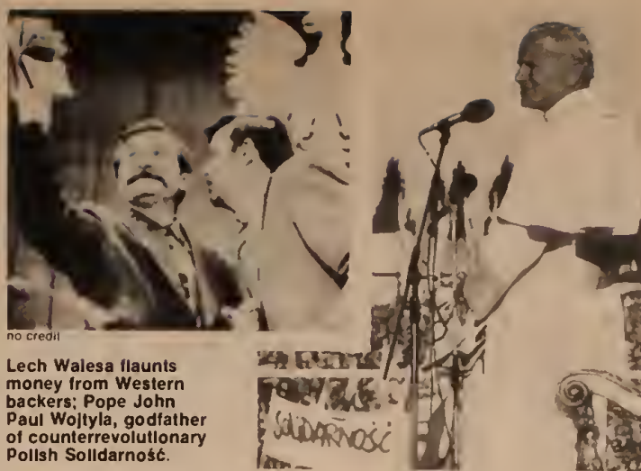
Lech Walesa flaunts money from Western backers; Pope John Paul Wojtyla, godfather of counterrevolutionary Polish Solidarność.