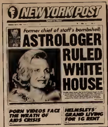
Media has field day with Don Regan revelations, exposing high priestess of Reagan cult (right).

A similar atmosphere of lunacy emanated from Hitler's bunker in the last days of his empire, as William Shirer pointed out in The Rise and Fall of the Third Reich . As bombs were falling and the Red Army was advancing to liberate Berlin, Goebbels "sent for two horoscopes, which were kept in the files of one of Himmler's multitudinous