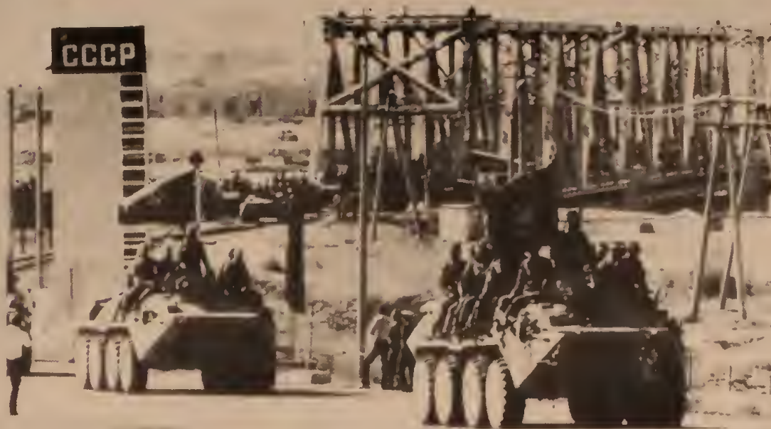
Soviet troops pulling out of Afghanistan. Stalinist bureaucracy ducks internationalist duty, fuels nationalist rivalry among Soviet peoples.

On at least three occasions in the last several months workers have stormed the parliament in Belgrade. Both the rising working-class anger and growing national hostilities were dramatically demonstrated in a rally of 70,000 in the central Serbian town of Kraljevo a few weeks ago. Officially, the rally was to be a Serbian nationalist protest over the exodus of Serbs from the predominantly Albanian region of Kosovo. However, the rally turned into a bitter attack on bureaucratic parasitism. A