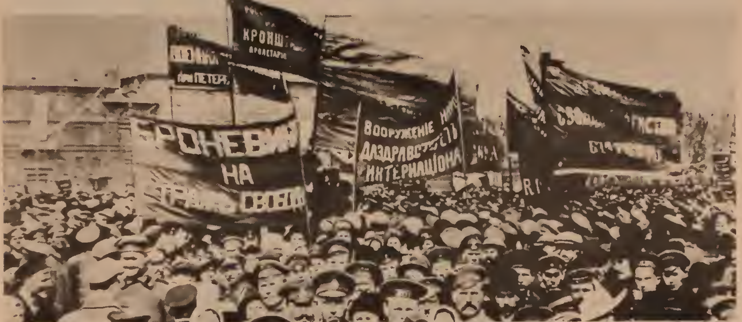
May Day 1917: Revolutionary workers march through Petrograd. Center banner reads: "Arm the People! Long Live the International!"