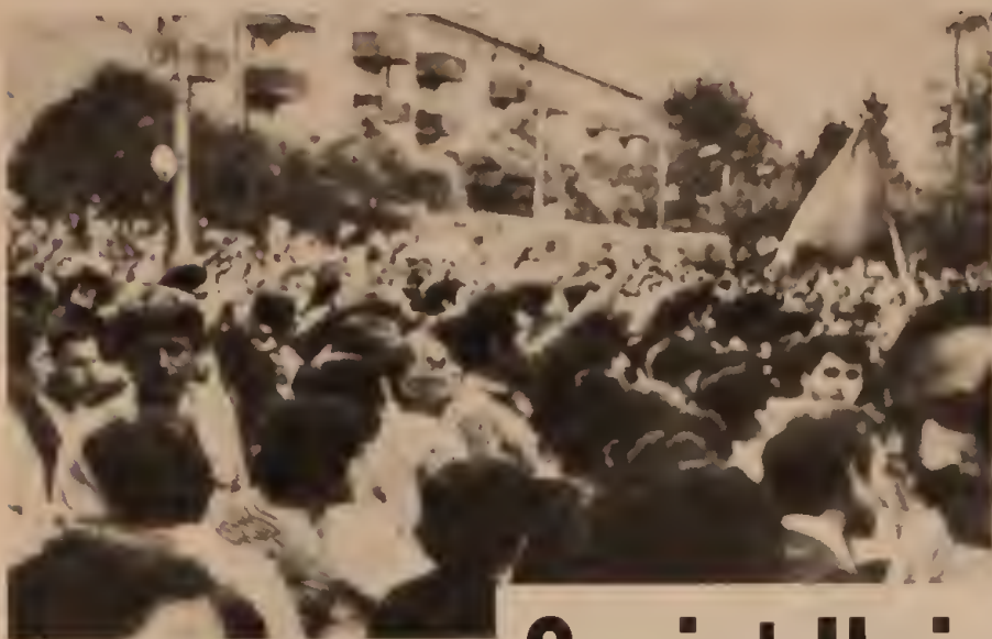
Strikers in Stepanakert demand Armenian control of Nagorno-Karabakh region.