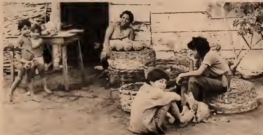
American imperialism's contra war and economic blockade bring misery for Nicaraguan poor.

The nationalist dreams of "non-alignment" simply can't work in a world of two competing economic systems. The only way forward is to complete the revolution by expropriating the capitalists, eliminating the agents of U.S. imperialism in Nicaragua. But Nicaragua alone would be hard pressed to defend itself against the mighty forces of U.S. imperialism. The revolution must be extended to El Salvador, Mexico and on to the U.S. itself. Defend, complete, extend the Nicaraguan Revolution! Defense of Cuba and the USSR begins in Central America. ■