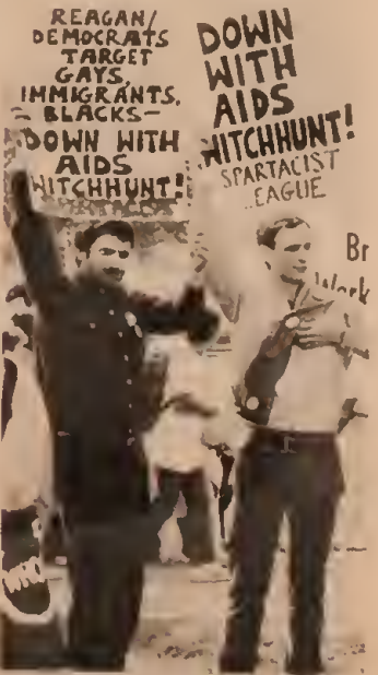
Spartacists at gay rights protest in Washington, D.C., October 1987.

With the '88 election campaign featuring the Democrats and Republicans competing with each other in Bible-thumping, flag-waving bigotry, an important division in the fight against the propositions has emerged. While the