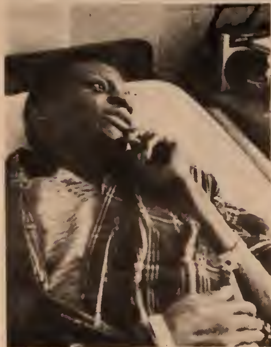
AIDS victims are largest single group of patients at Harlem Hospital, where city cutbacks slashed number of beds almost by half.