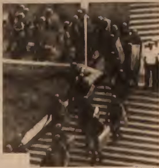
Independent Police move against nationalist demonstration in Yerevan, capital of Armenia.