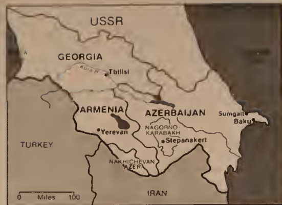
National conflict erupts in Soviet Caucasus (at right) over demands for transfer of Nagorno-Karabakh Autonomous Region from the Azerbaijani to the Armenian republic.

themselves from an invading Turkish army, in late 1920 the Dashnaks negotiated an agreement with the Bolsheviks which de facto incorporated Armenia into the Soviet state.