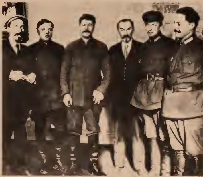
Lenin's last struggle was directed against Stalin (third from left) and his lieutenant Ordzhonikidze (at right), over their Great Russian chauvinism against Georgian Communists. Photo from 1925.

With the collapse of Kaiser Wilhelm's Germany in November 1918, the