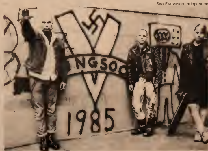
Degenerate products of capitalist decay, skinheads are deadly recruits for Nazi terrorists like Metzger (right).