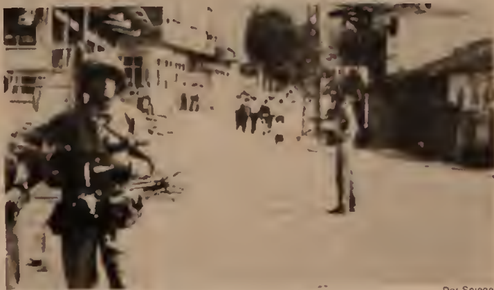
Turkish military seizes Black Sea town of Fatsa, July 1980.

Now Turgut Ozal's bloody regime boasts of giving refuge to thousands of Kurds who recently fled from Iraq, while Turkey continues a genocidal war against its own Kurdish minority. Kurdish refugees are immediately disarmed, kept under close guard and treated as dangerous potential enemies. Contact between Turkish Kurds and the refugees is prohibited, the government having turned down all requests by Turkey's Kurds to feed and house their