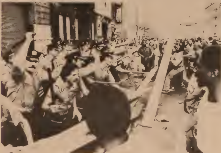
Koch's cossacks bust heads of Harlem protesters fighting against closing of Sydenham Hospital, 1980.

As horrifying as the official AIDS "body count" statistics are, they don't even begin to reveal the true extent of