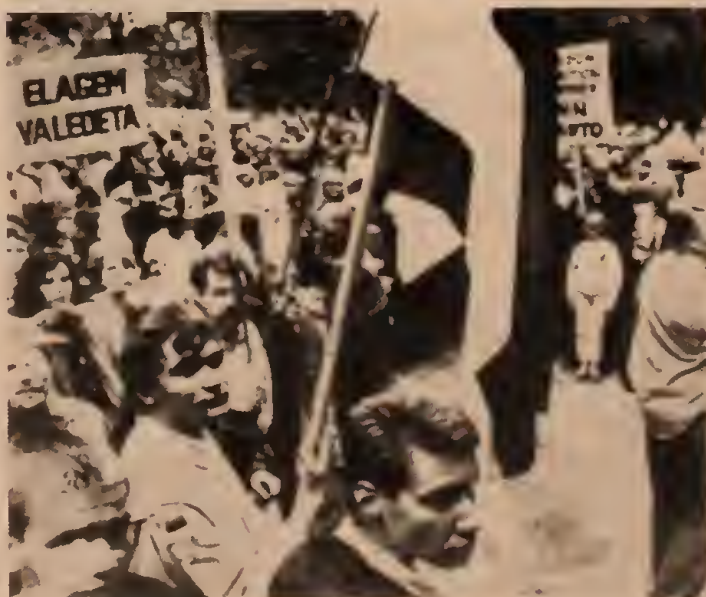
AFP Tallinn, Estonia: Demonstrators march under flag of "independent" Interwar republic, a bastion of anti-Semitism and anti-Communism.