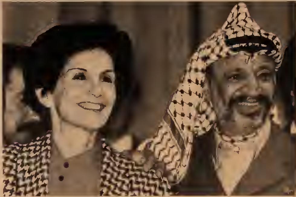
Yasir Arafat meets with representatives of American Jewish groups in Stockholm in December.

point. Fortress Israel is still central to American designs to forge an anti-Soviet "strategic consensus" in the Near East, and any American administration intent on breaking with Israel would have to contend with the sizable and potent Zionist lobby in the U.S. But the yearlong Palestinian uprising in the Occupied Territories has brought to a