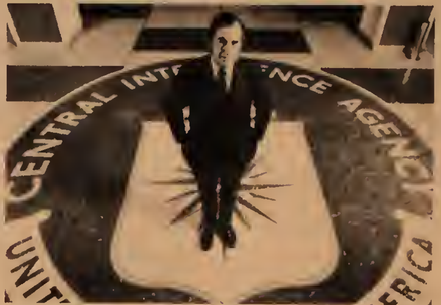
George Bush, former CIA director, at the center of murder and mayhem.

The Congressional "investigation" became a forum for contra terror starring continued on page 7