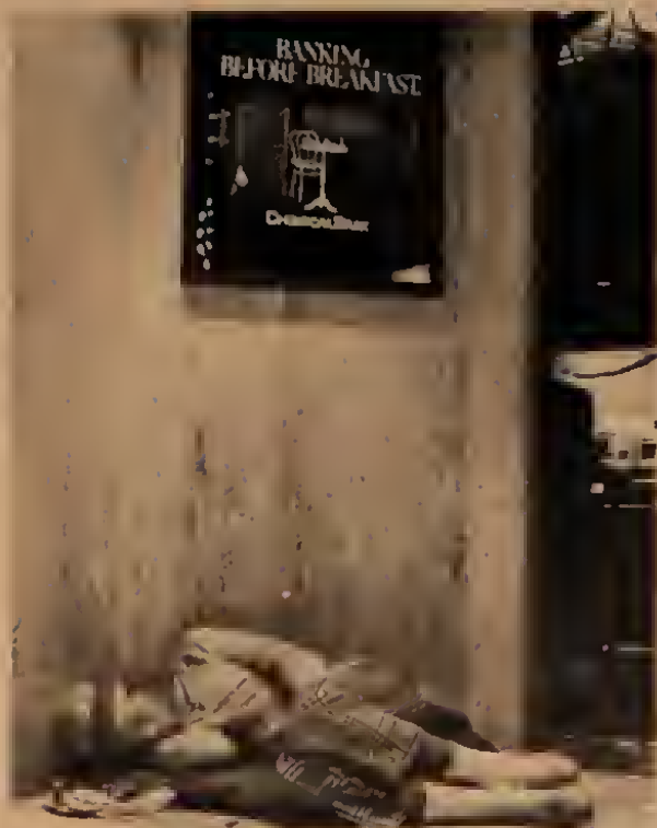
Christmas in NYC: homeless sleep in Grand Central Station (left). Spartacists at December 18 rally for the homeless which brought out 20,000.