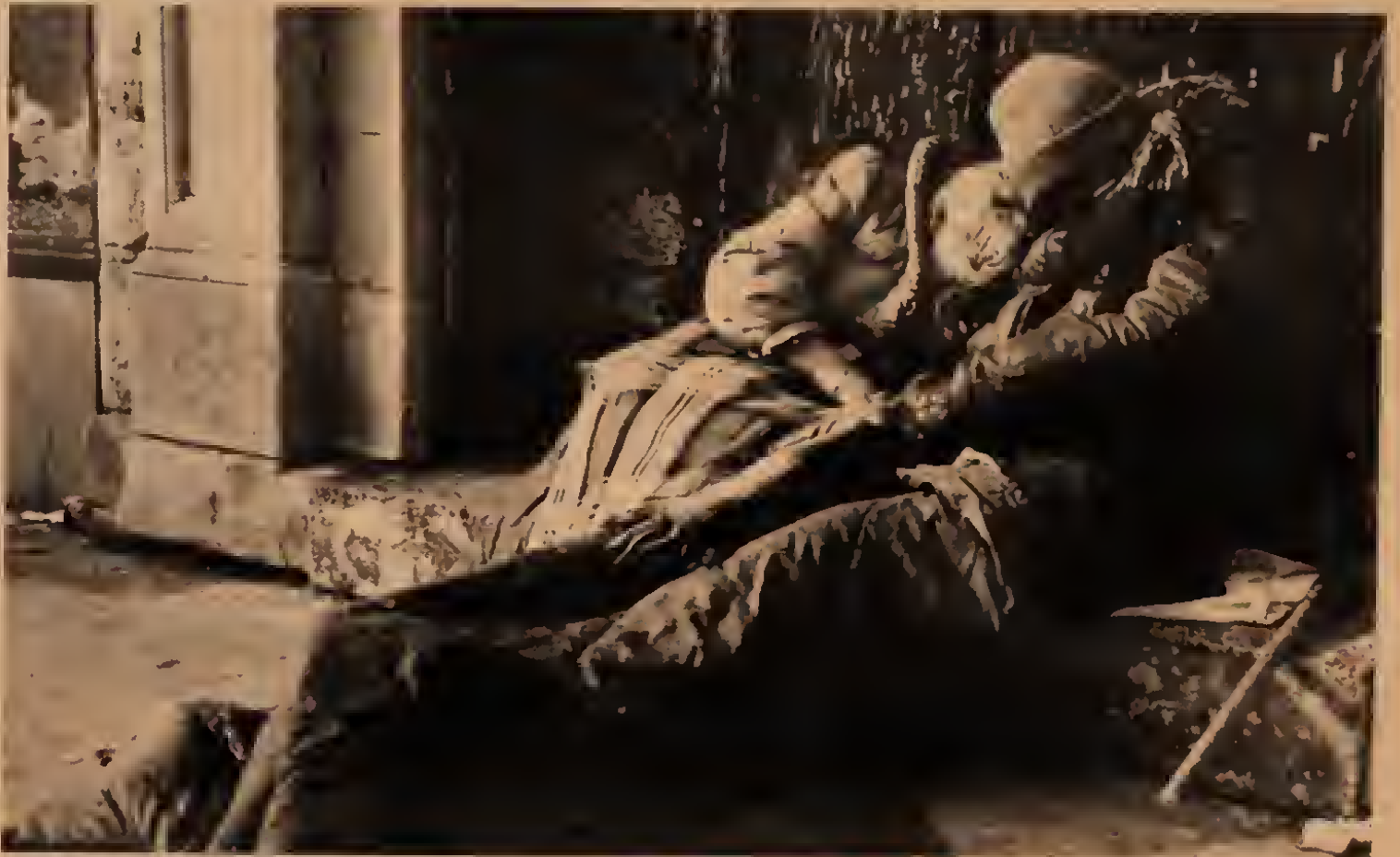
Couple in Chicago huddle in doorway against freezing cold.