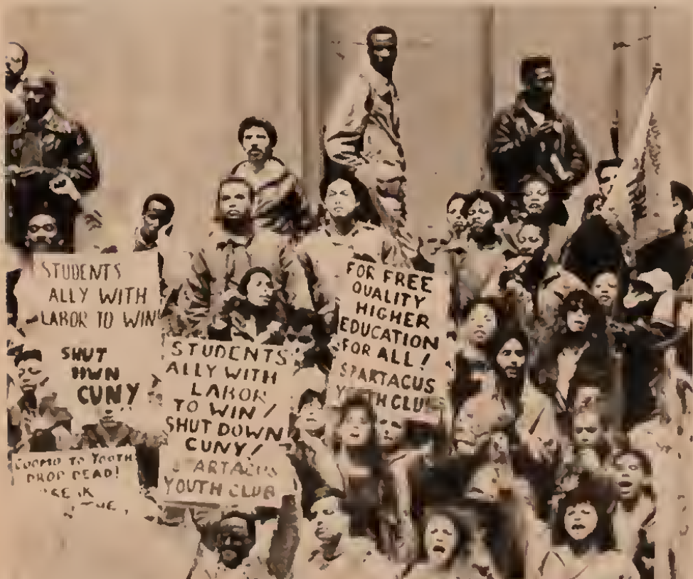
Spartacus Youth Club contingent at May 2 protest.

Republicans in gutting the last minimal measures of social welfare in this country. Even a basic thing like the right to an education requires a revolutionary fight. To win, students must ally with the integrated labor movement because labor has social power. The working people built the wealth of this country and it is their labor that keeps it running. What we need is a class-struggle workers party, one that doesn't "respect" the property values of the bourgeoisie, a party that says to the exploited and oppressed: we want more, we want all of it, it ought to be ours, so take it. And when we have the wealth of this country we can begin to build a planned, socialist, egalitarian society on an international scale. Winning students and youth to this struggle is what the Trotskyist Spartacus Youth Club is all about. Join us! ■