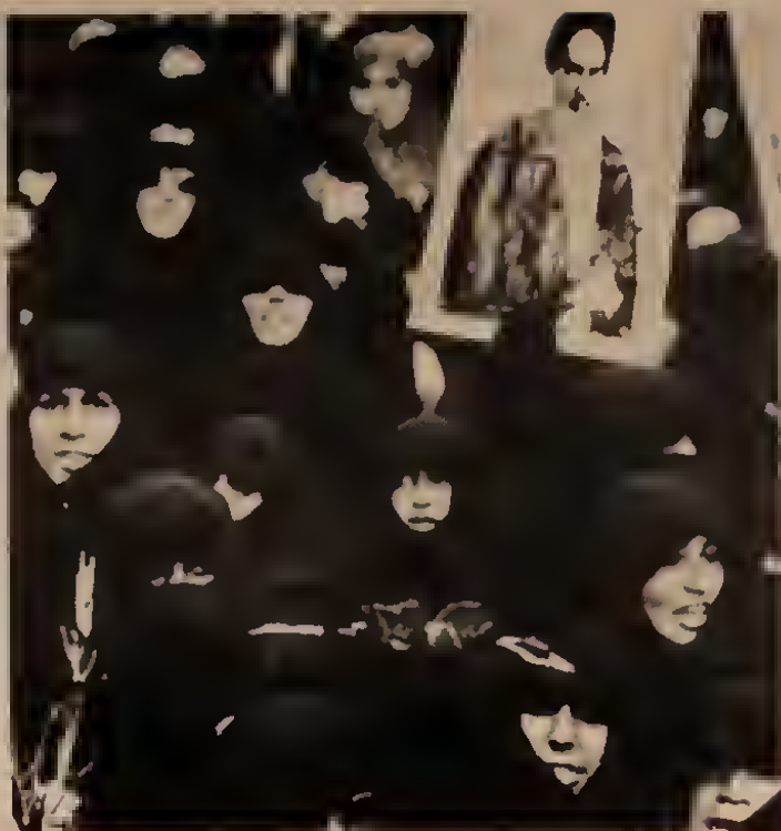
Women carry portrait of Khomeini in anti-shah demonstration, 1978. Fake-leftists claimed the veil was a "symbol of resistance," yet chador perpetuates oppression and social isolation of women.

Another area in which the government sought to institute some wide-ranging reforms was the area of polygamy, where they sought to ban it. There was also an outcry over that, mainly again from the men. At the same time, the government fought to encourage the education and employment of women. Education was very important, given that 99 percent of Afghan women were illiterate at the time. So what the