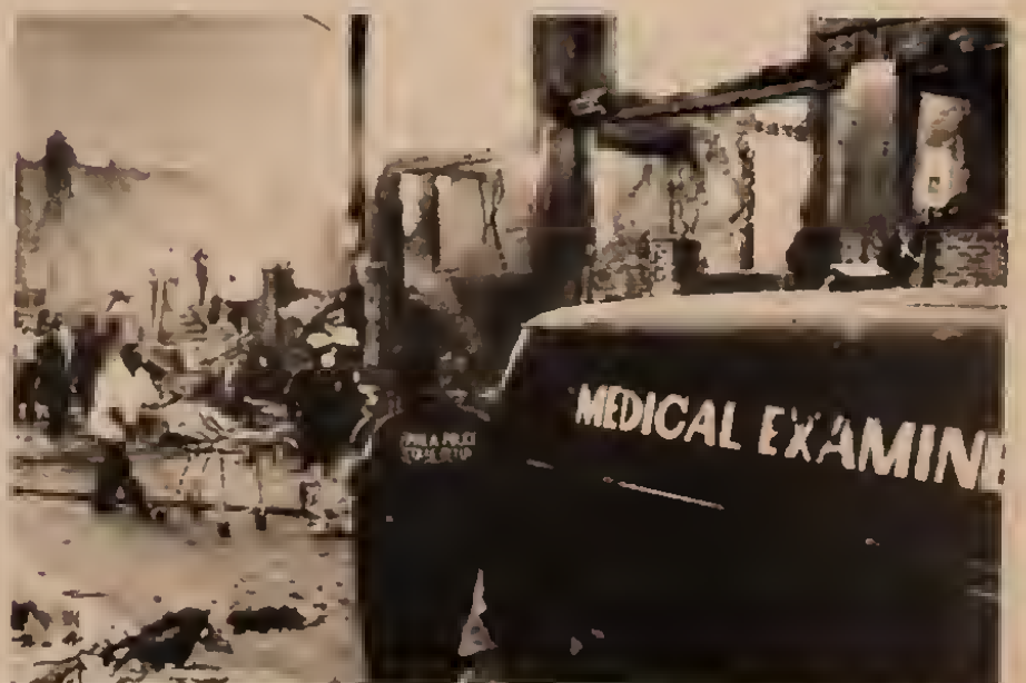
Bodies of eleven members of MOVE commune, including five children, incinerated in police assault, are pulled from burned-out building.

From Death Row, this is Mumia Abu-Jamal.