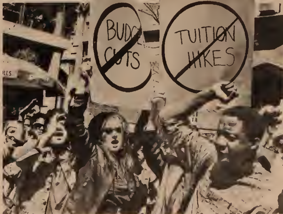
Hunter College students participate in largest, most integrated student protests in decades.

"...the rampant homelessness... on all the CUNY campuses. There are thousands of CUNY students who, through a single stroke of ill fortune, are living in their student lounges or club rooms while taking showers in the gym locker rooms. The conservative estimate is 4,500 homeless college students on CUNY campuses. Also of concern in our takeovers is the $110 million in grants and endowments to private universities made by the State, while