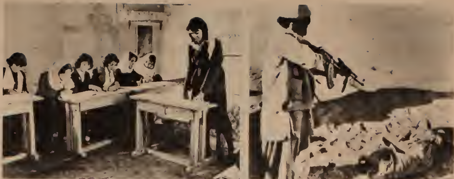
Women learn to read and write in literacy campaign by left-nationalist Kabul government. CIA-backed reactionaries rose up against women's rights: mujahedin cutthroat shoots schoolteacher (right).

Precisely for this reason and because military defense of the Soviet workers state was posed, the international Spartacist tendency said at the time of the intervention: Hail Red Army in Afghanistan! Soviet troops prevented a massacre of all those who want to bring