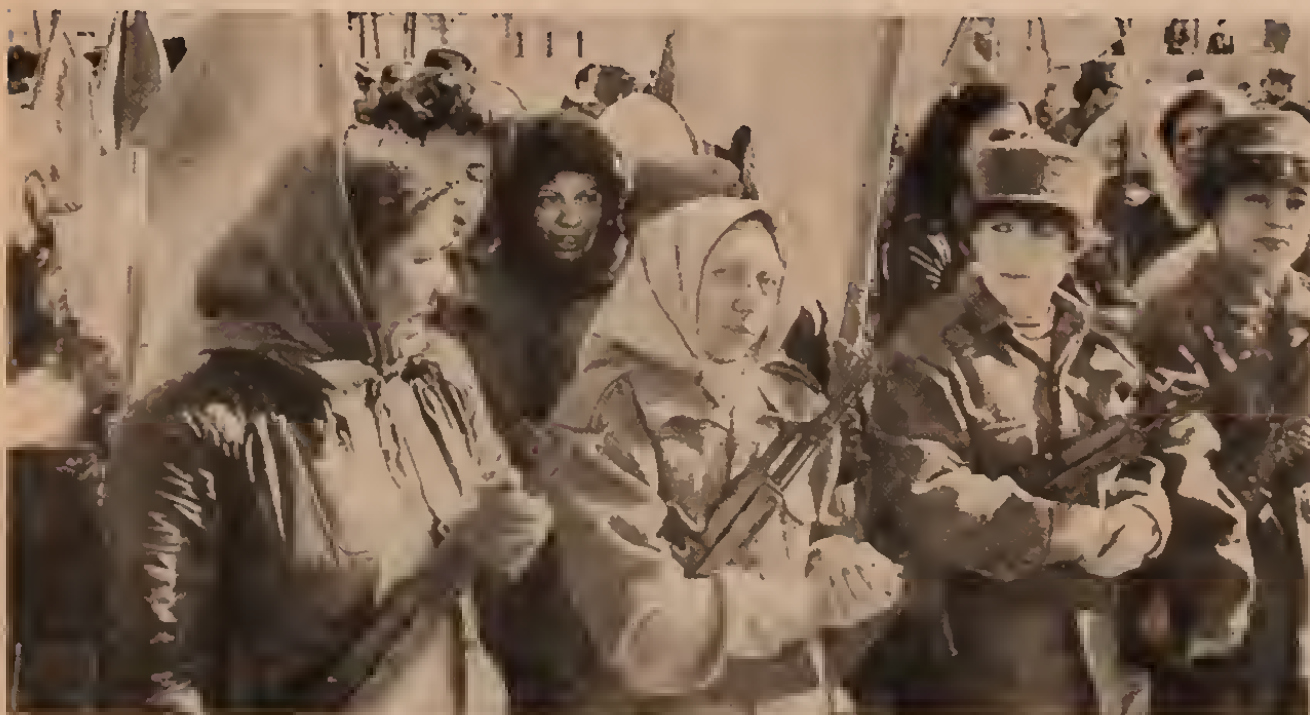
Afghan women, determined to defend their social emancipation, volunteered for women's militia organized by Kabul government.