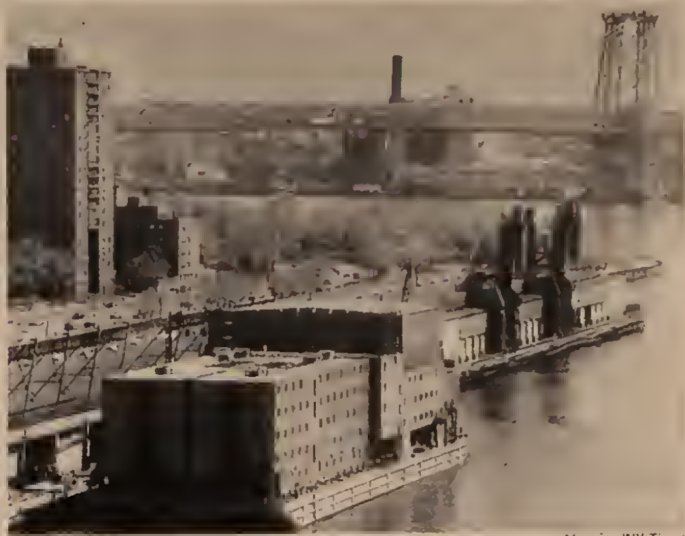
U.S. has highest incarceration rate in world, except for South Africa; now they want to dump prisoners onto barges in NYC's East River.

kind of crime is that the state says, "Give us more power. We need more police." That's what the politicians say, that's what the media wants. But with more police and more crime, they get a problem with what these days is called the "ecology of crime and punishment." More cops go out and make more arrests, but the system can't handle them all. Processing is a mess, prisons are overloaded. The U.S. has the highest incarceration rate in the world, with the exception of South Africa. Educators point out that, as it is, we spend more on