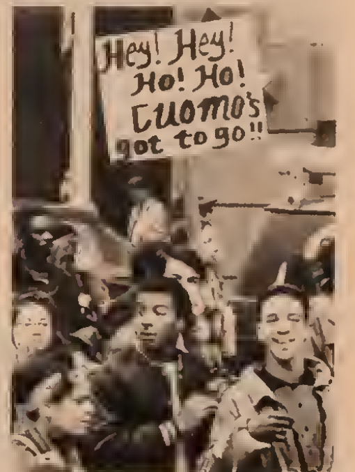
Students chanted, "Cuomo went to CUNY for free—Now he wants to raise our fee!"

Reliance on so-called friends in the Democratic Party will not alleviate the bleak conditions faced by working-class and minority youth. Today, liberal Democrats are united with right-wing