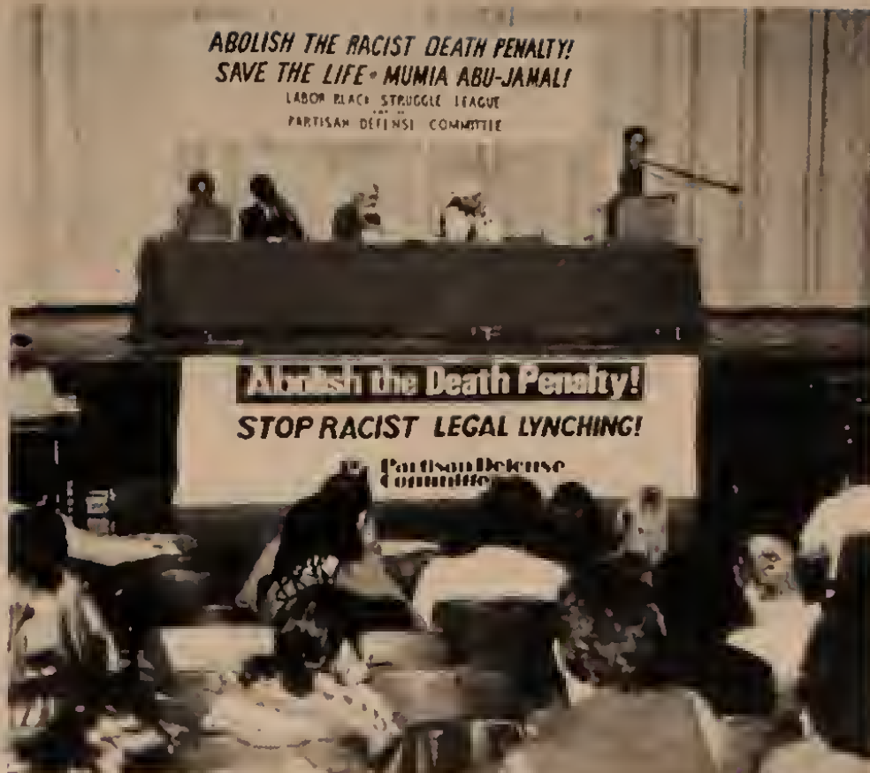
Partisan Defense Committee forum, April 29, New York City.

Contrary to what the New York Times claims, this case has everything to do with race and class—that's what makes it so explosive. Four of the eight youths arrested in the case are from the Schomburg Plaza high-rise at 110th Street on the northeast corner of Cen-