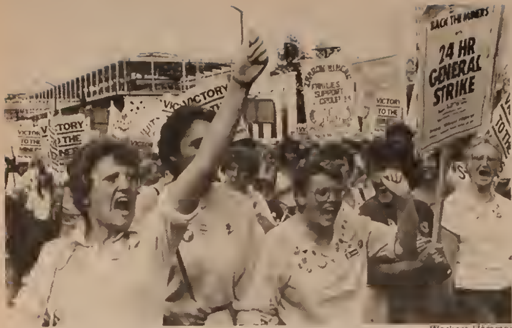
Miners' wives march through London in 1984 during yearlong coal strike. Labour Party, trade-union leaders knifed miners strike, blocked spread of class struggle that could have swept away Thatcher.