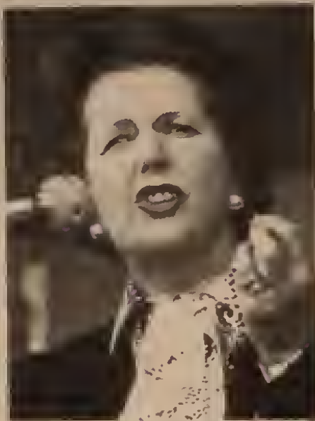
Thatcher's vindictive assault on workers and poor could spark "summer of discontent." Angry dockers (right) strike for job security and union rights.

Mounting trade deficits and inflation rates have generated sharp disputes within the Tory Cabinet. Meanwhile, acting like the last tsarina, Thatcher lectures the far more powerful West German bourgeoisie on NATO, and the rest of the European rulers on the EEC. For eight years, Thatcher basked in her "special relationship" with Reagan. But with Reagan gone, renewed domestic discontent and an economy in shambles, Thatcher's high-handed posturing as the