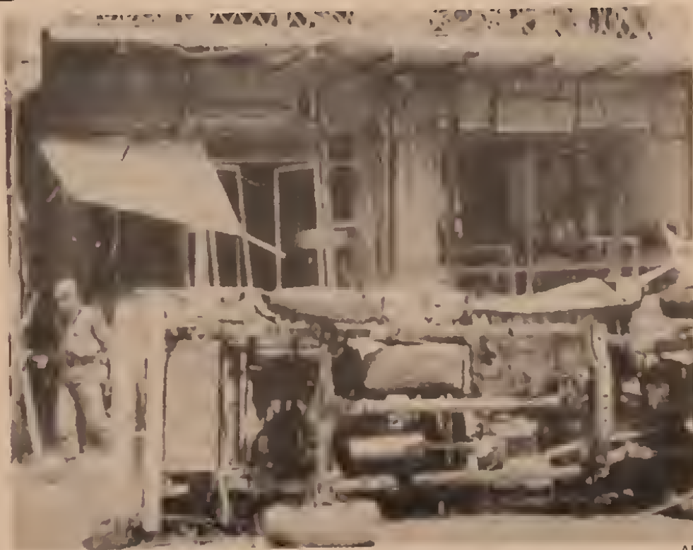
Wreckage of July 15 terrorist car bomb which killed nine people and wounded 49 in one of Kabul's busiest shopping streets.

People are angry over the constant rocket attacks. Between midnight and noon of July 11, some 65 rockets were fired at Kabul—the worst attack in three