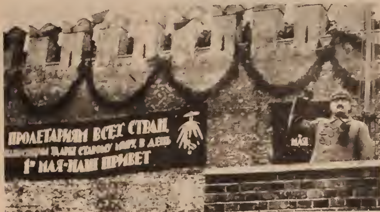
Films Art et Science

Now the voice of the Soviet workers is being heard. The Soviet press would like to present the Kuzbass strikes as support for perestroika. But as shortages spread, manipulated by speculators and profiteers, the hated Nepmen of today, Soviet workers are getting shafted—and they know it. As the main document of