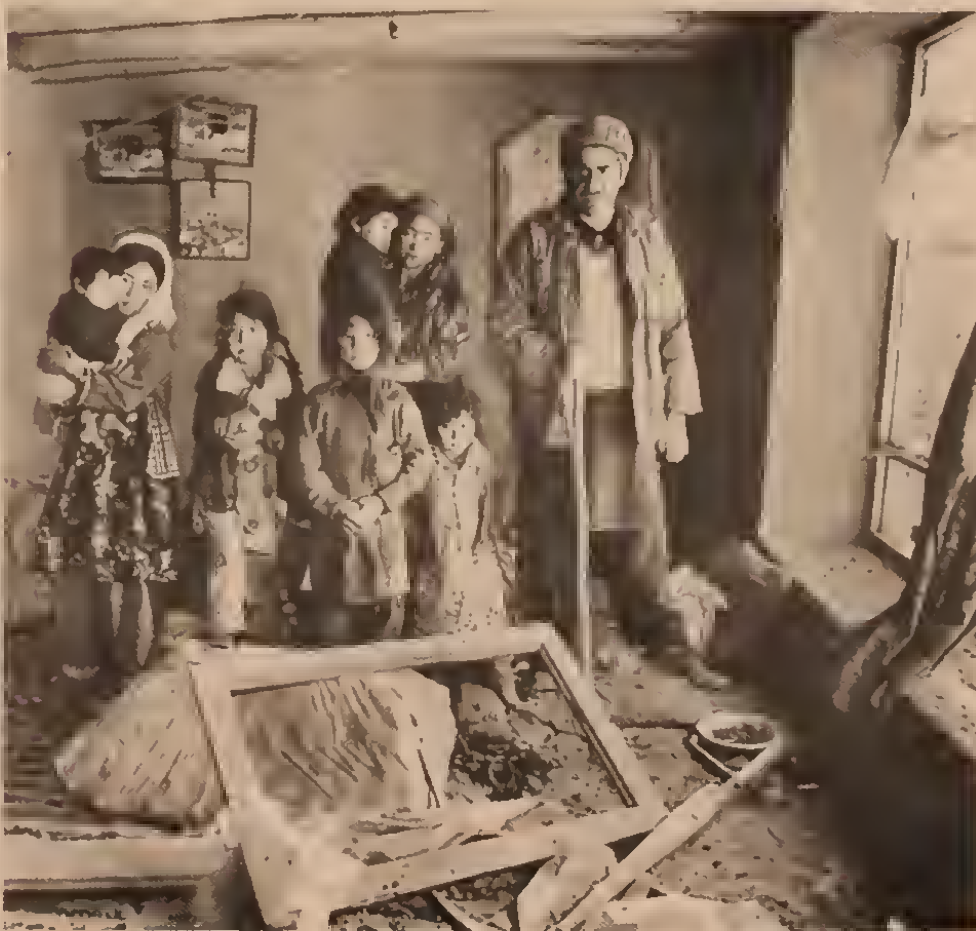
Kabul home after attack by U.S.-supplied rocket.