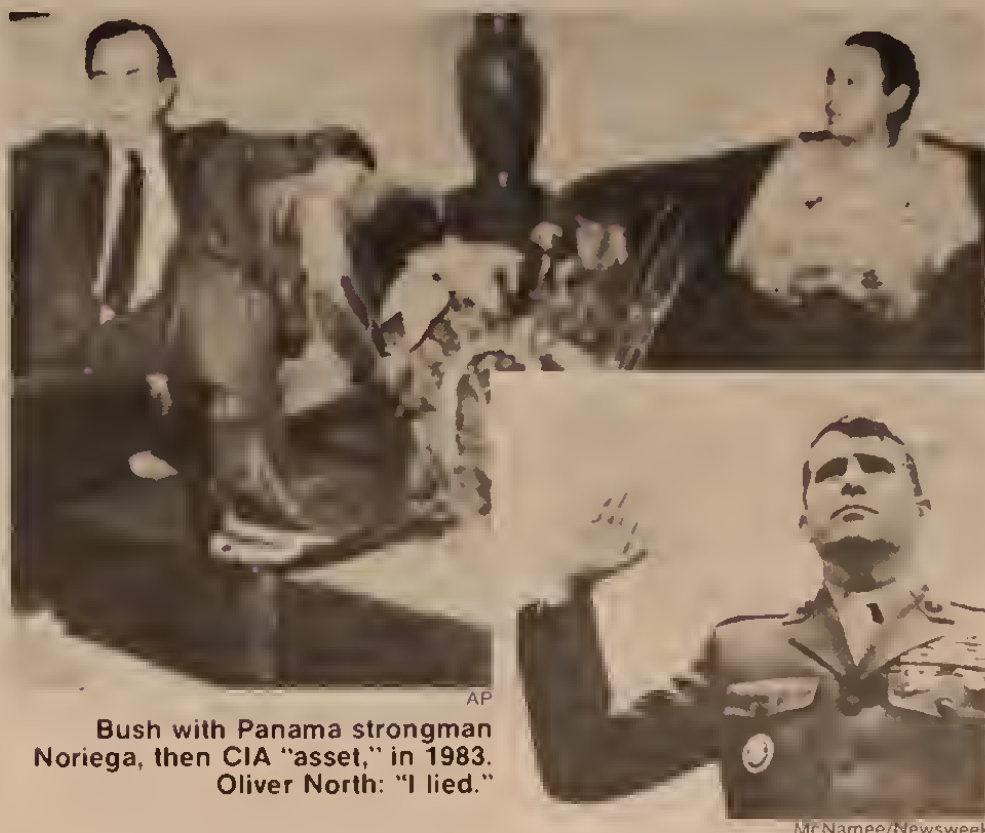
Bush with Panama strongman Noriega, then CIA "asset," in 1983. Oliver North: "I lied."

When North thought that he faced taking a heavier rap, the "ramrod" ex-Marine rejected his designated fall guy role. He tried unsuccessfully to have Reagan cross-examined at his trial. Then North's lawyers began producing