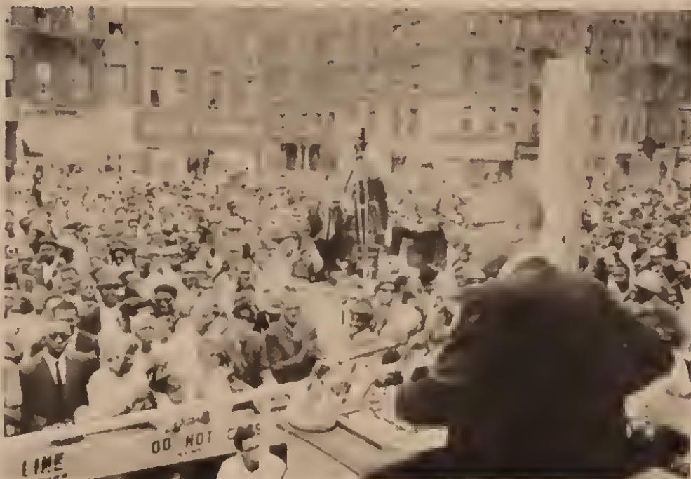
Malcolm X addressing Harlem rally. He opposed both racist parties of American capitalism.

Lee provides the wrong answer to the question of why there are no black-owned businesses in a discussion about the Korean grocer in the film. His sidewalk sage concludes: "Either dem Koreans are geniuses or we Blacks are dumb." Black people are not simply another ethnic group in this society or