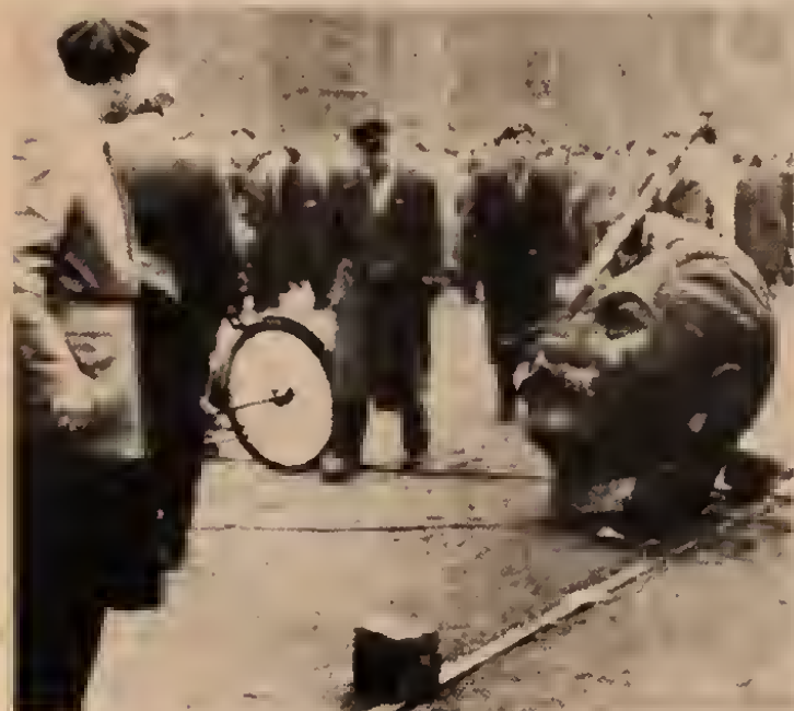
Stalin statue toppled in Budapest, 1956. Bureaucratic apparatus was shattered by Hungarian political revolution.

Square, we called for the formation of workers' and soldiers' councils. And that's not some pie-in-the-sky notion. You had tens of thousands of workers, whole work units from the factories marching en masse, as a unit, to those demonstrations. The workers' councils, what were called soviets in Russia, are quite appropriate to such generalized uprisings. When they did arise in Russia it was to coordinate strike actions in the 1905 Revolution. Workers' soviets are based on the power that workers have at the point of production. They pose the question of who should rule that society. In Russia in 1917 that question was answered through the victory of the Bolshevik Revolution and the creation of the first workers state, based on the workers' and peasants' councils.