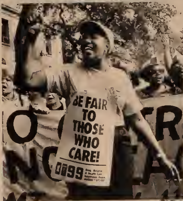
1199 workers rally, July 24. NYC hospital workers need solid citywide strike to win big.

In the second one-day strike by Local 1199 in two weeks, more than 15,000 NYC health care workers massed on July 24 outside St. Luke's Hospital in Harlem, then marched crosstown to Mt. Sinai. The fight by