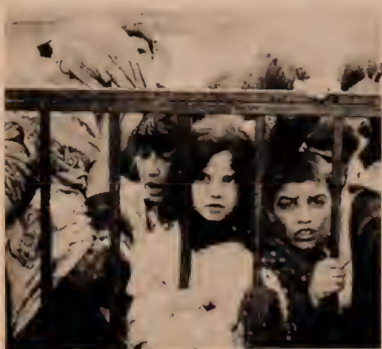
Children in Kabul waiting for food. CIA-supplied terrorists target civilian population.