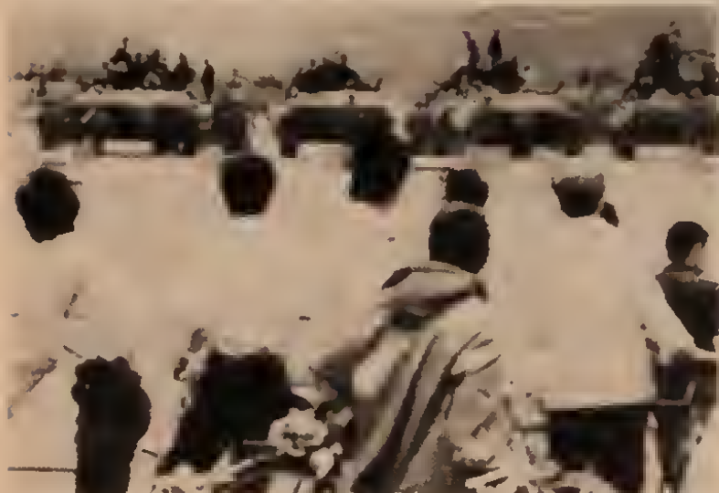
Tanks in Tiananmen Square (above) and victims of crackdown. Deng's provocative massacre sparked beginning of proletarian political revolution.

The Hungarian workers' uprising started as a show of support to Nagy against the old hardline Stalinist regime.