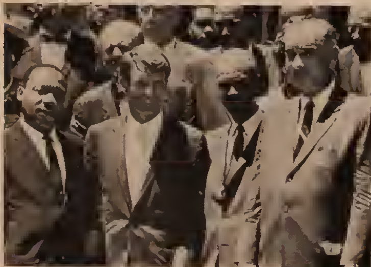
Martin Luther King Jr., Robert Kennedy, Roy Wilkins, Lyndon Johnson in 1963. King tried to channel ghetto anger into racist Democratic Party.

Genuine emancipation of black people from their oppression in this racist capitalist society, making racial equality a reality rather than a dream, will begin with socialist revolution. There is no other road to black freedom. To lead that fight, we need a party—an integrated, class-struggle workers party that will mobilize labor and minorities in defense of the beleaguered ghettos. The bosses' Democratic Party is the main political means used to tie the oppressed to their exploiters. We need a workers party to lead all the oppressed in a fight for a workers government. To this we in the Spartacist League are dedicated. ■