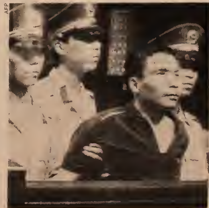
Shanghai worker condemned to death for protesting massacre.

Furthermore, the way that Deng Xiaoping has largely dismantled centralized economic planning means that if individual factory managers don't