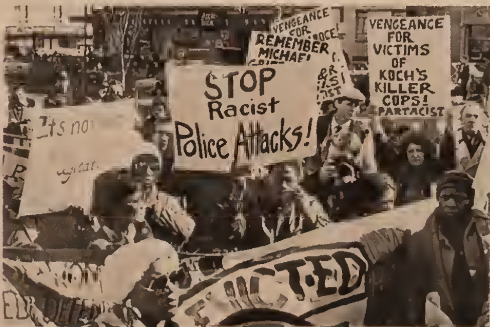
February 1987 protest outside Bronx courthouse against police murder of black grandmother Eleanor Bumpurs.