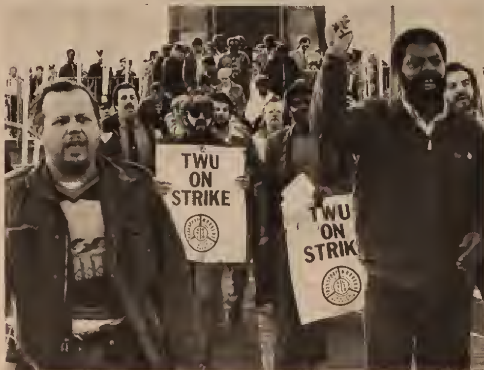
1980 New York City transit workers strike: integrated labor movement has the power. Unleash it in revolutionary struggle to bring down racist capitalist system!

It's a terrible abuse of a terrific quote from Malcolm X. Malcolm told the truth about the need for black self-defense and warned against any illusions in the bosses' police or the bosses' political parties to defend black rights.