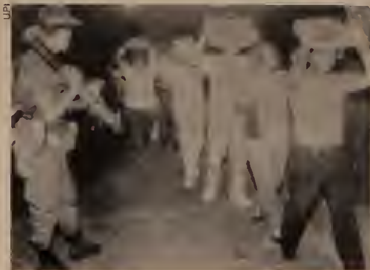
San Salvador, July 17: troops occupy campus, round up students.