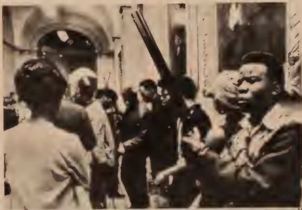
Armed Black Panthers demonstrated at California state capitol to protest gun control bill, 2 May 1967.

Many of these militants were inspired by Malcolm X. Although he was not a Marxist basing himself upon working-class struggle, Malcolm advocated armed black self-defense against racist attacks, and opposed the deceitful, treacherous and venal Democratic and Republican politicians. When Mal-