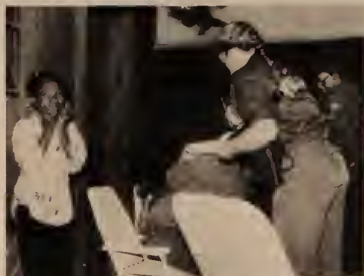
"Drug war" targets black America. Left: eight-year-old looks on as mother and two brothers are arrested for "possession."

For "inner-city" blacks, drugs are an escape from a reality too horrible to face, especially on an empty stomach: