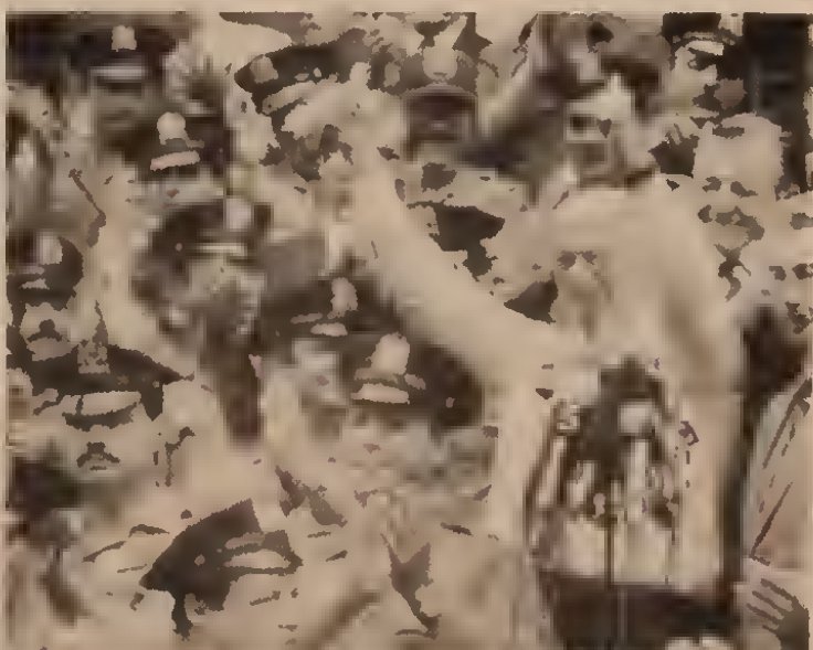
Break with the Democrats, build a workers party! Democratic mayoral candidate David Dinkins with Governor Cuomo (left). Koch's cossacks of PBA endorse their chief (right).