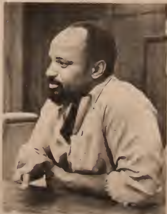
Geronimo Pratt, imprisoned over 18 years for a crime he did not commit, fights for his freedom.

I. This is an action for declaratory and injunctive relief and damages on behalf of a well-known former Black Panther leader, ELMER "GERONIMO" PRATT. Plaintiff, known to defendants as a target of and prominent spokesman and aggressive litigant continued on page 11