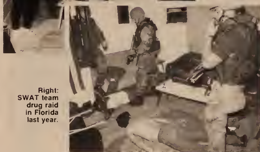
Right: SWAT team drug raid in Florida last year.