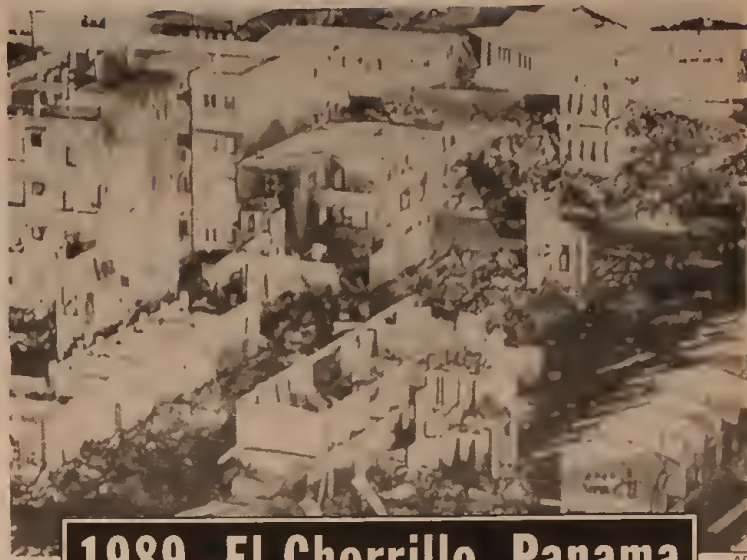
1989—El Chorrillo, Panama

With supreme racist arrogance and indifference they turned El Chorrillo, with its tightly packed wooden houses and apartment buildings, into an inferno. They even shot at and bombed Red Cross ambulances trying to reach the wounded. Health officials in Panama estimate the overall number of civilians killed by the invasion at around 2,000. The precise number of casualties is difficult to determine because many victims were quickly buried in mass graves, and no one knows how many men, women and children lie buried in the rubble of El Chorrillo. The self-censored imperialist press gagged on its own "newspeak," as the New York Times (31 De-