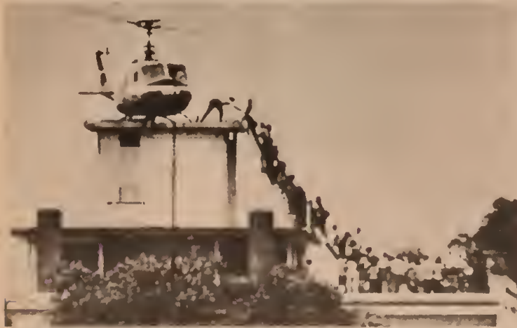
1975: Imperialist losers flee Saigon. Victory of heroic Vietnamese people still haunts U.S. ruling class.

It's long past time this arrogant, racist ruling class got what was coming to it—and it's going to take the American working people to do it. Down with Bush/CIA international Murder, Inc.! U.S. get your bloody hands off the world! ■