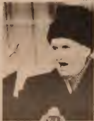
Mass grave in Timisoara, where Ceausescu (above) ordered massacre of unarmed protesters.