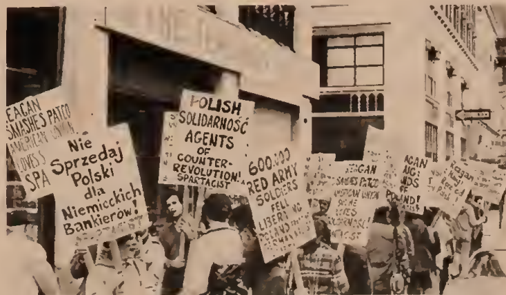
New York, September 1981 Spartacist League demonstration at Solidarność office: exposing Solidarność as company union for CIA and Wall Street.

Meanwhile the Australian Northite press is attacking United Secretariat