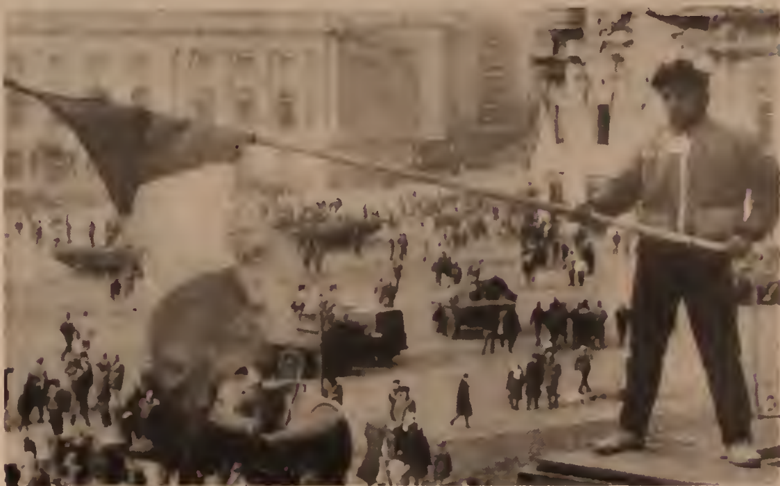
Triumphant demonstrator on the balcony where bloodthirsty tyrant Nicolae Ceausescu made his last public speech.

While many individual soldiers refused to fire on the demonstrators, what occurred in Romania was not a mutiny