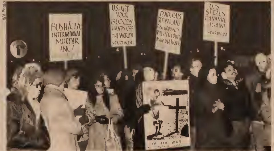
Boston, 20 December 1989: protest against U.S. imperialist invasion of Panama.

defenseless civilians from the air, they haven't even managed to take control of Panama City after two days of heavy bombing, much less to capture Noriega. The American government has even put a $1 million bounty on his head. The Washington mob, which incidentally is the world's biggest drug-runner, makes