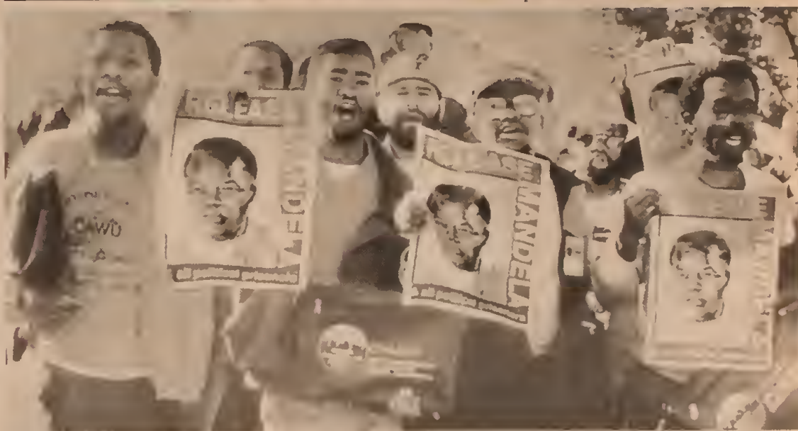
Johannesburg: South African trade unionists demand freedom for ANC leader Nelson Mandela. Powerful black working class can smash apartheid capitalism.