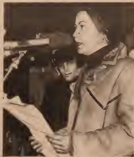
TLD speaker at January 3 rally.