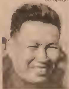
Pol Pot's genocidal terror killed at least one million Cambodians.