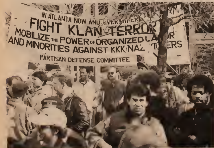
Atlanta, 21 January 1989: 3,500-strong demonstration met Klan provocation with massive show of labor/black defiance.

Today, 125 years after victory over slavery in the Civil War, the promise of black freedom remains unfulfilled, and decaying capitalism spawns the racist terror of the Klan and skinheads. It will take a third American revolution—the victory of a multiracial workers party leading a socialist revolution—to avenge the victims of Klan/Nazi terror. ■