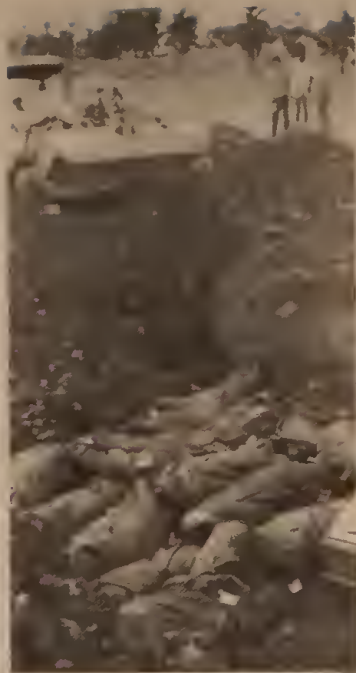
Victims of Washington war criminals were buried in mass graves outside Panama City.

And the media whores of the capitalist press did their usual cover-up for the war criminals in Washington. As left-wing journalist Alexander Cockburn wrote in the Wall Street Journal (28 December 1989): "Even by the craven