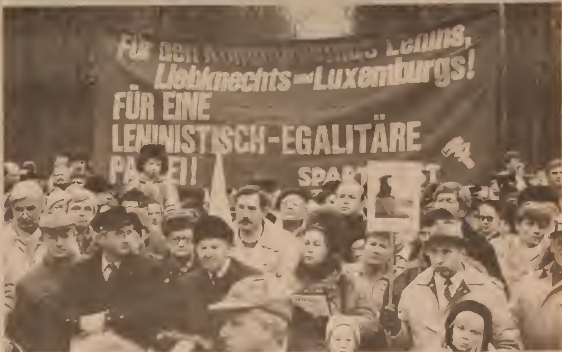
"For the Communism of Lenin, Liebknecht and Luxemburg! For a Leninist-Egalitarian Party!" Spartakist banner at 30 December 1989 Treptower Park anti-fascist demonstration.