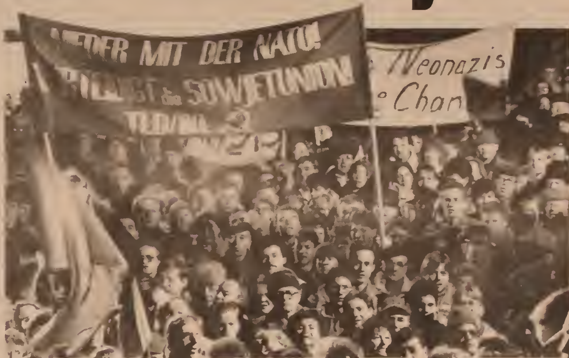
January 3, Treptower Park, East Berlin: banner of TLD/International Communist League says: "Down with NATO! Defend the Soviet Union!"