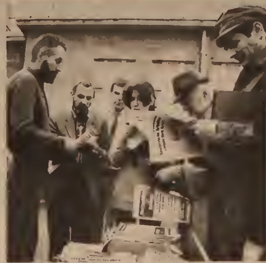
Delegates to December 1989 SED conference crowd around Trotskyist literature table.

Once again today, Germany is the key to all of Europe. The International Communist League (Fourth Internationalist) has thrown our slender resources—cadre and funds—into the rapidly developing political revolution in the DDR. In response to our public fund appeals, supporters and readers of WV have come forward. But today we are confronted anew with the seeming inevitability of a drastic curtailment of Arprekorr's frequency. As the discredited Stalinist system is wracked by crisis in country after country, the workers must organize to take the leadership of society; already the capitalists and their agents—on the left the