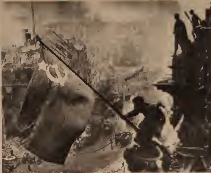
Hammer and sickle flies over the Reichstag as Soviet Red Army liberates Berlin from Nazi terror regime, 30 April 1945.

Despite Stalinist dogma and despite Stalin's beheading of the Red Army, the Soviet working people smashed Hitlerite fascism. It was they, comrades, who "exported" the revolution to the Elbe—