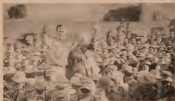
The Bushes visit the troops. Soldiers want to go home. U.S. News & World Report ran this photo next to headline, "All for war say 'Aye.'"

For workers and oppressed in the U.S. and around the world, the obligation is clear: to stand with the Iraqi people against U.S. imperialism. While the fake-lefts seek to find a "peace-loving" wing of this rapacious ruling class to lead them in impotent peace crawls, the Spartacist League fights to mobilize the social power of workers and minorities in class struggle against our enemy, the American capitalist class. For labor political strikes against Bush's war! Break the blockade of Iraq—Sink U.S. imperialism in the Persian Gulf! ■