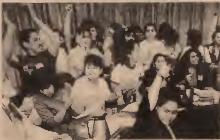
Striking TAs, heavily Latino and women, take over a meeting of Los Angeles school board, November 29.