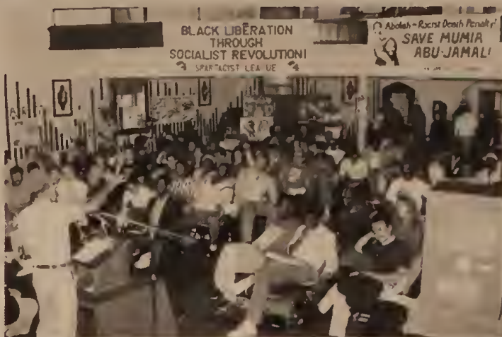
Philadelphia, July 14—Over 200 rallied to demand: Abolish the racist death penalty! Save Mumia Abu-Jamal! Philly cops staged sinister mobilization the same day, demanding Jamal be executed and smearing his supporters.