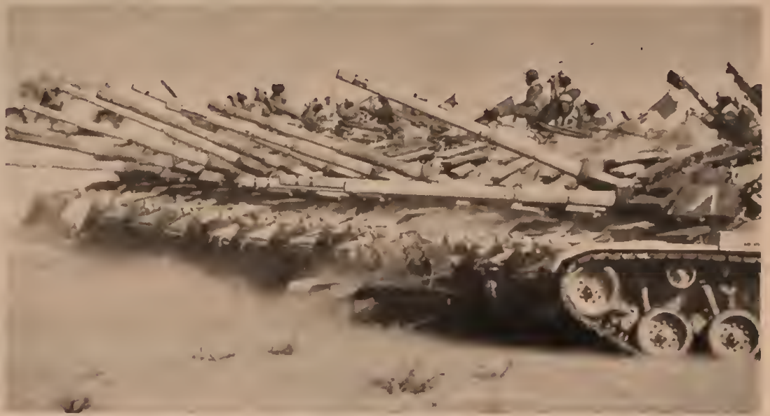
Pentagon has over 400,000 U.S. troops poised for war against Iraq.