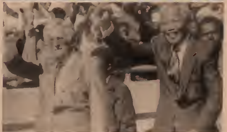
CP leader Joe Slovo and Nelson Mandela campaign for "power-sharing" with masters of apartheid.