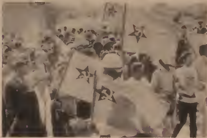
South African trade unionists march under the hammer and sickle of Communism. Oppressed black masses want red revolution, not "power-sharing" with apartheid capitalists.