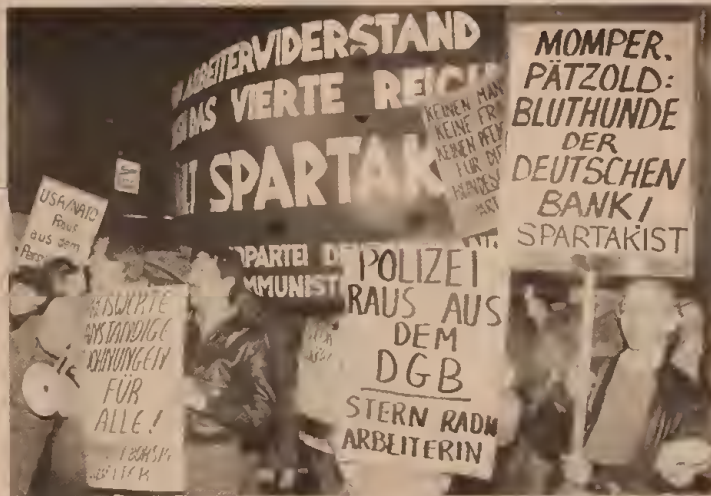
Spartakist Workers Party of Germany in November 18 demonstration protesting police terror ordered by Social Democrats against Berlin squatters. Sign says SPD leaders "Momper, Pätzold: Bloodhounds of the Deutsche Bank."

As for the left-of-the-PDS groups, the "United" Left split, with some jumping on Gysi's handwagon while others went