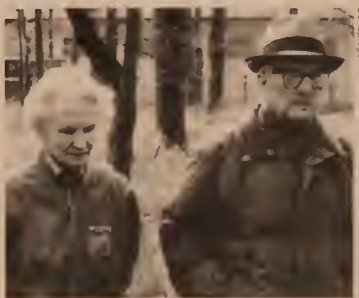
Margot and Erich Honecker. Former head of the DDR and unrepentant Stalinist is being witchhunted by triumphant bourgeoisie's SPD lackeys.

They want to make a show trial of Erich Honecker because he was head of the DDR (East Germany), and because he is an unrepentant Stalinist, a hard case who ran a hard regime (but far from the worst in East Europe).