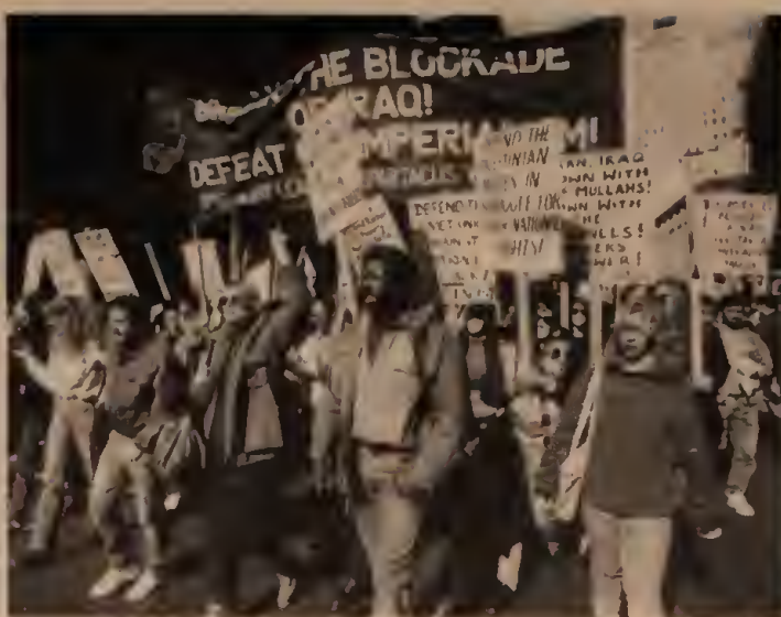
Spartacist contingent at October 20 antiwar protest in New York City demands: Break the Blockade of Iraq! Defeat U.S. Imperialism!

Bush recently had to swear that he would not allow "another Vietnam." As evidence that the U.S. is not about to get bogged down in "a protracted, drawn-out war," he claimed that "the motivation of our all-volunteer force is superb." This was, observed Newsweek (10 December),