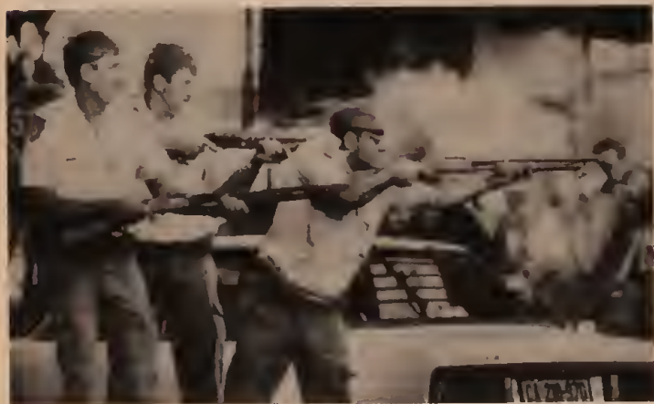
Cape Town police shoot at anti-apartheid demonstrators who came to greet Mandela on the day of his release.