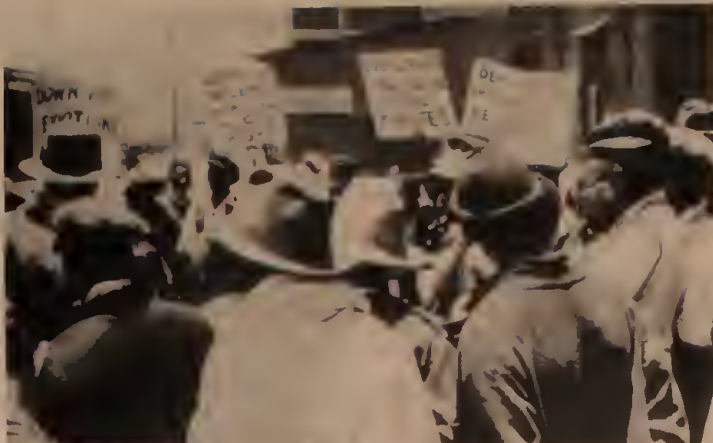
ANC/SACP leaders talk of "post-apartheid" state. But even before the "apartheid" regime came to power in 1948 South African capitalism was based on white-supremacy, superexploitation of black labor. Demonstration in 1930s for equal rights and release of imprisoned comrades.

In a "Proposed Resolution on Negotiations" (reprinted in Bulletin in Defense of Marxism , July-August 1990), WOSA puts forth a defeatist perspective, asserting that "the balance of forces between the government and the liberation movement is still starkly in favor of the government" and that "our agitation cannot be