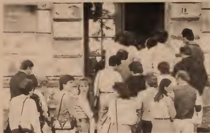
Victims of capitalist reunification: jobless workers in Schwerin (in former East Germany) are among over three million unemployed.