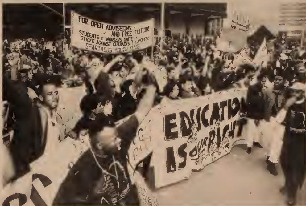
After three weeks of occupying campuses, student strikers march in April 30 New York city workers rally.