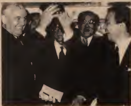
Japanese prime minister Kaifu (right) tells Gorbachev: give us Kuril Islands (boxed area in map shows islands demanded by Japan). Imperialists want to bottle up Soviet fleet in Vladivostok and Sea of Okhotsk.

Gorbachev engaged in a series of marathon negotiation sessions with the Kaifu government to trade "interpretations" of who really has "rights" to the Kurils. Prior to Gorbachev's arrival the bourgeois press launched a media blitz rewriting history to suit Japanese imperialism's revanchist claims and preparing