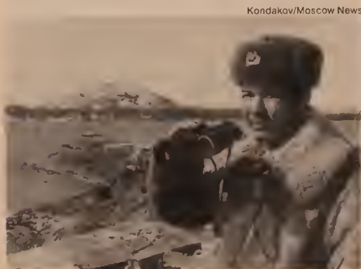
Soviet border guard on Kunashiri in the Kurils (above). Ultrarightist demonstrators in Tokyo (right) demand that Japanese imperialism take back the Kurils and southern Sakhalin.