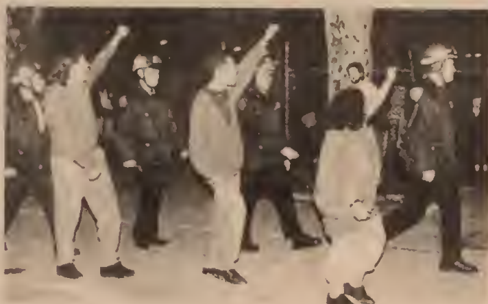
April 27—Students from Lehman College in the Bronx forced out of occupied building by the cops.

Now kangaroo courts have been set up, and student protesters face expulsions, suspensions or the possibility of "probation" for the rest of their college careers.