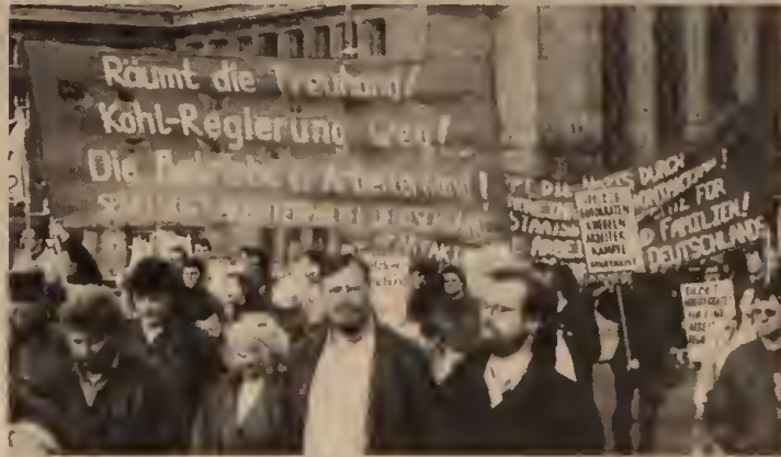
Leipzig, April 8—Workers protest massive unemployment stemming from capitalist unification. Spartakist banner reads, "Sweep Away the Trusteeship Agency/Kohl Regime! Factories to the Workers!"

tuting the nationalist dogma of "socialism in one country." Ten years later, this led to capitulation by the Stalin/Thälmann-led KPD to the German fascists. This was followed by Stalin's popular-front policy, in which the proletarian struggle for power was abandoned in favor of diplomatic alliances with the imperialists.