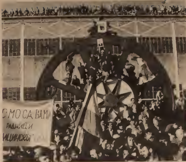
Steel workers strike in Montenegro in 1988. United working class under genuine communist leadership can stop intercommunalist slaughter and breakup of Yugoslavia.

vincial, and as Communism has declined that cast of mind has grown more powerful, promoting an angry Serbian nationalism."