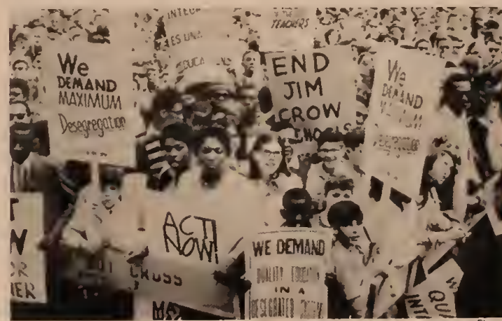
Struggle for freedom requires smashing racist segregation. Civil rights activists in 1960s demonstrate against Jim Crow education.

This attack cries out for a massive fight back on behalf of all working-class youth! Instead, what we're getting from middle-class black elected officials and black nationalists is an accommodation to the rollback of black rights dressed up as proposals for "Afrocentric" schools exclusively for black males. This not only lets the racist white ruling class off the hook, it's a proposal to ghettoize the teaching of some of the most important history that all fighters for social justice must learn. White schoolchildren as well as black schoolchildren need to learn about Denmark Vesey, Frederick Douglass, John Brown, and Karl Marx. But we're Marxists, not idealists, and understand that education is a class question. True quality education for the masses