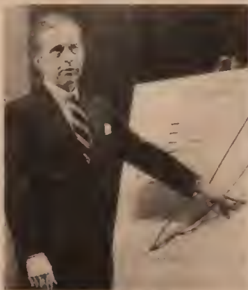
Governor Pete Wilson charts war on California schools and unions, as San Francisco high-schoolers protest threatened closings.