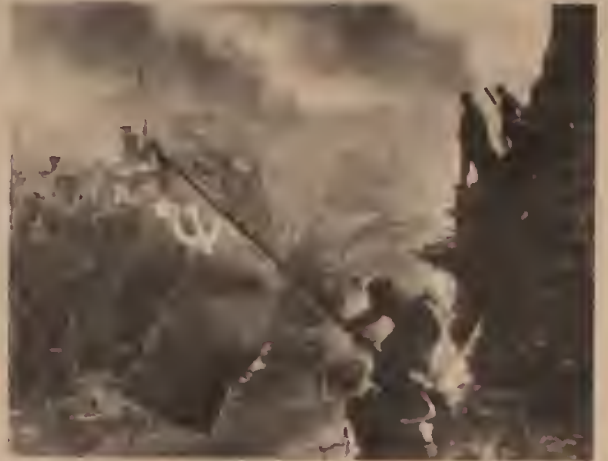
Raising red flag over the Reichstag marked Soviet Army's liberation of Berlin from the Nazis.