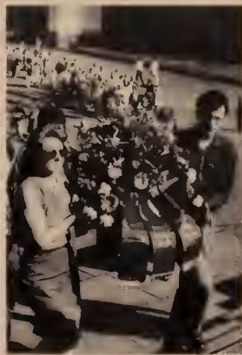
8 May 1990—Spartakist comrades lay wreath at Soviet war memorial in Treptow Park, East Berlin. Ribbon says: "Honor Red Army which smashed Nazi regime."

We of the Spartakist Workers Party fought for political revolution to over-