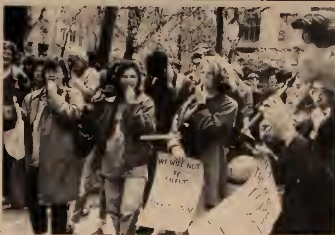
May 3—U of C students rally to demand an end to anti-gay attacks.

the administration, cops and FBI to take action against the fascists. The allies the students need are not the administration, cops and G-men, who have proven they will shield these masked