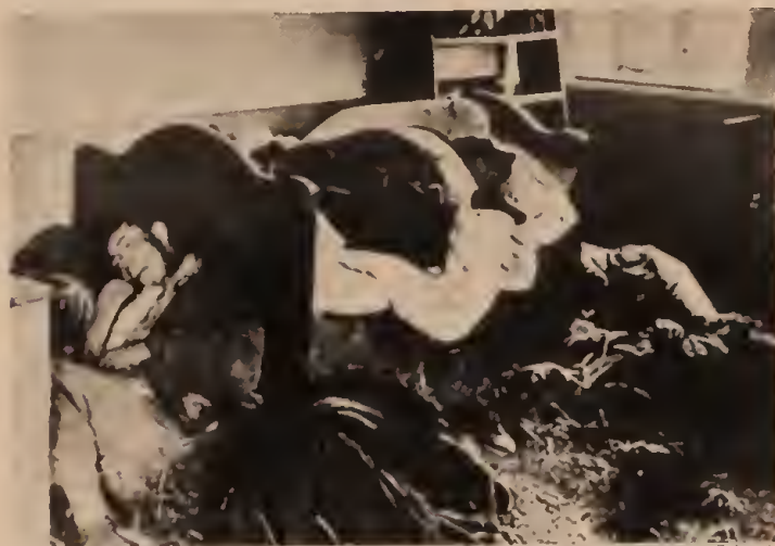
Federal Committee for Information, Belgrade

But socialism cannot be built in isolation in the relatively backward Balkan lands. Indeed, the powerful and unrelenting pressure of the world capitalist market is a prime cause for the present disintegration of Yugoslavia and also the nationalist fissuring of the Soviet Union. Clearly the fate of Yugoslavia is tied to that of the Soviet Union, as well as to class struggle in Western Europe. As Trotsky wrote in a discussion with his Greek supporters in the early 1930s: "A revolutionary perspective is impossible without a federation of the Balkan states, which obviously will not stop here, but rather will extend into the federation of the United Soviet States of Europe." ■