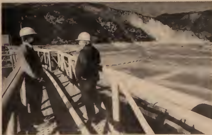
Empty reservoir in Los Padres National Forest. If governor wants to turn the tap off the schools, workers should shut off water to state capitol.

The education ax in California will cut particularly viciously at minorities, now composing an estimated 43 percent of the