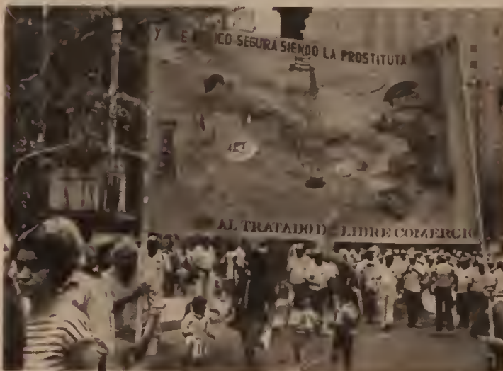
Banner at Mexico City May Day march denounces Free Trade Agreement for "prostituting" Mexico to the U.S.

Grupo Espartaquista de México, Spartacist League/U.S., Trotskyist League of Canada, sections of the International Communist League (Fourth Internationalist)