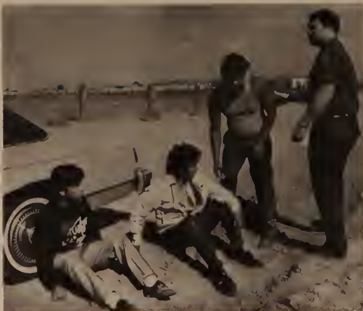
U.S. immigration cop seizes Mexican workers near the border. Over 1,000 "illegal" immigrants are arrested and deported daily.

Coupled with the 1989 trade pact with Canada, the FTA is designed to establish a "Fortress North America" as a weapon against a German-led Europe and a Japanese-dominated Far East. The American bourgeoisie dreams of salvaging the rusting U.S. economy through establishing a protected $6-trillion common market encompassing 360 million people—substantially bigger than the European Economic Community—stretching "from the Yukon to the Yucatan." "To hear George Bush tell it, a free-trade pact