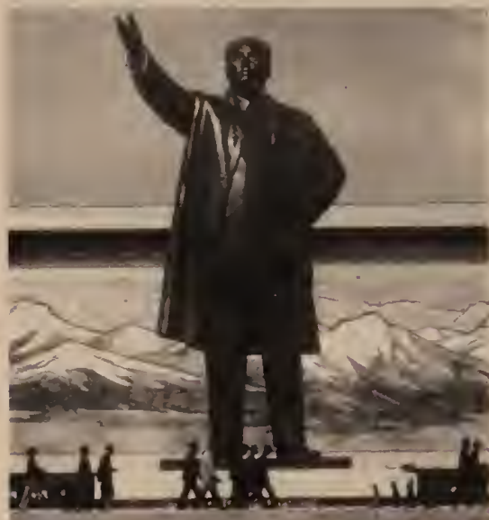
Kim Il Sung

The Spartacist Group Japan and the International Communist League (Fourth Internationalist) demand: U.S. out of Korea! For military defense of North Korea, the USSR and the other deformed workers states! For revolutionary reunification of Korea through socialist revolution in the South and proletarian political revolution in the North! Reforge the Fourth International, world party of socialist revolution! ■