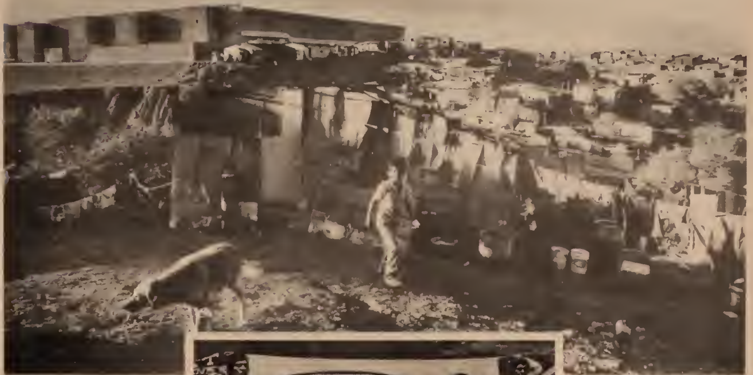
Above: Impoverished shantytown surrounds "free trade zone" factory in Nogales, Mexico.

We print below a joint declaration by the Grupo Espartaquista de México, the Spartacist League/U.S. and the Trotskyist League of Canada, sections of the International Communist League (Fourth Internationalist).