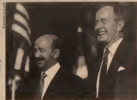
Mexican president Salinas de Gortari and his imperialist godfather Bush.

In a Wall Street Journal (18 April) column denouncing the trade pact, AFL-CIO chief Lane Kirkland hypocritically condemned the maquiladora plants, where "more than a half-million Mexicans...were joining the ranks of the most crudely exploited humans on the planet." But Kirkland and the rest of the American labor bureaucracy haven't lifted a finger to aid the organization of Mexican workers, not even in industries like auto, where 75,000 work in the Big 3 plants south of the border. GM alone has 25 plants in Mexico—it is the largest private employer in the entire country. Instead, the AFL-CIO bureaucracy, infamous among class-conscious workers through-