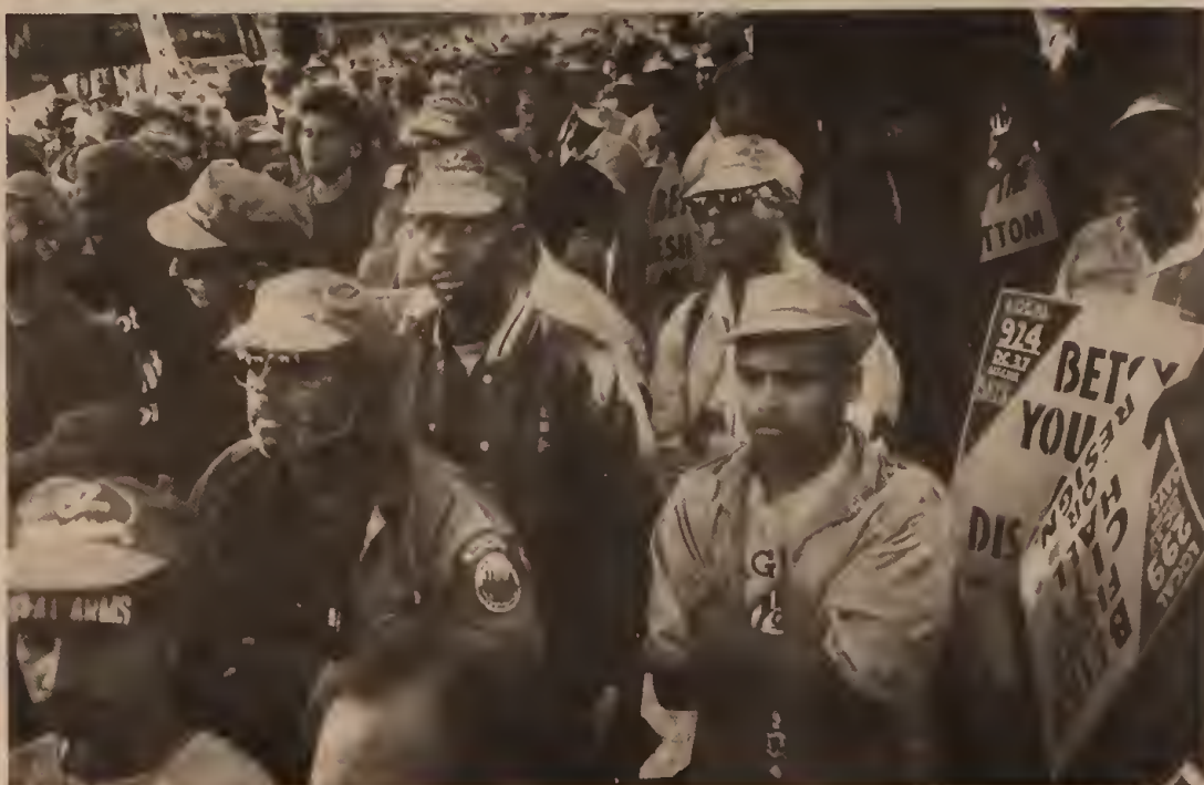
June 6: 1,500 parks workers protest mass layoffs.

box and provide $350 million. In the mid-1970s, a big chunk of this country's ruling class agreed with Gerald Ford when he sent the message to New York: "Drop Dead." But having gone through that "fiscal crisis" and seen the gaping holes in the infrastructure that those cutbacks caused, the bourgeoisie today knows that they can't let the capital of world finance sink into the ocean. Yet the big New York commercial banks are on the brink, and they're holding billions in NYC municipal paper.