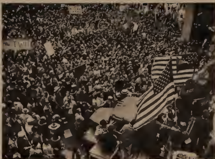
1980 NYC transit workers strike. Integrated labor movement has the power to save New York!

These are killer cuts: Harlem Hospital, the only health care for over 100,000 Harlem residents, is losing hundreds of