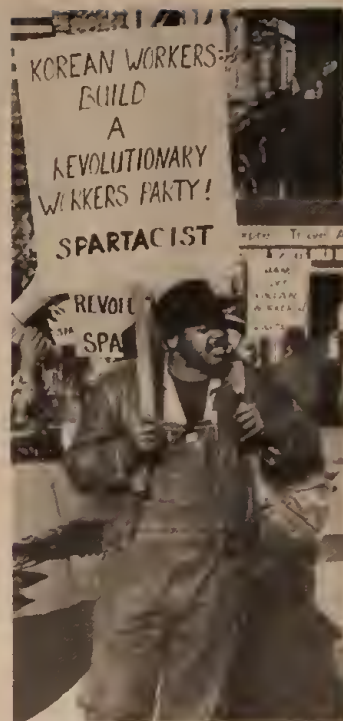
San Francisco, May 23: Spartacists protest Seoul's bloody repression of student demos.

The South Korean industrial proletariat is relatively young, but the traditions of Korean communism, inspired by the 1917 Bolshevik Revolution, fill an important chapter in the history of the struggle for world socialist revolution. Dispersed by Japanese imperialism's 1910 occupation, pioneer Korean revolutionary militants played an important role not only in Korea but in building Communist parties of the Soviet Far East, China and Japan. Koreans in the Soviet