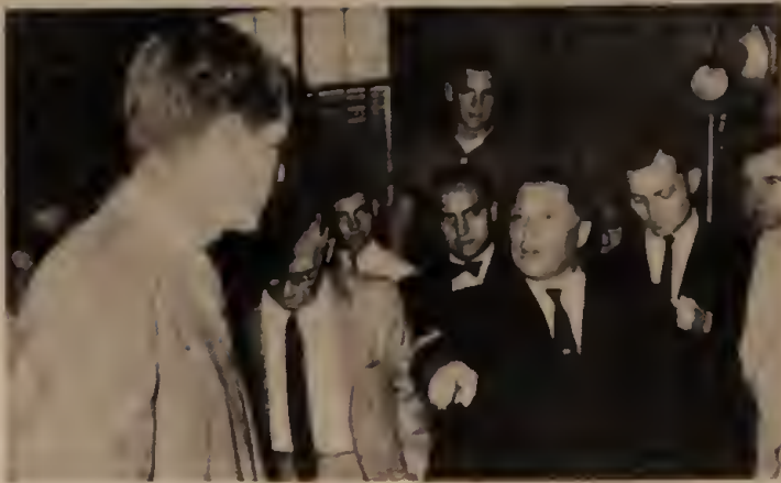
Jimmy Hoffa (right) confronts witchhunter Bobby Kennedy during 1959 Congressional hearing. Kennedys waged a decade-long vendetta to jail Teamster leader.