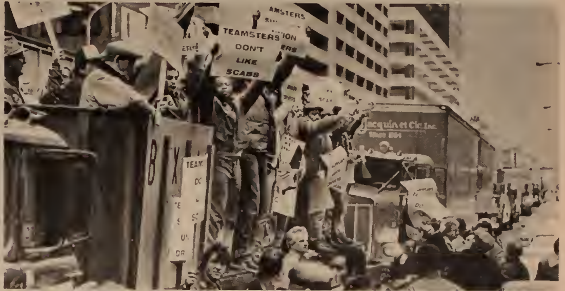
Teamster convoy blocks downtown Philadelphia bus terminal during bitter 1983 Greyhound strike. Teamsters don't like scabs, flinks or feds!

"Teamsters Grapple with Democracy at Their Government-Run Convention," headlined the Wall Street Journal . What "democracy"? The IBT meeting at a (non-union) hotel in Orlando, Florida was a government-rigged charade from start to finish. Out in the hall delegates got to wave signs for their favorite bureaucrat-candidate. In the back rooms 65 federal agents ran the floor show, while a federally appointed "elections officer" and a brace of federal judges pulled the strings. The feds decided on who got to vote, voting rules, counting and announcing results, and virtually everything else. This was the upshot of the "consent decree" which IBT president