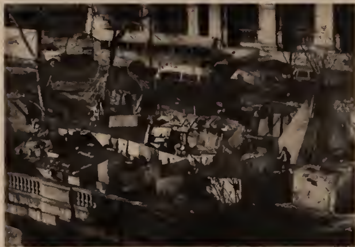
The Hill, homeless community next to the Manhattan Bridge.

And in the next two years alone, a billion dollars will go to add new jail cells to what is already the largest municipal penal complex in the world (over 23,000 cells, doubled since 1986). The other "growth industry" in New York is the homeless. In the midst of the biggest real estate bust in decades, with thousands of apartments sitting empty, warehoused by bankrupt speculators, tens of thousands of homeless roam the streets.