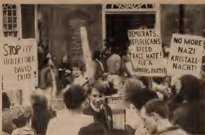
Spartacus Youth Clubs built 1991 Boston protest against Duke; Democratic mayor Flynn's cops protected KKK/Nazi killers.