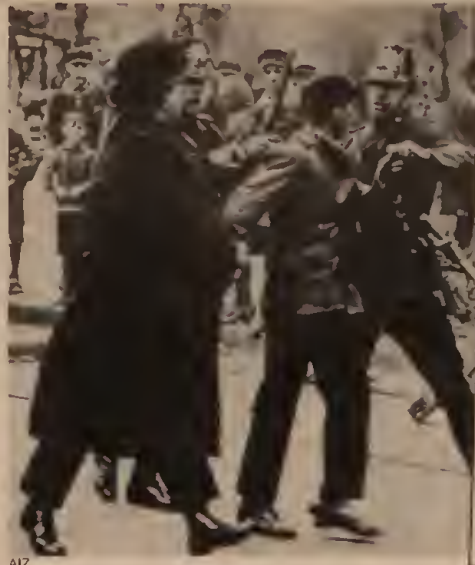
Weimar police arrest May Day demonstrator in Berlin, 1929 (left). Erich Mielke in 1931 (below), and being dragged into court today.

The Berlin Wall was built at the height of the Cold War, against a capitalist campaign, in part orchestrated by the CIA, to disrupt the East German economy by bleeding it of skilled labor. As the Trotzkistische Liga Deutschlands, forerunner to the Spartakist Workers Party (SpAD), wrote in a Spartakist supplement in