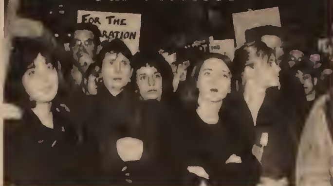
Abortion rights protest at Irish consulate in NYC, 21 February. Spartacist speaker said: "The onslaught against women's rights around the world is part and parcel of the drive to stabilize a capitalist system in decay."

contraception and health care. Lower the age of adulthood!