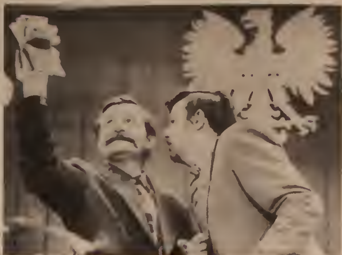
Reagan and the Pope's "Holy Crusade" against Communism funneled CIA money to Solidarność and Lech Wałęsa.