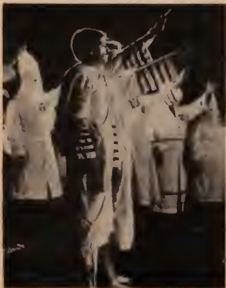
Three-piece suit or white sheet, David Duke hasn't changed his stripes. Fascist threat must be crushed by powerful labor/black mobilizations.

The recent invitation by the Harvard Kennedy School's Institute of Politics (IOP) to David Duke to speak at the IOP Forum is a dangerous racist provocation. Today a Republican, yesterday a Democrat, David Duke has always been and still is a KKK Hitler-loving fascist. In a very recent interview with the Dallas Morning News Duke proclaimed his pride in his years in the KKK and vowed, "I haven't changed." Lashing out at minorities as "genetically" inferior and a "threat" to "white culture," Duke reaffirmed his 1989 statement that "There's only one country anymore that's all white and that's Iceland. And Iceland