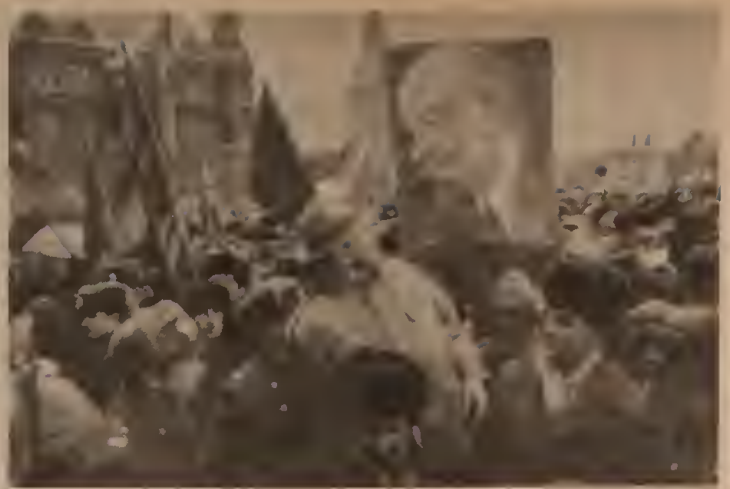
Moscow, February 9: Protesters carry portrait of Lenin in demonstration against Yeltsin's "free market" misery.

Beware all those who seek to divide the multinational working people through chauvinism and racism! The poison of anti-Semitism is the tool of the would-be bourgeois slavemasters to divide and cripple the workers' struggle. Was it a coincidence that on Army Day the militia aimed its truncheons against youth bearing red flags and portraits of Lenin? In the factories, in the mines, in the collective farms, there are workers of different nationalities. They must come together in proletarian unity, not