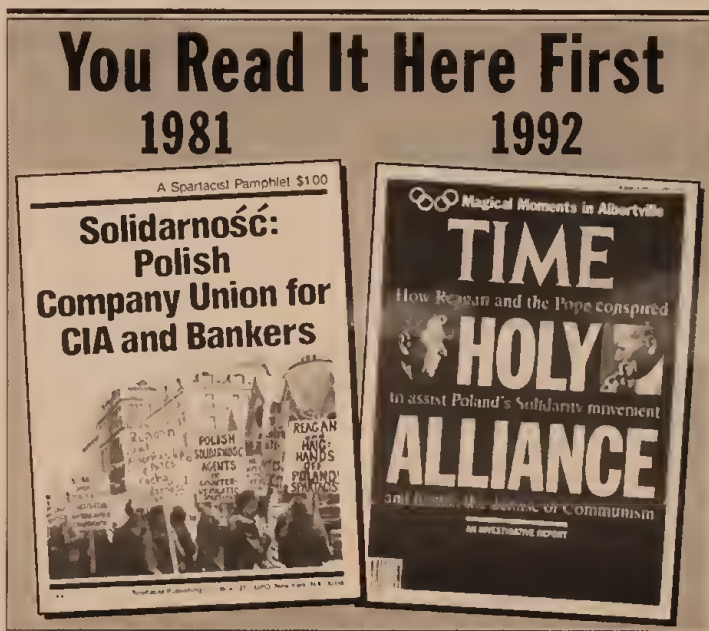
Spartacists told the truth about Solidarność when it counted (our 1981 pamphlet is still available—$1.00). Now Time (24 February) "exposes" Reagan/Pope plot.