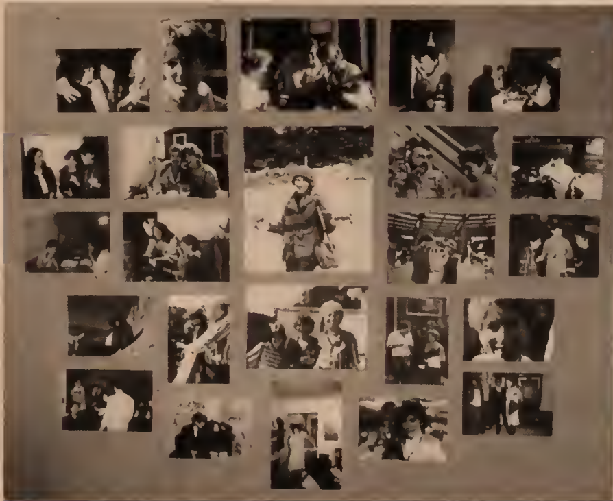
Part of display at Bay Area memorial meeting.