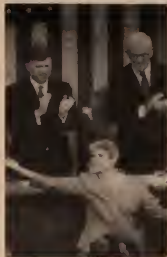
Nicaraguan president Violeta Chamorro fêted by her Imperialist paymasters in Washington, D.C.

While triumphantly crowing over the "death of Communism," the AFL-CIO tops preside over ever more brutal attacks against workers and minorities in the U.S. In exposing these labor traitors we fight not only to defend the historic gains of the Soviet working people in the face of capitalist counterrevolution but to build the revolutionary workers party needed in this country to put an end to rapacious U.S. imperialism. ■