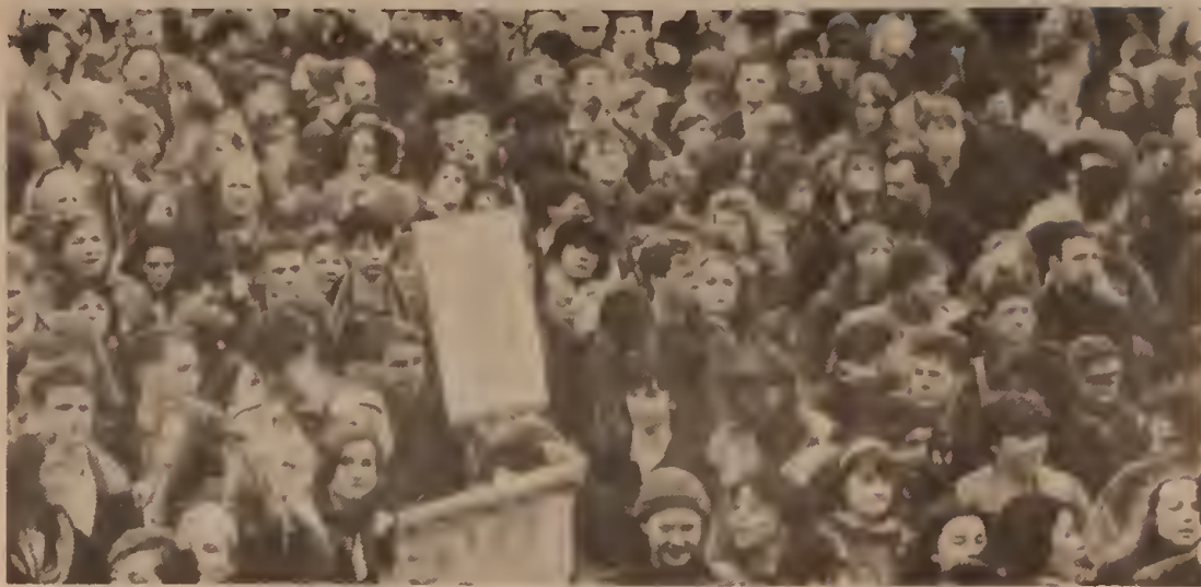
Dublin, 22 February: Singer Sinead O'Connor at head of demonstration of 5,000 protesting Irish government's anti-abortion law.