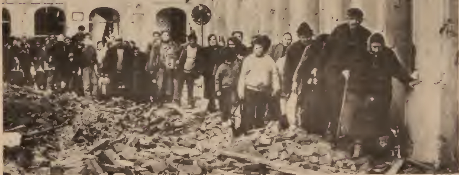
Refugees make their way through rubble of Vukovar, Yugoslavia.