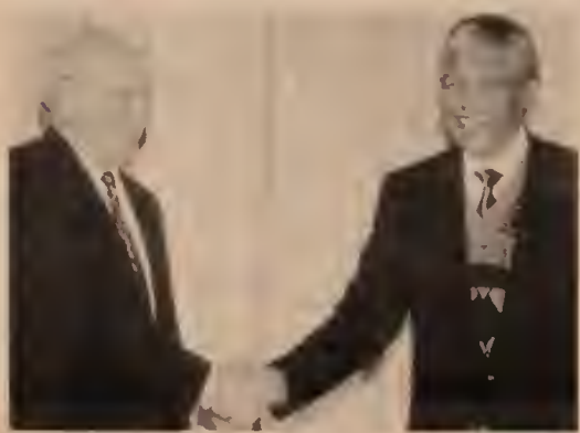
De Klerk-Mandel negotiations perpetuate neo-apartheid hoax.

cow is vital to the fight on the Witwatersrand to smash apartheid. But this is no "objective process" that must be taken as a given. The fact is that the fake-lefts who tail after the ANC, saying that socialist revolution is impossible in South Africa, were on the counterrevolutionary side of the barricades in Moscow last summer. WOSA is linked to Ernest Mandel's "United Secretariat,"