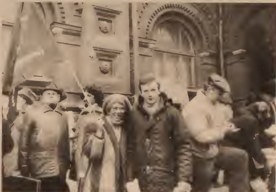
Moscow, November 1991: At demonstration to keep Lenin Museum from being closed down by counterrevolution.

So we need to have the money to continue to print our leaflets, to put out the second issue of our bulletin, to send this material to all parts of the Soviet Union, to make trips to follow up on groups which look to be beginning to seriously study Trotsky and Lenin. And that's the question which we have to put to you this evening. I apologize for the fact that no doubt I sound a bit tired and my sentences are not terribly good. But I hope you understand that the key question here is that we desperately need the ability to continue to do this work, because there is an opening for Trotskyism for the first time since the decisive defeat