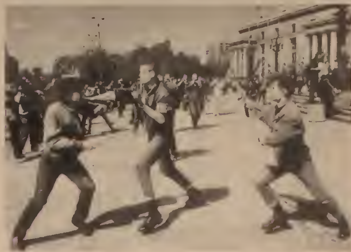
Polish neo-Nazis attack 1990 May Day demonstration in Warsaw.

After Zhivkov's ouster, the new Socialist regime restored the rights which the Turkish minority had before the "Bulgarianization" campaign. In response, 100,000 Turks returned to Bulgaria in expectation that life would now be better for them. However, the Socialists continued to appeal to anti-Turkish chauvinism, albeit in a more "civilized" manner. The attempt to introduce Turkish into the schools produced violent protests and school boycotts by Bulgarian chauvinists, in many cases organized by former Stalinists. Last spring the Socialist/UDF government "postponed"