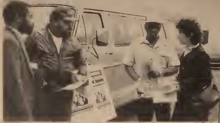
Campaigning at supermarket during 1983 campaign for Oakland city council.

You Can't Fight Reagan with Democrats—For Mass Strike Action to Bring Down Reagan!