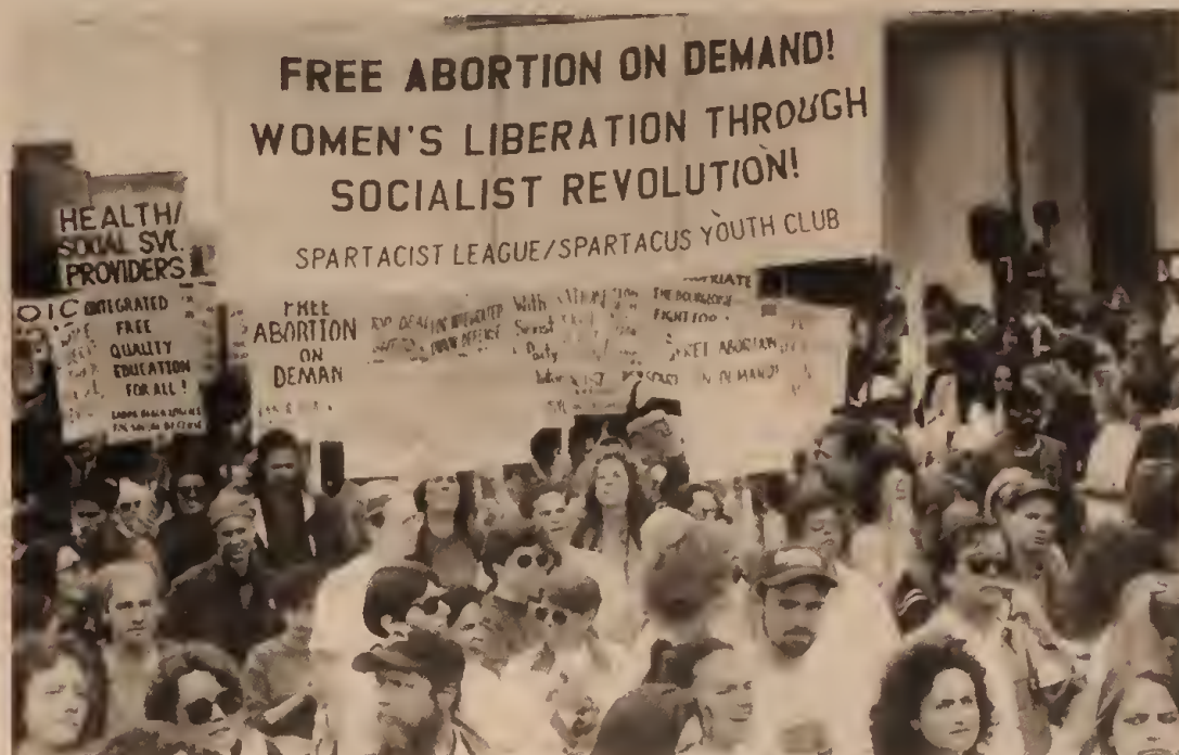
Spartacist contingent in March 29 San Francisco abortion rights demonstration.

We in the Spartacist League/Spartacus Youth Club say that a fight for women's rights must be a fight against the capitalist system that breeds women's oppression. To perpetuate the private property system, women in class society are relegated to domestic servitude and