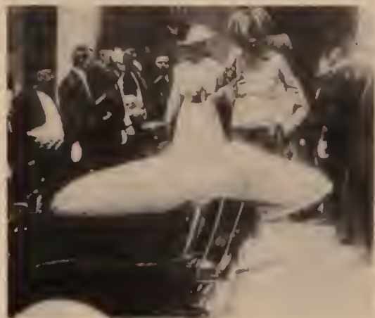
28 June 1914: Archduke Ferdinand and his wife, shortly before their assassination, the incident which touched off World War I.

The Bolsheviks were able to unify the multinational working people of the Russian tsarist empire—combating and defeating the anti-Semitic terrorists of the Black Hundreds and other reactionary nationalist forces—because they had the perspective of world socialist revolution. Today, it is desperately necessary to build new Bolshevik (Leninist-Trotskyist) parties in the Soviet Union and East Europe to unite the workers against the counterrevolutionary inciters of fratricidal nationalism. ■