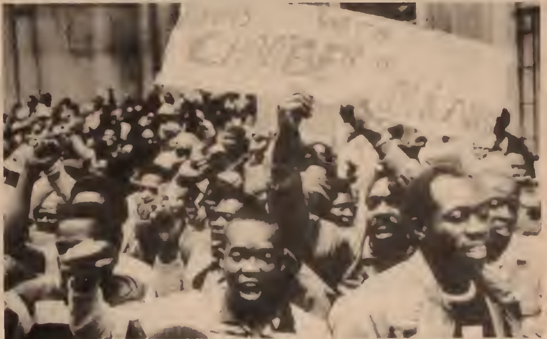
Black workers have the power to smash apartheid capitalism.