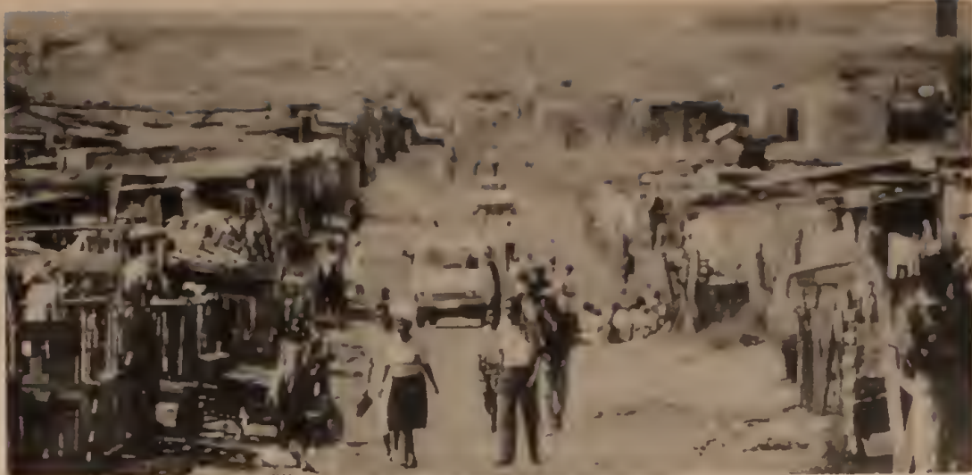
Black township near Johannesburg. Phony "power-sharing" won't change hellish conditions faced by millions of blacks.

The International Communist League (Fourth Internationalist) warns that bar-