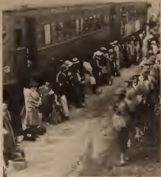
Some 120,000 Japanese Americans were thrown into concentration camps during World War II.

Characteristic was the attack on the Norwalk community center, which trashed the interior, slashing judo mats and a kids' bulletin board with a razor left embedded in the cork. Among dozens of other incidents, an elderly Japa-