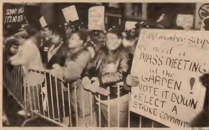
March 3: Transit workers march against sellout contract, TWU tops called the cops.

After a dozen years of union-busting and givebacks, aided and abetted by the labor bureaucracy, workers throughout the country have seen their wages and working conditions go to hell. Currently, transit workers in Pittsburgh are on strike, walking out on March 16, snarling