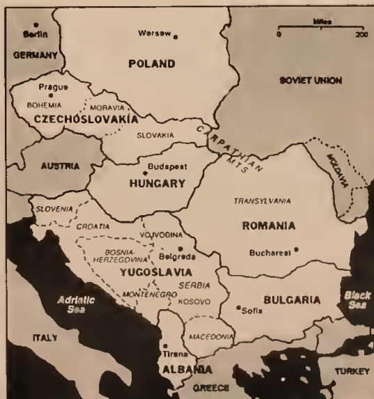
Collapse of Stalinism paved bloody road to fratricidal nationalist strife in the Balkans.

"The Bolsheviks won the allegiance of the Turkic-speaking nationalities of Central Asia by demonstrating the superiority of the Soviet system in practice—at the same time respecting the cultural differences of the many nationalities brutally oppressed in the tsarist prison house of peoples... In mockery of this tradition you forcibly expel thousands into the hands of the reactionary Ozal govern-