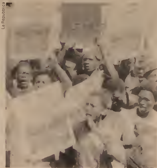
Cape Town, January 24: Demonstrators calling for constituent assembly protest outside South African apartheid parliament.