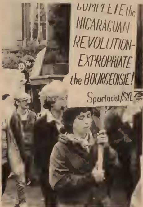
May 1983: With demonstrators protesting appearance of Cold Warrior Jeane Kirkpatrick at Fairmont Hotel in San Francisco.

And when I returned from Nicaragua in 1985, she told me that she liked my written report [see "Defend Nicaragua! Crush the Contras!", Young Spartacist No. 134, March 1986] and that it had made her cry. She encouraged me