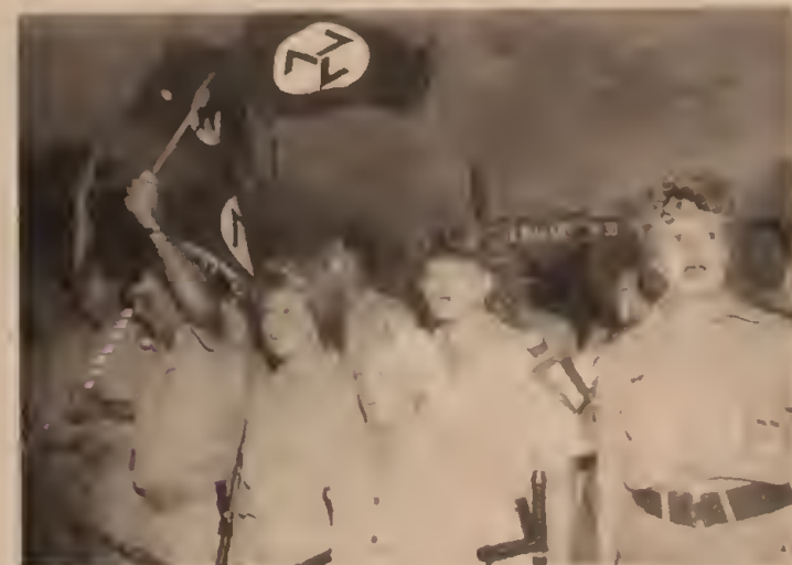
Afrikaner fascist AWB at February hate rally. Apartheid hardliners are mounting terrorist offensive.

On De Klerk's right flank, the Conservative Party is unraveling as a split