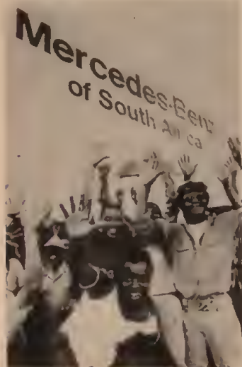
Strike of combative black auto workers at Mercedes-Benz was betrayed by reformist "Communists" of SACP.