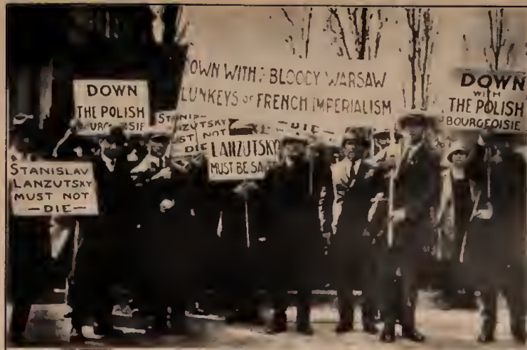
New Cannon book contains 16 pages of rare photographs. Communist demonstration in Washington, March 1925, protests counterrevolutionary terror in Poland.

import of their opportunist error and steer the party away from the Farmer-Labor milieu; Lovestone and Pepper won the Comintern's support for a continued orientation to petty-bourgeois Farmer-Laborism. In 1924 Cannon did not know that Trotsky had been responsible for the CI's opposition to the Workers Party's La Follette policy. But the fact that, unwittingly and belatedly, Cannon supported the thrust of Trotsky's intervention goes a long way to explaining his later evolution toward Trotskyism. Also notable is Cannon's failure to speak or write major articles in support of Zinoviev-Stalin-Bukharin's "anti-Trotskyism" cam-