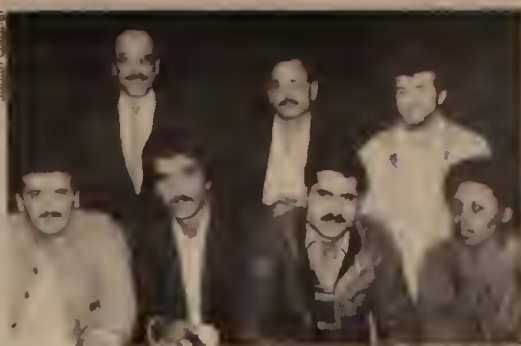
Members of L.A. Eight face McCarthyite deportations.