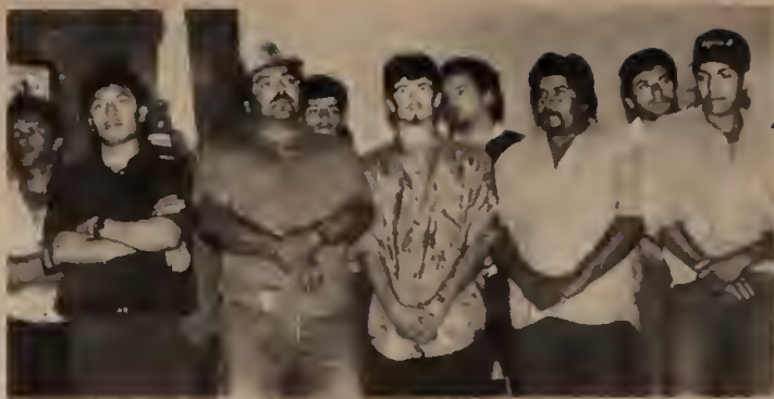
Drywallers and supporters at November 14 meeting on union contract at Carpenters Hall in Orange County, California.

Overwhelmingly Latino, cut off from unionized, commercial construction by the prejudice and backwardness of the craft union tops, the drywallers fought