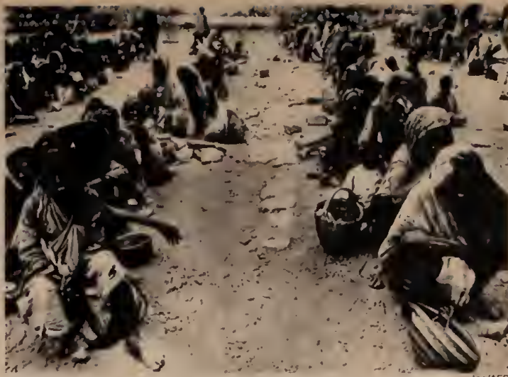
U.S. imperialism is responsible for bloody breakup of Somalia and mass starvation.

Washington is throwing massive firepower into Somalia: artillery, tanks, armored cars and helicopter gunships, with an aircraft carrier battle group offshore for reinforcements and possible bombing missions. In addition, there will be several thousand troops from half a dozen countries, including France, Canada, Egypt, and Somalia's former colonial ruler, Italy. Facing untrained and