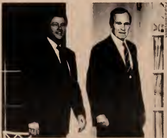
Democratic president-elect Clinton applauds Bush's military adventure in Somalia.

Today, the U.S. military must act as cops of the world, because the Wall Street banks and Fortune 500 corporations exploit the working people of the world, from South Korea to South Africa, from Central America to Central Europe. Only if the capitalist bloodsuckers who run this country are overthrown by the working class, allied with the black and Hispanic poor, can the drive toward a new world war be halted and America's productive capacity be made to serve the genuine interests of humanity. ■