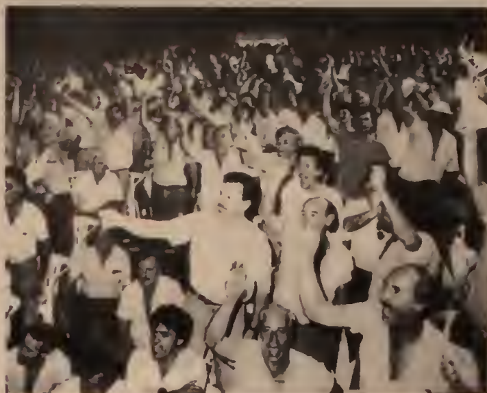
Striking Athens bus drivers in August spearheaded massive Greek working-class struggle.

Meanwhile, the government's attacks on the working class have been accompanied by ferocious chauvinist saber rattling over former Yugoslav Macedonia.