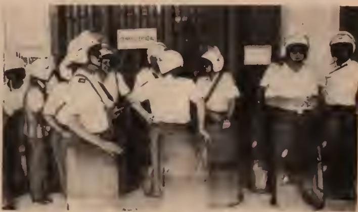
Cops in riot gear massed for anti-striker violence.

When the government announced its Maastricht package increasing the retirement age to 65 and cutting pensions and social security payments, the public sector exploded. In August tear gas filled the streets as riot police sought to break up mass demonstrations; union leaders and strikers were jailed. The GSEE, led by the Stalinist KKE (Communist Party) and the bourgeois populist PASOK (Panhellenic Socialist Movement), was