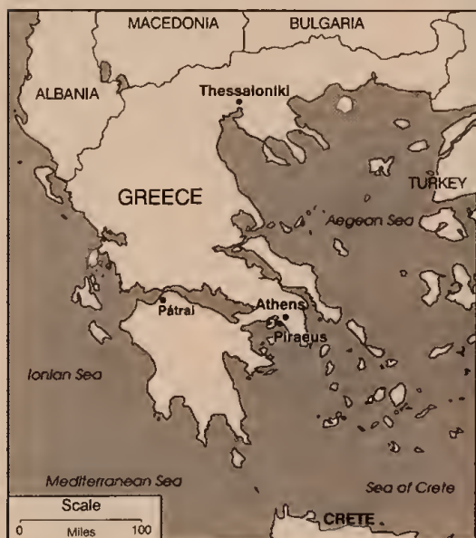
Former Yugoslav republic of Macedonia is target of chauvinist campaign by Greek bourgeoisie abetted by Greek Stalinist KKE.

Military expenditure has escalated in an arms race with Turkey, and the draft period has been lengthened. Last month Greek president Karamanlis called for closing the borders with "Skopje," the Greek-chauvinist term for Yugoslav Macedonia. This may come to a head over the EC heads of state meeting in Edinburgh this month, where recognition of Macedonia may be broached.