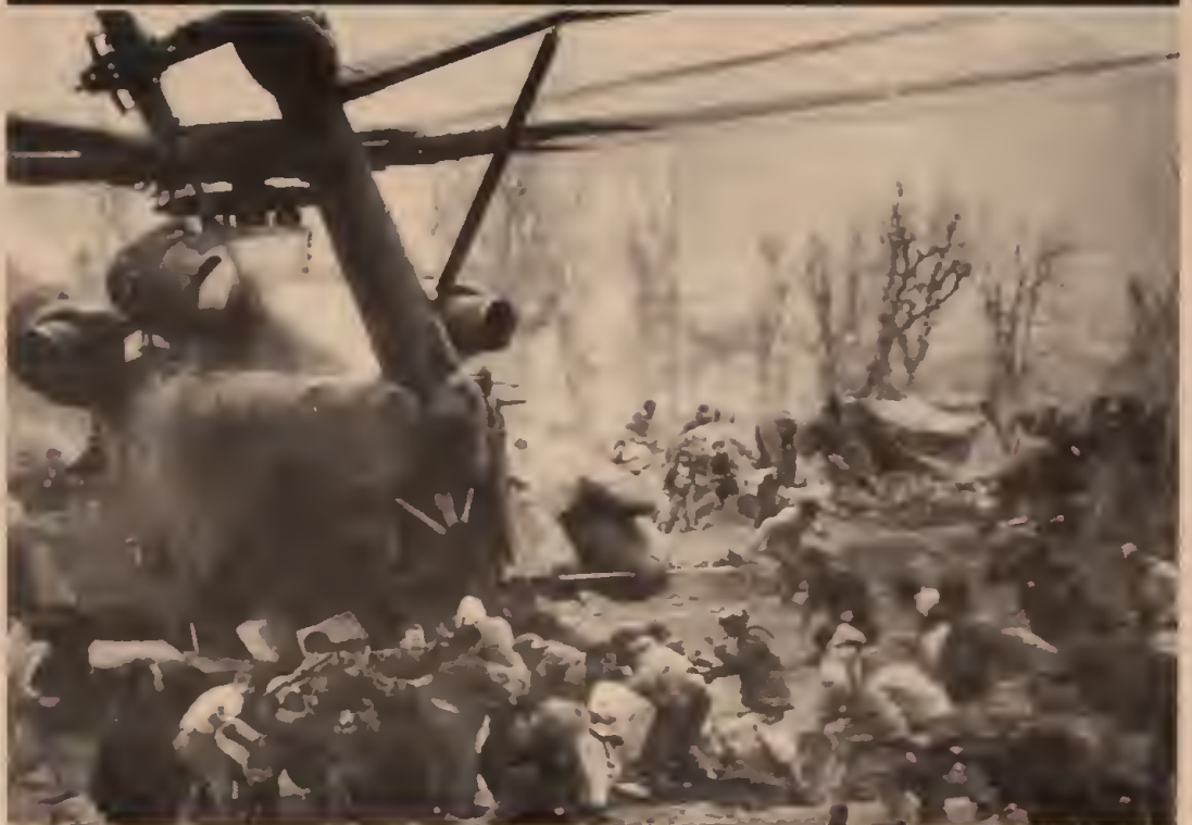
"Operation Provide Comfort," spring 1991: U.S. ferried aid to Kurdish refugees (above) while using them as pawns. Washington manipulated Iraqi Kurds into aiding suppression of Turkish Kurds by bloody Turkish regime.

atomic bomb on Hiroshima, raped Vietnam and trained generations of torturers in Latin America and elsewhere, as a force for humanitarian relief is grotesque! For over a year after Somalia broke down into clan warfare and famine, the imperialist leaders turned their