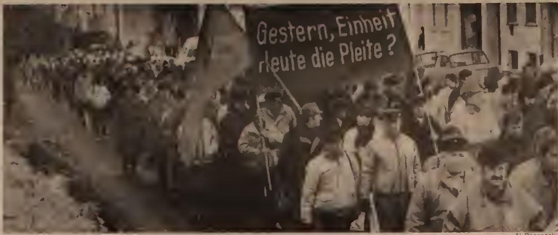
Half a year after reunification, east German workers protest (above) under banner, "Yesterday Unity, Today Bankrupt?" Chancellor Helmut Kohl (below) pelted with eggs in industrial city of Halle, May 1991.