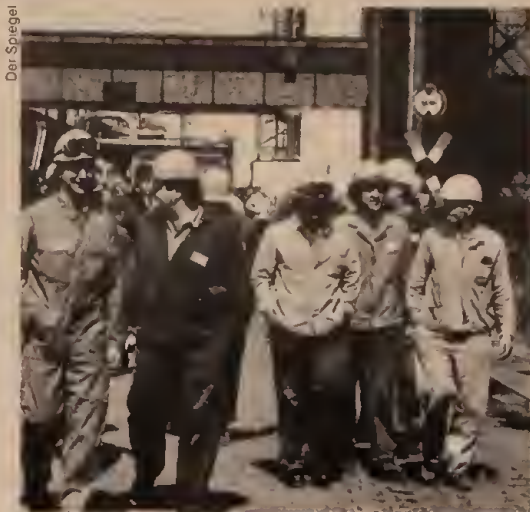
Treuhand bosses have been shutting down east German industry wholesale. Right: workers at Wolfen film factory, now devastated by layoffs.

a consequence, in the late 1980s the West German military budget amounted to 3 percent of its huge gross national product compared to 4 percent for France, almost 5 percent for Britain and 6.5 percent for the U.S.