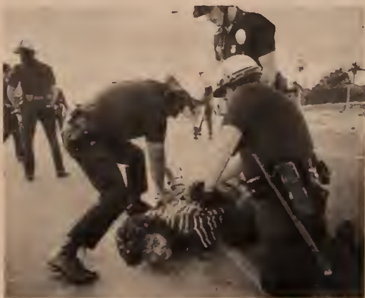
December 14—LAPD brutalizing demonstrators at Florence and Normandie, flashpoint of upheaval last spring.