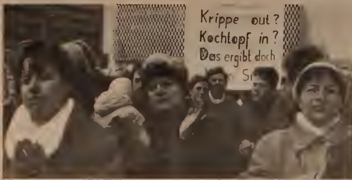
East German women protesting impending loss of day care, March 1990. Sign reads: "Nursery out? Cooking pot in? Doesn't make sense."