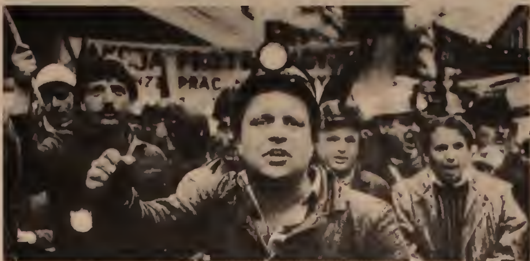
Polish miners, demonstrating above for higher wages in 1990, have thrown Walesa's "shock therapy" government into crisis with militant strike action in Silesian coal fields.

The miners strike issued out of a two-hour general protest strike last Monday called by the Solidarność trade-union