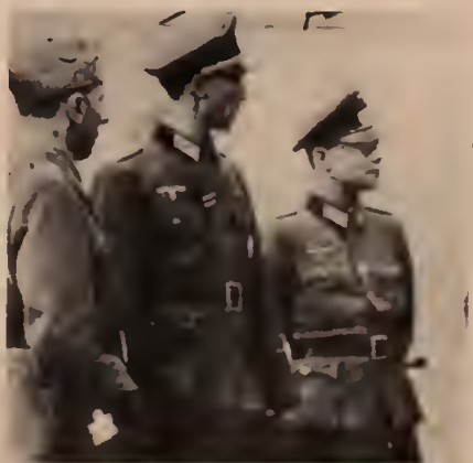
World Jewish Congress

Even given our fundamental differences with the Yugoslav Stalinists, whose later "market socialism" policies paved the way for the triumph of counterrevolution, we Trotskyists stand with the tradition of Tito's Partisans against those like the LRCI who have grossly defended in turn Ustashi-loving Croatian nationalists and Chetnik-loving Serbs. Now they are calling for "the establishment of military control of all and any areas within Bosnia-Herzegovina by Muslim forces" and demanding "unconditional military aid to the Bosnian Muslims" ( Workers Power , December 1992)!