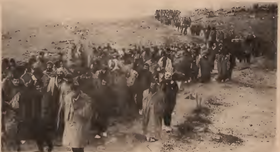
More than 400 Palestinians rounded up and dumped in freezing wasteland on Lebanese border.

the Lebanese government massing tanks to block the deportations, the Palestinians are penned in on a strip of freezing wasteland, with no shelter other than tents from the Red Cross, while facing mortar fire from the Israelis' puppet "South Lebanese Army."