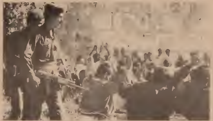
Israeli Arabs protesting in January 1988 (left) against then war minister Yitzhak Rabin's "iron fist" repression against Palestinian Intifada .

ents to the conference table. The beginning of the "peace" talks in Madrid last year was hailed as a victory by the PLO, which offers the Palestinian people nothing more than appeals to innumerable pious-sounding United Nations resolutions and endless hot-air "negotiations" with the Zionist killers. When the PLO threatened to suspend the talks in protest against the deportations, an Israeli official arrogantly taunted "They will surely come back to the table because they know that this is their last chance."