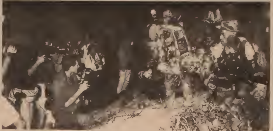
Pentagon's orchestrated "photo op" backfires as phalanx of reporters besieges Navy commandos, blinding them with TV lights.