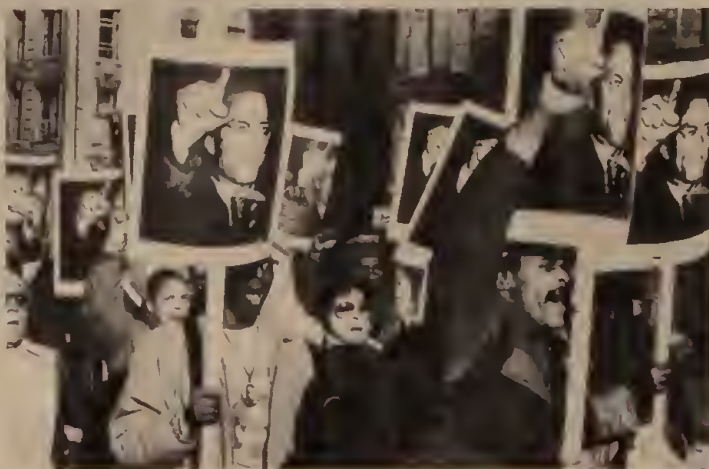
Demonstrators honor Malcolm X at February 1990 protest to save Audubon Ballroom (above). Protests against Columbia's plans to build a gym in Morningside Park (below) fueled 1968 student strike.