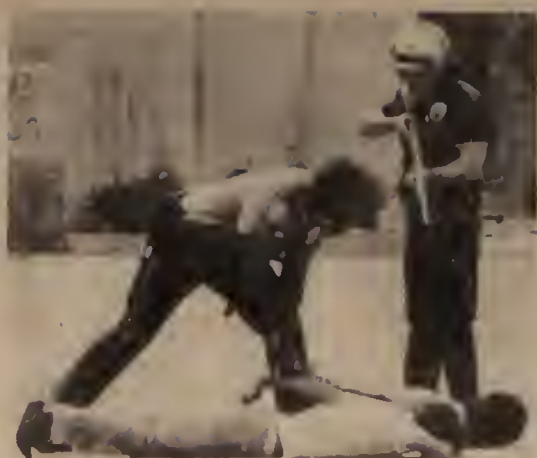
Racist cops of capitalism gunned down 120 people in Los Angeles in 1990 alone.

While they were accused of aiding the "Trotskyite-Zinovievite criminals," they were not just former "deviationists" (the actual Trotskyists were long gone). Rather, except for Ulbricht and Wilhelm