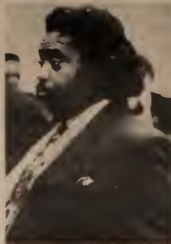
Finks come in all shapes and sizes.