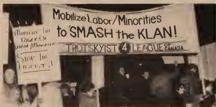
Unionists, minorities, students massed at Vancouver Art Gallery. Spartacists had called for massive labor-based mobilization to stop the fascists.

When word ran through the crowd, as the rally was winding down, that skinheads had been sighted at the Century Plaza Hotel, hundreds took to the streets, joining with the Trotskyist League of Canada and Partisan Defense Committee in chanting, "Stop the Nazis, this is the hour! Labor, minorities have the power!" As the 500 marchers neared the hotel,