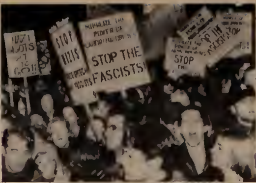
Hodge Vancouver Sun

The Vancouver local of the Canadian Union of Postal Workers voted unanimously to endorse the TL/PDC call, issuing a leaflet calling for labor/minority mobilization, and sent a capable squad of union members to the demonstration. The International Longshoremen's and Warehousemen's Union Local 500 put out their own leaflet as well, which was posted all over the waterfront, calling on longshoremen to go "All Out to