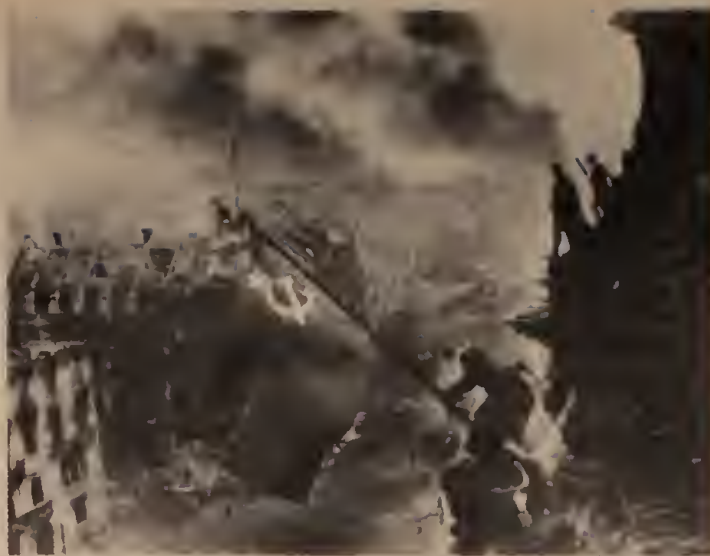
30 April 1945: Red flag raised over the Reichstag as Soviet troops vanquished Nazi Third Reich.

According to the bourgeoisie's penal code, the swastika is banned. But who would expect the self-proclaimed successor state to the Third Reich to take action against Nazi symbols? In reality its police protect the Nazis in their assaults on refugee hostels, while the victims of the Nazis are either deported or made out to be criminals. Behind the outcry against "violence" and "extremism of the right and the left" stands the racist persecution of refugees and immigrants as well as expanded police repression against anti-fascists. This is why the call for "more police" and for banning the fascists by the PDS (Party of