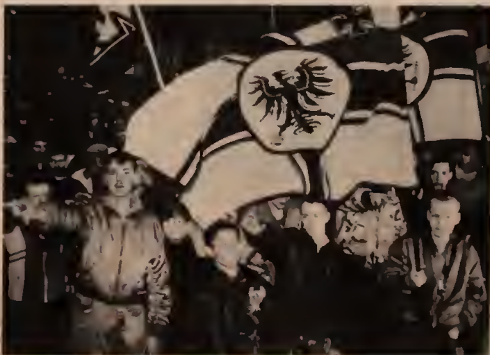
Nazi skinheads in Halle, November 1991. For worker/immigrant defense against fascist terror!

And the "order to shoot"? The widely publicized 1991 book by Peter Przybylski, Tatort Politbüro: Die Akte Honecker (The Politbüro Case: The Honecker File) , claims: "The minutes of the 45th meeting of the National Defense Council of 3 May 1974 show that the chairman Honecker literally stated: 'As before, with attempts to break through the border, weapons must be ruthlessly