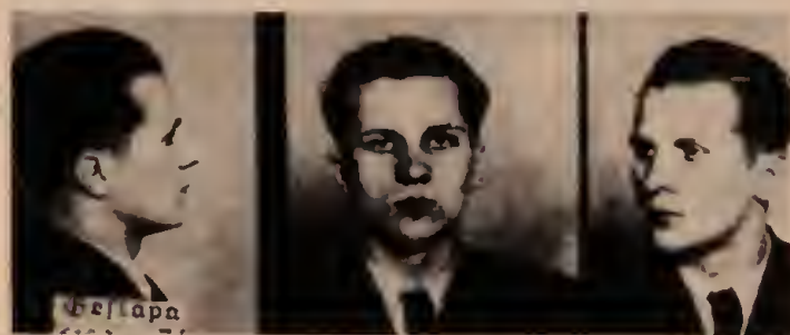
Gestapo mug shots of Erich Honecker in December 1935. Honecker was imprisoned for ten years by the Nazis.

But while Honecker refused to bow to the judges, and told home truths about the capitalist system they represent, this unrepentant Stalinist showed that, like the Bourbons, he had "forgotten nothing