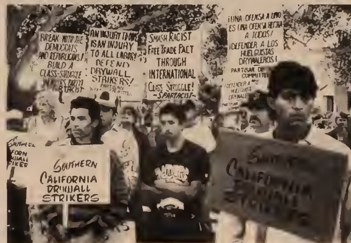
Striking San Diego drywallers protest police repression at rally on January 23.

WV replies: The six-month-long strike by Southern California drywall workers