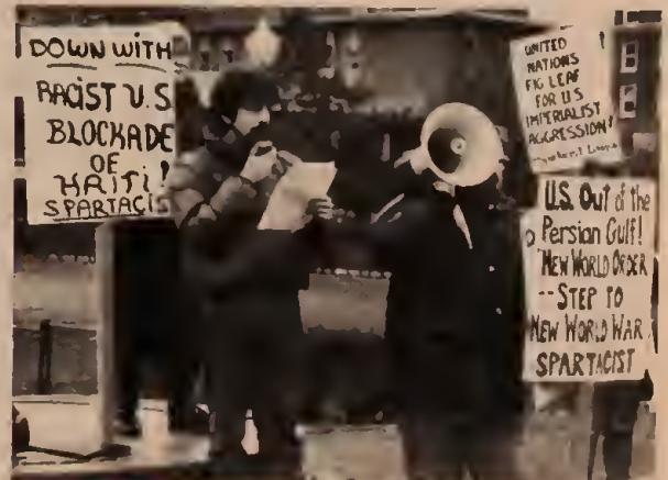
Spartacus Youth Club rally at Columbia University, January 21.

Anti-imperialism abroad means class struggle at home! Join the Spartacus Youth Clubs! ■