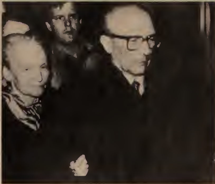
Former East German leader Erich Honecker being arrested by vindictive West German bourgeoisie in 1991.