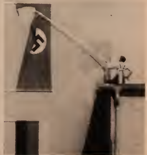
23 June 1992: Our comrades rip down swastika flag near Berlin's Brandenburg Gate.