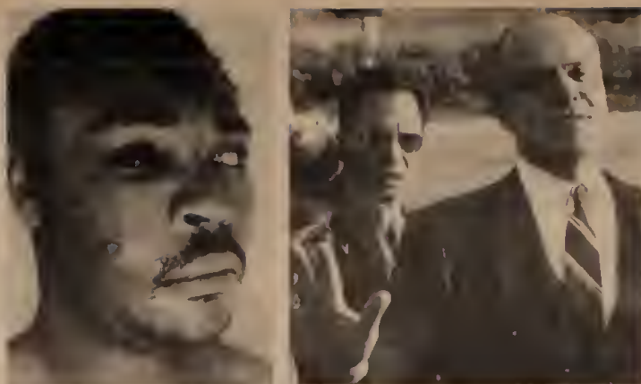
Rodney King, following sadistic cop beating. Right, Sgt. Stacey Koon, smirking during first trial in white enclave of Simi Valley.