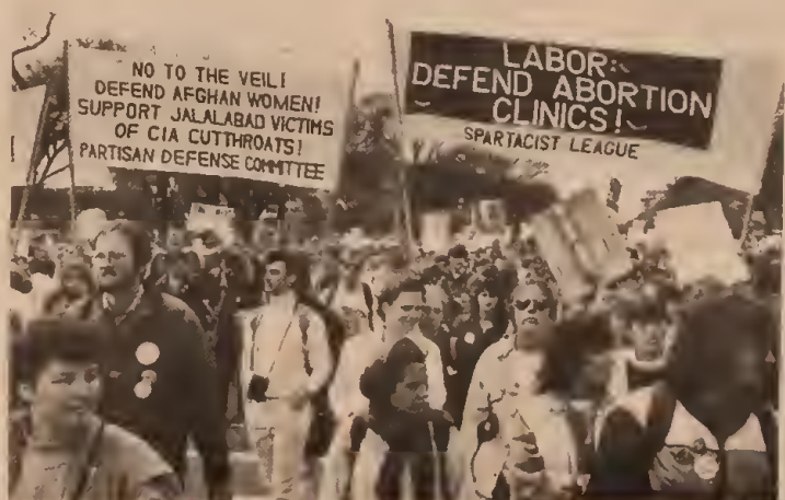
ICL waged campaign on behalf of besieged Afghan city Jalalabad.