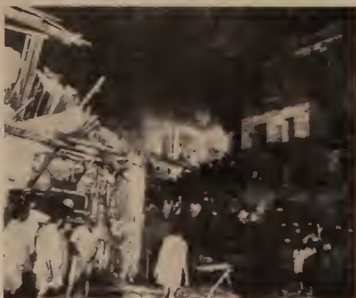
As terror continues to sweep India, scores were killed in Calcutta last month as a bomb leveled two apartment buildings.

What happened in Bombay is now no secret to liberate people in India. Press in Maharashtra was not free to print the truth, but then Bombay is a cosmopolitan city and Shiva Sena's original (initial) targets were not Muslims but non-Maharashtrians. So the press in other states has not hesitated to reveal their crimes and that of their allies. As for the events in Calcutta, the press has published a lot attacking the police and the miscreants. BJP is trying to raise its ugly head in West Bengal but has not achieved much success so far. While there was much trouble in certain parts of Calcutta,