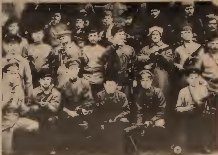
The dictatorship of the proletariat: Red Guards and Baltic fleet sailors in Moscow, October 1917.

The Bolsheviks, as the conscious vanguard of the proletariat, made clear their intent to collectivize the economy from the outset. But even in the case of social overturns led by petty-bourgeois Stalinist forces, the nationalization of the means of production did not necessarily mark the creation of a (deformed) workers state. In China and South Vietnam, protracted and bloody civil wars meant that by the time the peasant-based Stalinist forces took power, there was no viable section of the bourgeoisie left with which they could form a popular front and they were thus forced to rule in their own name. Yet those remnants of the Chinese bourgeoisie which did not immediately flee to Taiwan were not expropriated until late in the Korean War (1953). The Hanoi regime did not col-