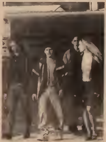
Kalkaska, Michigan: Students sent home as schools shut down for lack of funding.

In The ABC of Communism , Nikolai Bukharin and Yevgeny Preobrazhensky noted that in bourgeois society the educational system first of all "inspires the coming generation of workers with devotion and respect for the capitalist régime," and "creates from the young of the ruling classes 'cultured' controllers of the working population." In contrast, the young Soviet republic created the unified labor school and established that "instruction and education must be united with labor and must be based upon labor.... We can more easily un-