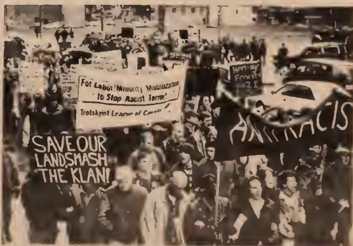
April 2: Trotskyist League contingent joins hundreds of Toronto youth in march protesting fascist schoolteacher.