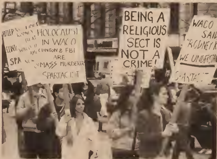
New York City federal building, April 19: Spartacists immediately organized international protests after Clinton government massacred members of small religious group in Waco, Texas.