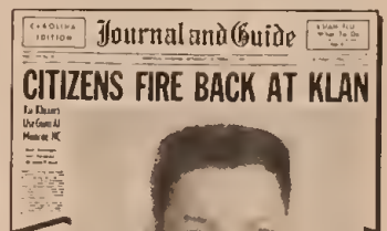
The Crusader Robert F. Williams, hounded by FBI for advocating black self-defense, was given asylum in Cuba.

To return to Carlos Moore, he sees Cuban politics as a fight between Hispanics and blacks, says that revolution "duped" blacks, and downplays their central role in the revolution. Moore cites repression of Afro-Cuban religious groups, and in fact these groups were viewed apprehensively in the early days. He is also a hard opponent of Cuba's intervention in Grenada and Angola, claiming that because of the presence of Cuban troops in Angola the South Africans might have used nuclear weapons against black Africans! These are cynical