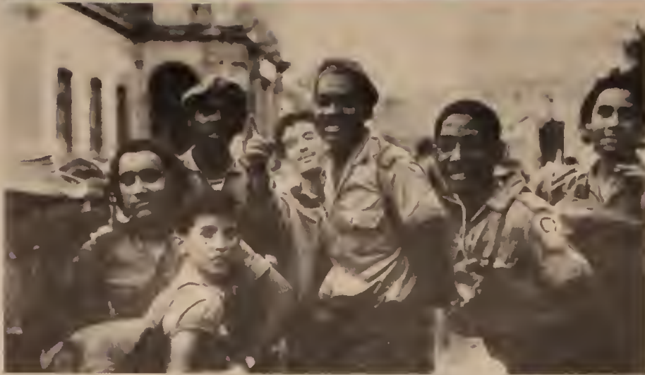
Literacy brigades, Havana 1961. Blacks, poor benefited most as Cuban Revolution overthrew capitalist misery and oppression.