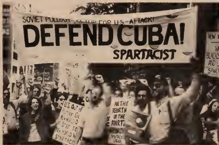
Spartacist solidarity demonstration outside Cuban UN Mission in New York, September 1991, protesting Gorbachev's treacherous withdrawal of Soviet aid.

to be an effort to demonstrate U.S. power to its imperialist allies (as in the Persian Gulf War), and recolonize a part of Africa in the process. And on the other hand you have this "peace" agreement between the Zionist state of Israel and the Palestine Liberation Organization. Yasir Arafat's PLO received considerable support from the Soviet Union and the Soviet client state of Syria, as well as from the Saudis and other Gulf "oil" states, as we dubbed them. After the Gulf War against Iraq, which the U.S. never would have dared undertake as long as the Soviets were a factor, this all dried up. So now you have a "peace" of the oppressor, in which the PLO is to police the Palestinians on behalf of the Zionist masters, and paymasters. And it will be signed in