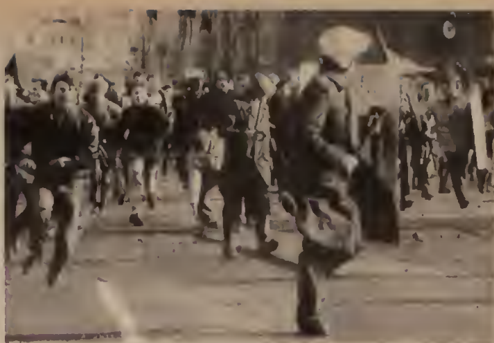
October 3: Anti-Yeltsin forces rolled over riot police, but pro-capitalist parliament leaders feared civil war and Western disapproval.

When Yeltsin took over the Kremlin and then announced the dissolution of the Soviet Union in late 1991, Western