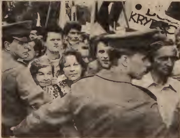
Ravages of capitalist restoration: striking workers from Ursus tractor factory march in Warsaw, August 1992.

Four years after their Stalinist predecessors surrendered power to Solidarność, ushering in the destruction of the bureaucratically deformed workers state, the "renovated" Social Democrats (SdRP) who dominate the SLD look set to take the reins of government in a now capitalist Poland. Coming after an electoral victory by ex-Stalinists in Lithuania,