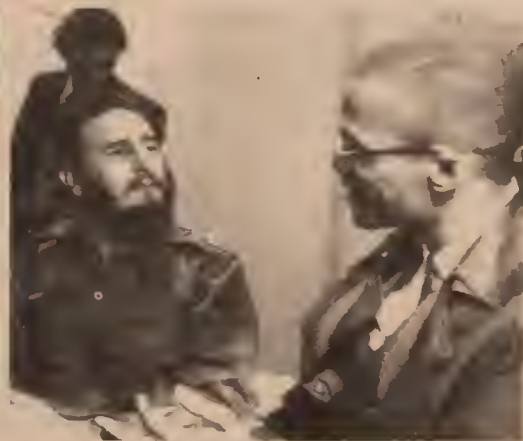
September 1960—Harlem greeted visit of Castro, who met with Malcolm X at Hotel Theresa.