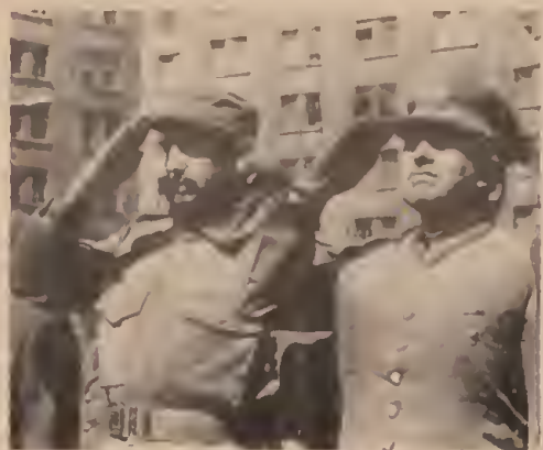
Castro praised Allende's "peaceful road" in Chile. Shown here with General Augusto Pinochet, "constitutional officer" who carried out bloody September 1973 coup against popular-front government.

During July they held a meeting of the Latin American left in Havana, the "Forum of São Paulo." Not even a hint of aid to revolutionaries elsewhere in Latin America. On the contrary, Castro spent most of his speech telling stories