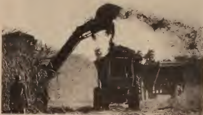
Cuba ended semi-slave conditions for agricultural workers and developed sugar combine, mechanizing cane harvest. But after cutoff of Soviet fuel millions of tons went unharvested.

Meanwhile, there is a whole layer of so-called "yummies"—the "Young Upwardly Mobile Marxists" who want to make it even if the system alters its social content to go over to a capitalist economy. These are the people who are currently in these economic think tanks, whose career choice is to be the Gaidars of the counterrevolution in Cuba—like Yeltsin's "Harvard Boy" in Russia. Right now they are advising the regime with