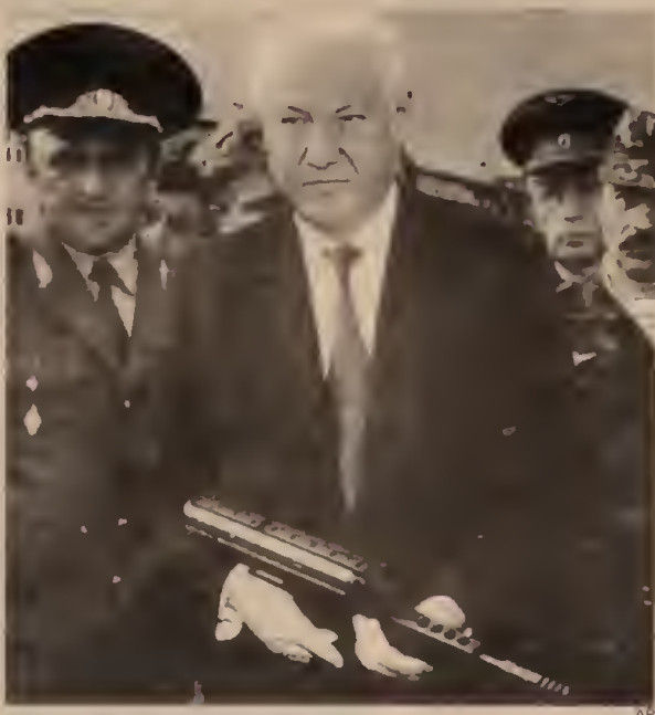
Boris Yeltsin, goaded by Clinton and IMF paymasters, ordered storming of Russian parliament.

The tank shells slamming into the "White House" on the morning of October 4 were the opening shots of a bonapartist regime aimed at brutally suppressing any kind of resistance to "free market" immiseration. For months, Western capitals and the world bankers cartel, the International Monetary Fund (IMF), have been pushing Yeltsin to clear out the obstacles to deepening the economic "shock treatment," whose next stage is mass layoffs of millions of workers and devastation of industry. Two days before Yeltsin decreed the dissolution of the parliament on September 21, the IMF put a scheduled $1.5 billion loan to Russia on hold until the government carried out promised economic "reforms." The U.S. threw its full backing behind Yeltsin's coup. Hours before the military assault on the parliament, the view from