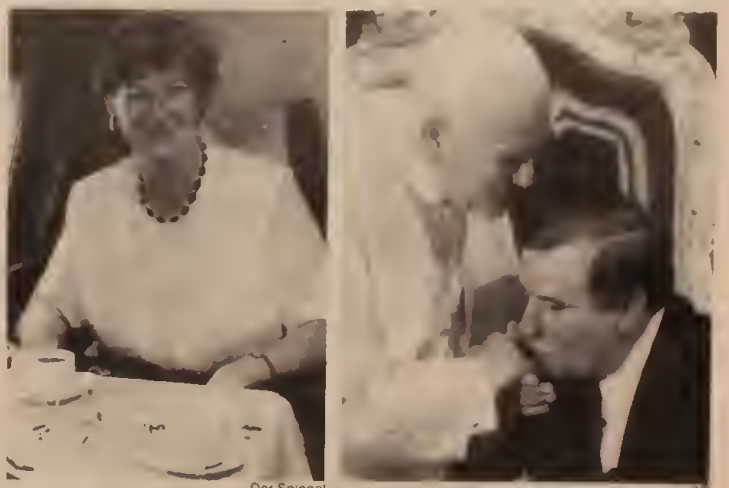
Voters massively rejected Thatcherite prime minister Hanna Suchocka and Lech Walesa, shown kissing hand of his godfather, Polish Pope John Paul Wojtyla.