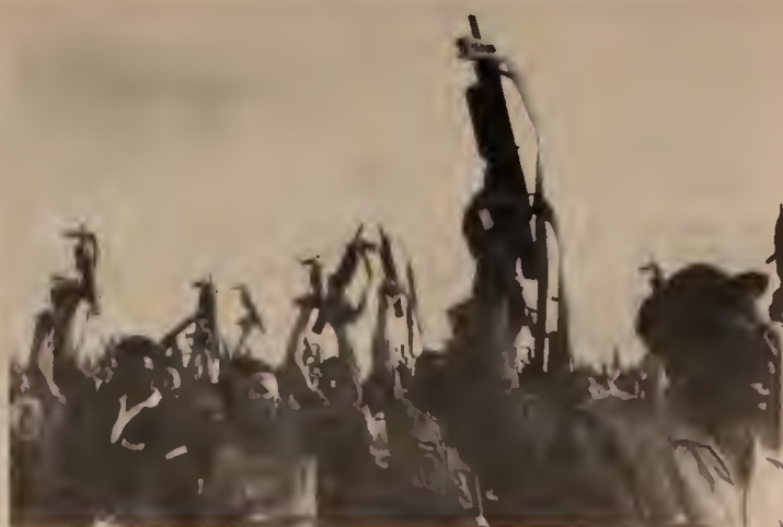
Heroic Cuban fighters celebrate victory over U.S.-backed invaders at Bay of Pigs (Playa Glorón) in 1961.

There is a kind of internationalist awareness, with people proud of Cuban intervention in Angola and, for example in a sugar mill we visited, of building sugar mills in Nicaragua and Vietnam. Yet this is still Cuban nationalist in content rather than proletarian internationalist. So that while Castro presented Nicaragua with a sugar mill, he also told the Sandinista leaders a week after they took power that Nicaragua should not be "a second Cuba"—in other words, no social revolution. Just as he told Chilean