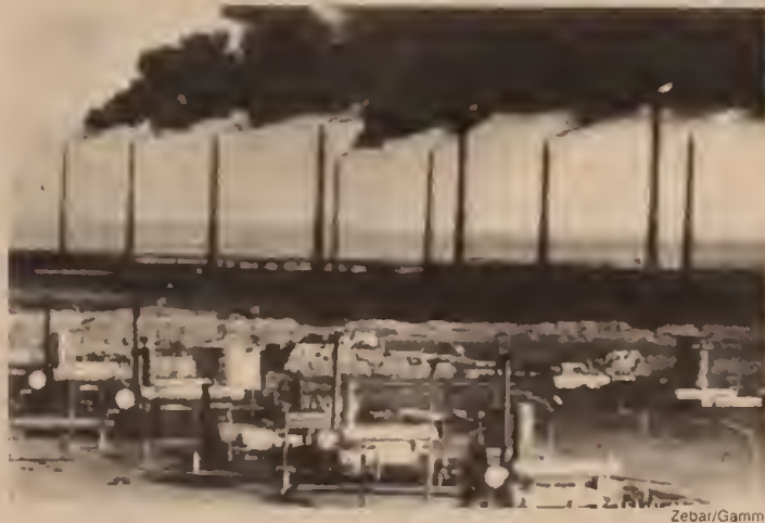
Workers in economically strategic petroleum industry are bastion of the small but powerful Algerian proletariat.

Muslim fundamentalism was bolstered by the FLN and the Family Code which it put forward in the 1970s. The debates which followed served as