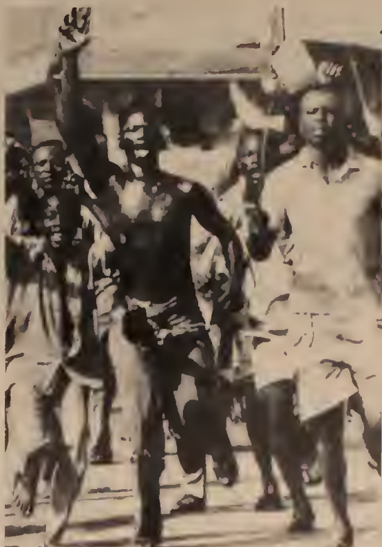
Lagos: Thousands demonstrate in June against annulment of presidential election. Nigerian strongman General Babangida (above right) refused to turn power over to wealthy businessman Chief Abiola (below right).

Since 1986, Babangida's regime, in its attempt to negotiate the rescheduling of Nigeria's massive debt of $34 billion to Western bankers, has imposed a highly unpopular "Structural Adjustment Programme" on the workers. To defuse political opposition, the military junta promised on and off to hand over power to an elected civilian government. Eventually they allowed elections to take place in June, a process that combined breathtaking buffoonery with murderous repression. The military regime set up