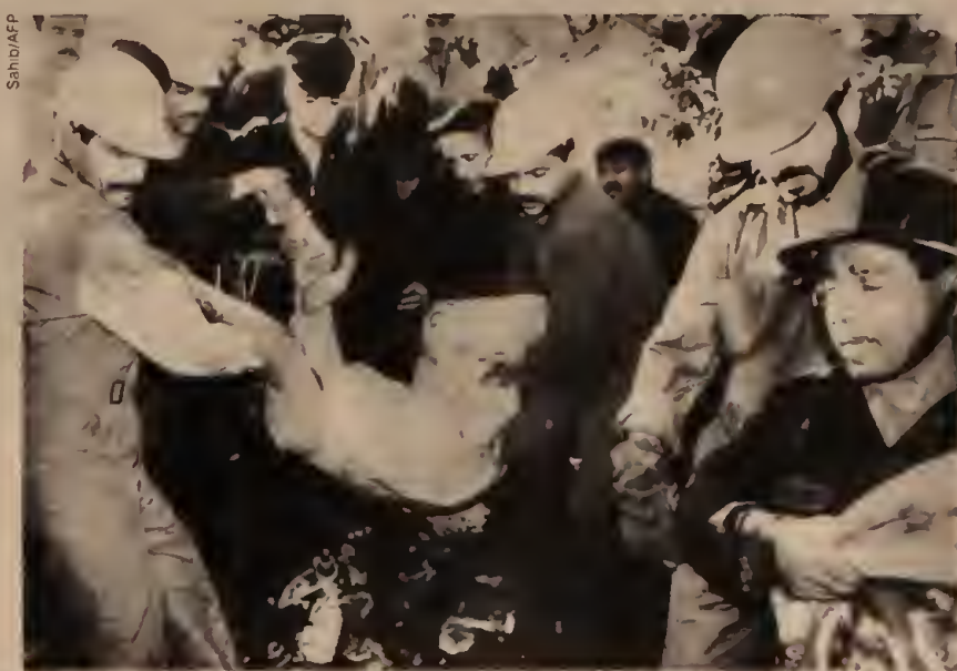
Baghdad, June 26: Victims pulled from the rubble after U.S. Tomahawk cruise missiles slammed into residential neighborhood.

the-clock surveillance by the Kuwaiti police." Not until four days after the arrests was a "plot" allegedly "discovered," when confessed smuggler Wali al-Ghazali told a tale of being "sent into Kuwait by Iraqi intelligence to kill Bush." Despite imprisonment and torture, not one of the other prisoners admitted knowing anything about an assassination plot.