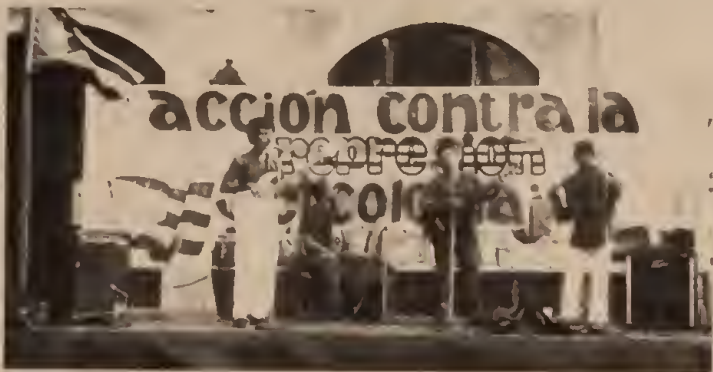
1988 rally in San Juan protesting colonial repression against independentistas.

It is certainly correct for revolutionary socialists to denounce the fraudulent character of the referendum as a cover for colonialist rule. Revolutionaries could not support any of the three options since all specified continued U.S. military occupation of Puerto Rico. As evidenced by the substantial participation in the vote (73 percent of registered voters), a mass boycott was not a real possibility. Quite aside from the election, in the face of the Puerto Rican masses' justified fear that bourgeois independence would mean immersion in the nationalist politics of these "socialist" independentistas means that they have no perspective to offer to the Puerto Rican proletariat. The same despair of achieving mass support has produced futile adventures such as the Jayuya uprising of 1950 by Pedro Albizu Campos' Nationalist Party, and the Puerto Rican nationalists' armed attack on the U.S. Congress in 1954. In