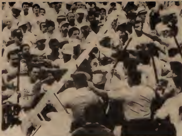
UTIER electrical workers clash with police during one-day general strike to protest privatization of telephone company in 1990.

Last November's elections also marked a serious defeat of the bourgeois independentistas of the PIP led by the lawyer Rubén Berrios, which only succeeded in electing two candidates to the legislature. But the decline of the PIP, which is part of the social-democratic Second International, did not benefit rad-