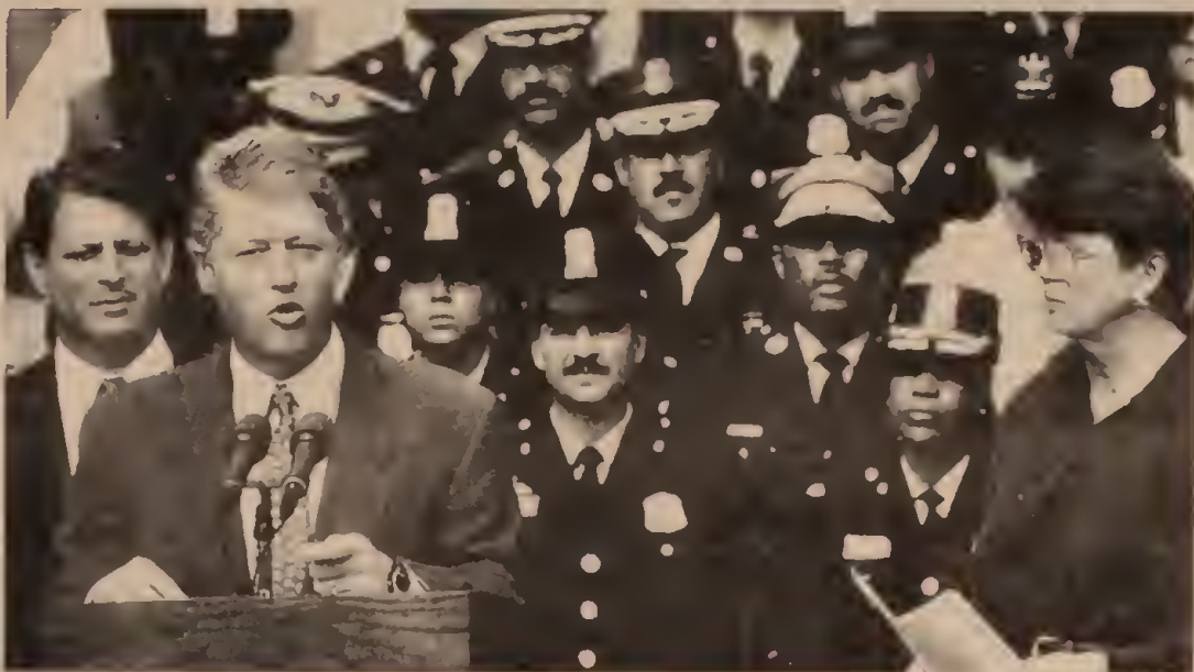
Clinton and his top cop Janet Reno (right) plug "crime bill" for 50,000 more cops, boot camps for minority youth and speedup on death row.

Despite his paper-thin vote margin, the election of Reagan Republican Giuliani as mayor in an overwhelmingly Democratic, heavily multiracial and traditionally liberal city is a sign of the times in racist America. For the first time in two decades, not one of the country's five largest cities will have a black mayor, as white racist candidates march into city halls and state houses. Offering nothing to the dispossessed black masses but police batons and bullets, the ruling class is dispensing with its black plantation overseers. Washington-based British journalist Martin Walker put it bluntly: "the one constant theme in every mayoral election is that crime is the issue. 'Crime' these days is the code word for race" ( London Guardian , 30 October).