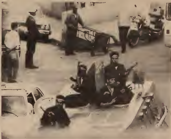
The streets of Algiers under the state of emergency, declared by the army in January 1992 after fundamentalists swept elections.

The regime has progressively lost any semblance of control since the assassination of President Mohamed Boudiaf in June 1992. A curfew is in force in ten wilayas (districts) and last April 15,000 troops were sent to reinforce the special forces of the gendarmes and police in and around the capital. Mixed assault squads of police, gendarmes and army special forces wearing black jumpsuits and ski masks, nicknamed "ninjas," cordon off whole districts and brutally search the population while attacking homes of "suspects" with rockets. Faced with the rise of Islamic fundamentalism, the HCE (High State Committee) front for the military is on its last legs. Imagining themselves to be spiking the fundamentalist danger, they can only answer with desert concentration camps holding up to 2,000 prisoners, prison terms ranging from five years to life, and meting out 350 death sentences. So far this year