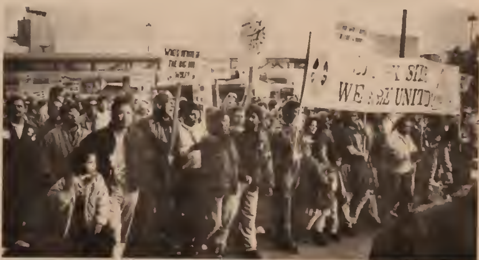
Angry United Airlines workers protest at SF airport, November 12. Inspired by Air France strike, many chanted "Take the Runways!"