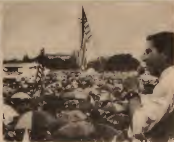
San Juan—As the National Guard occupies housing project under guise of "war on drugs" (left), Puerto Rican governor Pedro Rosselló campaigned for statehood.