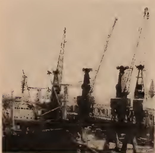
Port of Algiers was paralyzed during week-long dockers strike last July. no credit

In Algeria, the fundamentalist reactionaries of the FIS feed off the deep economic crisis which is ravaging the country as the FLN's bourgeois nationalism is revealed as utterly bankrupt. But an Islamic fundamentalist regime, despite anti-Western rhetoric, would still be beholden to imperialism—witness the Islamic republic of Pakistan, the Islamic monarchy of Saudi Arabia or Iran's cooperation with the German Fourth Reich. In turn, the rise of Muslim fundamentalism in Algeria bolsters anti-immigrant reaction in France, where workers of North African origin are a key component of the working class. Le Pen's fascist National Front portrays North Africans as backward religious fanatics as it whips up its shock troops in murderous racist attacks. And the regime of "socialist" president Mitterrand cohabiting with the conservative government of Balladur is tightening up its borders to choke off immigration from North Africa and elsewhere. In early November, French authorities rounded up more than 88 people accused of