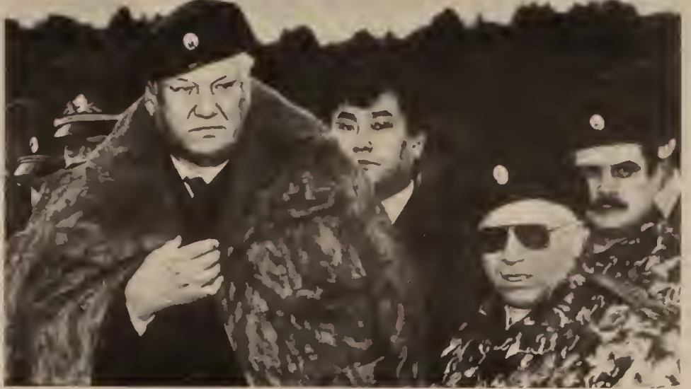
Would-be dictator Boris Yeltsin after the bloody storming of the Russian parliament White House last October.

Also getting a sizable vote was the refounded Communist Party-Russian Federation (KPRF), which despite its name made utterly clear that it stands for a capitalist market economy. While Yeltsin claimed a majority for his constitution, the regime's own figures of a paltry 53 percent voter turnout was effectively an admission of defeat. Notwithstanding the seemingly strong vote for Yeltsin's nationalist and Stalinist opponents, the new pseudo-parliament is designed to be nothing more than a sounding board for the president's