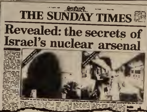
Mordechai Vanunu's revelations in 5 October 1986 London Sunday Times exposed that Israel had hundreds of nukes. Left: Following his abduction in Rome by the Mossad, the courageous nuclear technician flashed message to reporters from police van.

The following letter has been submitted to the New York Times.