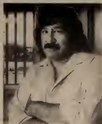
American Indian Movement leader Leonard Peltier.

Around the world, Peltier has come to symbolize racist American injustice