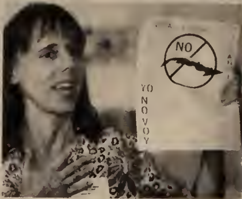
Members of group defying ban on travel to Cuba received gusano death threat (shown at left), had passports confiscated by U.S. Customs agents.