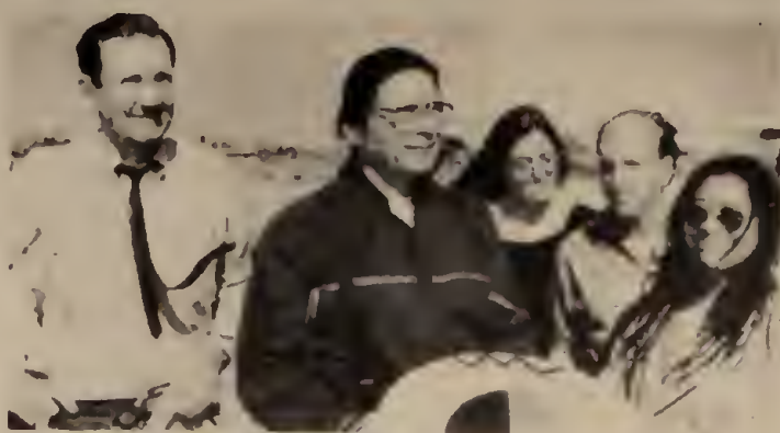
Former U.S. attorney general Ramsey Clark, AIM activist Dennis Banks, and author Alice Walker arrive in Havana last May with a shipment of medicine.

"A broad spectrum of reformist leftists in the U.S. and elsewhere have joined forces in a Cuba solidarity movement. For example, people like the 'Committees of Correspondence,' a social-democratic split-off from the Communist Party USA, for whom this waving of the flag of Cuba solidarity is a cheap way of disguising their flight to the right. Because in the 'Cuba solidarity' movement there are now active openly counterrevolutionary forces. There was a recent 'caravan for peace' which got a lot of publicity in Cuba (and very little here) because the American authorities stopped it at Laredo on the Mexican border and wouldn't let it go through. The 'Pastors for Peace' who organized it made a big point of how they were carrying Bibles as well as medicine. But the dead giveaway was the presence on that caravan of one Ramsey Clark, the former attorney general under Lyndon Johnson who ordered the Chicago cops to beat