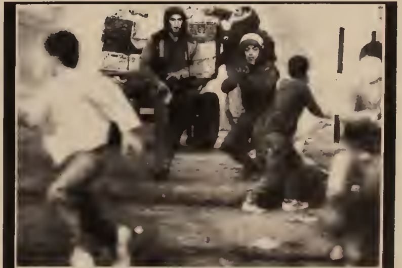
"Peace process" In action: Israeli soldiers take aim at Palestinian youth in Gaza.