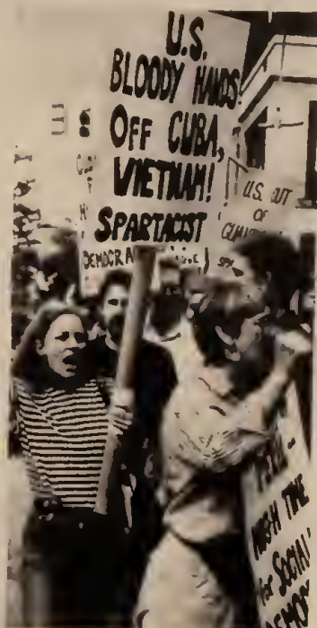
New York, September 1991: Following Soviet cutoff of aid to Cuba after Yeltsin's August '91 counter-coup, Spartacist League demonstrates in defense of Cuba.