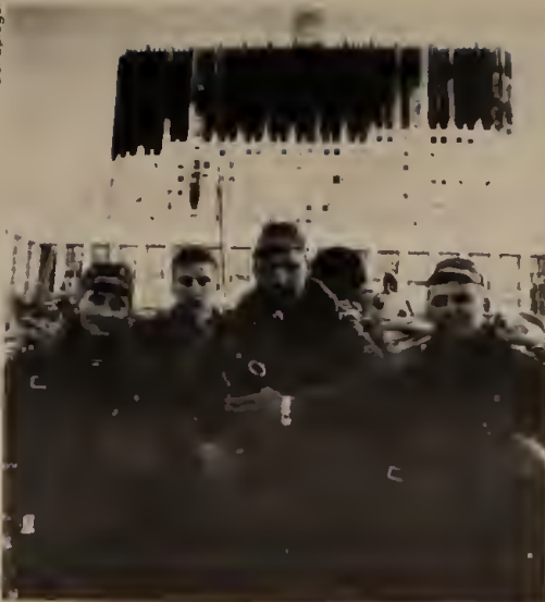
Troops guard charred "White House" after Yeltsin ordered storming of parliament.