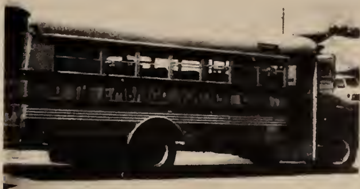
The "Little Yellow School Bus," held hostage by U.S. Customs in Laredo, Texas.