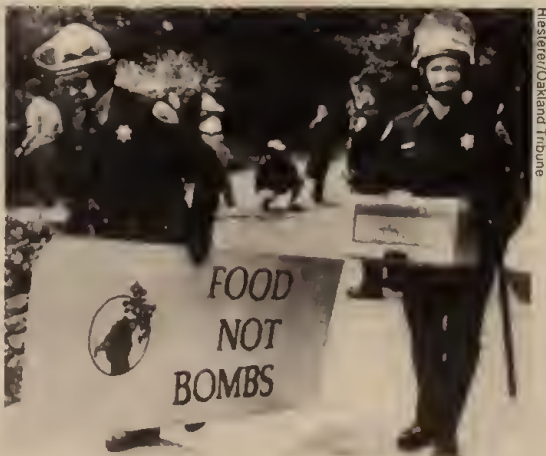
SF's Golden Gate Park, August 1988: "Food Not Bombs" has been hit with hundreds of arrests for distributing food to the poor.