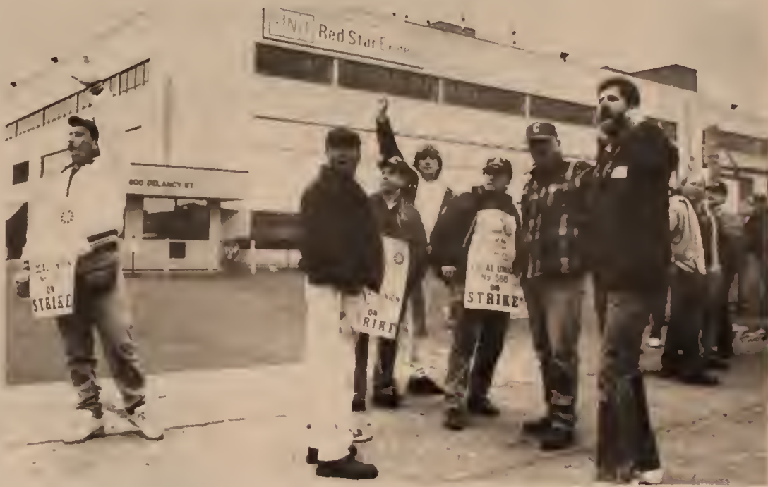
Port Newark, New Jersey, April 6—first day of national Teamsters strike. Strike all Master Freight carriers, pull out UPS, shut down non-union subsidiaries!

In North Reading, Massachusetts, a union picket line outside the Roadway terminal was hit by a paramilitary police