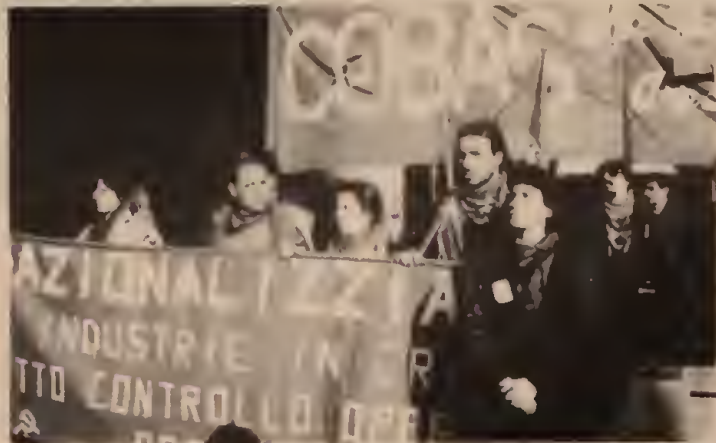
Workers at Fiat subsidiary Alfa-Romeo protest layoffs, while being bound by misleaders to popular front.

"The working class must remember its history, such as the demonstration in Genova in 1960 which stopped the MSI from holding its congress and which routed the fascist mass murderers."