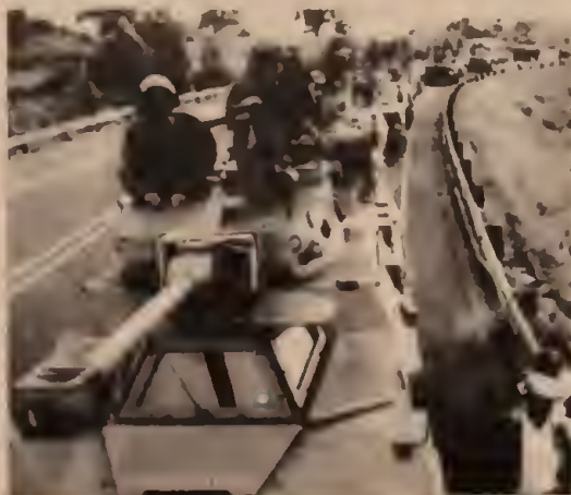
Racist South African army moves into Natal, where apartheid-funded Inkatha party wages terror campaign against elections.