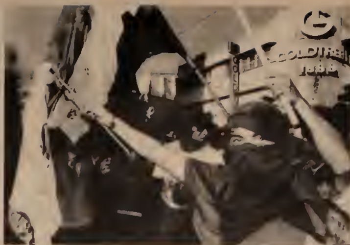
FMLN supporter in March 12 demonstration against ARENA campaign terror.

As a sort of consolation prize to the guerrillas for turning in their arms, so they could be led like sheep to the slaughter, the peace accords agreed to set up a "Truth Commission" which would tell what really happened during the 12-year civil war. The report of the Truth Commission was released in March 1993, and in November some 12,000 pages of declassified CIA, State Department and Pentagon documents were released under the Freedom of Information Act. Although still heavily sanitized, these sources detail and amplify what was known all along—the American rulers knew all about the workings of the death squads and genocidal army massacres, because they were financed, trained and monitored by the U.S. The cover-ups of the grisly deeds were orchestrated from the CIA's MILGP (military group), based in