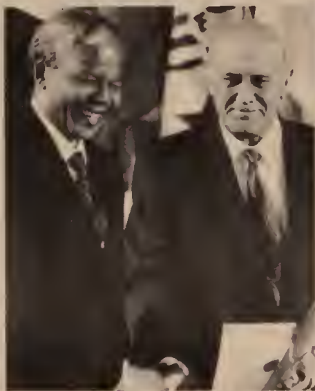
Nelson Mandela and F.W. De Klerk receive "peace prize," but blood flows in South Africa. Here, corpses outside ANC headquarters in Johannesburg after Inkatha tried to storm building.