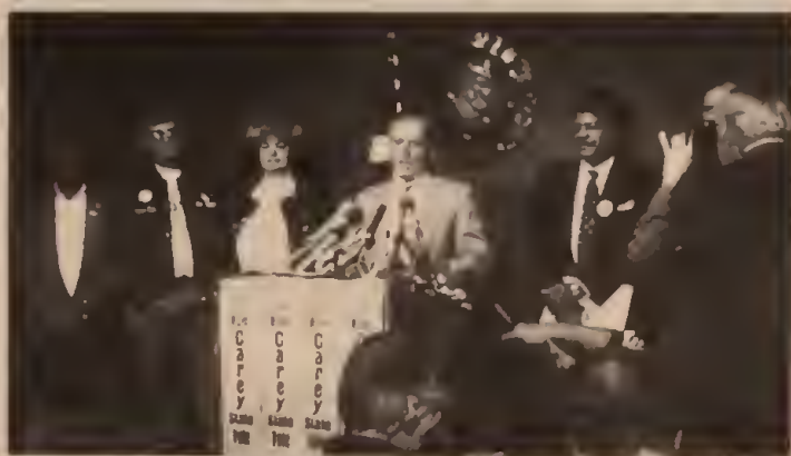
Ron Carey after becoming Teamsters president in government-run election, flanked by TDU vice presidents. TDU aided feds' attack on union.

A whole host of counterfeit socialists have backed TDU to the hilt. One of these social-democratic outfits, the International Socialist Organization, whose