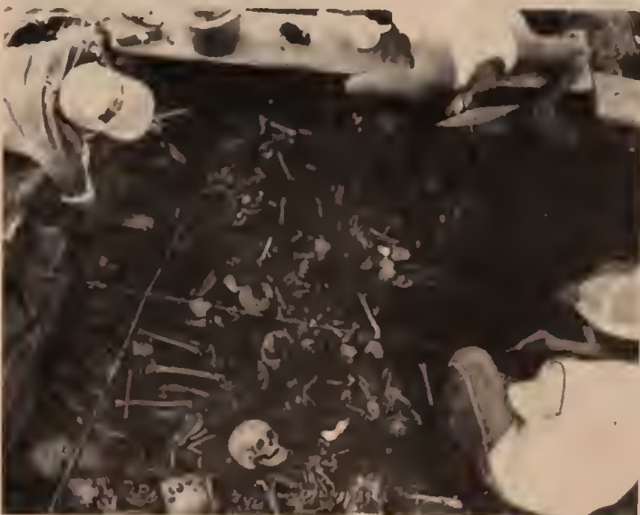
El Mozote massacre; UN excavators uncover site holding skeletons of 38 children, among hundreds gunned down by U.S.-trained killers of Atlacatl Brigade.