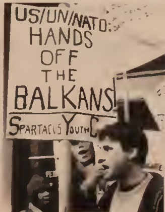
New York, April 12: Spartacists protest bombing of Bosnian Serbs.