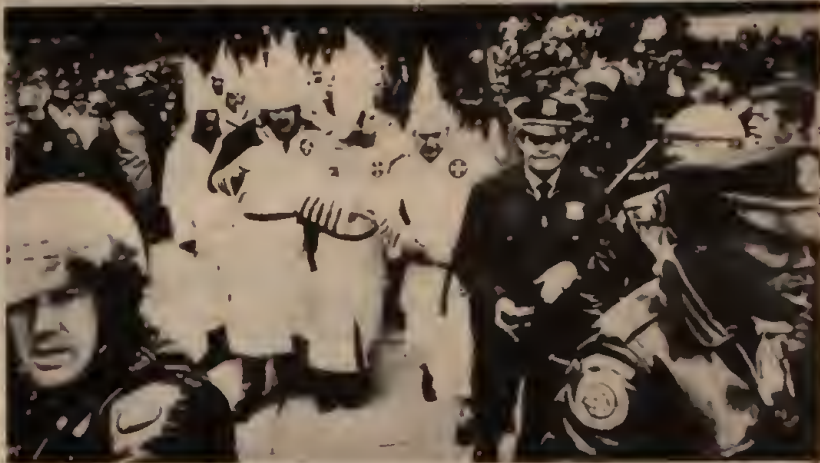
Boston's Government Center, October 1982: Spartacist contingent (left) in militant mass protest which drove out hooded Klansmen.