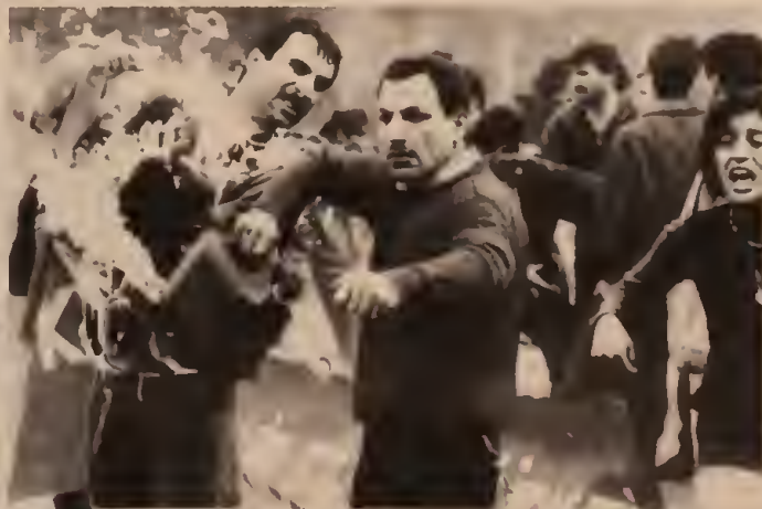
Protesting Turkey's genocidal war against the Kurds (left), desperate Kurdish protesters in Germany set themselves on fire.