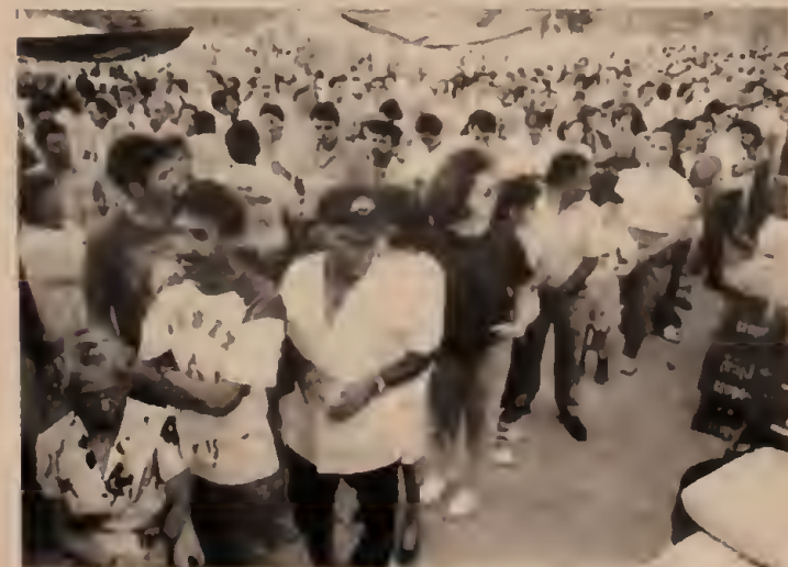
Democracy, Salvador-style: Thousands were left standing in line after polls closed, hundreds of thousands were left off voter rolls.

The press was full of talk of the "free play of democratic forces," of exchanging bullets for ballots. Yet the tightly knit Salvadoran bourgeoisie has simply entrenched its bloody rule through the use of its military force and its electoral system. As soon as the TV cameras and international press depart and the United Nations observers' (ONUSAL) mission mandate runs out in June, the killing will begin in earnest. Not that it ever stopped —on the contrary. Coinciding with the opening of the election campaign last November, rightist commandos escalated their murderous activity, shooting down one FMLN commander after another, on a weekly, then daily, basis. Among those killed were FMLN leader Heleno Hernán Castro, and five days later Francisco Veliz, an FMLN candidate for National Assembly killed while taking his year-old daughter to a day-care center.