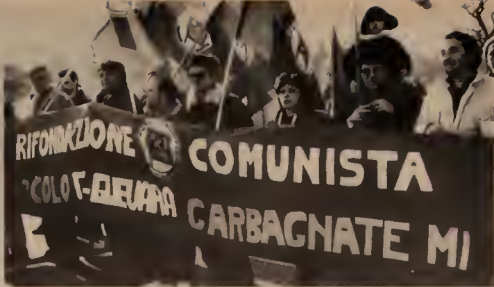
Rifondazione Comunista, left face of the popular front.

At the recent January congress, a third of the RC delegates expressed, in various ways, their opposition to involvement in