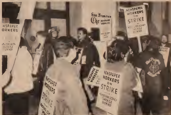
Workers picketing Chronicle/Examiner editorial offices as November 1 strike deadline expired.

This strike is a showdown battle for the working class in the Bay Area and nationally. After a year of being kept on the job without a contract, the newspaper workers were itching to fight back. At the main printing plant for the Chronicle , across the bay in Union City, unionists took care of business the night the strike finally began. Outnumbered cops were unable to protect the scab trucks. The next morning, the president of the San Francisco Newspaper Agency (SFNA), which puts out the two papers in a joint operating agreement, whined that his scabs were injured and their cars damaged