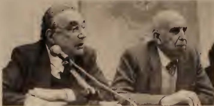
Ernest Mandel (left) with his mentor Michel Pablo at 1988 Paris meeting.

The Socialist Workers Party in the U.S., along with groupings in France and Britain, fought Pablo's revisionism, although belatedly. Weakened by the McCarthyite witchhunting of the 1950s and the aging of its central cadre, the SWP reunited with the Pabloites in 1963 on the basis of political support to Fidel Castro. With the SWP moving rapidly in the direction of full-fledged reform-