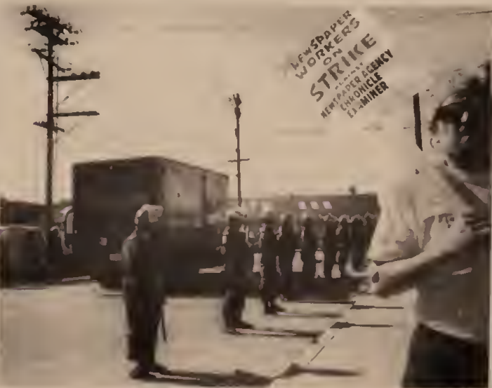
Line of cops protects scab trucks at Evans Street Chronicle plant.

The labor bureaucracy are the agents of capitalist rule. That’s why they can’t and won’t fight for the working class. Instead, they seek to tie labor to their exploiters through support to the Democratic Party. The workers need their own party, one which will fight for their interests and the interests of all the oppressed. Working people created all the wealth of this country. To claim the fruits of their labor and employ them to benefit the majority of this society, rather than for the profits of the few, requires breaking the power of the capitalist rulers. The multiracial working class has the numbers and the social power to do this. What’s needed is a leadership that will fight as a trine of all the oppressed, organizing the power of labor in its own interests and for its own rule through socialist revolution ■