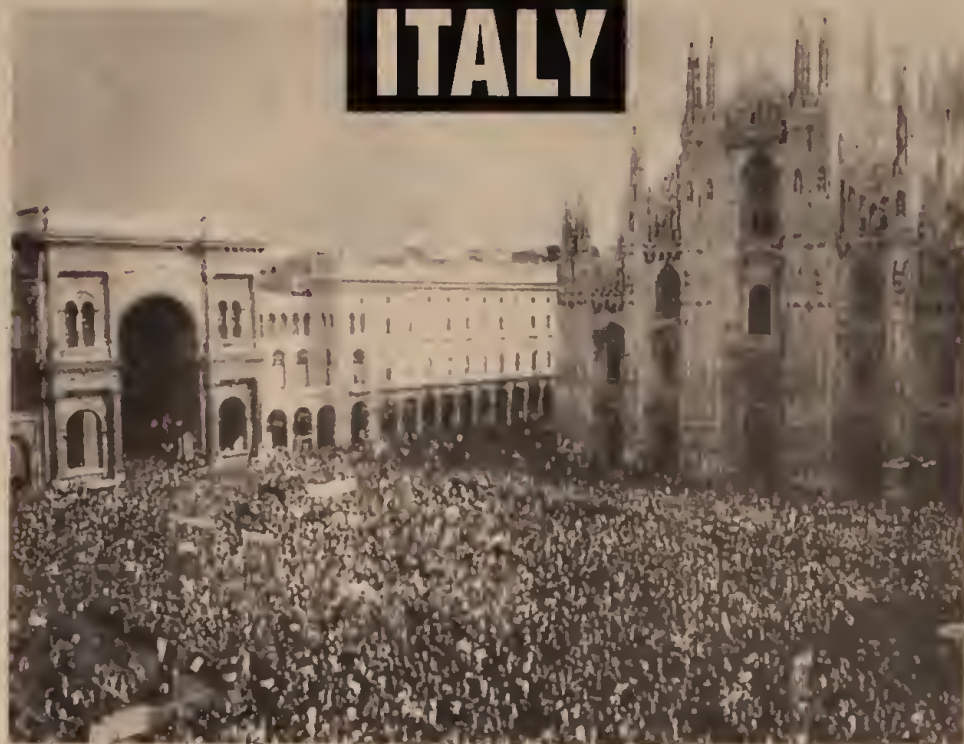
350,000 workers demonstrate in Milano during October 14 general strike against Berlusconi government's austerity attacks. Livio Senigalliesi