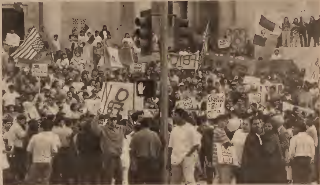
Los Angeles: Up to 2,000 high school and junior high students and garment workers marched to City Hall on November 7 to protest racist Prop. 187.