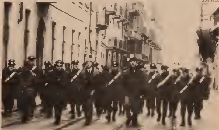
10,000 demonstrate in Rome (left) on April 25 on 49th anniversary of the overthrow of the fascist regime. Italian rulers now seek strong state, unleashing police against militant workers movement.