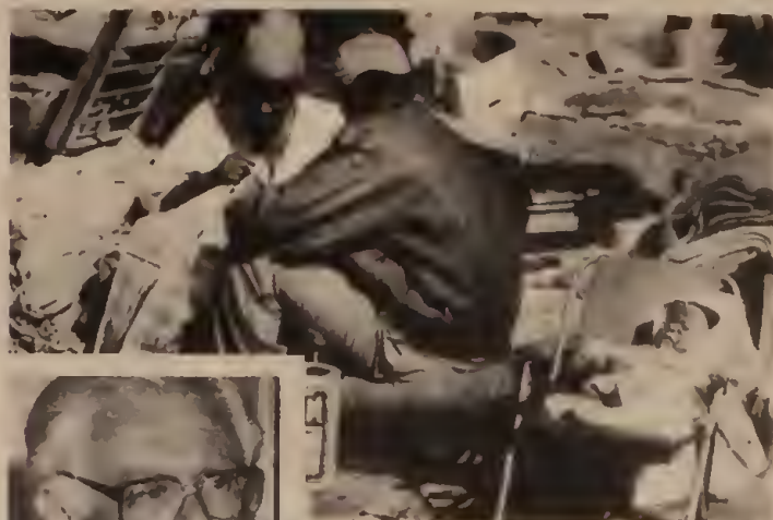
Johannesburg family left homeless after their shantytown was razed, as ANC government housing minister, Communist Party head Joe Slovo, oversees eviction of township squatters.

The internationalism symbolized by South African miners' aid to their British class brothers and sisters during the 1984-85 British coal strike is what is needed to win against the tremendous power of international capital. And this solidarity must go in the other direction as well: it is the duty of American and European workers to come to the aid of their South African comrades in struggle. So long as the workers are pulling the cart of nationalism, they cannot achieve amandla (freedom). ANC Ltd will not be their liberators. The South African workers' revolution shall inscribe on its red banners: those who labor must rule. ■