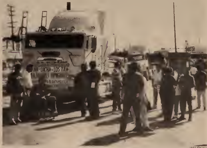
A 70-truck convoy of Latino truckers formed up at the Port of Los Angeles, November 7. Sign on cab reads: "Long Live the Immigrant Workers' Struggle—United Against Racism and Discrimination."

The provisions of Prop. 187 would attempt to make teachers act as finks for the hated migra immigration cops. Over 1,000 teachers in the L.A. Unified School District have already signed a pledge refusing to finger students if Prop. 187 passes, and teachers have par-