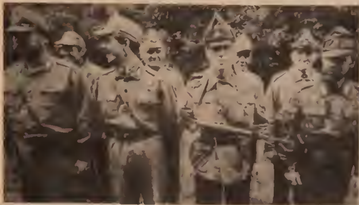
Fascist former members of Latvian SS units, which fought with Hitler's Wehrmacht against the Soviet Red Army, now flaunt their Nazi medals and celebrate the Holocaust.

To combat the social and economic degradation of the counterrevolution and the ensuing nationalist and communalist wars, the working class throughout the former USSR, centrally Russia, will have to rediscover and reawaken its own revolutionary tradition, which was destroyed by Stalinism. The proletariat which made the October Revolution learned from Lenin and Trotsky's Bolsheviks that it was part of an international struggle. It understood that the only prospect for survival lay in extension of the revolution to the advanced capitalist countries. Only as part of the struggle to reforge an authentic world party of socialist revolution can the working people in the lands of the former Soviet Union cohere the leadership they need to sweep away the horrors they now confront. ■