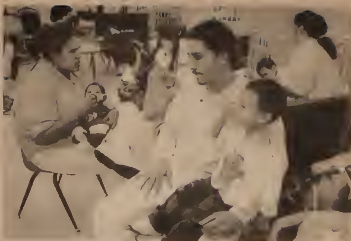
Every night, dozens of families are forced to sleep on the floor of the only emergency center for the homeless left in NYC. Giuliani's "reality therapy" will throw tens of thousands more onto the street.

Also targeted for a whopping $600 million cut are nearly 200,000 unionized city workers, who are being squeezed for "increased productivity" and threatened with a 10 percent pay cut to fund their health benefits. This swindle is being peddled with the lying promise of "job security." Giuliani thundered, "You don't have a vested right to hold on to a government job." Already, over 15,000 city workers have lost their jobs dur-