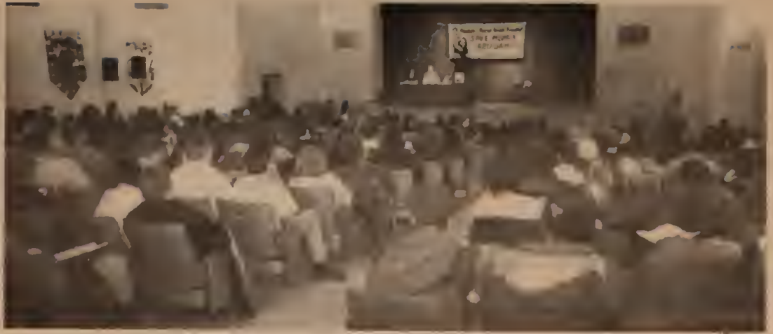
United-front rally drew integrated crowd of over 400 death penalty abolitionists, including trade unionists, socialists and students from throughout New York region.

opening remarks by Ossie Davis, co-chairman of the Committee to Save Mumia Abu-Jamal, galvanized Jamal's supporters. He linked Jamal's case with the historic struggles to free the Scottsboro Boys and Angela Davis. He stressed that it took mass political protest beyond the courtroom to defeat those racist frame-ups and that is precisely what is needed to save Jamal today. Davis put Jamal's case squarely in the context of the far-right turn of the U.S. ruling class, which has declared war on blacks, labor, immigrants and the poor. The death penalty is central to the intensifying political repression against minorities and dissenters, and Mumia Abu-Jamal's case is what the death penalty is all about: an attempt to terrorize the minority population and extend the extralegal terror of the KKK and summary executions by the cops on the streets with institutionalized racist murder.