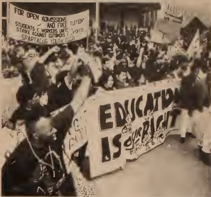
1991 City University budget cuts sparked massive student protests in New York. Above: Student strikers join march of tens of thousands of city workers.

In order to carry out any defense of the unions, to fight for housing for the homeless and health care for the poor, to beat back racist cop terror, it is necessary to challenge—and sweep away—the profit system and its apparatus of state repression. The situation cries out for Bolsheviks everywhere. There are no reformist solutions to the mess that capitalism has made of New York. The way out is the expropriation of the capitalist class by a workers government. ■