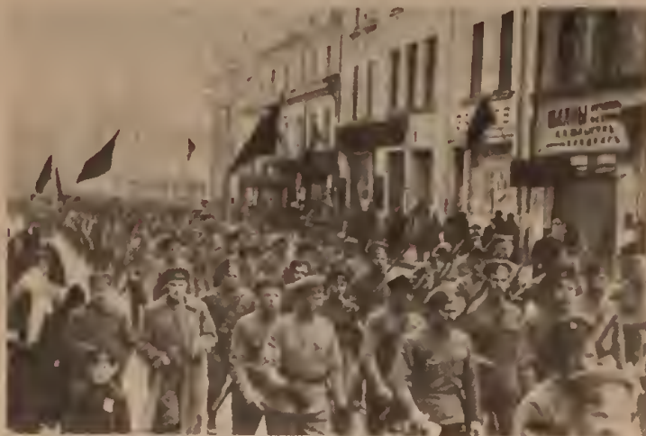
Latvian rifle battalions in Petrograd played heroic role in 1917 Bolshevik Revolution. Workers and farm laborers in northern Baltic region of the tsarist empire were stronghold of left-wing socialism.