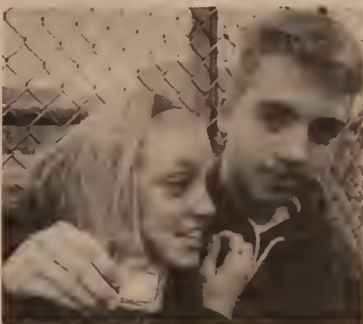
Students in Brooklyn display condom distributed at their public school. Such programs save lives, but reactionary anti-sex bigots want to shut them down.

lyn Elders as surgeon general last December. It was a move dictated by the right wing, which disliked this outspoken black woman's support for sex education, abortion rights and the decriminalization of drugs. Upright bigots demonized Elders as the "black condom queen" for comments like, "Look who's fighting the pro-choice movement—a celibate, male-dominated church" ( Washington Post , 10 December 1994). The event precipitating her dismissal couldn't be a more ludicrous indictment of the anti-sex mania of the "family values" agenda. At a United Nations-sponsored event com-