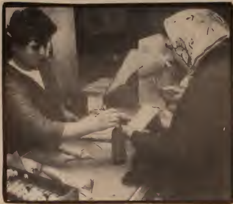
Breakup of Soviet Union has brought economic immiseration amid nationalist frenzy. Store clerk in Vilnius demands customer show Lithuanian passport to buy bottle of vegetable oil.

When independence brought not expected Western-financed prosperity but near-total economic collapse, the Lith-