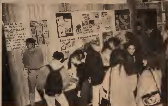
Young activists champion the cause of Mumia Abu-Jamal in January 17 march at inauguration of Pennsylvania governor Ridge in Harrisburg (left). Youth from 17 area campuses turned out for New York rally on February 11 (right).

Students across the country are rallying to save the life of Mumia Abu-Jamal. On the West Coast, youth activists galvanized by the fight against anti-immigrant Proposition 187 have turned their energies to the fight against the death penalty. A multiracial audience of more than 250 Laney Community College students attended a screening of "From Death Row, This Is Mumia Abu-Jamal" at a February 8 event co-sponsored by the Ethnic Studies Department and the Spartacus Youth Club.