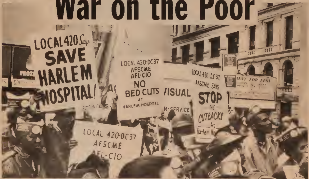
Hospital workers rally last September against massive budget cuts which will decimate half of city hospitals and wipe out up to 80,000 jobs in health care.

Proving that capitalist politics in America's largest city is the continuation of war by other means, Mayor Rudolph Giuliani's Valentine's Day budget massacre will slash a staggering $2.7 billion from the New York City budget next year. This comes on top of massive $2 billion cuts in welfare and Medicaid by New York's newly elected Republican governor George Pataki in Albany. Not since the Great Depression, when New York became a vast poorhouse for immi-