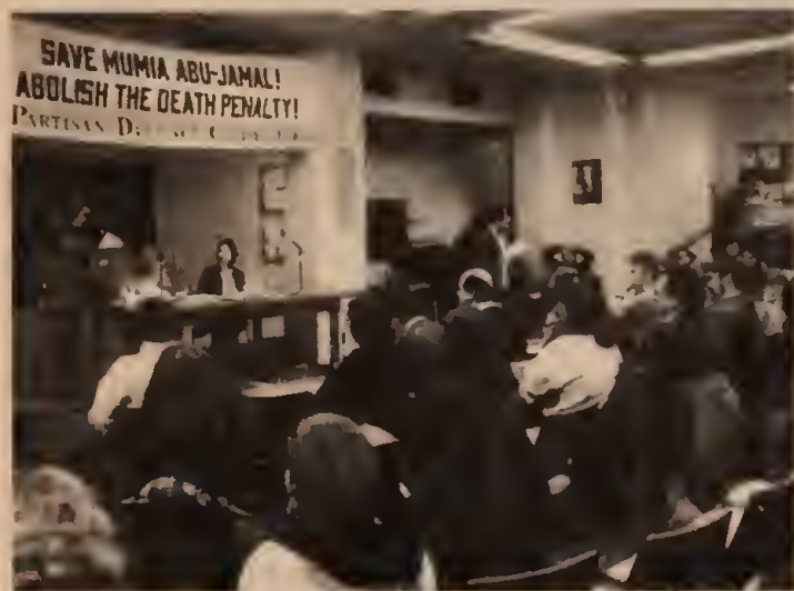
March 29 London rally drew over 120 trade unionists, students, leftists in fight to save the life of Mumia Abu-Jamal.