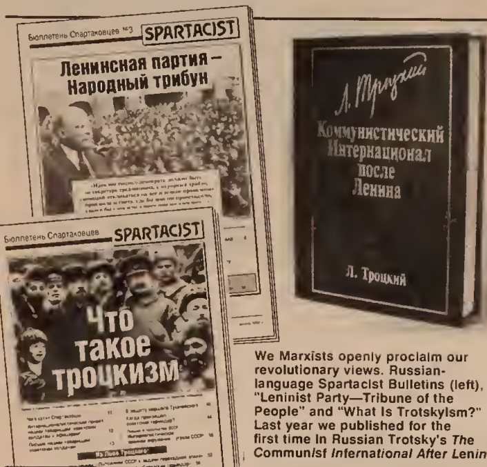
We Marxists openly proclaim our revolutionary views. Russian-language Spartacist Bulletins (left), "Leninist Party—Tribune of the People" and "What Is Trotskyism?" Last year we published for the first time in Russian Trotsky's The Communist International After Lenin .

What is behind the Vremya broadcast? And what is behind the intricate, time-consuming and unlawful attention which the security services both in Russia and in the Ukraine, undoubtedly in collusion,