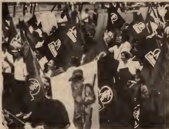
Mexico City: Situm university workers union contingent in January 12 march protesting government repression of peasant-based Zapatista rebels in Chiapas.

But most intrusive are the pervasive pregnancy checks. Women applying for jobs have to provide urine samples, and if they test positive they are not hired. During the three-month probationary period, it is standard practice for companies to demand that women produce bloody sanitary napkins to prove they