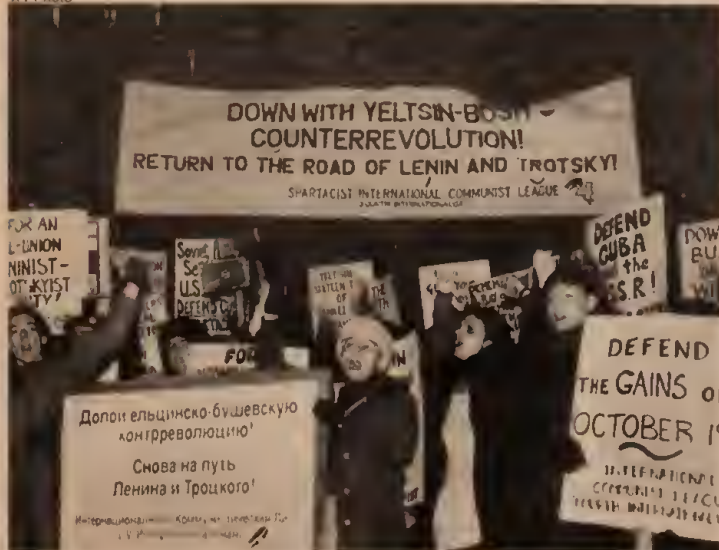
Spartacists Protest Against Yeltsin at Wall Street, 31 January 1992