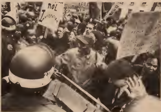
Mass arrests and ominous display of cop force against CUNY protesters at City Hall Park, March 23.

Thousands of New York City high school and college students rallied on Thursday to protest the draconian budget cuts which constitute a virtual death sentence for public education in this city. The First Amendment rights of the students to protest these cuts, which will relegate a whole generation of working-class and minority youth to second-class citizenship, were snatched by an ugly,