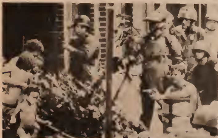
Racist Philly cops terrorize MOVE home in Powelton Village, August 1978, prelude to murderous 1985 firebombing which killed eleven.

Picketers have shut down every corner of SEPTA's City Transit Division. SEPTA and government officials, however, had long been planning for a strike, setting aside 4,000 free parking spaces at the South Philadelphia sports complex and adding extra trains and buses to the suburban lines which feed into the city. On April 2, TWUers at the Red Arrow bus line hit the bricks when their contract expired. But regional rail workers, whose contract expired last July, are running trains packed with commuters from the wealthy suburbs. On the second day of the strike, SEPTA tentatively settled with the conductors' union, UTU Local 61, whose members will vote on the proposed contract in mid-April. Meanwhile the Frontier Division bus workers' contract expires April 7.