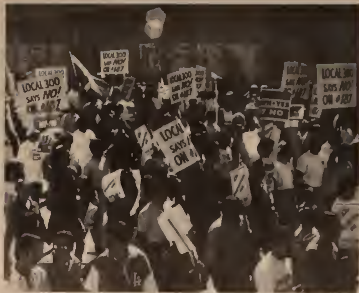
Construction worker contingent at 80,000-strong march in Los Angeles last October against racist anti-immigrant Prop. 187. Now the racists are pushing "Son of 187" referendum against affirmative action.

Demagogic appeals by racist politicians to "angry white men" capitalizing on the false perception that minorities and women have been given preferential advantage. From the outset, liberal affirmative action schemes were designed in such a way as to set whites against blacks and men against women in competition for a diminishing share of jobs, classroom seats and professional openings. After all, within the framework of the capitalist status quo, advancement