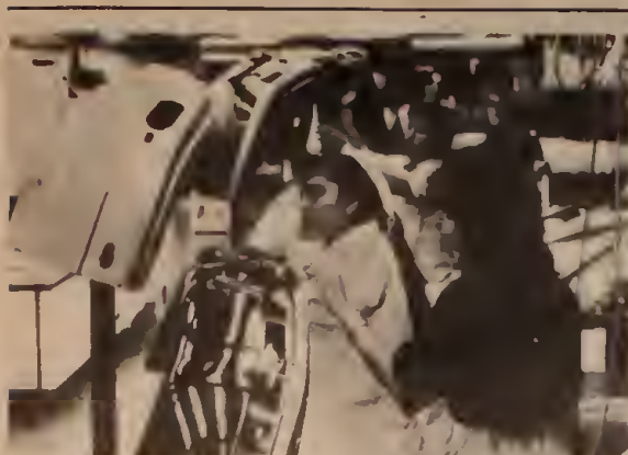
Superexploited workers at GM auto plant in Matamoros live in shantytowns.