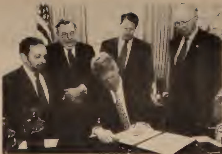
AFL-CIO top Lane Kirkland (second from left) presides over destruction of unions while begging Democrats. Here looking on as Clinton signs toothless "striker replacement" executive order.