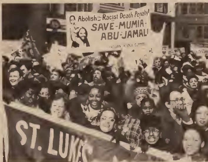
Partisan Defense Committee raises banner in defense of Mumia Abu-Jamal at NYC hospital workers rally, March 1.

The quarter-century since then has been marked by a vast burgeoning of the population behind bars, reinstitution of the death penalty and, lately, a determination by the American ruling class to get rid of a whole layer of the ghetto black population: behind the death penalty lies an impulse to genocide. Jamal writes of the "black march to death row" and notes how "at the heart of this country's death penalty scheme is the crucible of race."