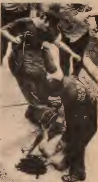
Philadelphia Daily News

During the '70s, Jamal worked as a radio journalist, winning a Peabody award and becoming known as the "voice of the voiceless" for his talk show on WUHY-FM, as well as broadcasts on NPR, Mutual Black Network and the National Black Network. He first ran into the MOVE organization in the mid-1970s. Angered and intrigued by even the black media's refusal to give the controversial and integrated MOVE group impartial coverage as it battled an