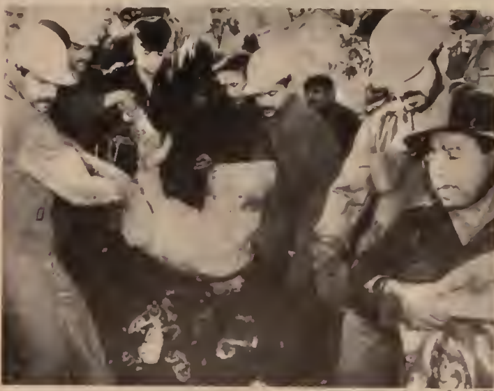
U.S. government terrorism: rescue workers in Baghdad, Iraq pull victims from the rubble of a residential neighborhood after Clinton ordered bombing in June 1993.

The most notorious example of this was the 1940 Smith Act, originally billed as a tool to fight Nazis on the eve of