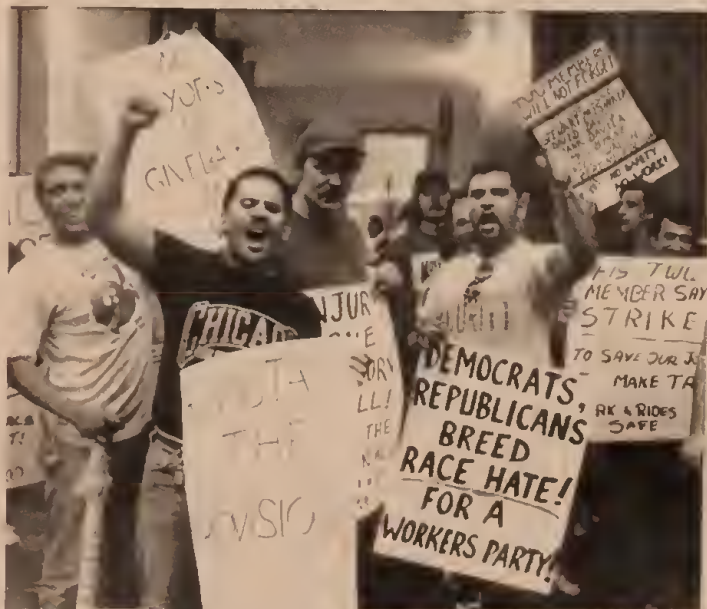
NYC transit workers demonstrate against layoffs. To fight for its interests, labor must break with the Democrats and forge a class-struggle workers party.