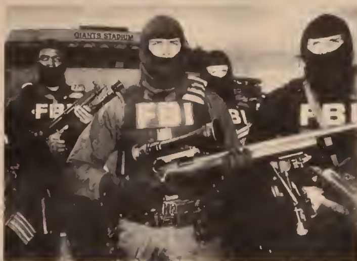
Government seizes on bombing of Oklahoma City federal building for "anti-terrorist" crackdown on civil liberties. Above: FBI SWAT team during 1994 World Cup soccer games.

From the "war on international terrorism," the government's line suddenly shifted to a war on "extremism." Behind this "anti-extremist" crusade is an accelerated drive by both capitalist parties to ram through a whole panoply of repressive measures. The Clinton administration immediately seized on this horrendous atrocity to place on the "fast track" an ominous "Omnibus Counterterrorism Act," as well as draconian new FBI "guidelines," Clinton's "package" is chock-full of provis-