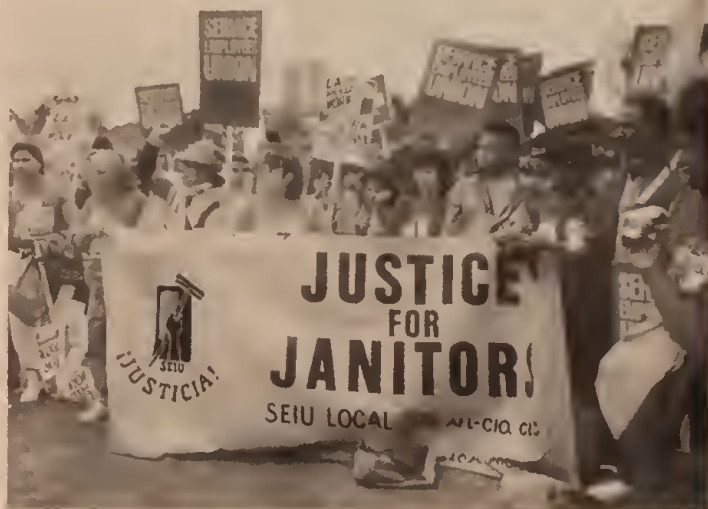
Demonstration by predominantly Latino L.A. janitors in 1990 defied racist cop mobilization. Labor must fight for full citizenship rights for all immigrants.

The Workers League carefully tailored its own program for a "labor party" to suit the reactionary labor bureaucracy it tailed, not even mentioning opposition