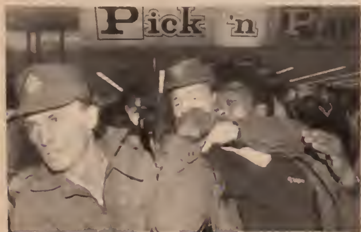
ANC-led government called out racist police against striking workers last year at Pick 'n Pay supermarket chain, whose owner was a major contributor to the ANC.

The African National Congress, however, is not a reformist workers party. It was a petty-bourgeois nationalist movement claiming to represent all classes of the nonwhite oppressed. When such movements (e.g., the Algerian National Liberation Front) acquire political power,