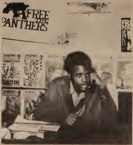
Mumia Abu-Jamal in 1969 when he was Minister of Information for Philadelphia Black Panther Party.

While focusing particularly on the death penalty, Mumia covers a wide range of topics with the penetrating succinctness of a five-minute radio com-