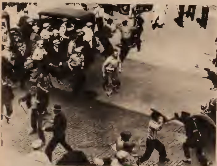
Militant Minneapolis strikers, led by Trotskyists, routed scabs and strikebreaking thugs in May 1934 "Battle of Deputies Run." Victorious truckers strike laid the basis for explosive growth of Teamsters and paved the way for rise of CIO industrial unions.

Geoghegan wrongly claims that the mass unionization drive which created the Congress of Industrial Organizations