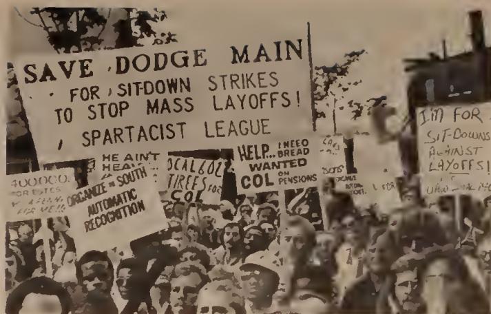
Spartacists fought for militant strike action against 1979 mass layoffs in auto that led to devastation of labor/black Detroit.

The Spartacist League has fought to implement this program with the call for labor/black mobilizations against the Klan and Nazis, whose fascist violence targets the integrated unions. In January 1994, the labor/black mobilization to stop the Klan in Springfield, Illinois tapped the deep concerns of white, black and Hispanic workers in labor's Midwest "war zone" of strikes and lockouts; pro-capitalist AFL-CIO leaders, however, stridently opposed it as a threat to