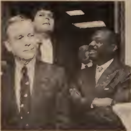
SF Democratic mayoral candidate and former state assembly speaker Willie Brown hobnobbing with racist Republican governor Wilson.

SAN FRANCISCO—For the past four years Democratic mayor Frank Jordan has made it his mission to drive the "undesirables" out of town or at least out of sight. Though nobody much likes him, the ex-police chief has garnered support from the white racist vote and downtown big money for his efforts to "clean up the streets" by persecuting the city's 10,000 or more homeless people and unleashing the police on black neighborhoods and demonstrators. Now he is being challenged for mayor by black Democratic Party power broker Willie Brown, former speaker of the California state assembly. But Brown's entire campaign is centered on trying to outdo the ex-cop mayor in being "tough on crime"—a code word for cracking down on the poor, and