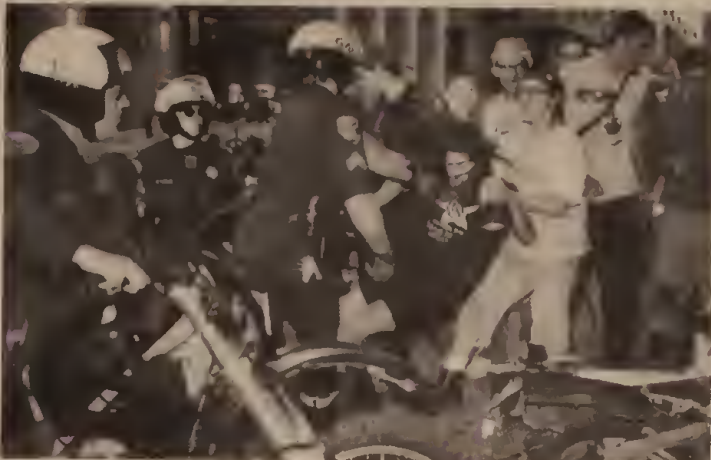
SF cops assault "Food Not Bombs" protesters as part of Mayor Frank Jordan's racist campaign to drive the homeless off the streets and out of the parks.

After the Hankston killing, the Ingleside neighborhood erupted in two nights of angry protest, met with brutal police mobilizations. City officials and black