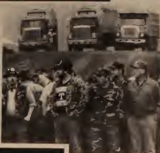
in 1989 Pittston miners strike, mass pickets stopped scab coal outside Moss No. 3 plant.