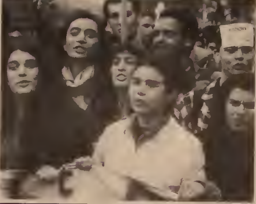
Militant struggles by workers and students have rocked France. Above: Air France strikers blocked runways in Paris, October 1993, backing down government, bosses and cops. Left: Thousands of students demonstrated in the capital, March 1994, against sub-minimum wage for youth.

damentalist living in Stockholm—until Swedish police supplied evidence of his innocence. Now Paris is demanding the extradition of a fundamentalist living in London, accusing him of responsibility.