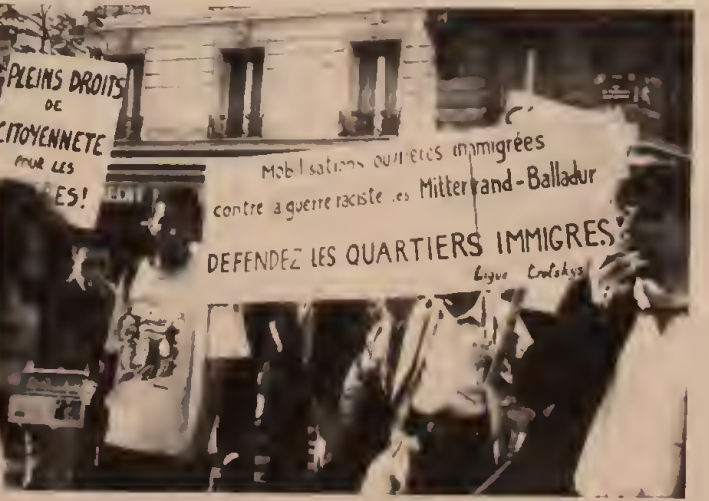
Ligue Trotskyste calls for worker/immigrant mobilizations in May 1993 Paris protest against government's racist roundups and cop terror.

There is certainly no lack of desire among wide sectors of the workers and youth to put a stop to the racist terror. During the election campaign last spring, there were ethnically integrated demonstrations against racist murders carried out by the fascists. There were also repeated demonstrations seeking to stop Le Pen from spewing forth his message of racial hatred. A scandalous call last month by the unions for workplace rallies "against terrorism" flopped. As the