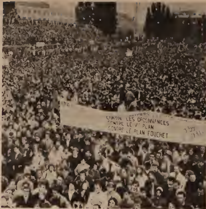
Workers and students filled stadium in Paris for mass protest during May 1968 general strike. Social democrats and Stalinists sabotaged revolutionary opportunity, channeling working-class discontent into support for parliamentary popular front.

The bourgeoisie is presently keeping the fascists in reserve, without a popular front in place to absorb the shock of a working-class explosion. Yet there is a considerable portion of the population which would eagerly respond to a drive to do away with these vermin. During the period leading up to last spring's presidential election, fascist goons went on a rampage, brutally murdering three people of African or North African origin. Such outrages give the lie to those