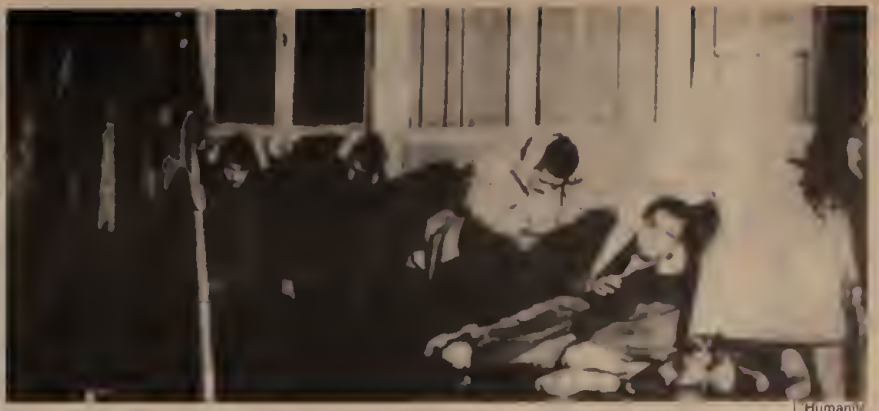
France's bloody colonial war in Algeria. Left: François Mitterrand, then "justice" minister, here visiting French troops, oversaw brutal repression of independence fighters. Right: Algerian protesters in Paris terrorized by police, as cops massacred hundreds on 17 October 1961.