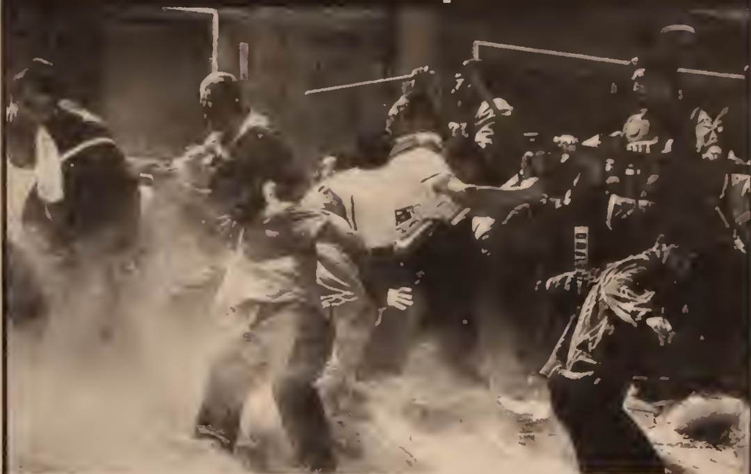
Israeli troops attack Palestinian protesters in West Bank. Fascistic settlers act as auxiliary to Zionist state terror in Occupied Territories.

nation, it has echoed many of the same themes as the fascist right and Kach banners have been prominent at Likud rallies against the PLO accord. Much of the Orthodox rabbinical hierarchy, right up to the top echelons, has likewise railed against even the most token concessions to the Palestinians, calling on soldiers to defy government orders to evacuate even a single settler from the Occupied Territories. As a soldier, Amir was in the notoriously anti-Arab Golan Brigade, whose units police the Israeli-occupied "security zone" in southern Lebanon and terrorize Arab Hebron.