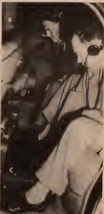
U.S. Army Intelligence and Security Command U.S. Army spies conducting radio surveillance to snoop on private conversations, 1968.