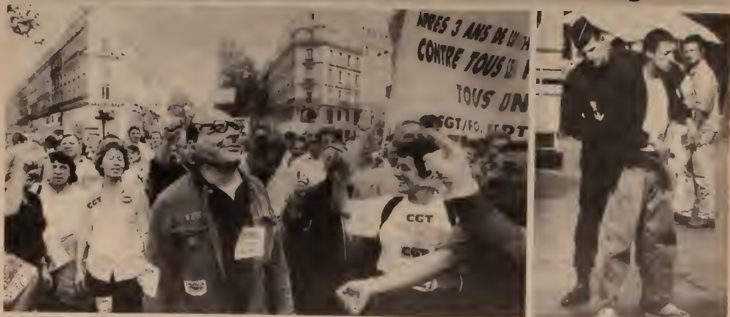
Workers shut down Paris, October 10, in protest against threatened wage freeze. Right: Cops and troops target North Africans for racist identity checks.