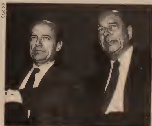
Gaullists back in power, and on the hot seat: Prime Minister Alain Juppé, President Jacques Chirac.

Chirac rode into office by cynically exploiting the universal loathing of the French population for the Mitterrand regime. He spouted the same kind of demagogic populism that got Mitterrand