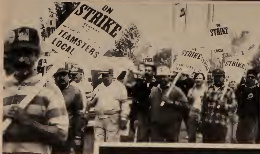
Teamsters in Southern California protest cop attack on picket line during 1994 strike.