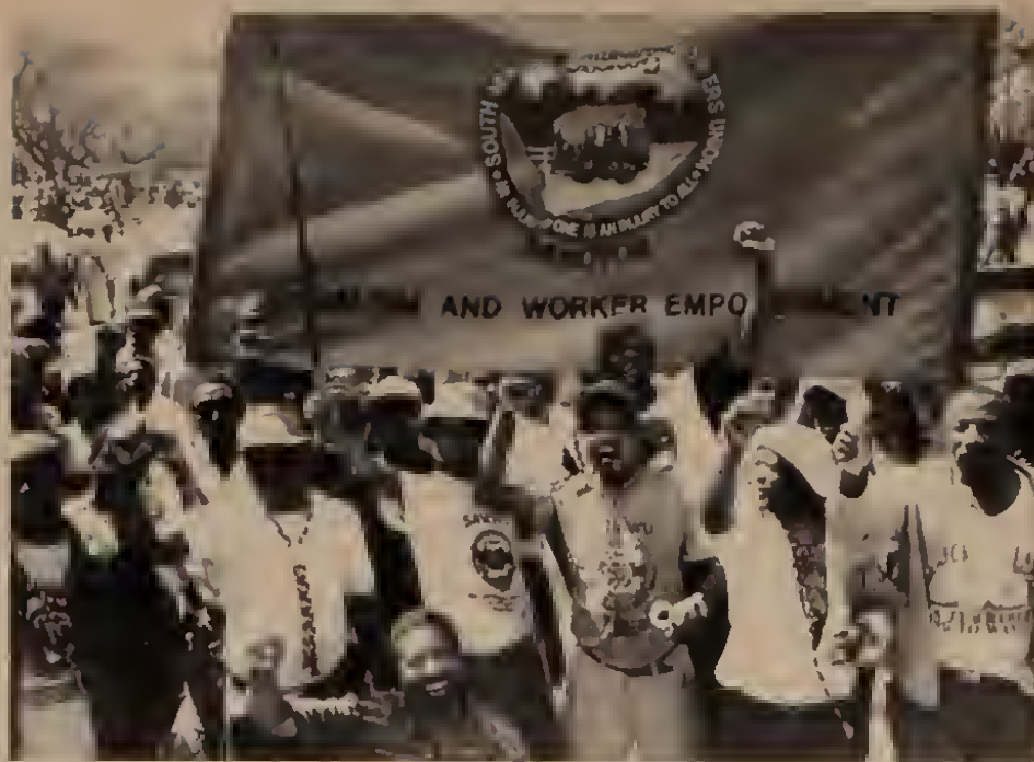
Striking municipal workers in Johannesburg, September 1995. Combative black proletariat of South Africa needs a Bolshevik party.