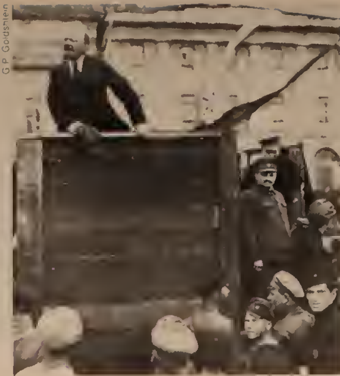
Lenin, addressing Red Army troops, with Trotsky (right of podium), 1920. We fight for a new October Revolution.

in defense of the Soviet monument at our initiative, which was of course overtaken by the Stalinist SED, then the ruling party of the DDR. But our party speakers addressed 250,000 people in what was the first Trotskyist speech ever at a mass rally in a deformed workers state since Trotsky's Left Opposition was crushed.