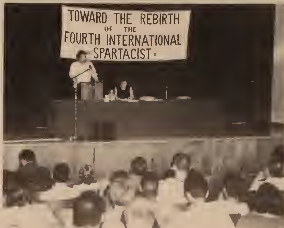
Spartacist League forum in New York City, August 1.

"after" picture which exposes the utter hypocrisy of the imperialists, look at West Berlin before the collapse of the Berlin Wall and what exists now. West Berlin was maintained—at great cost—as a showcase, a chimera, a fraud to lure workers from the East. Well, the wall is down, the DDR (East German) deformed workers state is gone, and life in west Berlin is deteriorating for the workers because the capitalist rulers perceive no opposition to their unbridled greed.