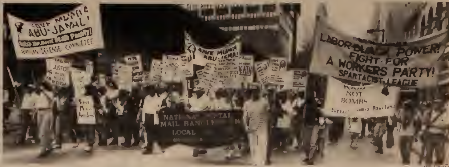
Labor must be mobilized in defense of all the oppressed: trade unionists march in August 1995 Philadelphia demonstration for death row political prisoner Mumia Abu-Jamal.

When the AFL-CIO sent recruiters to our campus, they showed Salt of the Earth (a movie about striking miners in New Mexico) and then after that there was a short question-and-answer session and applications were handed out. I was excited because the organizer who spoke to us was young and Latina. She defied the stereotype of the union organizer, you know, wearing the Democrats' T-shirt or a cap that says "Made in America." She mentioned that her favorite book was [Frantz Fanon's] The Wretched of the Earth . She completely related to our frustrations as college students of only learning theory and not being able to apply any of it.