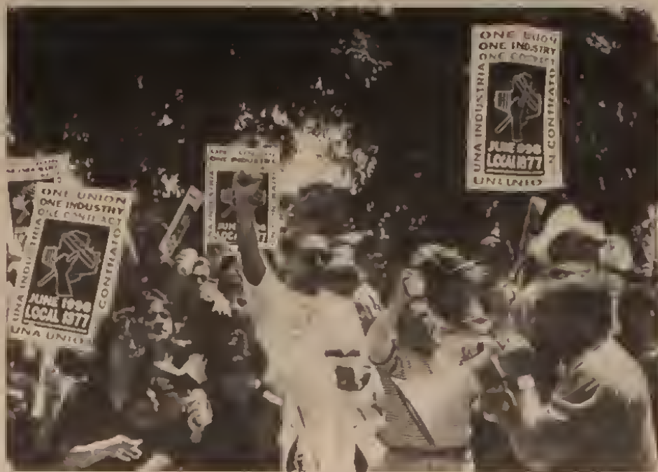
Bay Area janitors' rally in May. Union Summer activists were told to hand out "go back to work" leaflets to workers honoring janitors' picket lines.

YSp: In this election year, given that the labor leadership is trying to mobilize votes for the Democratic Party, you can imagine that it would be a big problem for them to have that kind of confrontation with the capitalists and the Democratic mayors and politicians. As Marxists, we see that both the Democrats and the Republicans are capitalist parties. The welfare bill, which is a direct attack on blacks, immigrants and the unionized workforce, was passed with bipartisan support and signed into law by Clinton. A woman in Boston told us she was disappointed that her assignment was to sign up people to vote. Did any people from your group do voter registration?