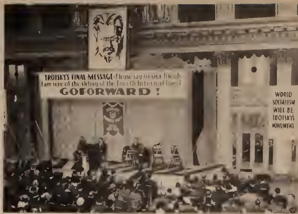
New York memorial meeting, August 1940, for Leon Trotsky, murdered by Stalinist assassin.