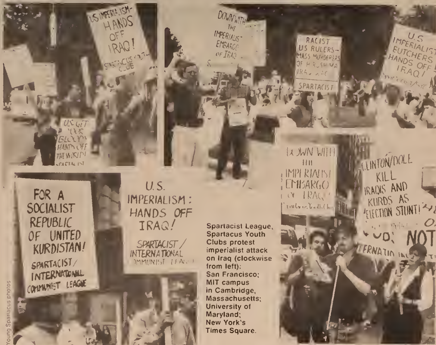
Spartacist League, Spartacus Youth Clubs protest imperialist attack on Iraq (clockwise from left): San Francisco; MIT campus in Cambridge, Massachusetts; University of Maryland; New York's Times Square.

Our international protests were not cheap-talk "anti-Americanism" but true examples of Leninist internationalism. Many sections of the ICL outside the U.S. issued their own leaflets, which in addition to condemning the U.S. assault on Iraq took aim at their own ruling classes and the reformist misleaders who tie the oppressed to their exploiters. Our comrades of the Ligne Trotskyiste de France (LTF) carried placards protesting the bombing at a demonstration in Paris in defense of African refugees fighting