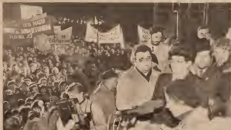
Spartakists initiated 250,000-strong protest against fascist desecration of Red Army memorial in East Berlin's Treptow Park, January 1990. Poster for March 1990 election reads: "No to Capitalist Reunification! For a Germany of Workers Councils!"

Bourgeois ideologues today exalt the capitalist "free market," private prop-