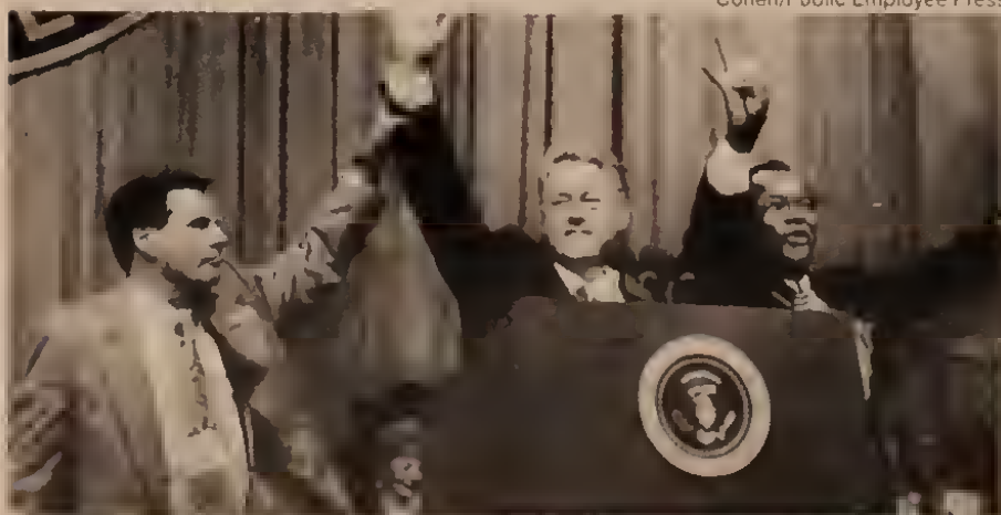
Capitalist chief Clinton at AFSCME convention in June. Labor tops tie workers to racist Democrats, push chauvinist protectionist poison.