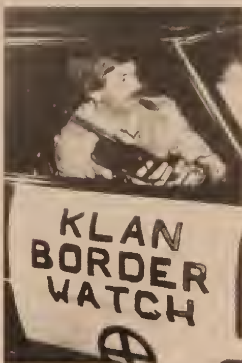
Left: Fascist Duke organized anti-immigrant vigilantes on Mexican border. Right: 1,500-strong protest initiated by Partisan Defense Committee against Duke race-hate provocation in Boston, March 1991.

Many opponents of Klan terror look to the government and cops to protect us from the fascists. But the capitalist state exists to protect private property and those who own it, not to protect the intended victims of the KKK. Laws against the fascists are used primarily against the left. Chicago cops arrested nine anti-Klan demonstrators in Chicago while forming a barricade to protect the racists, and