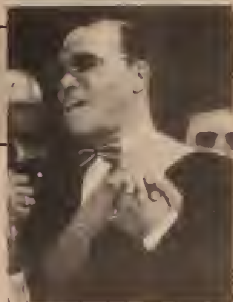
NOI leader Farrakhan at award ceremony in Tripoli, Libya.

The reporters were introduced to an Arab slave trader in the village of Manyel in the southern province of Bahr el Ghazal, who specialized in returning slaves from the predominantly Arab north