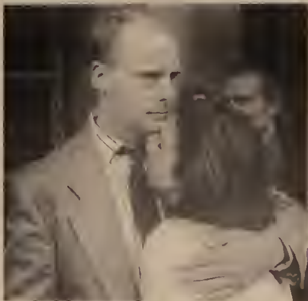
Maggiora SF Chronicle