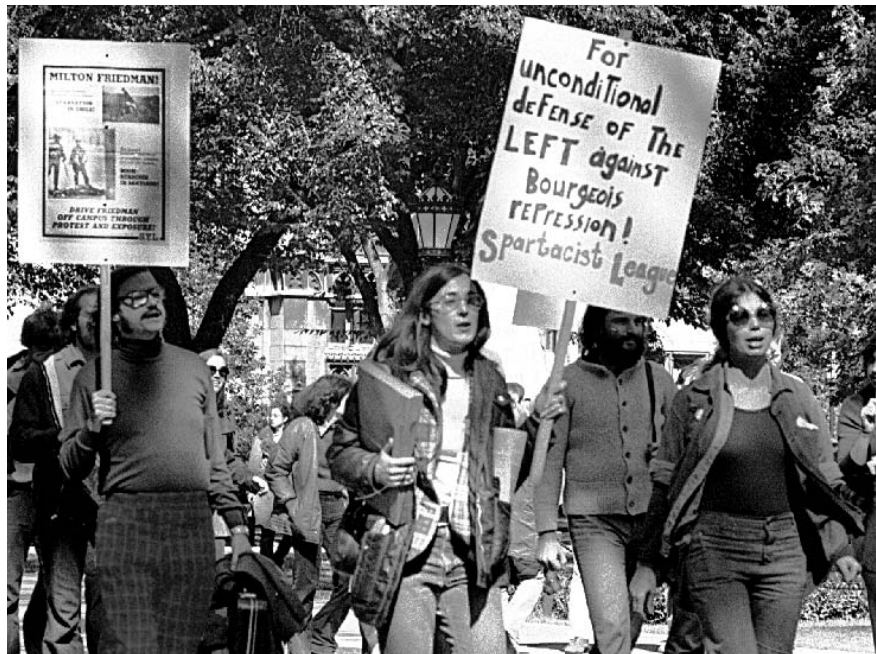
Spartacus Youth League initiated campaign at University of Chicago to drive Milton Friedman, economic braintruster for murderous Chilean junta, off campus through protest and exposure, October 1975.