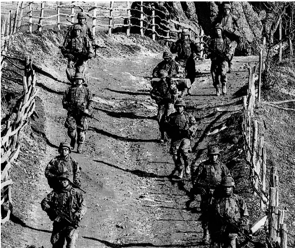
U.S. occupation forces patrol border between Kosovo and Macedonia. Albanian separatists, pawns of 1999 U.S./NATO war of domination against Serbia, are now deemed "extremists."

While opportunist leftists tailed behind their respective capitalist governments in beating the war drums for "poor little Kosovo" two years ago, the International