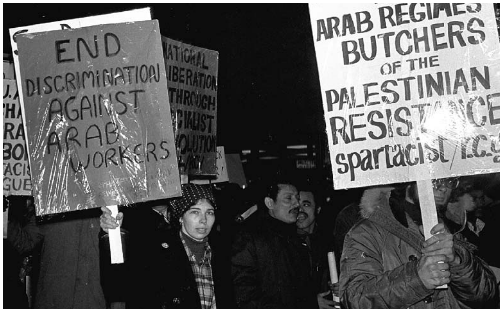
Detroit, November 1973: Spartacist contingent joins demonstration of Arab auto workers who staged one-day strike protesting UAW tops' purchase of Israeli war bonds.