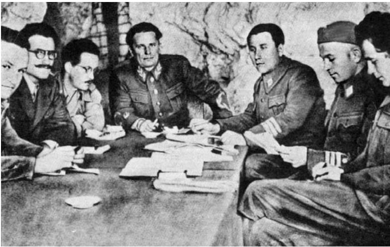
Harcourt Brace Jovanovich

followed suit, invigorated by the fact that the social-democratic parties they supported were now in power in much of West Europe. They raised a clamor for “independence for Kosovo” and championed the UCK, which boasted of spotting targets for NATO bombing sorties. In a statement distributed at a 30 March 1999 public meeting in London, WP claimed to “support the Serbian forces’ self-defence against NATO attack” but “not in Kosova which they have no right to occupy”—i.e., not on the principal battlefield. Tailing behind Blair’s Labour Party, which was the most belligerent government in the war against Serbia, WP was in fact one of the most vociferous promoters of NATO’s UCK puppets, marching alongside NATO flags in a “Workers Aid for Kosova” demonstration