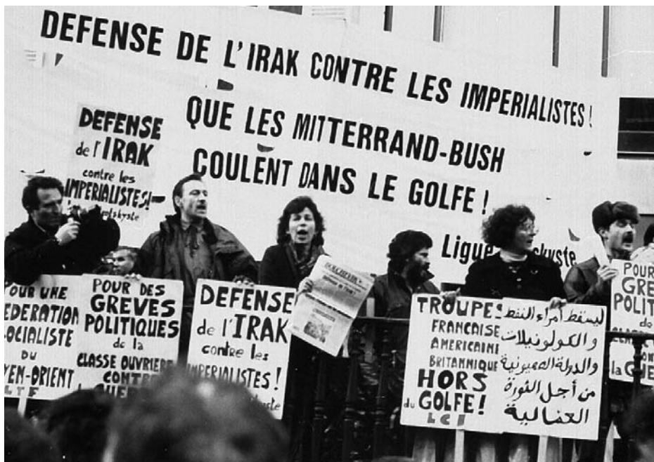
LTF banner at Paris protest against 1991 Persian Gulf War reads, "Defend Iraq Against the Imperialists! Sink Mitterrand/Bush in the Gulf!"

The LTF put out a supplement: "Reagan and Mitterrand: Anti-Soviet Warmongers." To prepare the contin-