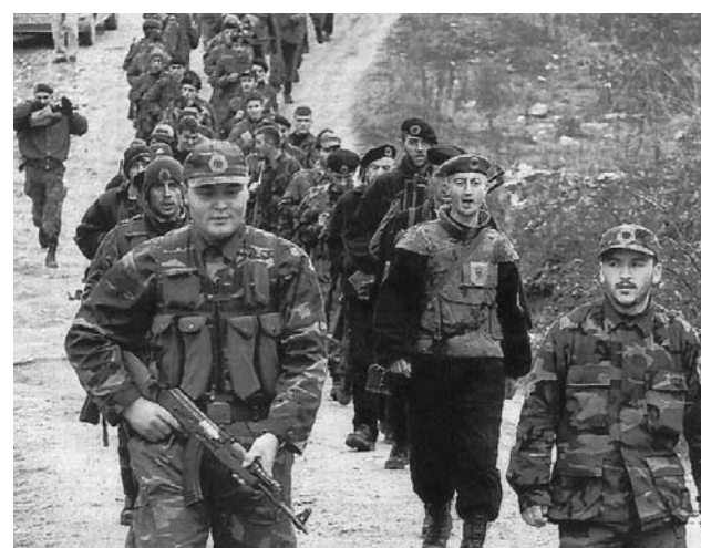
Balkan cauldron boiling: Macedonian police fire on Albanian separatist positions outside Tetovo (above). Albanian commandos on the march along Serbian border.